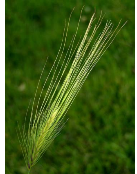
Taeniatherum caput-medusae Medusa-head Rye Introduced Annual Poaceae