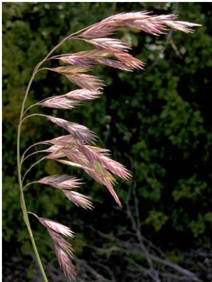
Bromus catharticus Rescue Brome Introduced Annual-Perennial Poaceae