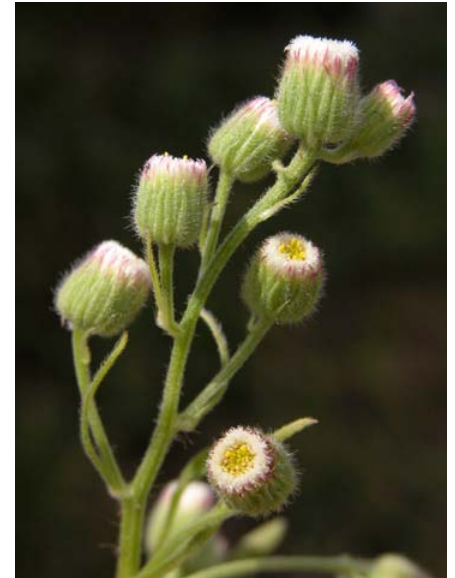
Conyza bonariensis South American Horseweed Introduced Annual Asteraceae