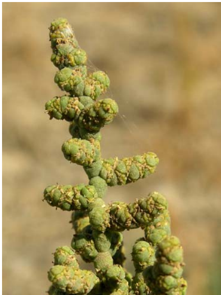
Allenrolfea occidentalis Iodine Bush Native Perennial Chenopodiaceae