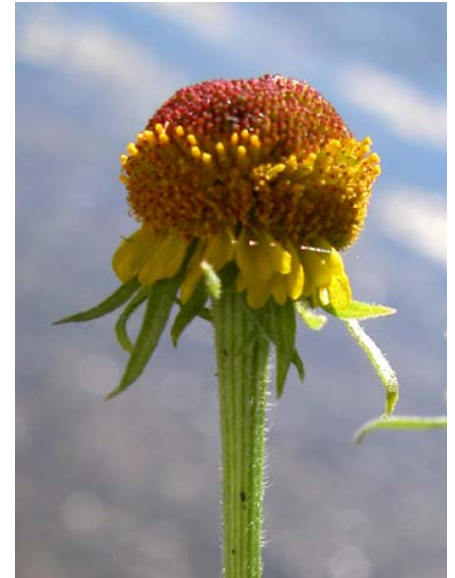
Helenium puberulum Rosilla Native Biennial Asteraceae