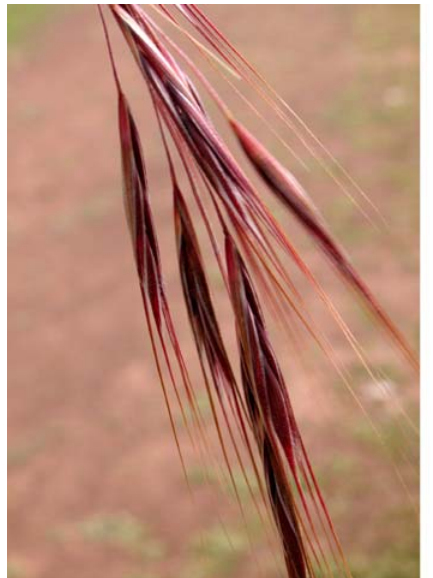
Bromus diandrus Ripgut Brome Introduced Annual Poaceae