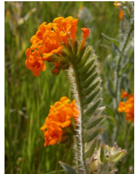
Amsinckia grandiflora Largeflower Fiddleneck Native Annual Boraginaceae