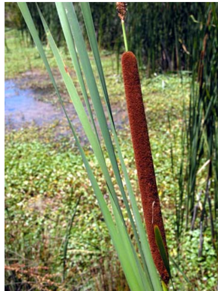
Typha angustifolia Narrow-leaf Cattail Native Perennial Typhaceae