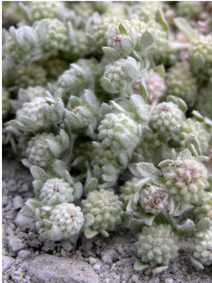
Psilocarphus tenellus var. tenellus Slender Woolly Heads Native Annual Asteraceae