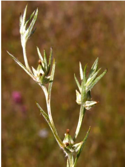
Filago gallica Fluffweed Introduced Annual Asteraceae