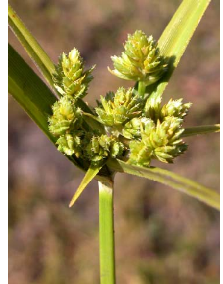
Cyperus eragrostis Tall Nutsedge Native Perennial Cyperaceae