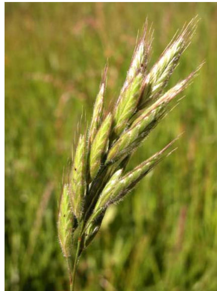
Bromus hordeaceus Soft Brome Introduced Annual Poaceae