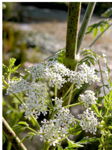
Conium maculatum Poison Hemlock Introduced Biennial Apiaceae