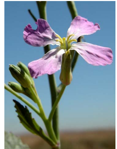
Raphanus sativus Wild Radish Introduced Annual Brassicaceae