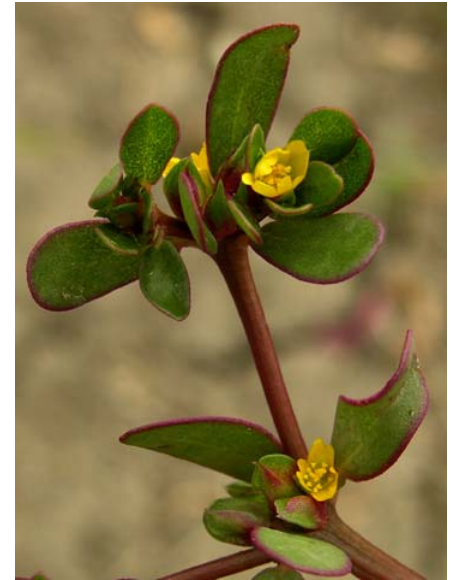
Portulaca oleracea Common Purslane Introduced Perennial Portulacaceae