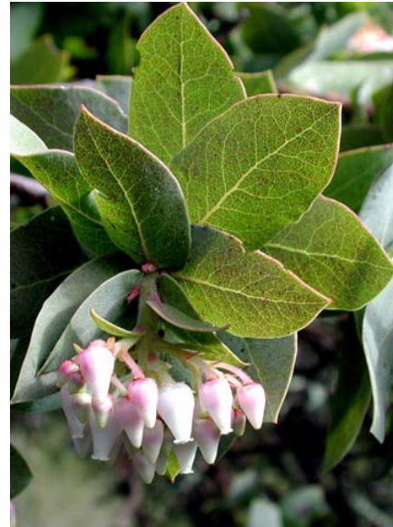
Arctostaphylos pallida Pallid Manzanita Native Perennial Ericaceae