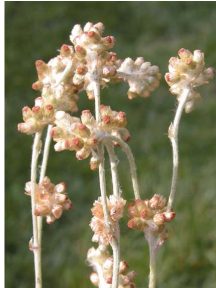
Gnaphalium luteo-album Weedy Cudweed Introduced Annual Asteraceae