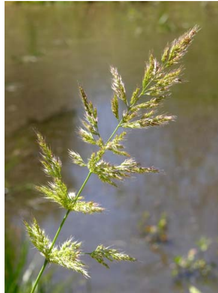
Polypogon interruptus Ditch Beard Grass Introduced Perennial Poaceae