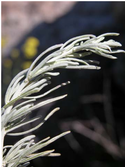
Artemisia californica California Sagebrush Native Perennial Asteraceae