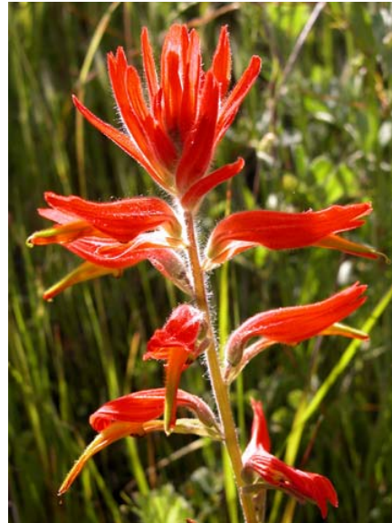
Castilleja affinis ssp. affinis Common Indian Paintbrush Native Perennial Scrophulariaceae