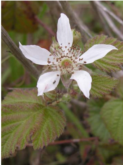
Rubus ursinus Native California Blackberry Native Perennial Rosaceae