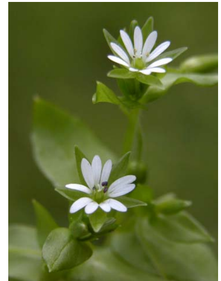
Stellaria media Common Chickweed Introduced Annual Caryophyllaceae