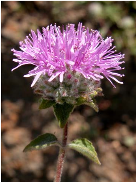
Monardella villosa ssp. villosa Common Coyotemint Native Perennial Lamiaceae