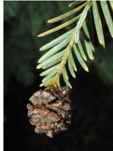
Sequoia sempervirens Coast Redwood Native Perennial Taxodiaceae