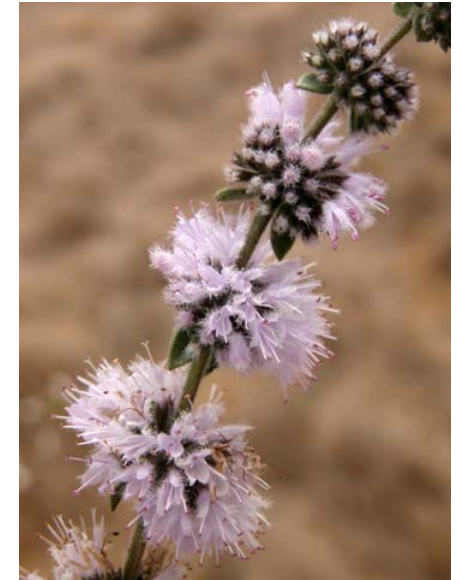
Mentha pulegium Pennyroyal Introduced Perennial Lamiaceae