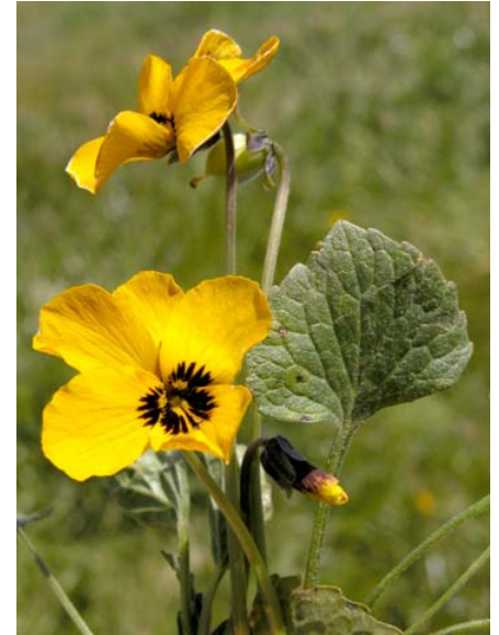
Viola pedunculata Johnny-Jump-Up / Wild Pansy Native Perennial Violaceae