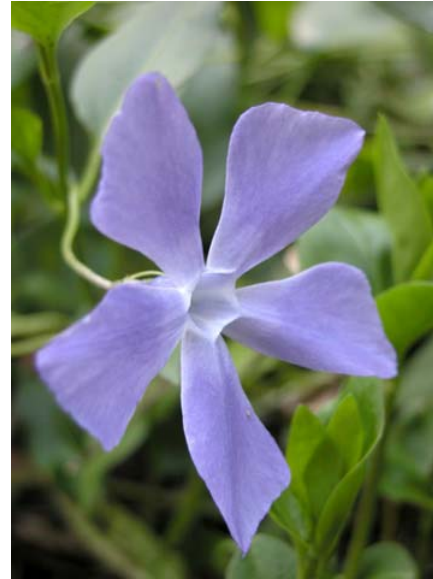
Vinca major Greater Periwinkle Introduced Perennial Apocynaceae