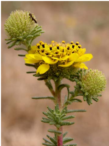
Holocarpha macradenia Santa Cruz Tarplant Native Annual Asteraceae