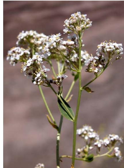
Lepidium latifolium Slender Peren. Peppergrass Introduced Perennial Brassicaceae