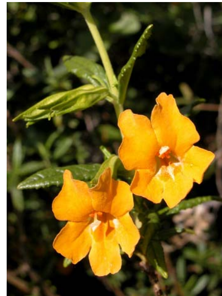
Mimulus aurantiacus Bush Monkey Flower Native Perennial Scrophulariaceae