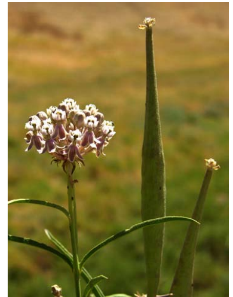
Asclepias fascicularis Whorled/Narrow-leaf Milkweed Native Perennial Asclepiadaceae