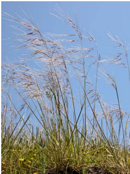
Nassella pulchra Purple Needle Grass Native Perennial Poaceae