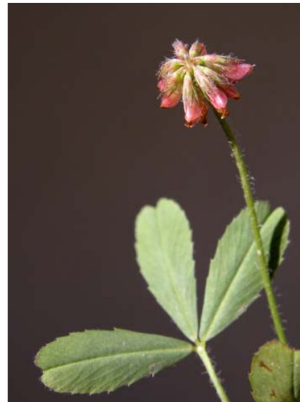
Trifolium ciliolatum Tree Clover Native Annual Fabaceae