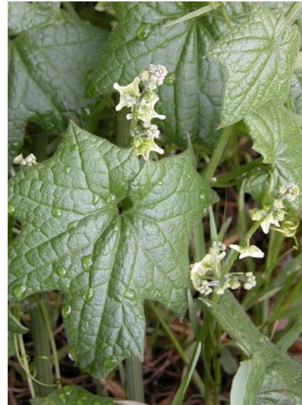
Marah fabaceus Common / California Manroot Native Perennial Cucurbitaceae