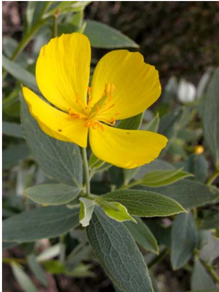
Dendromecon rigida Bush Poppy Native Perennial Papaveraceae