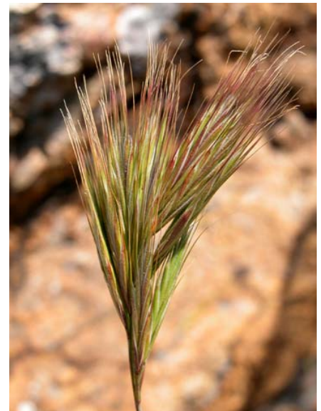
Bromus madritensis ssp. rubens Red Foxtail Brome Introduced Annual Poaceae