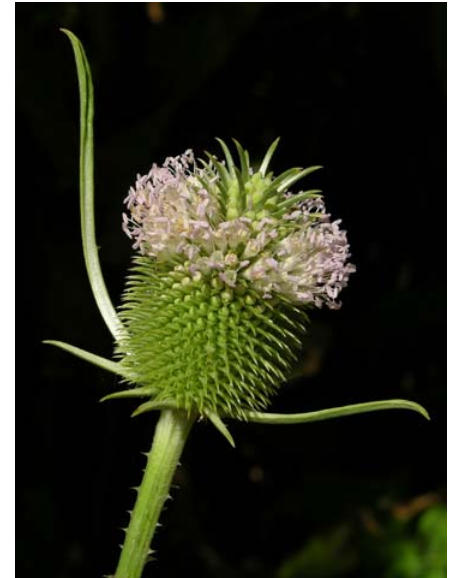
Dipsacus sativus Wild Teasel Introduced Biennial Dipsacaceae