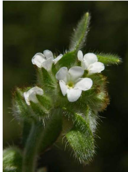
Plagiobothrys canescens Valley Popcorn Flower Native Annual Boraginaceae