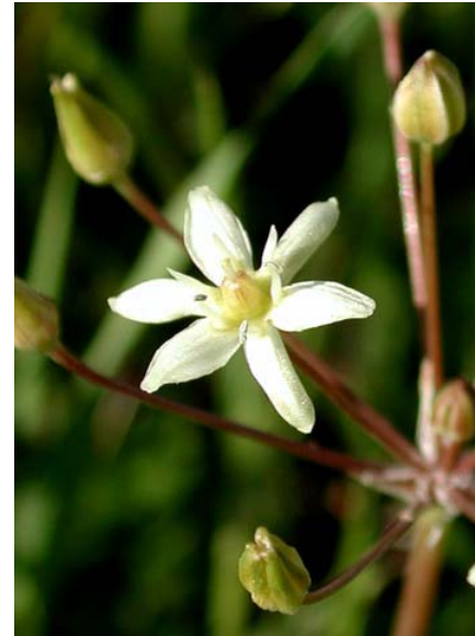
Muilla maritima Common Muilla Native Perennial Liliaceae