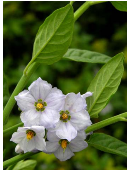
Solanum umbelliferum Blue Witch Native Perennial Solanaceae