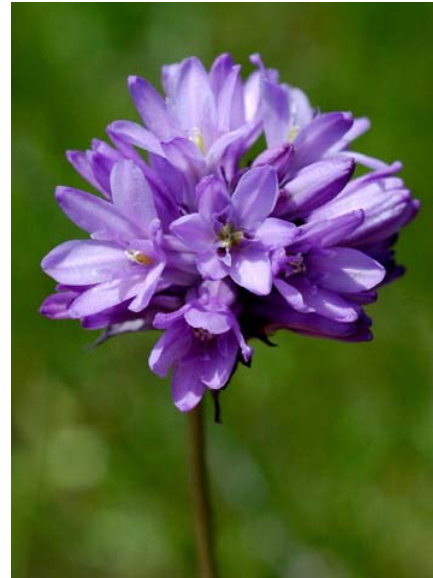
Dichelostemma congestum Ookow Native Perennial Liliaceae