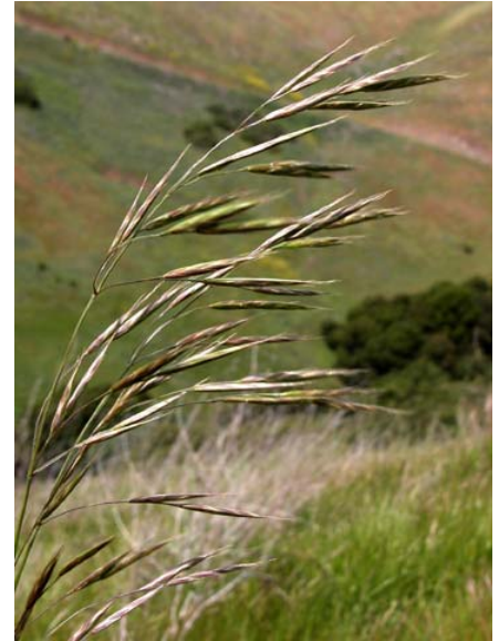
Bromus carinatus var. carinatus California Brome Native Perennial Poaceae