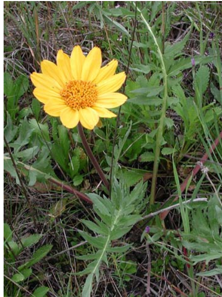
Balsamorhiza macrolepis var. macrolepis Bigscale Balsamroot Native Perennial Asteraceae