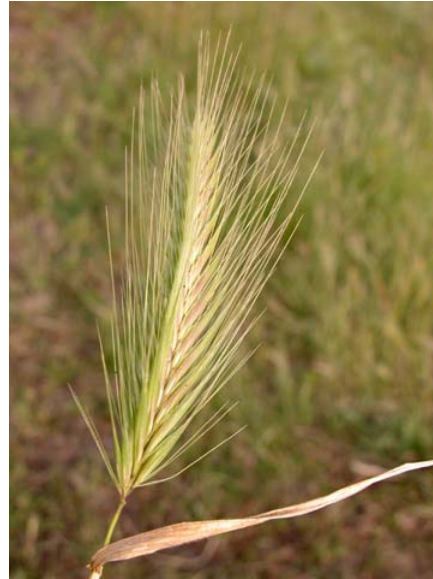
Hordeum murinum ssp. leporinum Hare Barley Introduced Annual Poaceae