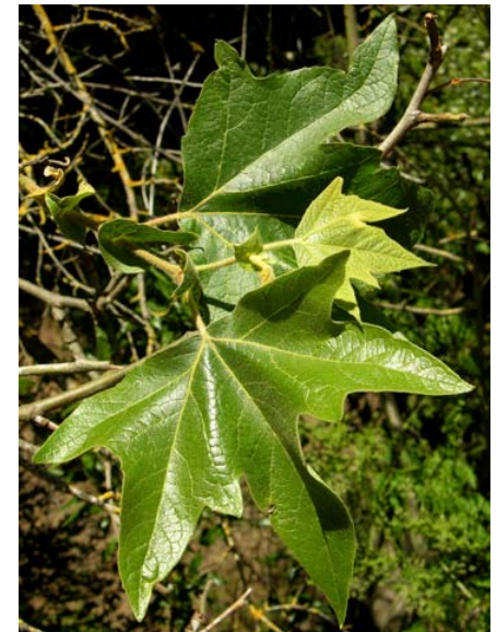
Platanus racemosa Western Sycamore Native Perennial Platanaceae