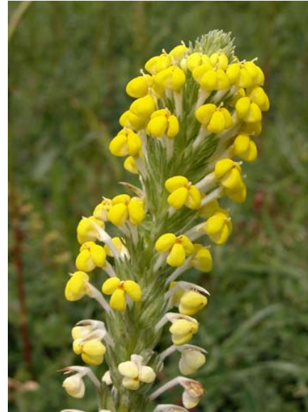
Triphysaria eriantha ssp. eriantha Yellow Johnny-tuck Native Annual Scrophulariaceae