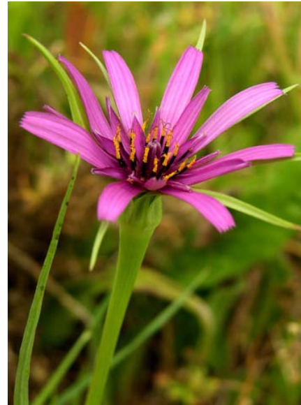
Tragopogon porrifolius Purple Salsify Introduced Biennial-Perennial Asteraceae