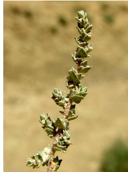
Atriplex depressa Brittle Scale Native Annual Chenopodiaceae