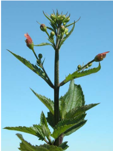
Scrophularia californica ssp. californica California Figwort Native Perennial Scrophulariaceae