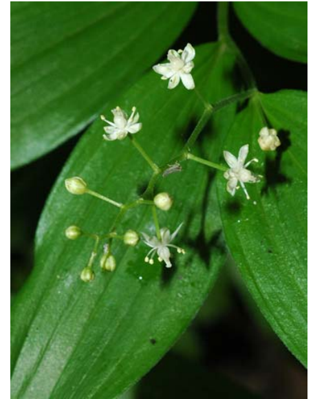
Smilacina stellata Starry False Solomon's Seal Native Perennial Liliaceae