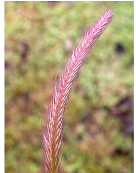
Hordeum brachyantherum ssp. californicum California Barley Native Perennial Poaceae