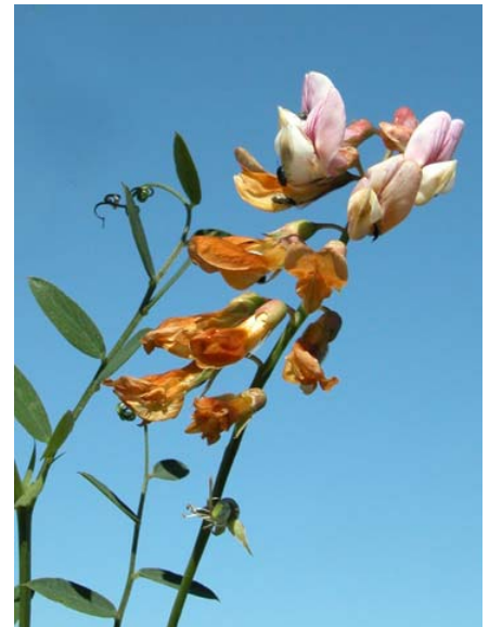
Lathyrus vestitus var. vestitus Pale Purple Pacific Pea Native Perennial Fabaceae