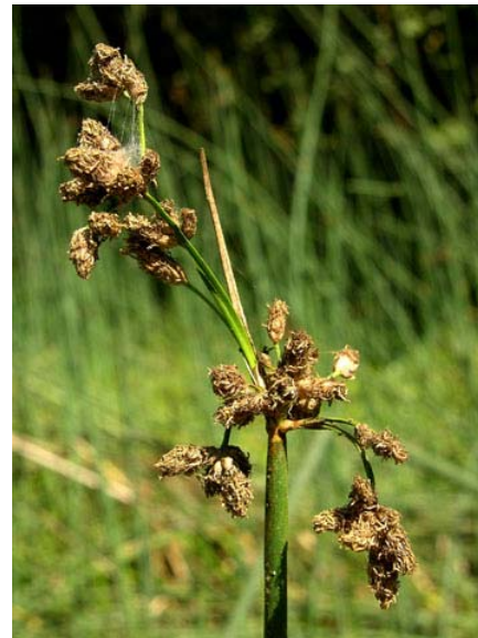
Scirpus acutus var. occidentalis Hardstem Bulrush Native Perennial Cyperaceae