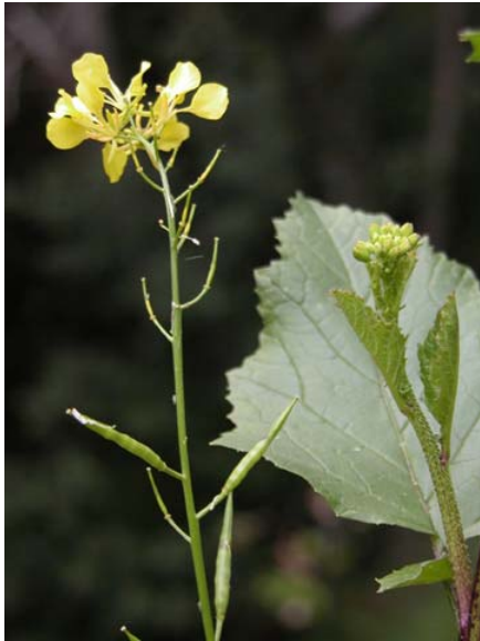
Sinapis arvensis Yellow Charlock Introduced Annual Brassicaceae