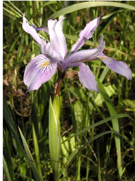
Iris douglasiana Douglas Iris Native Perennial Iridaceae