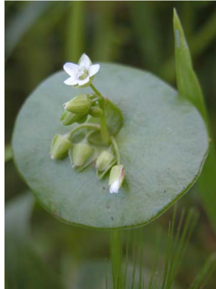
Claytonia perfoliata ssp. perfoliata Common Miner's Lettuce Native Annual Portulacaceae