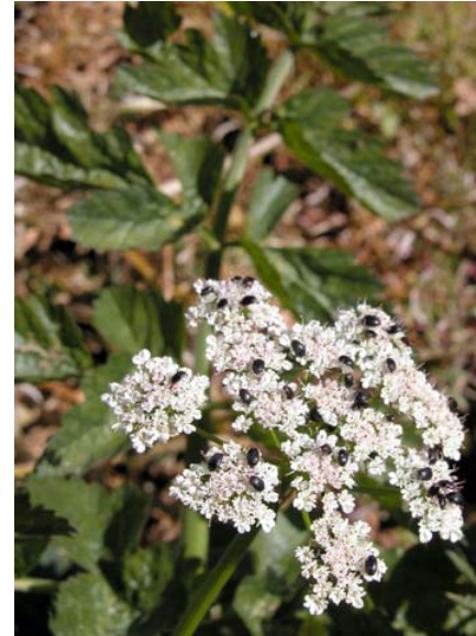
Oenanthe sarmentosa Pacific Water Parsley Native Perennial Apiaceae