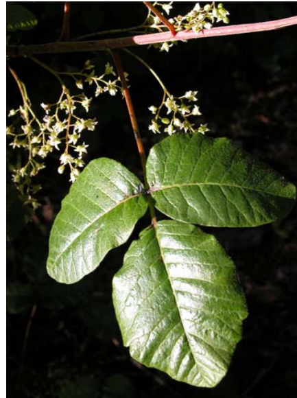
Toxicodendron diversilobum Poison Oak Native Perennial Anacardiaceae