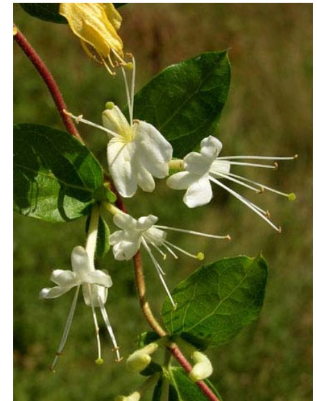
Lonicera japonica Japanese Honeysuckle Introduced Perennial Caprifoliaceae