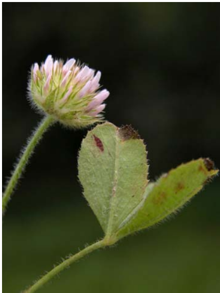
Trifolium microcephalum Small-head Clover Native Annual Fabaceae