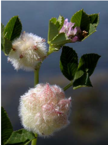
Trifolium fragiferum Strawberry Clover Introduced Perennial Fabaceae