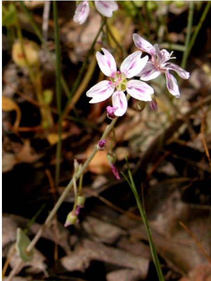
Claytonia exigua ssp. exigua Common Pale Claytonia Native Annual Portulacaceae