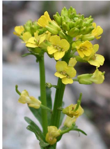
Barbarea orthoceras Erect-pod Winter Cress Native Perennial Brassicaceae