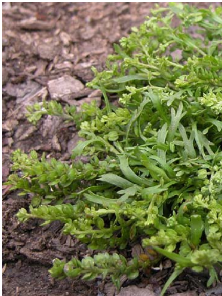
Lepidium strictum Prostrate Peppergrass Introduced Annual Brassicaceae