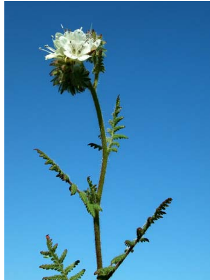
Phacelia distans Wild Heliotrope Phacelia Native Annual Hydrophyllaceae