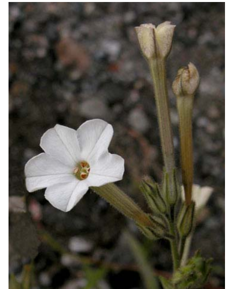
Nicotiana acuminata var. multiflora Many-flower Tobacco Introduced Annual Solanaceae