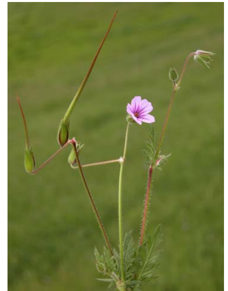
Erodium botrys Long-beaked Filaree Introduced Annual Geraniaceae