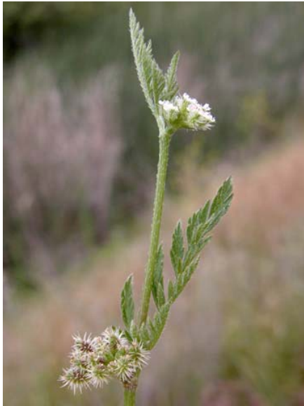
Torilis nodosa Knotted Hedge Parsley Introduced Annual Apiaceae