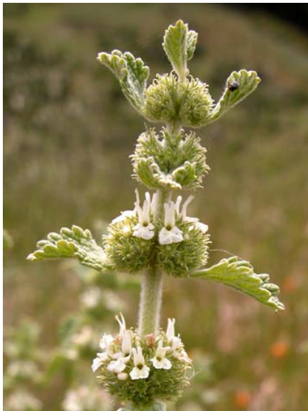
Marrubium vulgare Common Horehound Introduced Perennial Lamiaceae