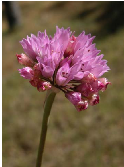
Allium serra Pink / Serrated Onion Native Perennial Liliaceae