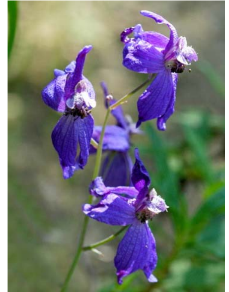
Delphinium variegatum ssp. variegatum Royal Larkspur Native Perennial Ranunculaceae