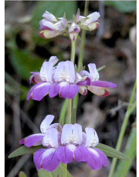
Collinsia heterophylla Chinese Houses Native Annual Scrophulariaceae