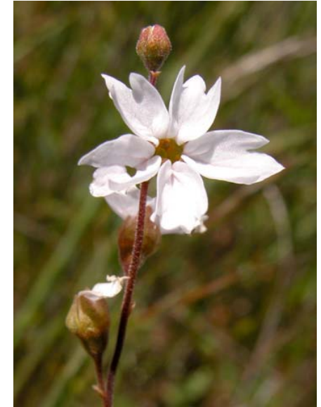
Lithophragma affine Woodland Star Native Perennial Saxifragaceae