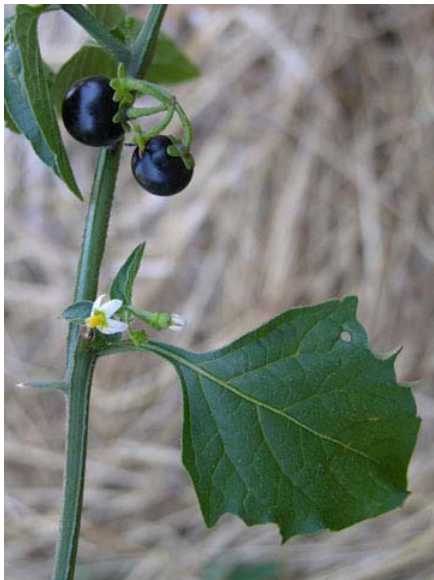
Solanum americanum Small-flower Nightshade Native Annual-Perennial Solanaceae