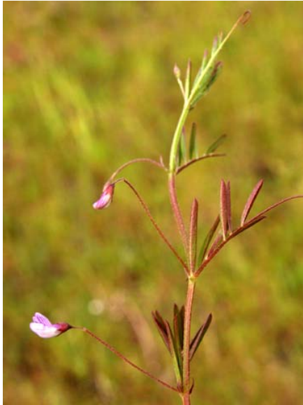
Vicia tetrasperma Tare Vetch Introduced Annual Fabaceae