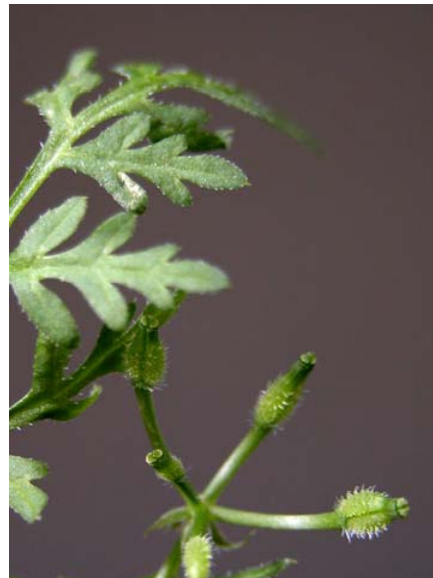
Anthriscus caucalis Bur-chervil Introduced Annual Apiaceae