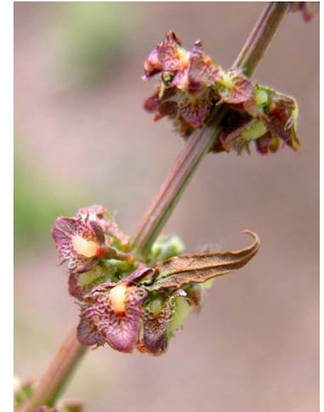
Rumex pulcher Fiddle Dock Introduced Perennial Polygonaceae