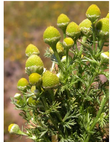
Chamomilla suaveolens Pineapple Weed Introduced Annual Asteraceae