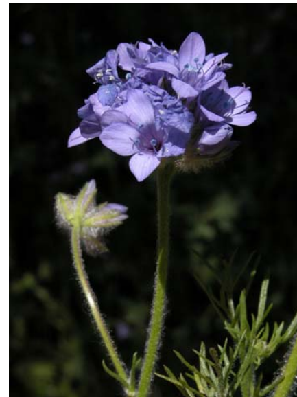
Gilia achilleifolia ssp. achilleifolia California Blue Gilia Native Annual Polemoniaceae