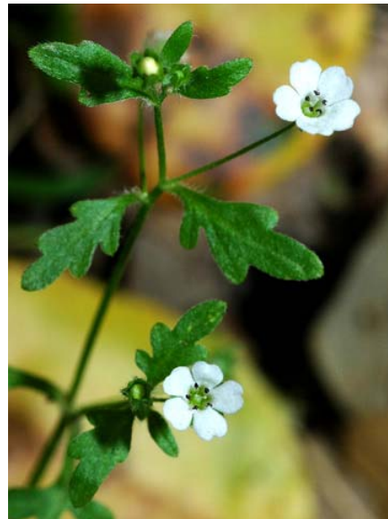
Nemophila heterophylla Variable-leaf Nemophila Native Annual Hydrophyllaceae