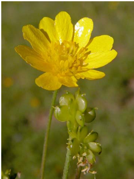
Ranunculus californicus California Buttercup Native Perennial Ranunculaceae