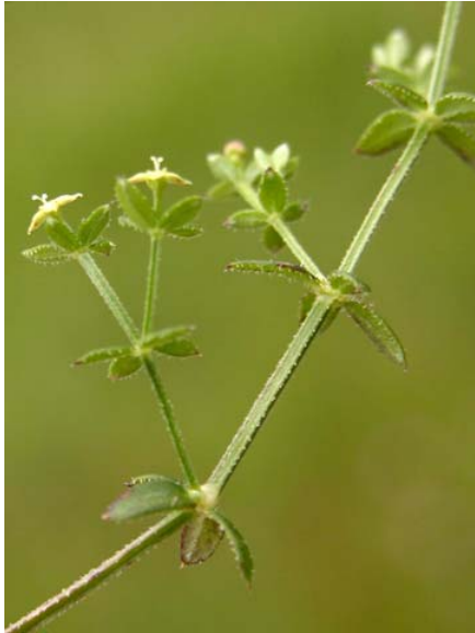
Galium porrigens var. porrigens Climbing Bedstraw Native Perennial Rubiaceae