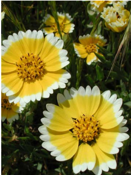
Layia platyglossa Common Tidytops Native Annual Asteraceae