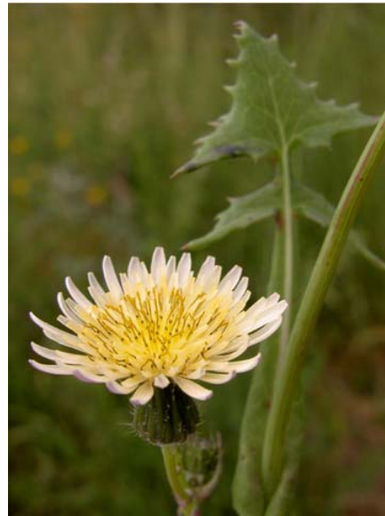
Sonchus oleraceus Common Sow Thistle Introduced Annual Asteraceae