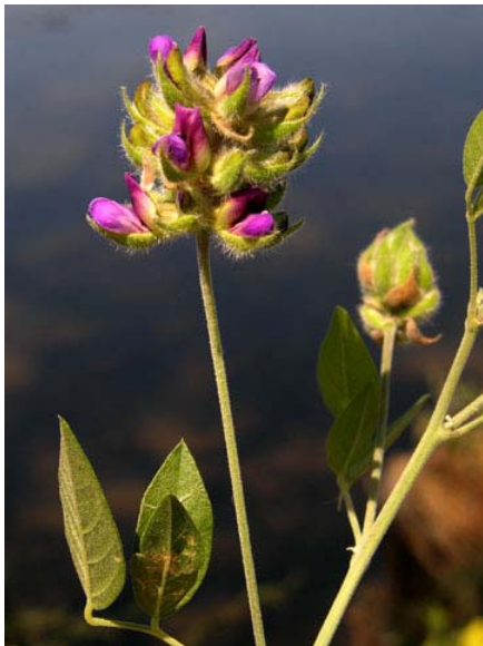
Rupertia physodes California Tea Native Perennial Fabaceae