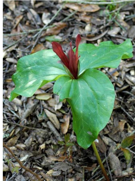
Trillium chloropetalum Giant Trillium Native Perennial Liliaceae