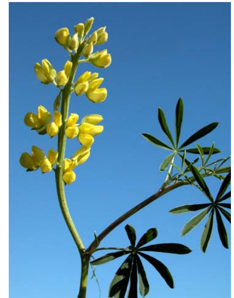
Lupinus arboreus Yellow Bush Lupine Native Perennial Fabaceae