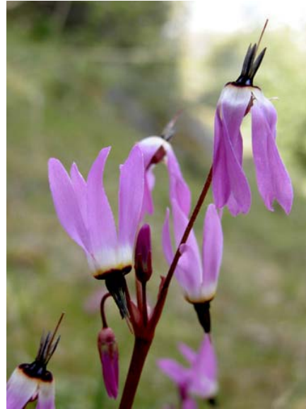
Dodecatheon hendersonii Mosquitobills Shooting Star Native Perennial Primulaceae