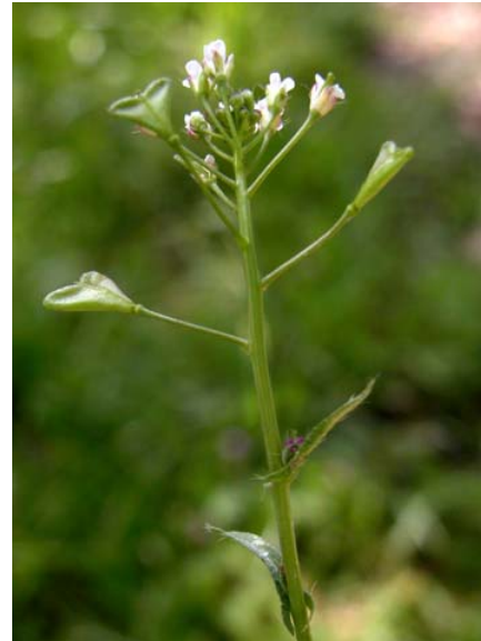
Capsella bursa-pastoris Shepherd's Purse Introduced Annual Brassicaceae