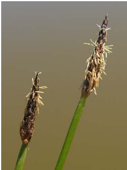
Eleocharis macrostachya Common Spikerush Native Perennial Cyperaceae