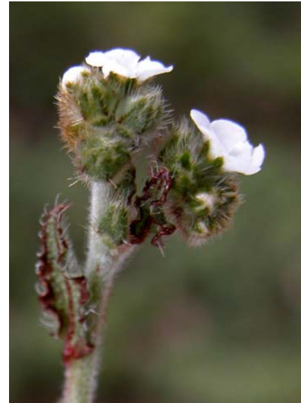
Plagiobothrys nothofulvus Nievitas Popcorn Flower Native Annual Boraginaceae