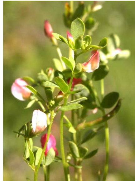
Lotus purshianus var. purshianus Spanish Clover Native Annual Fabaceae