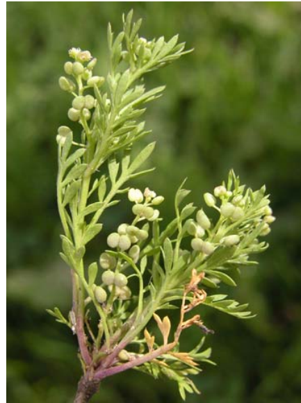
Coronopus didymus Wart Cress Introduced Annual Brassicaceae