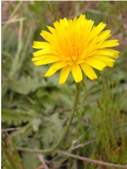
Hypochaeris radicata Rough Cat's-ear Introduced Perennial Asteraceae