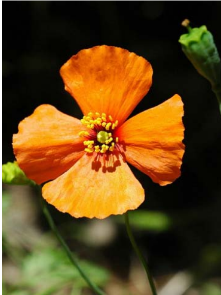
Stylomecon heterophylla Wind Poppy Native Annual Papaveraceae