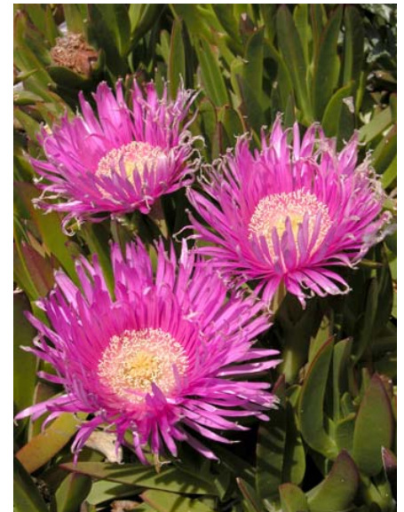
Carpobrotus chilensis Sea Fig Introduced Perennial Aizoaceae