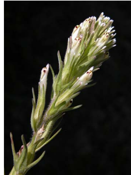
Castilleja attenuata Valley Tassels Native Annual Scrophulariaceae