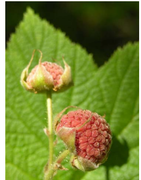
Rubus parviflorus Thimbleberry Native Perennial Rosaceae