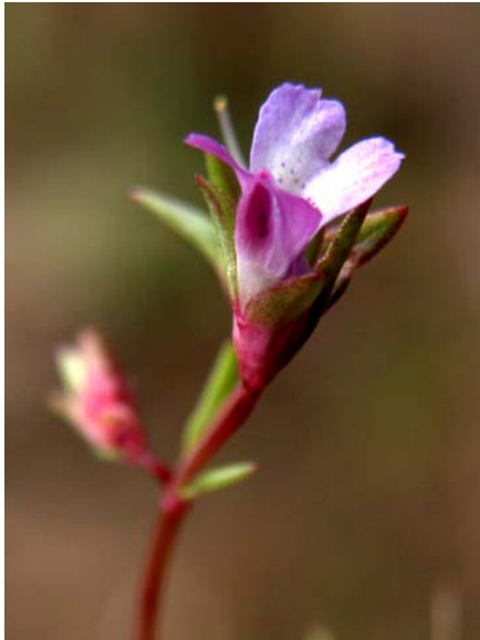
Collinsia sparsiflora var. collina Few-flowered Collinsia Native Annual Scrophulariaceae