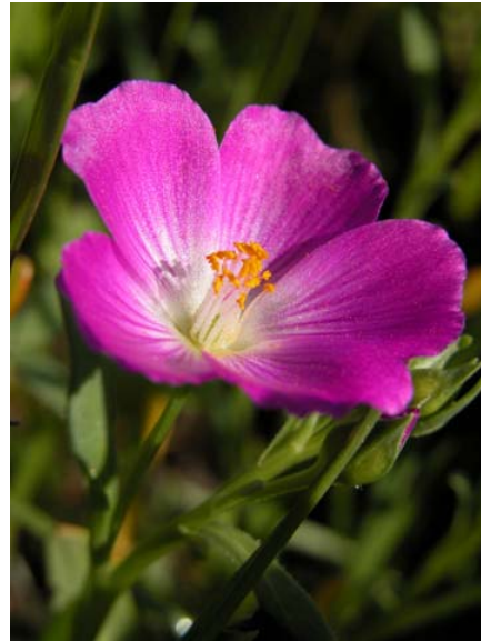
Calandrinia ciliata Magenta Red Maids Native Annual Portulacaceae