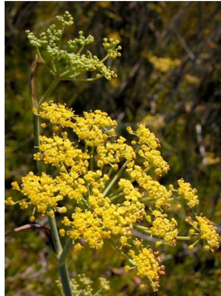
Foeniculum vulgare Sweet Fennel Introduced Perennial Apiaceae