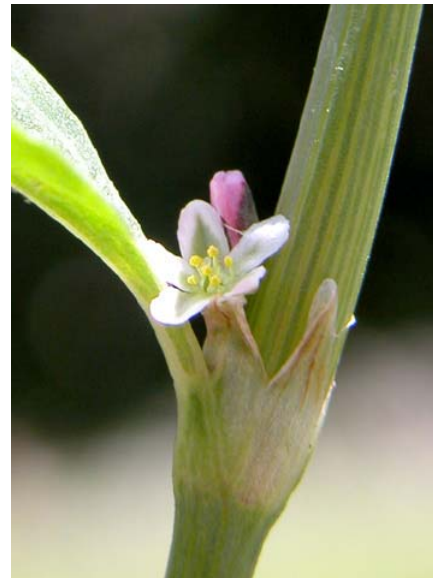
Polygonum arenastrum Common Yard Knotweed Introduced Annual Polygonaceae