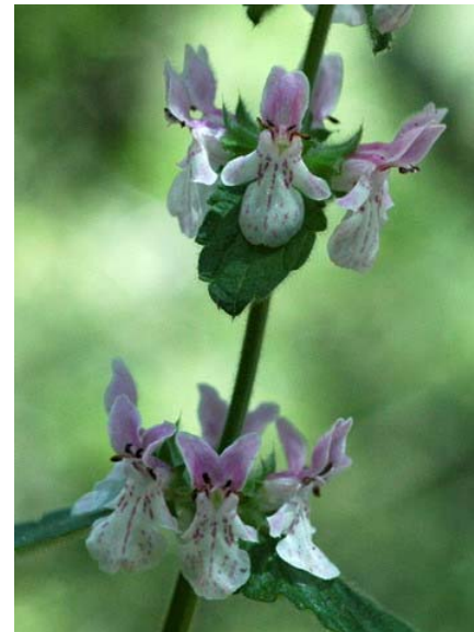
Stachys ajugoides var. rigida Common Rigid Hedge Nettle Native Perennial Lamiaceae