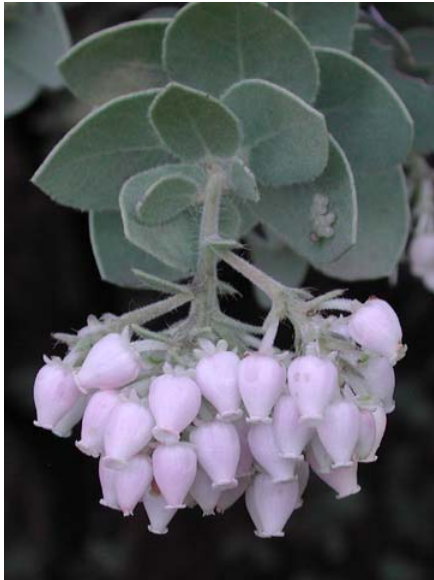
Arctostaphylos auriculata Mt. Diablo Manzanita Native Perennial Ericaceae