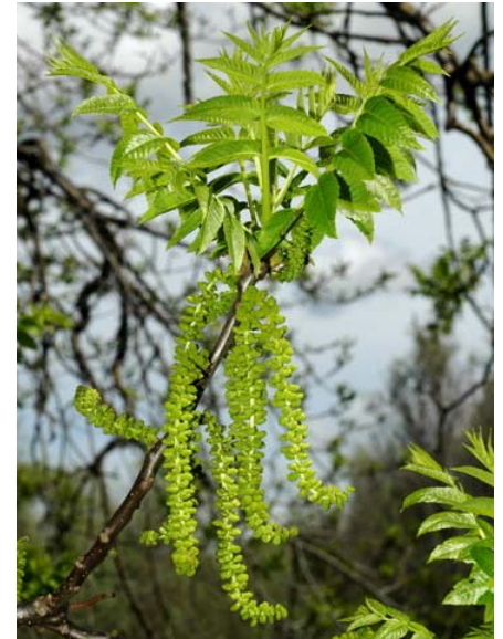
Juglans californica var. hindsii N. California Black Walnut Native Perennial Juglandaceae