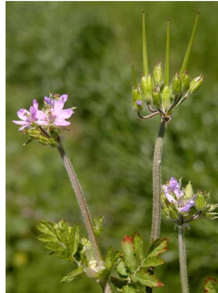
Erodium moschatum White-stem Filaree Introduced Annual Geraniaceae