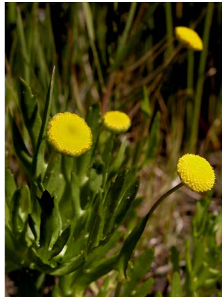
Cotula coronopifolia Brass Buttons Introduced Perennial Asteraceae