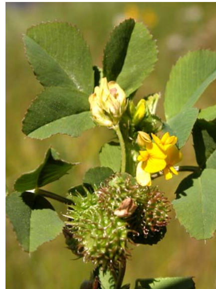
Medicago polymorpha California Bur Clover Introduced Annual Fabaceae