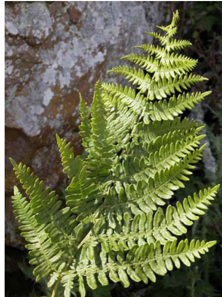
Pteridium aquilinum var. pubescens Bracken Fern Native Perennial Dennstaedtiaceae