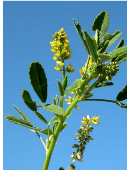
Melilotus indica Sour Clover Introduced Annual-Biennial Fabaceae