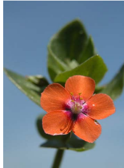
Anagallis arvensis Scarlet Pimpernel Introduced Annual Primulaceae