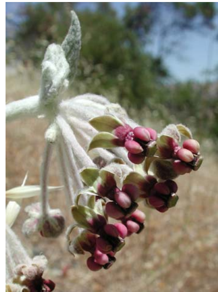
Asclepias californica California Milkweed Native Perennial Asclepiadaceae