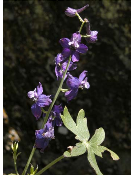
Delphinium decorum ssp. decorum Coast Larkspur Native Perennial Ranunculaceae