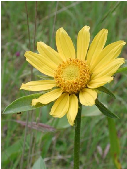
Helianthella castanea Mt. Diablo Helianthella Native Perennial Asteraceae