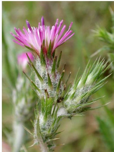
Carduus pycnocephalus Italian Thistle Introduced Annual Asteraceae