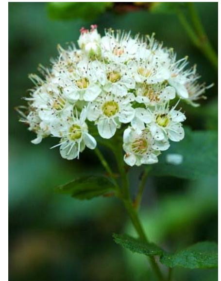
Physocarpus capitatus Pacific Ninebark Native Perennial Rosaceae