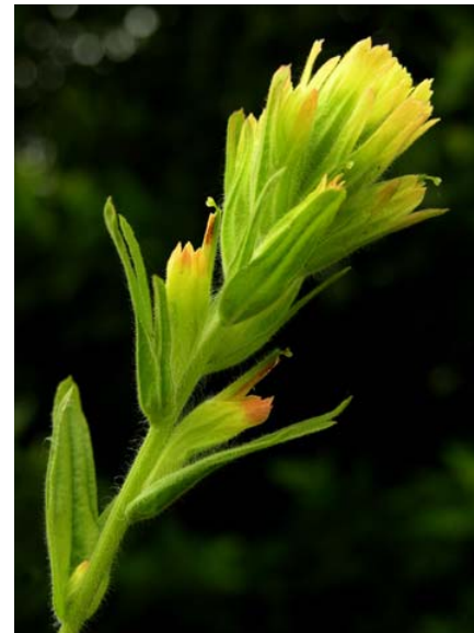
Castilleja wightii Seaside / Coastal Paintbrush Native Perennial Scrophulariaceae