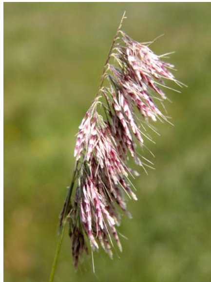
Lamarckia aurea Goldentop Grass Introduced Annual Poaceae