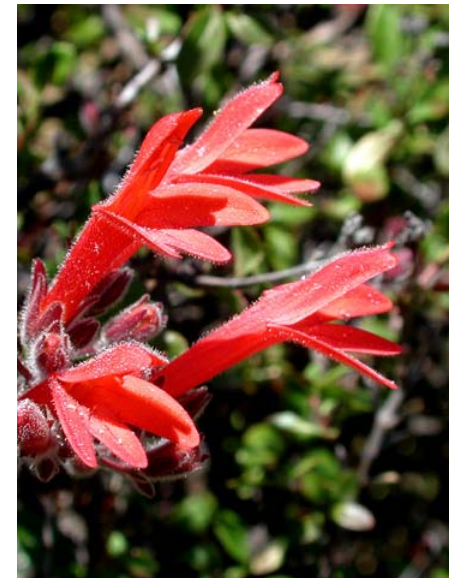
Epilobium canum ssp. canum California Fuchsia Native Perennial Onagraceae