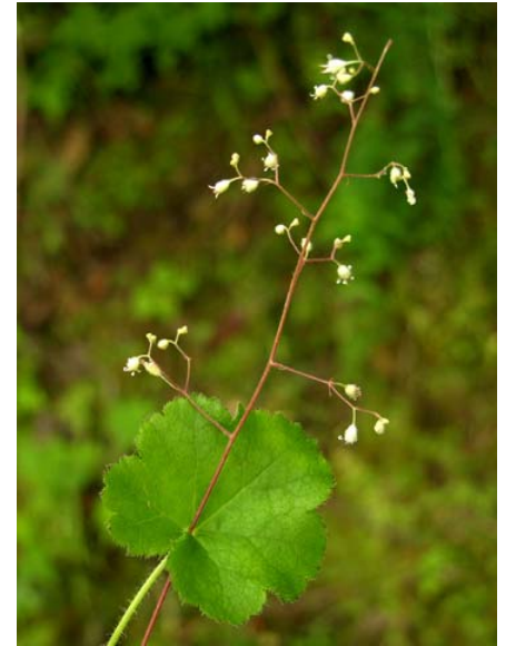
Heuchera micrantha Small-flower Alumroot Native Perennial Saxifragaceae