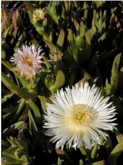
Carpobrotus edulis Yellow Hottentot Fig Introduced Perennial Aizoaceae