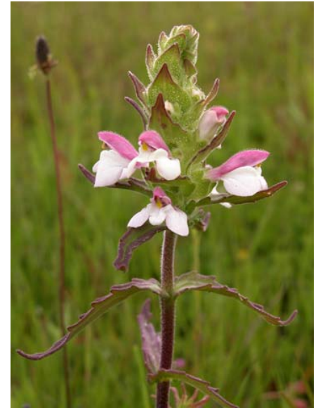
Bellardia trixago Bellardia Introduced Annual Scrophulariaceae