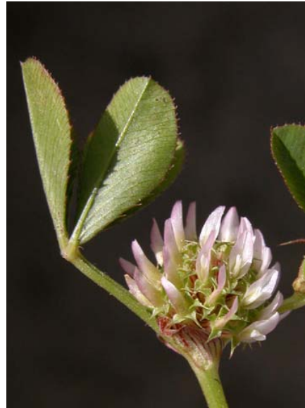
Trifolium glomeratum Clustered Clover Introduced Annual Fabaceae