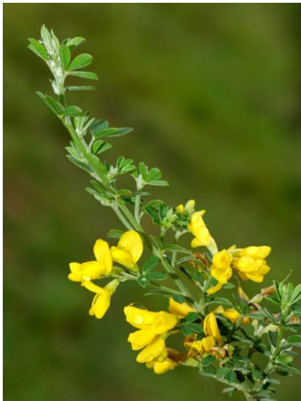
Cytisus scoparius Scotch Broom Introduced Perennial Fabaceae