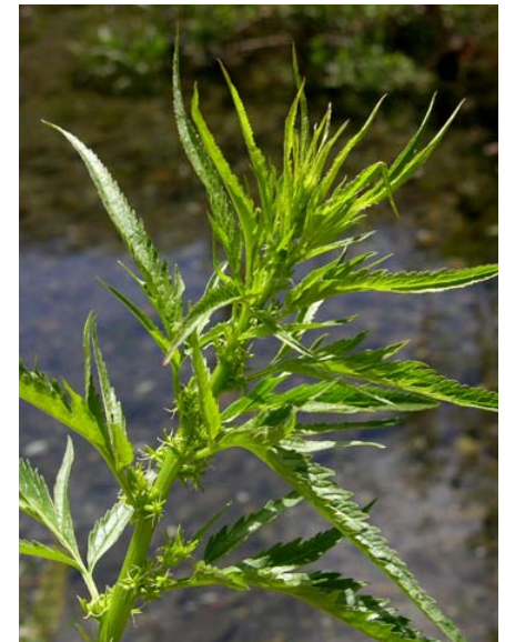
Datisca glomerata Durango Root Native Perennial Datisceae