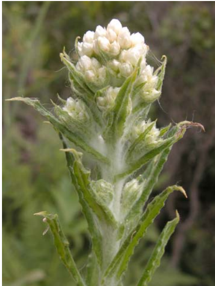
Gnaphalium californicum California Everlasting Native Biennial Asteraceae