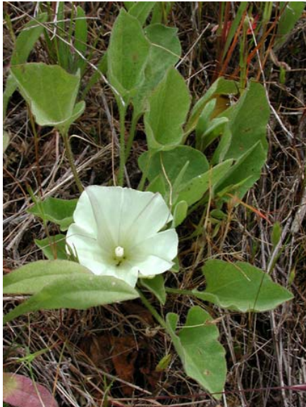
Calystegia subacaulis ssp. subacaulis Shortstem Morning Glory Native Perennial Convolvulaceae