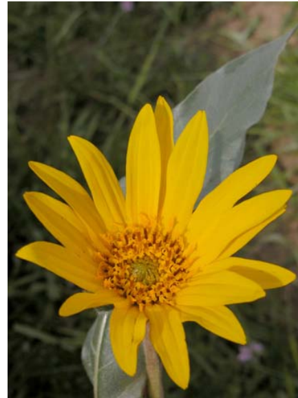
Wyethia angustifolia Narrow-leaf Mule's Ear Native Perennial Asteraceae