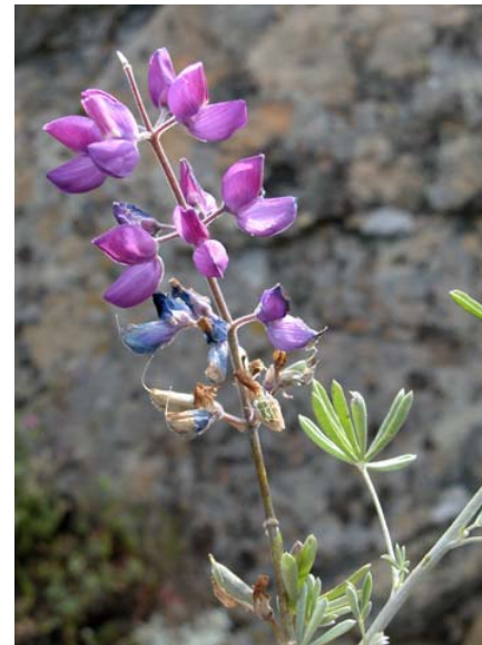
Lupinus albifrons var. collinus Bay Area Silver Lupine Native Perennial Fabaceae