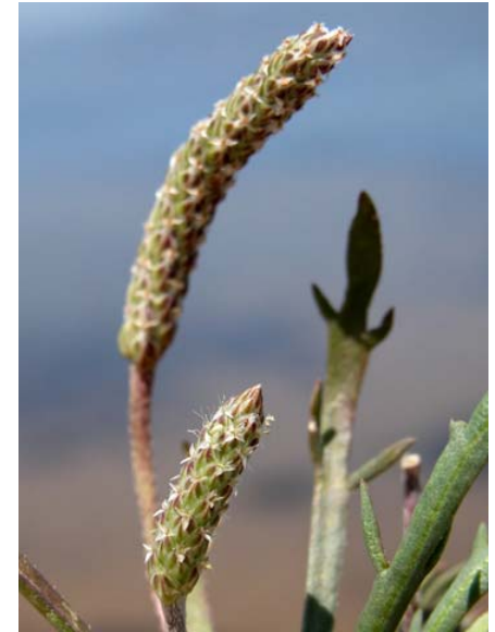
Plantago coronopus Cut-leaf Plantain Native Annual-Biennial Plantaginaceae