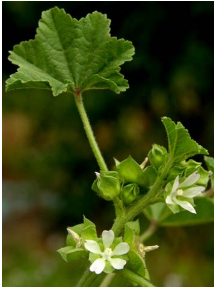
Malva parviflora Hidden-flower Cheeseweed Introduced Annual Malvaceae