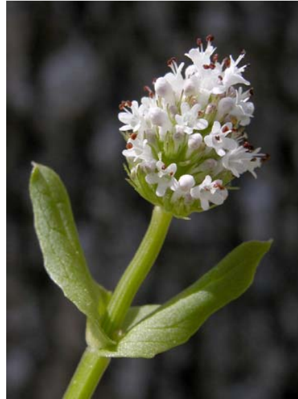
Plectritis macrocera Longhorn Plectritis Native Annual Valerianaceae