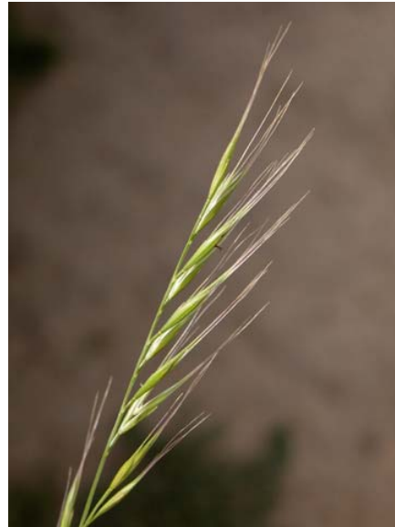
Vulpia microstachys var. pauciflora Few-flower Fescue Native Annual Poaceae