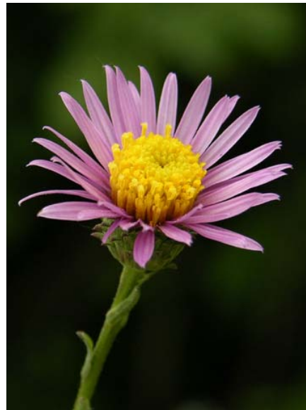
Lessingia filaginifolia var. filaginifolia Common Lessingia Native Perennial Asteraceae