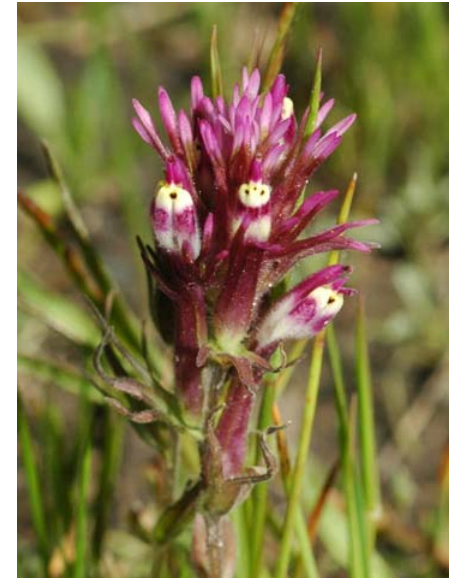
Castilleja densiflora ssp. densiflora Common Owl's Clover Native Annual Scrophulariaceae