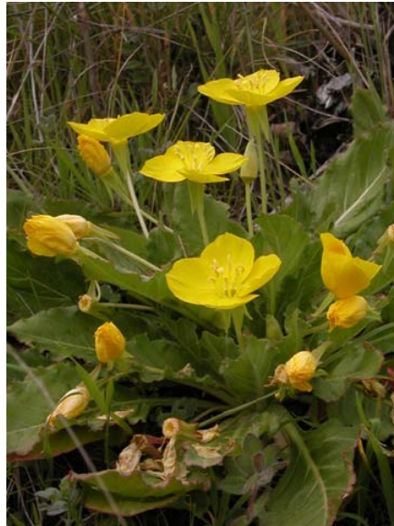
Camissonia ovata Golden Eggs Suncup Native Perennial Onagraceae