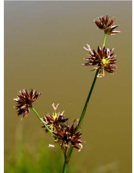
Juncus xiphioides Iris-leaf Rush Native Perennial Juncaceae