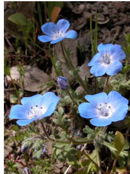
Nemophila menziesii var. menziesii Baby Blue-eyes Native Annual Hydrophyllaceae