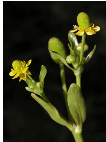
Ranunculus sceleratus Cursed Crowsfoot Native Annual Ranunculaceae