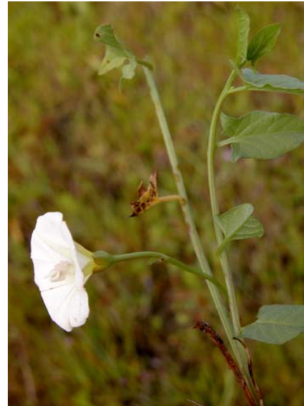
Convolvulus arvensis Field Bindweed Introduced Perennial Convolvulaceae