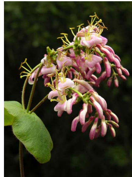
Lonicera hispidula var. vacillans Hairy Vine Honeysuckle Native Perennial Caprifoliaceae