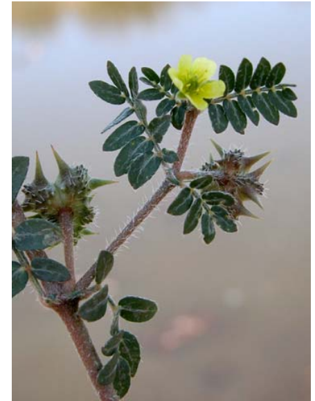
Tribulus terrestris Puncture Vine Introduced Annual Zygophyllaceae