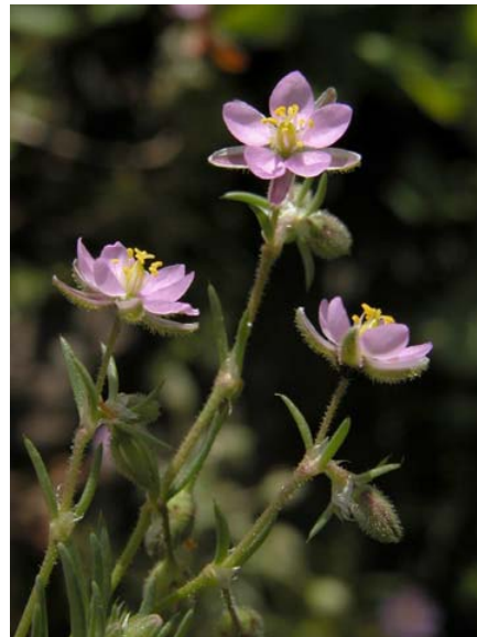
Spergularia rubra Ruby Sand Spurrey Introduced Annual-Perennial Caryophyllaceae