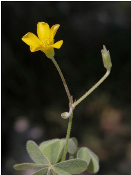
Oxalis corniculata Creeping Wood Sorrel Introduced Perennial Oxalidaceae