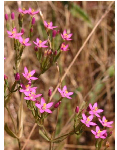
Centaurium muhlenbergii Monterey Centaury Native Annual-Biennial Gentianaceae