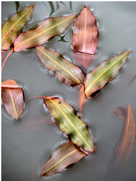
Potamogeton nodosus Long-leaf Pondweed Native Perennial Potamogetonaceae