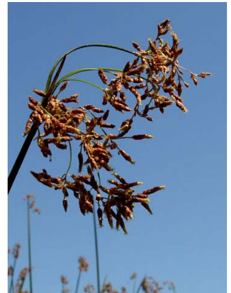
Scirpus californicus California Bulrush Native Perennial Cyperaceae