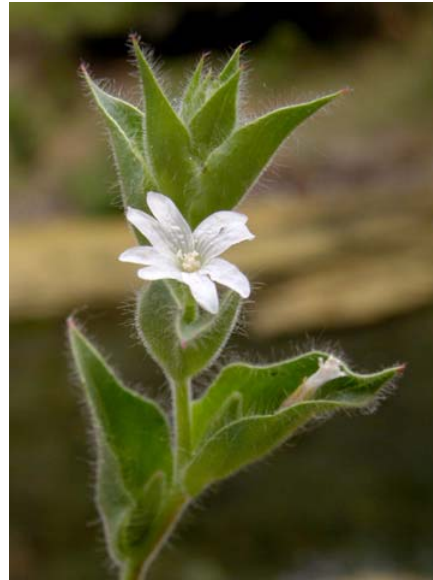
Epilobium densiflorum Dense-flower Willowherb Native Annual Onagraceae