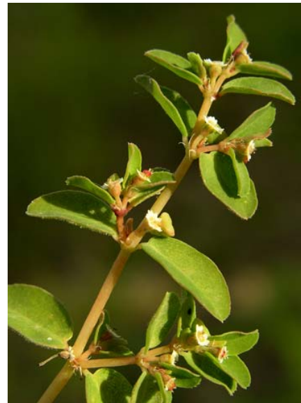
Chamaesyce serpyllifolia ssp. serpyllifolia Thymeleaf Spurge Native Annual Euphorbiaceae