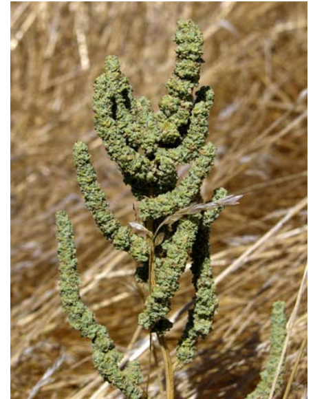
Atriplex joaquiniana San Joaquin Saltbush Native Annual Chenopodiaceae