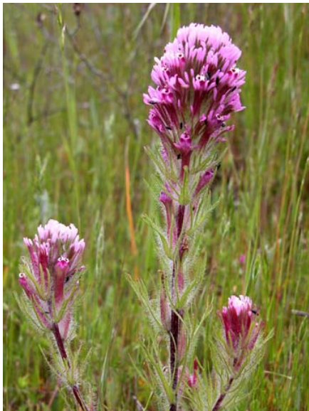
Castilleja exserta ssp. exserta Purple Owl's Clover Native Annual Scrophulariaceae