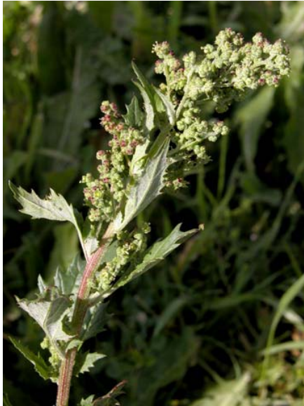
Chenopodium murale Wall Goosefoot Introduced Annual Chenopodiaceae