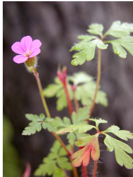
Geranium robertianum Herb Robert Introduced Annual-Biennial Geraniaceae