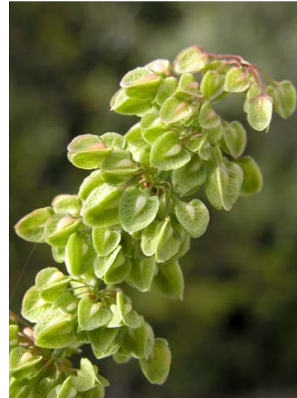
Rumex crispus Curly Dock Introduced Perennial Polygonaceae