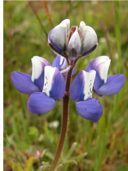
Lupinus nanus Douglas Sky Lupine Native Annual Fabaceae