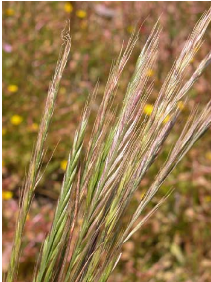
Vulpia bromoides Six-weeks Fescue Introduced Annual Poaceae