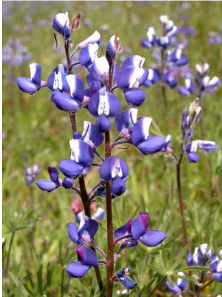
Lupinus bicolor Miniature Dove Lupine Native Annual Fabaceae