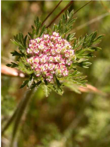
Daucus pusillus Rattlesnake Weed Native Annual Apiaceae