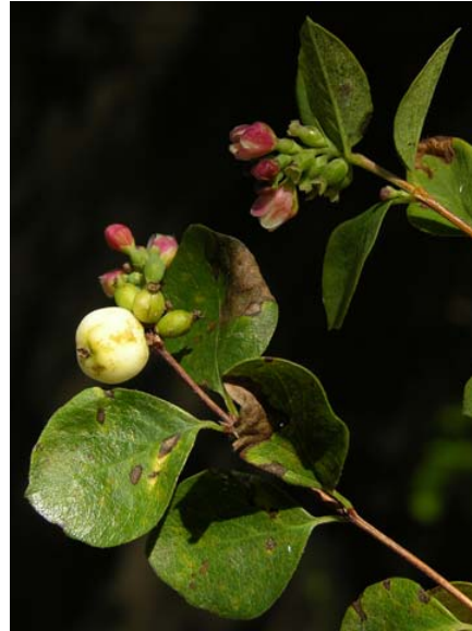
Symphoricarpos albus var. laevigatus Bush / Common Snowberry Native Perennial Caprifoliaceae