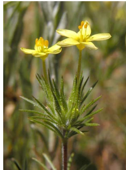
Linanthus acicularis Bristly Linanthus Native Annual Polemoniaceae