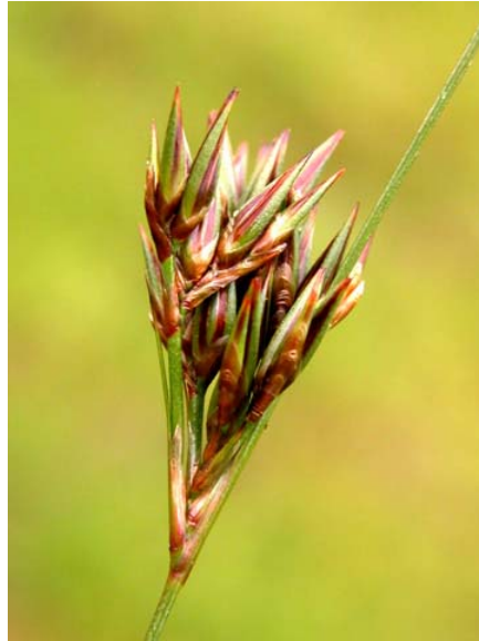
Juncus occidentalis Western Rush Native Perennial Juncaceae