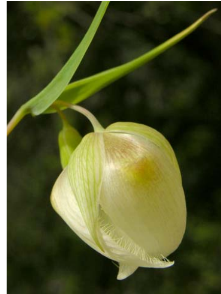
Calochortus albus White Fairy Lantern Native Perennial Liliaceae