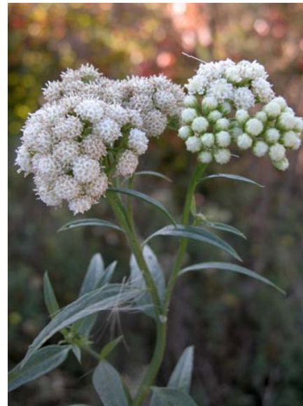
Baccharis douglasii Douglas/Salt Marsh Baccharis Native Perennial Asteraceae