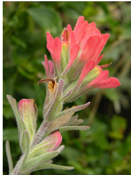
Castilleja foliolosa Woolly Paintbrush Native Perennial Scrophulariaceae