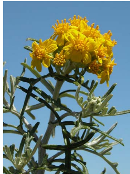
Eriophyllum staechadifolium Seaside Woolly Sunflower Native Perennial Asteraceae