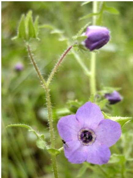
Pholistoma auritum var. auritum Blue Fiesta Flower Native Annual Hydrophyllaceae