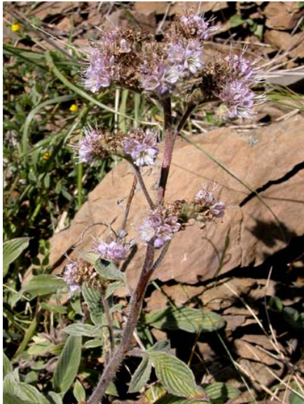
Phacelia californica California / Rock Phacelia Native Perennial Hydrophyllaceae