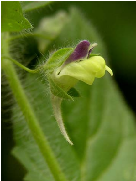
Kickxia elatine Sharp Point Fluvellin Introduced Annual Scrophulariaceae