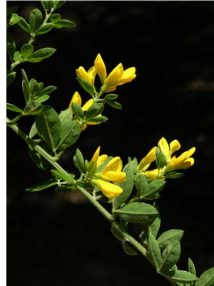
Genista monspessulana French Broom Introduced Perennial Fabaceae