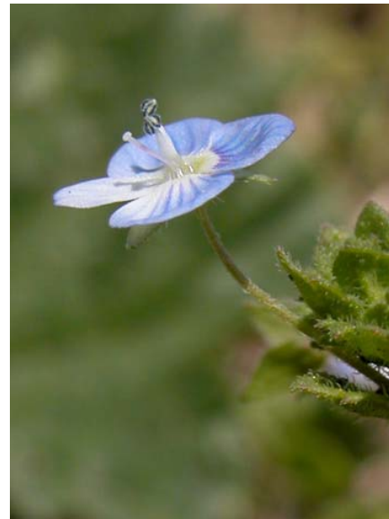
Veronica persica Persian Speedwell Introduced Annual Scrophulariaceae