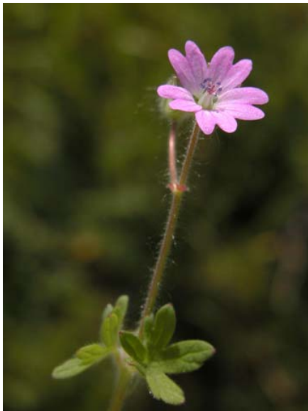
Geranium molle Hairy Dove's Foot Geranium Introduced Annual Geraniaceae