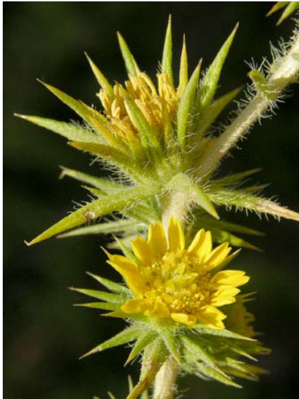
Hemizonia parryi ssp. congonii Congdon Spikeweed Native Annual Asteraceae