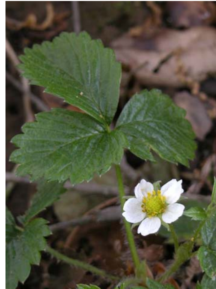
Fragaria vesca Woodland Strawberry Native Perennial Rosaceae