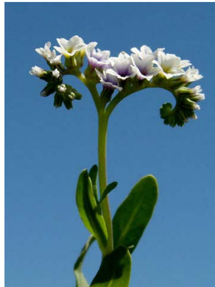
Heliotropium curassavicum Seaside Heliotrope Native Perennial Boraginaceae