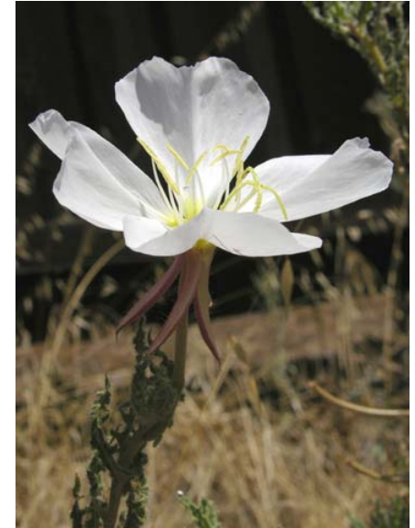
Oenothera deltoides ssp. howellii Antioch Dunes Eve Primrose Native Perennial Onagraceae