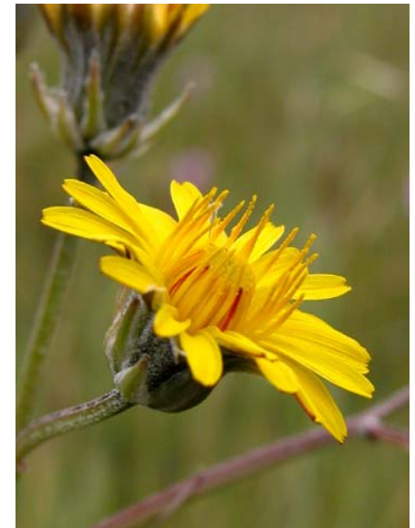
Crepis vesicaria ssp. taraxifolia Dandelion-leaf Hawk's-beard Introduced Annual-Biennial Asteraceae