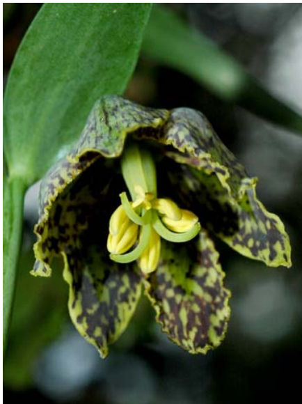
Fritillaria affinis var. affinis Checker Lily Native Perennial Liliaceae