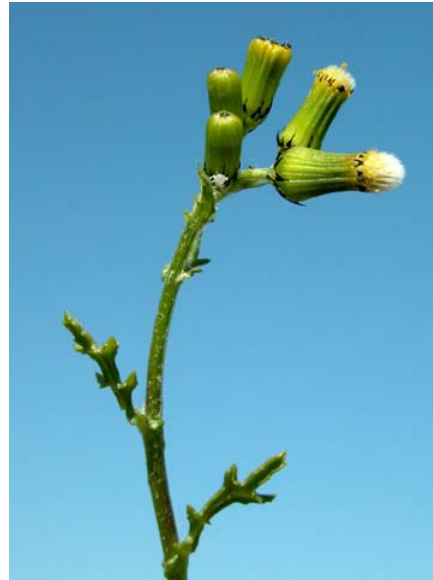
Senecio vulgaris Common Groundsel Introduced Annual Asteraceae