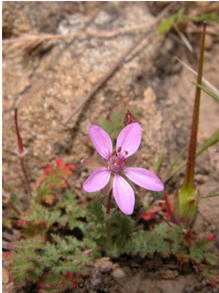
Erodium cicutarium Red-stem Filaree Introduced Annual Geraniaceae