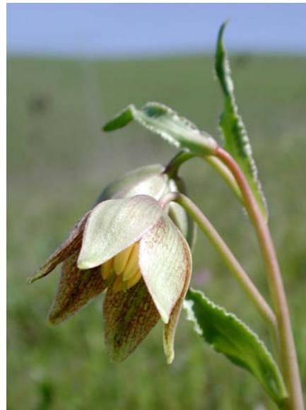
Fritillaria agrestis Stinkbells Native Perennial Liliaceae