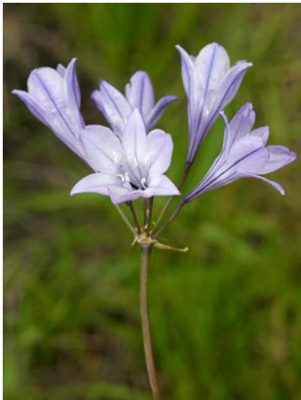
Triteleia laxa Ithuriel's Spear Native Perennial Liliaceae