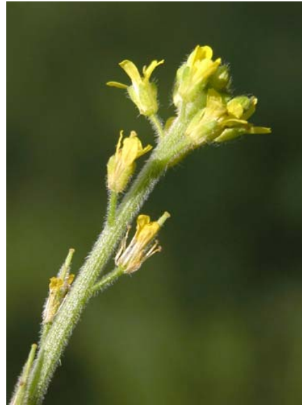
Sisymbrium officinale Hedge Mustard Introduced Annual Brassicaceae