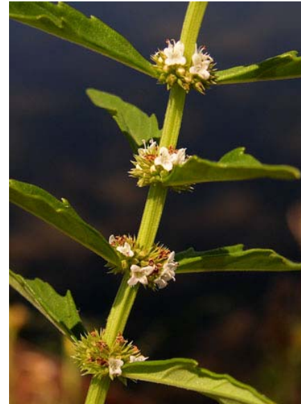
Mentha arvensis Field Mint Native Perennial Lamiaceae