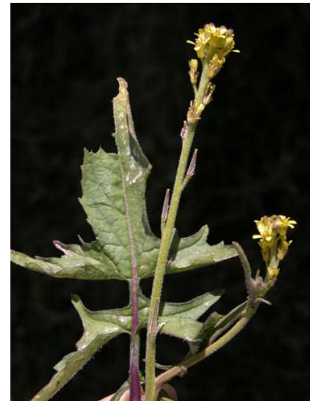
Brassica nigra Black Mustard Introduced Annual Brassicaceae