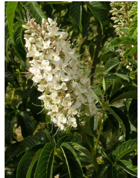
Aesculus californica California Buckeye Native Perennial Hippocastanaceae