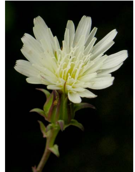
Rafinesquia californica California White Chicory Native Annual Asteraceae