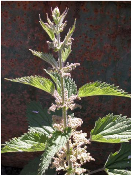
Urtica dioica ssp. holosericea Creek Stinging Nettle Native Perennial Urticaceae