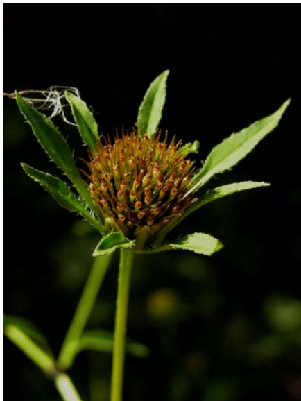
Bidens frondosa Sticktight Native Annual Asteraceae