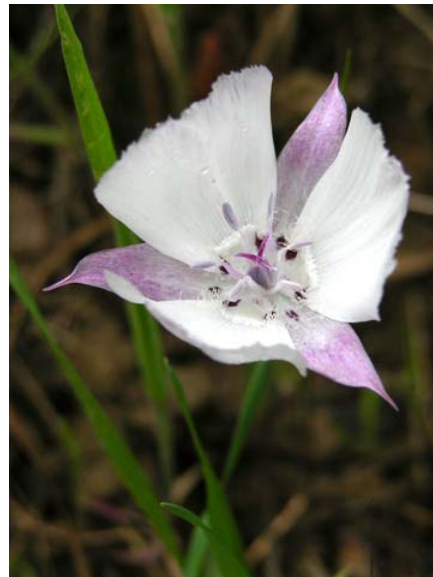
Calochortus umbellatus Oakland Star Tulip Native Perennial Liliaceae