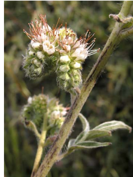
Phacelia imbricata ssp. imbricata Rock Phacelia Native Perennial Hydrophyllaceae