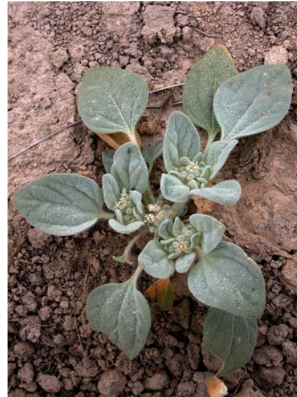
Eremocarpus setigerus Turkey Mullein Native Annual Euphorbiaceae