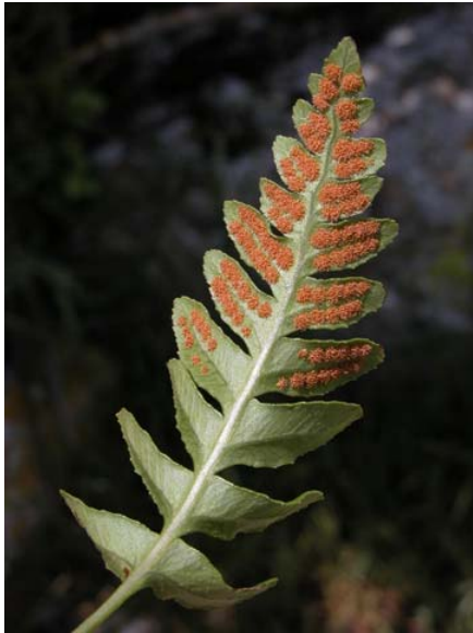
Polypodium calirhiza Polypody Fern Native Perennial Polypodiaceae