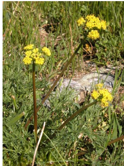
Lomatium caruifolium var. caruifolium Caraway-leaf Biscuit Root Native Perennial Apiaceae