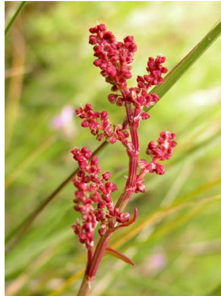
Rumex acetosella Sheep Sorrel Introduced Perennial Polygonaceae