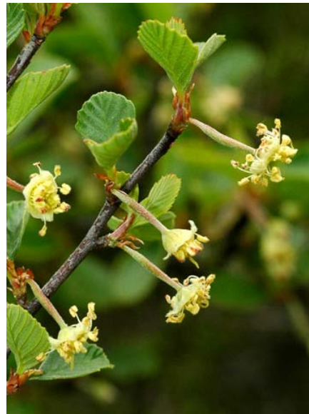
Cercocarpus betuloides var. betuloides Birch-leaf Mt. Mahogany Native Perennial Rosaceae