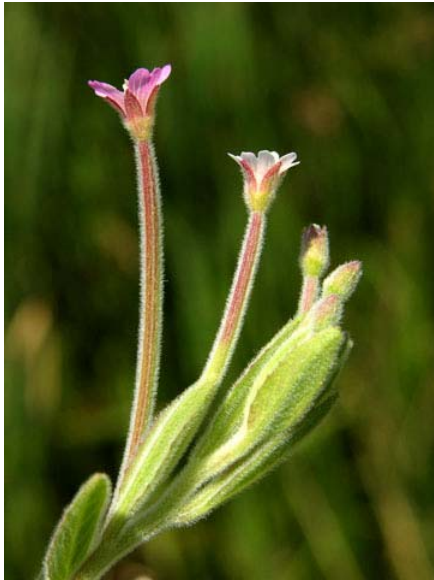
Epilobium ciliatum ssp. ciliatum Common Willowherb Native Perennial Onagraceae