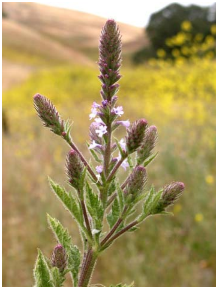
Verbena lasiostachys var. scabrada Robust Vervain Native Perennial Verbenaceae