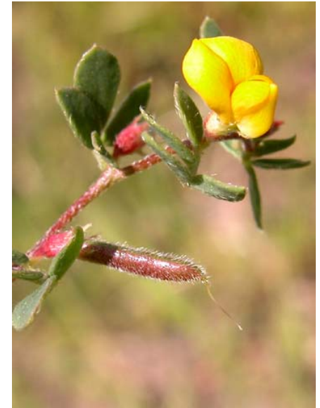
Lotus wrangelianus California Lotus Native Annual Fabaceae