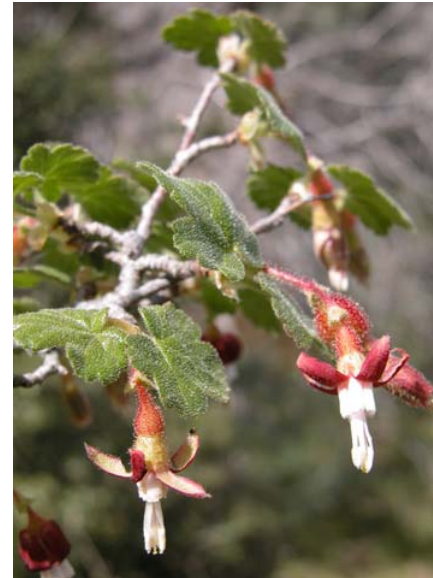
Ribes menziesii Canyon Gooseberry Native Perennial Grossulariaceae