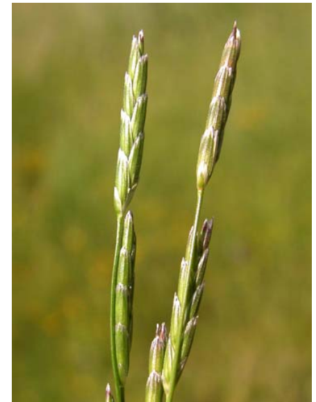
Glyceria occidentalis Western Manna Grass Native Perennial Poaceae