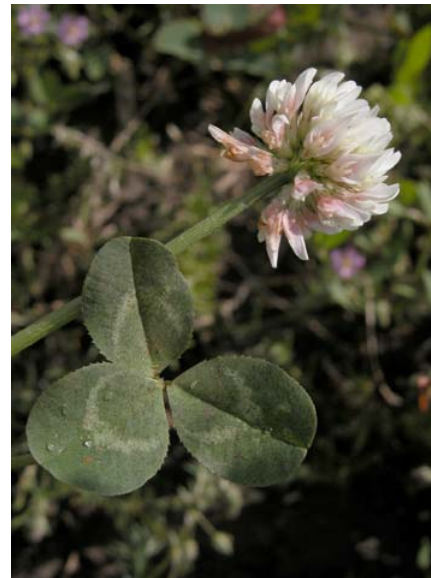
Trifolium repens White Clover Introduced Perennial Fabaceae