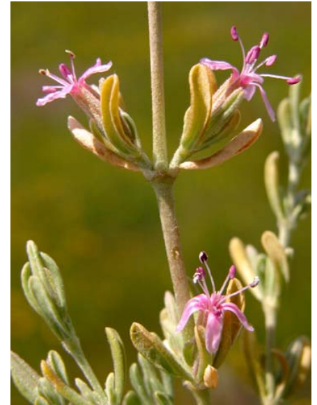
Frankenian salina Alkali Heath Native Perennial Frankeniaceae