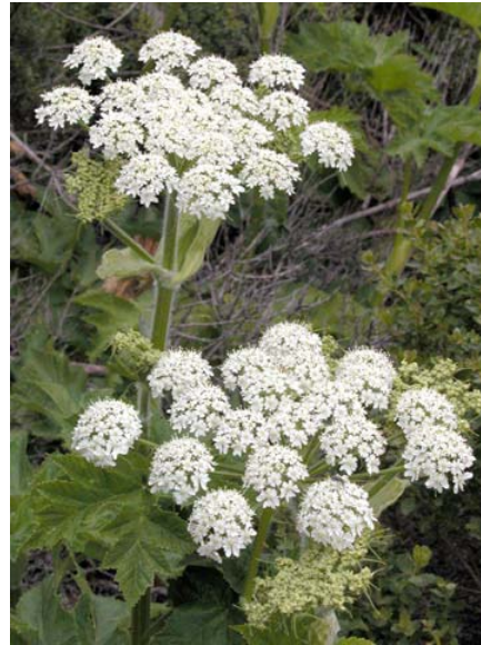
Heracleum lanatum Cow Parsnip Native Perennial Apiaceae