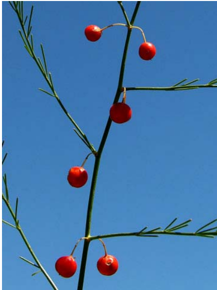
Asparagus officinalis ssp. officinalis Garden Asparagus Introduced Perennial Liliaceae