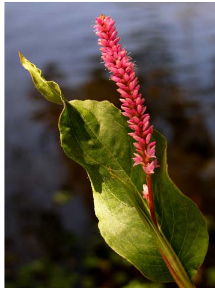
Polygonum amphibium var. emersum Swamp / Water Knotweed Native Perennial Polygonaceae