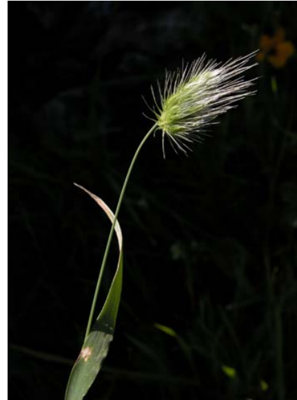
Cynosurus echinatus Hedgehog Dogtail Grass Introduced Annual Poaceae