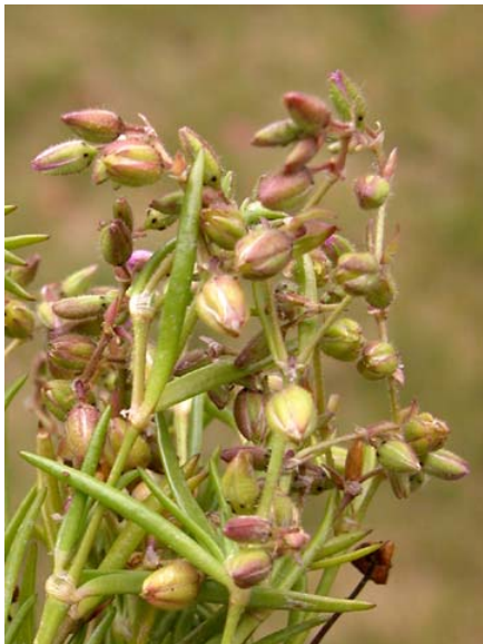
Spergularia marina Salt-marsh Sand Spurrey Native Annual Caryophyllaceae