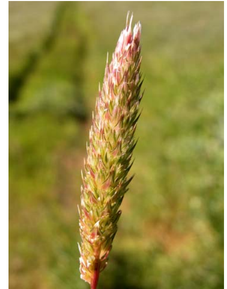
Phalaris aquatica Harding Grass Introduced Perennial Poaceae