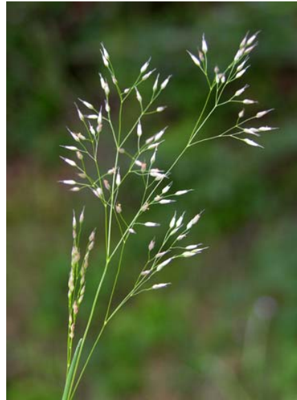
Aira caryophylla Silver European Hair Grass Introduced Annual Poaceae