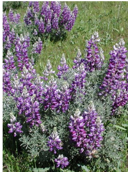
Lupinus albifrons var. albifrons Blue Bush / Silver Lupine Native Perennial Fabaceae