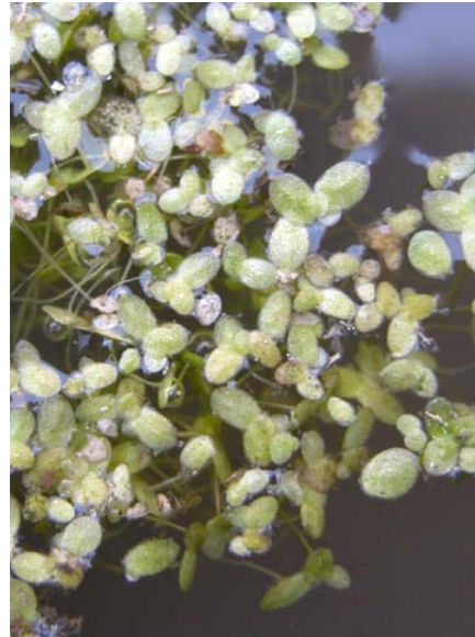
Lemna minor Common Lesser Duckweed Native Perennial Lemnaceae