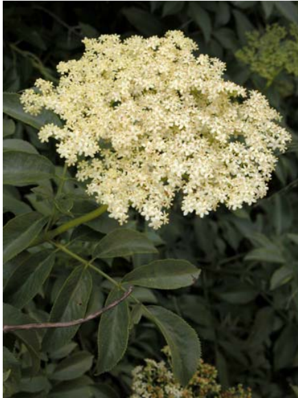
Sambucus mexicana Blue Elderberry Native Perennial Caprifoliaceae