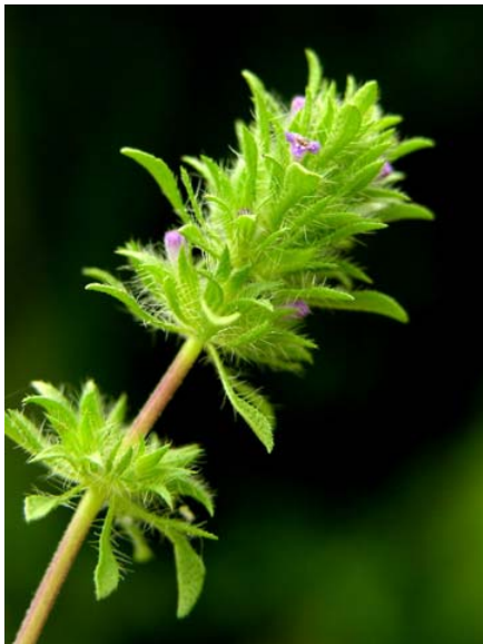
Pogogyne serpylloides Thymelike Pogogyne Native Annual Lamiaceae