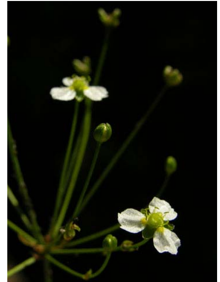
Alisma plantago-aquatica Common Water Plantain Native Perennial Alismataceae