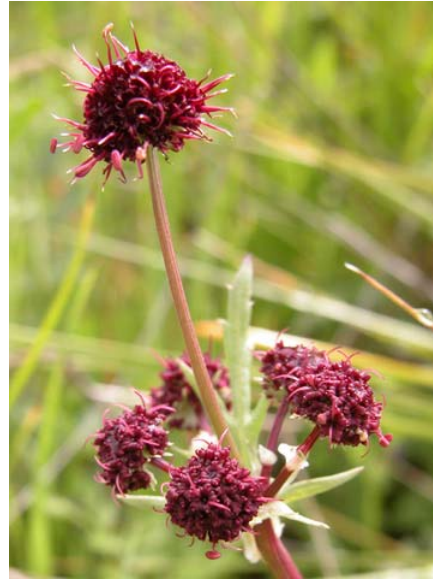
Sanicula bipinnatifida Purple Sanicle Native Perennial Apiaceae