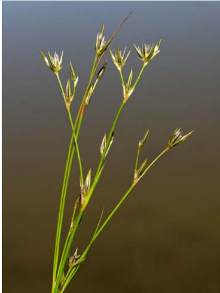
Juncus bufonius var. bufonius Toad Rush Native Annual Juncaceae