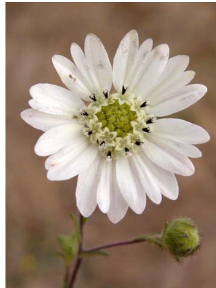
Hemizonia congesta ssp. luzulaefolia Hayfield Tarweed Native Perennial Asteraceae