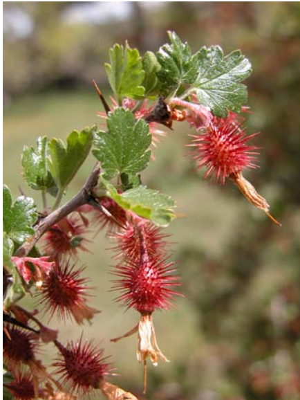
Ribes californicum var. californicum Hillside Gooseberry Native Perennial Grossulariaceae