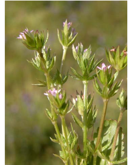
Sherardia arvensis Blue Field Madder Introduced Annual Rubiaceae