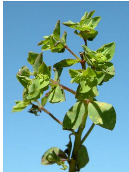
Euphorbia peplus Petty Spurge Introduced Annual Euphorbiaceae