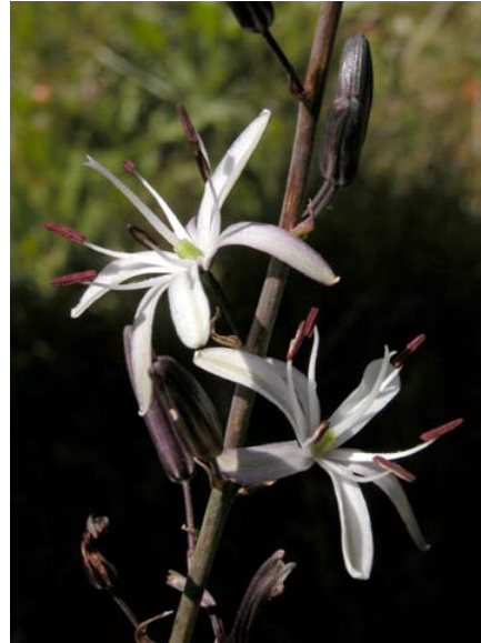
Chlorogalum pomeridianum var. pomeridianum Common Soap Plant Native Perennial Liliaceae