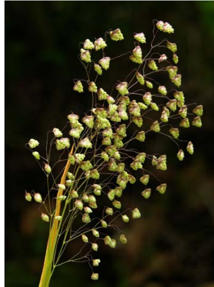
Briza minor Little Quaking Grass Introduced Annual Poaceae