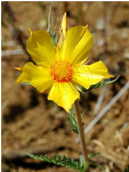
Mentzelia lindleyi Lindley Blazing Star Native Annual Loasaceae