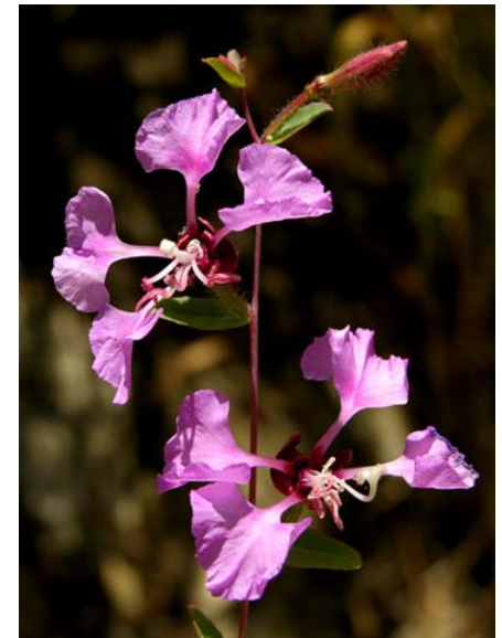
Clarkia unguiculata Elegant Clarkia Native Annual Onagraceae