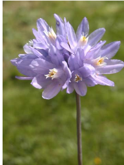
Dichelostemma capitatum ssp. capitatum Blue Dicks Native Perennial Liliaceae