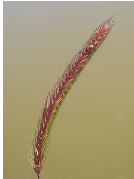
Hordeum brachyantherum ssp. brachyantherum Meadow Barley Native Perennial Poaceae