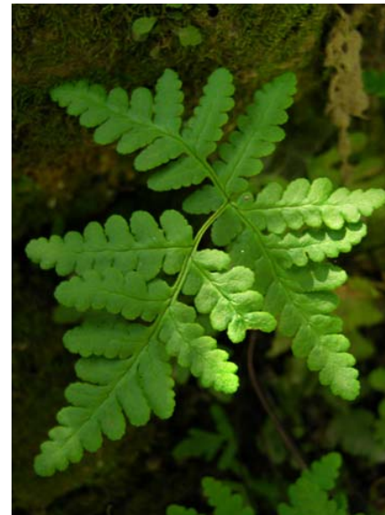
Pentagramma triangularis ssp. triangularis Goldenback Fern Native Perennial Pteridaceae