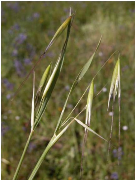
Avena barbata Slender Wild Oat Introduced Annual Poaceae