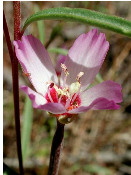
Clarkia franciscana Presidio Clarkia Native Annual Onagraceae