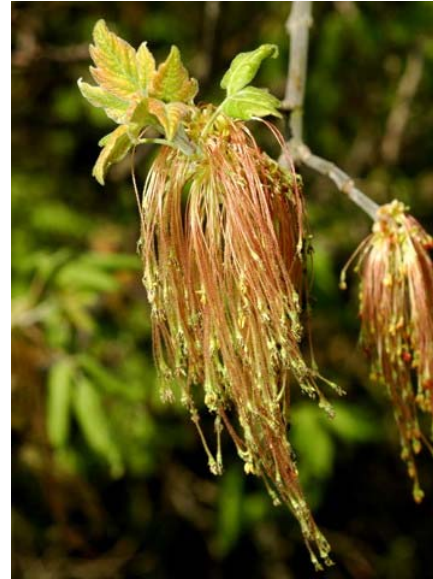
Acer negundo var. californicum Box Elder Native Perennial Aceraceae