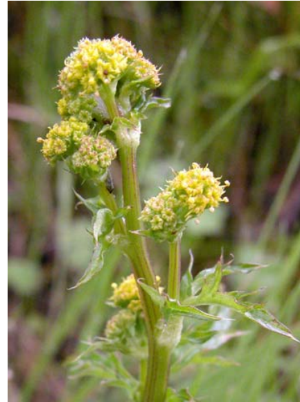
Sanicula crassicaulis Pacific Woodland Sanicle Native Perennial Apiaceae