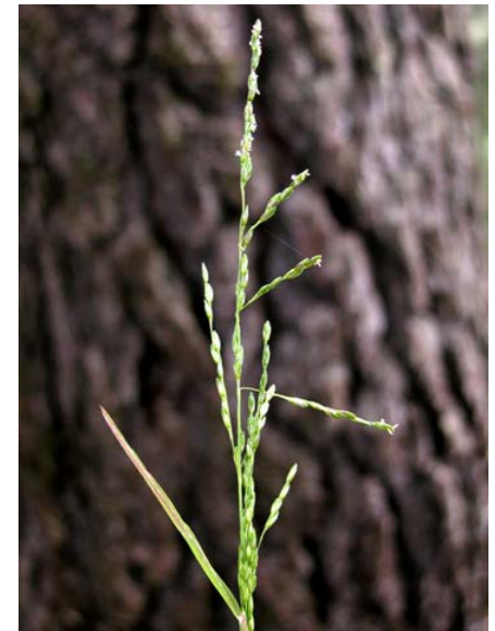
Melica imperfecta Coast Range Melic Grass Native Perennial Poaceae