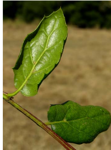
Quercus agrifolia var. agrifolia Coast Live Oak Native Perennial Fagaceae