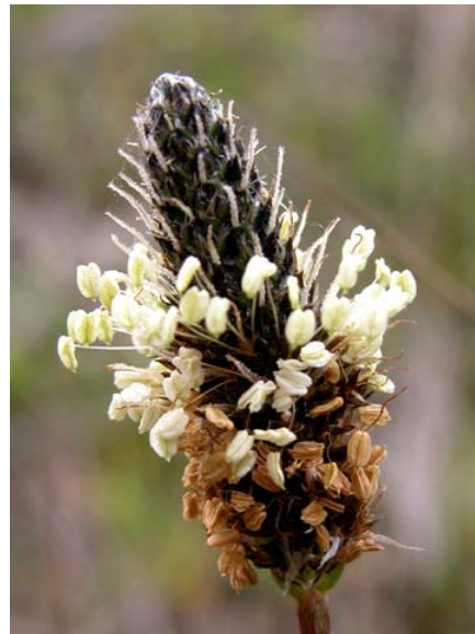
Plantago lanceolata English Plantain Introduced Annual Plantaginaceae