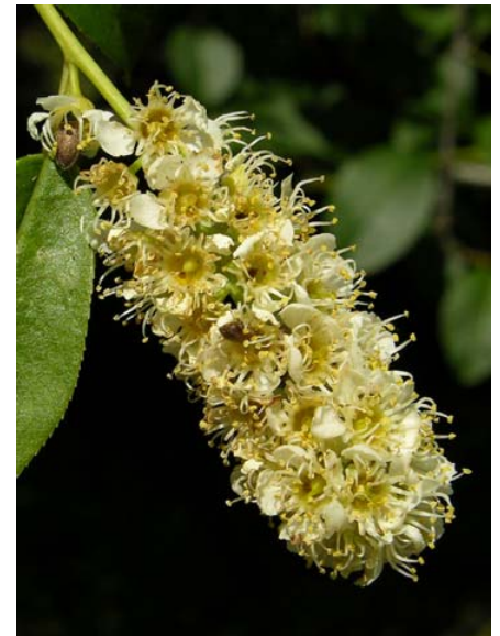
Prunus virginiana var. demissa Western Chokecherry Native Perennial Rosaceae