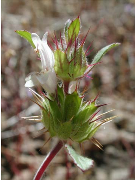
Acanthomintha lanceolata Santa Clara Thornmint Native Perennial Lamiaceae