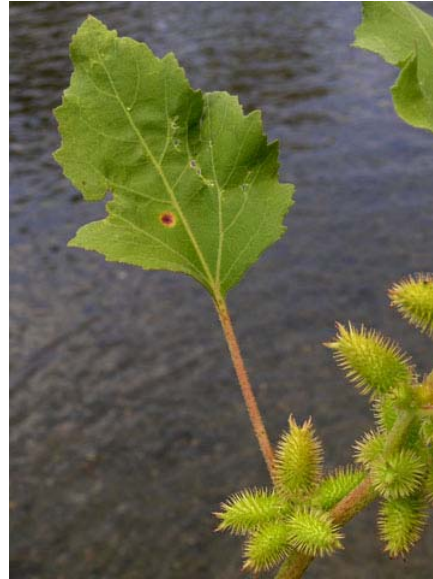
Xanthium strumarium Cocklebur Native Annual Asteraceae