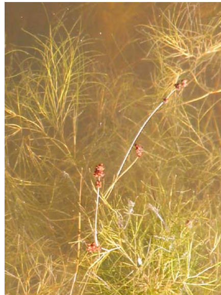
Potamogeton pectinatus Fennel-leaf Pondweed Native Perennial Potamogetonaceae