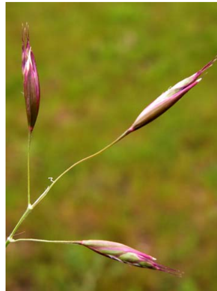
Danthonia californica var. californica California Oat Grass Native Perennial Poaceae