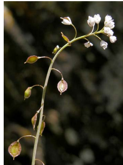
Thysanocarpus curvipes Hairy Fringe-pod Native Annual Brassicaceae