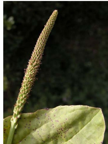
Plantago major Common Plantain Introduced Annual-Perennial Plantaginaceae