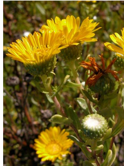
Grindelia stricta var. angustifolia Narrowleaf Pacific Gumplant Native Perennial Asteraceae