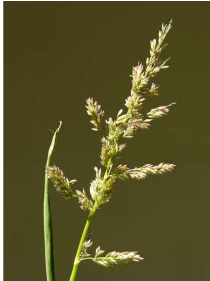
Agrostis viridis Water Bent Grass Introduced Perennial Poaceae