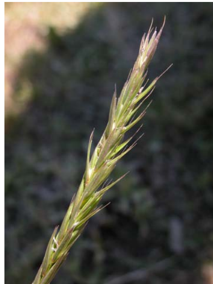
Elymus glaucus ssp. glaucus Blue Wild Rye Native Perennial Poaceae