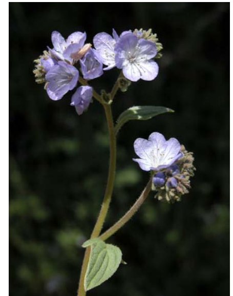
Phacelia breweri Brewer Phacelia Native Perennial Hydrophyllaceae