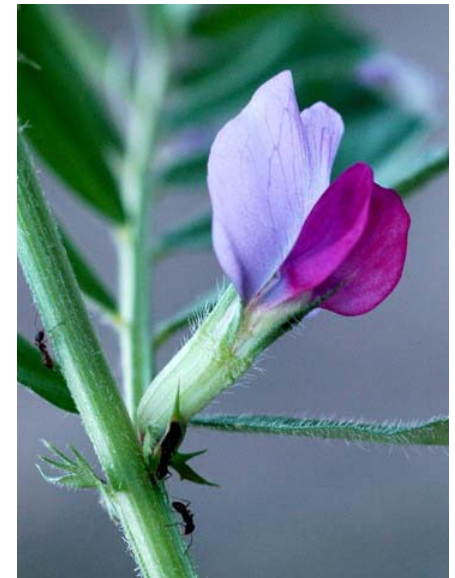
Vicia sativa ssp. sativa Spring Vetch Introduced Annual Fabaceae