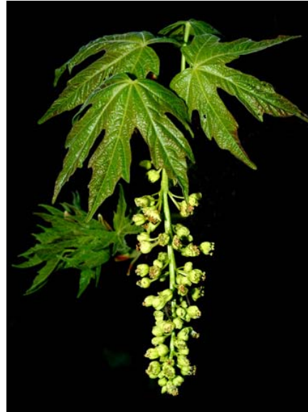
Acer macrophyllum Bigleaf Maple Native Perennial Aceraceae