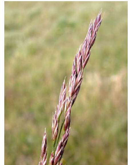
Festuca rubra Red Fescue Native Perennial Poaceae