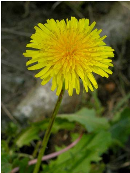
Taraxacum officinale Common Dandelion Introduced Biennial-Perennial Asteraceae