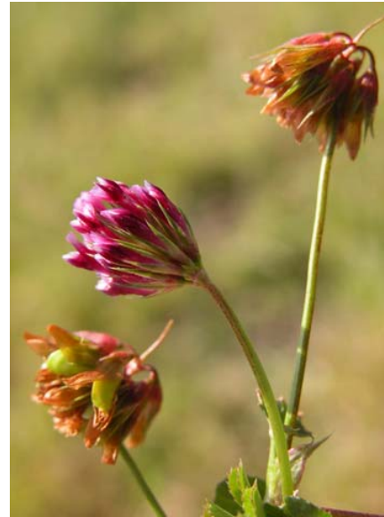
Trifolium gracilentum var. gracilentum Pinpoint Clover Native Annual Fabaceae