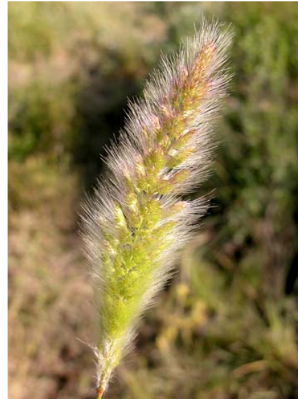
Polypogon monspeliensis Annual Rabbitfoot Grass Introduced Annual Poaceae