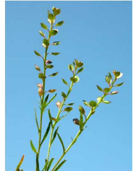
Lepidium nitidum var. nitidum Threadleaf Peppergrass Native Annual Brassicaceae