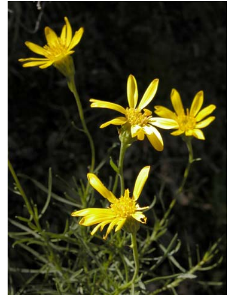
Ericameria linearifolia Interior Golden Bush Native Perennial Asteraceae