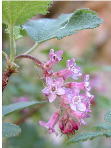
Ribes malvaceum var. malvaceum Chaparral Currant Native Perennial Grossulariaceae