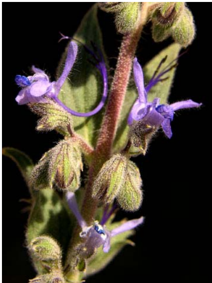
Trichostema lanceolatum Vinegar Weed Native Annual Lamiaceae