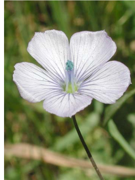
Linum bienne Narrow-leaf Flax Introduced Perennial Linaceae