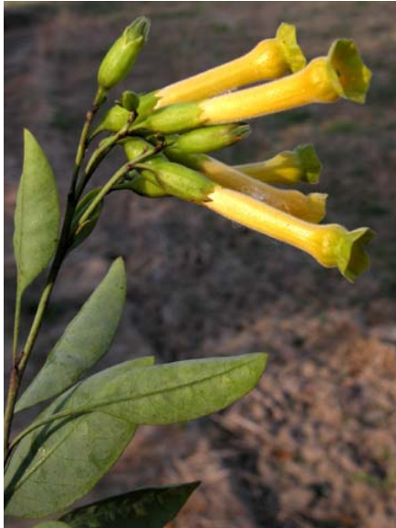
Nicotiana glauca Tree Tobacco Introduced Perennial Solanaceae