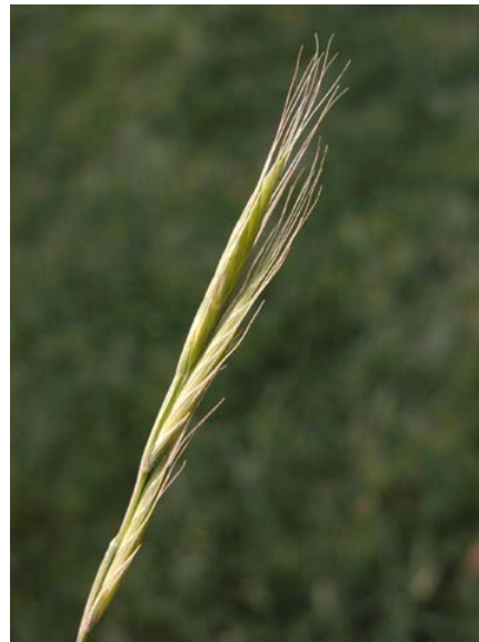
Brachypodium distachyon Purple False-brome Introduced Annual Poaceae