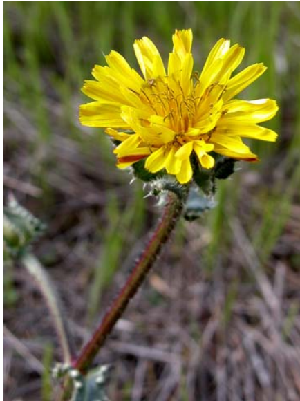
Picris echioides Bristly Ox-tongue Introduced Annual-Biennial Asteraceae