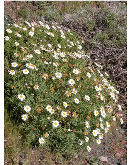
Argyranthemum foeniculaceum Lance-leaf Marguerite Introduced Perennial Asteraceae