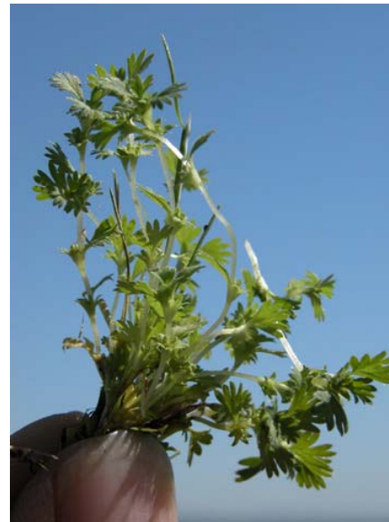
Aphanes occidentalis Lady's Mantle Native Annual Rosaceae