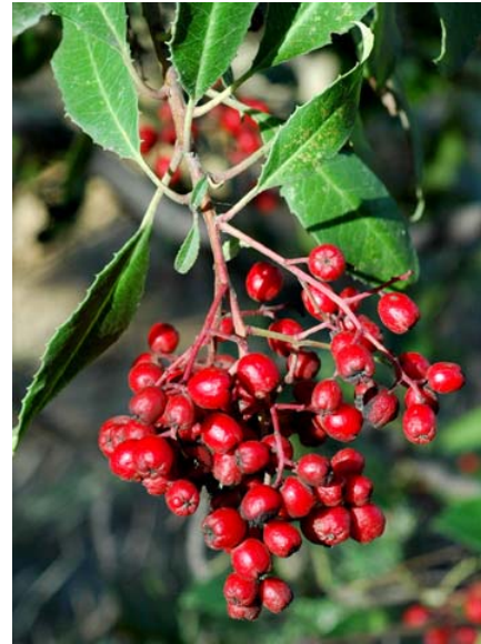
Heteromeles arbutifolia Toyon Native Perennial Rosaceae