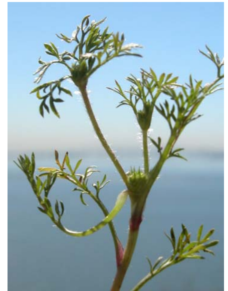
Soliva sessilis Common Soliva Introduced Annual Asteraceae