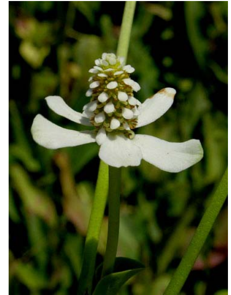
Anemopsis californica Yerba Mansa Native Perennial Saururaceae