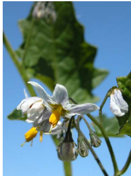
Solanum nigrum Black Nightshade Introduced Annual Solanaceae