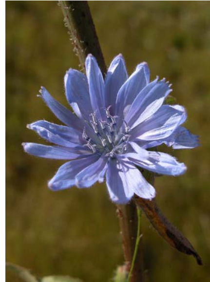
Cichorium intybus Chicory Introduced Perennial Asteraceae