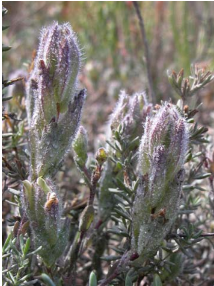
Cordylanthus mollis ssp. mollis Soft Bird's Beak Native Annual Scrophulariaceae