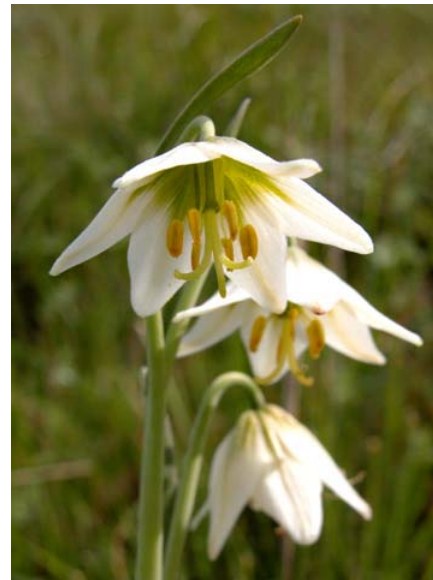
Fritillaria liliacea Fragrant White Fritillary Native Perennial Liliaceae