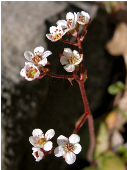
Saxifraga californica California Saxifrage Native Perennial Saxifragaceae