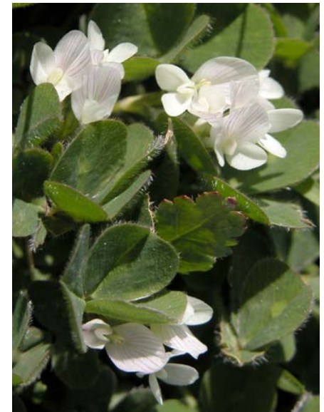
Trifolium subterraneum Subterranean Clover Introduced Annual Fabaceae