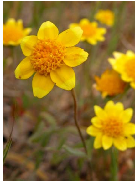
Lasthenia californica Goldfields Native Annual Asteraceae