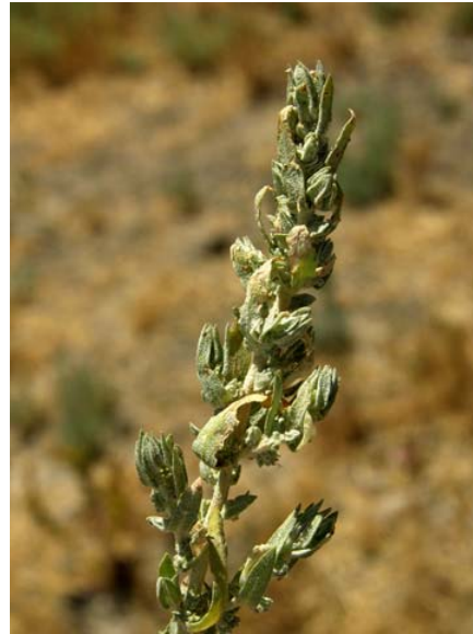
Atriplex cordulata Heart Scale Native Annual Chenopodiaceae