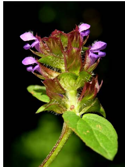
Prunella vulgaris var. lanceolata Narrow-leaf Selfheal Native Perennial Lamiaceae