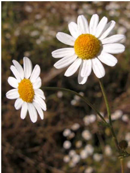
Anthemis cotula Mayweed Introduced Annual Asteraceae