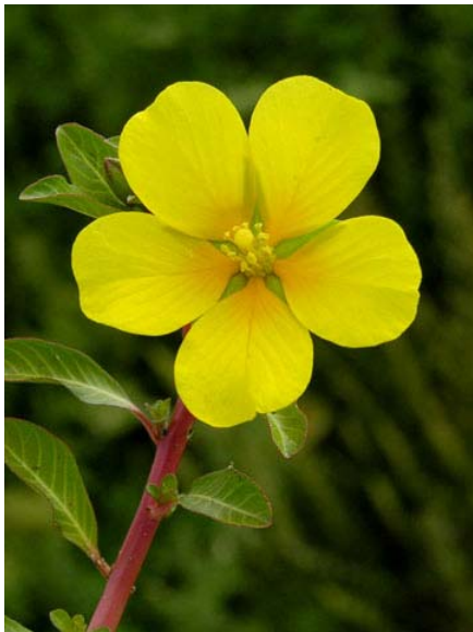
Ludwigia peploides ssp. peploides Yellow Water Primrose Native Perennial Onagraceae