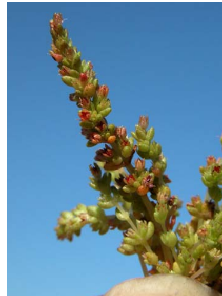
Crassula connata Sand Pygmy Weed Native Annual Crassulaceae