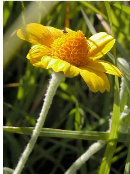
Monolopia major Cupped Monolopia Native Annual Asteraceae