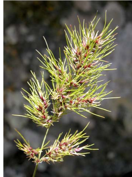
Poa bulbosa Bulbous Blue Grass Introduced Perennial Poaceae