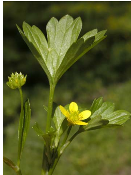
Ranunculus muricatus Prickleseed Buttercup Introduced Annual Ranunculaceae