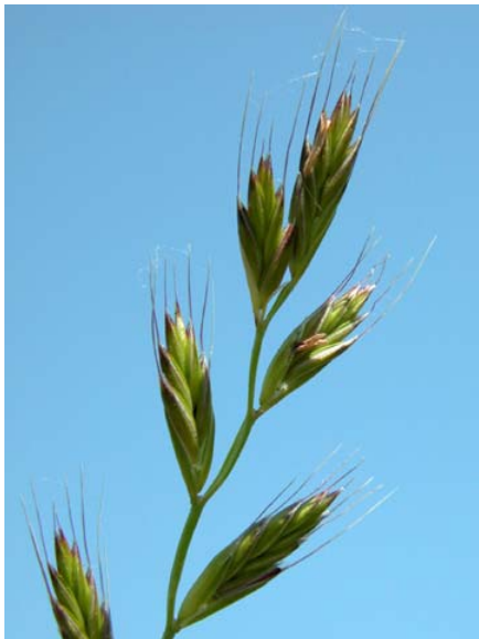
Lolium multiflorum Awned Italian Rye Grass Introduced Perennial Poaceae