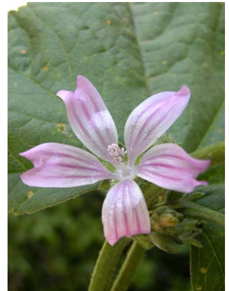
Malva nicaeensis Bull Mallow Introduced Annual Malvaceae