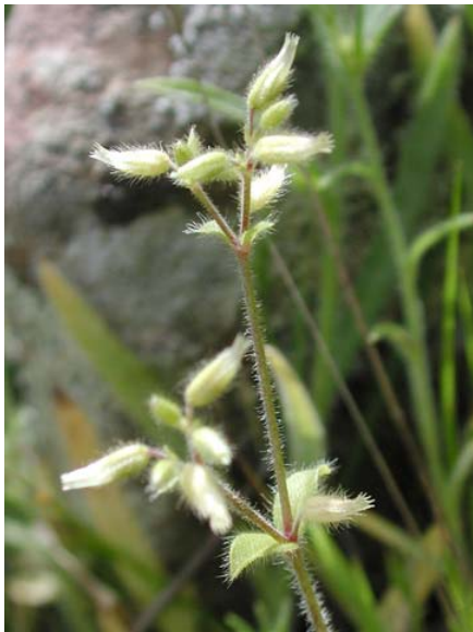
Cerastium glomeratum Mouse-ear Chickweed Introduced Annual Caryophyllaceae