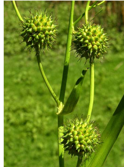
Sparganium eurycarpum ssp. eurycarpum Broad-fruit Bur-reed Native Perennial Typhaceae