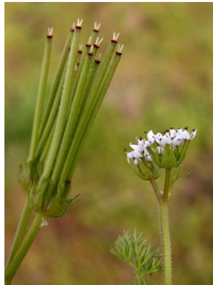
Scandix pecten-veneris Shepherd's Needle Introduced Annual Apiaceae