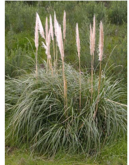
Cortaderia selloana Smooth Pampas Grass Introduced Perennial Poaceae