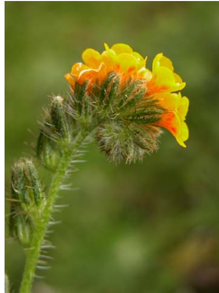
Amsinckia menziesii var. intermedia Common Fiddleneck Native Annual Boraginaceae