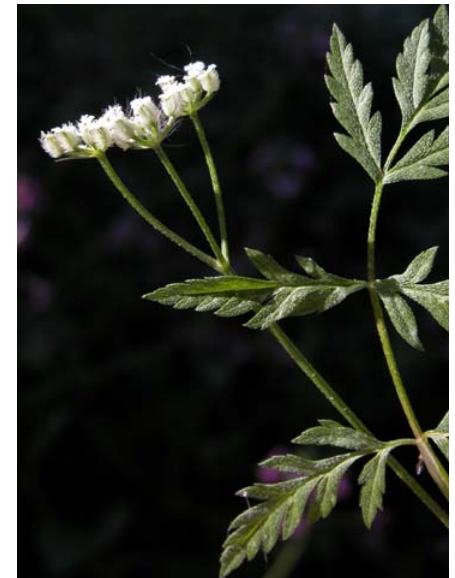
Torilis arvensis Hedge Parsley Introduced Annual Apiaceae