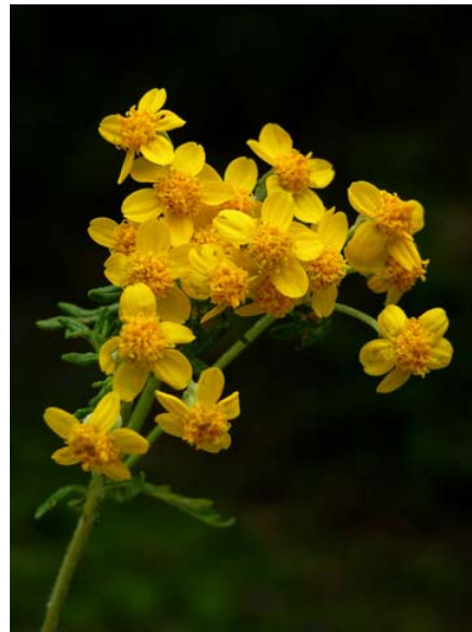
Eriophyllum confertiflorum var. confertiflorum Golden Yarrow Native Perennial Asteraceae