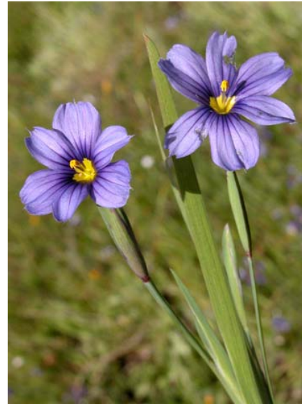
Sisyrinchium bellum Blue-eyed Grass Native Perennial Iridaceae