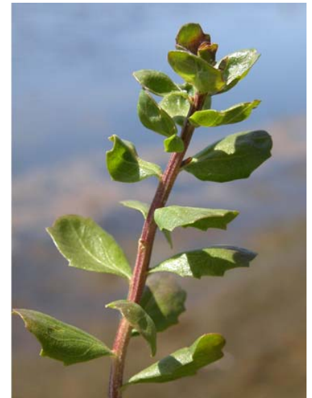
Baccharis pilularis Coyote Bush Native Perennial Asteraceae