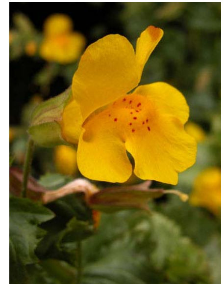
Mimulus guttatus Golden Monkey Flower Native Perennial Scrophulariaceae