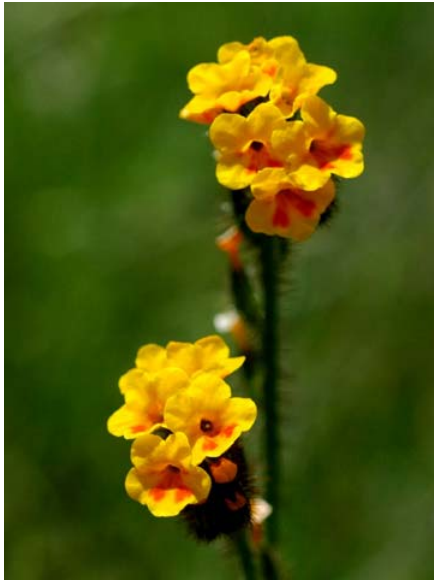
Amsinckia lunaris Bentflower Fiddleneck Native Annual Boraginaceae