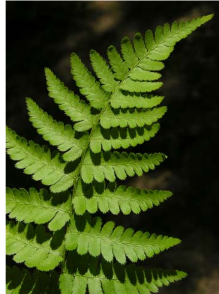
Dryopteris arguta Coastal Wood Fern Native Perennial Dryopteridaceae