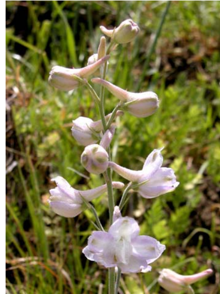
Delphinium hesperium ssp. pallescens Pale Western Larkspur Native Perennial Ranunculaceae