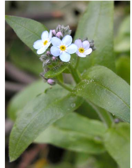
Myosotis latifolia Forget-me-not Introduced Perennial Boraginaceae