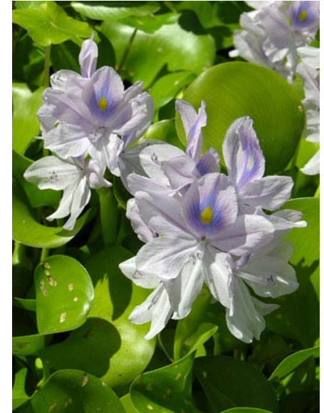
Eichhornia crassipes Water Hyacinth Introduced Perennial Pontederiaceae