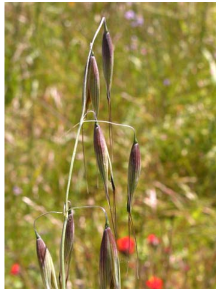
Avena fatua Wild Oat Introduced Annual Poaceae