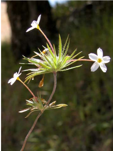
Linanthus androsaceus Pinklobe Linanthus Native Annual Polemoniaceae