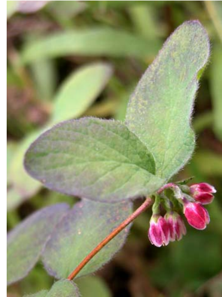
Symphoricarpos mollis Creeping Snowberry Native Perennial Caprifoliaceae