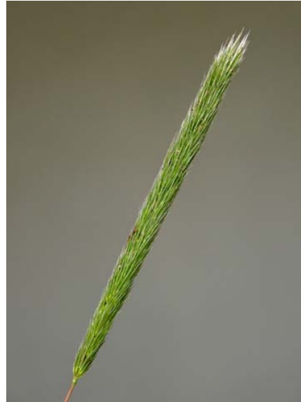
Gastridium ventricosum Nit Grass Introduced Annual Poaceae