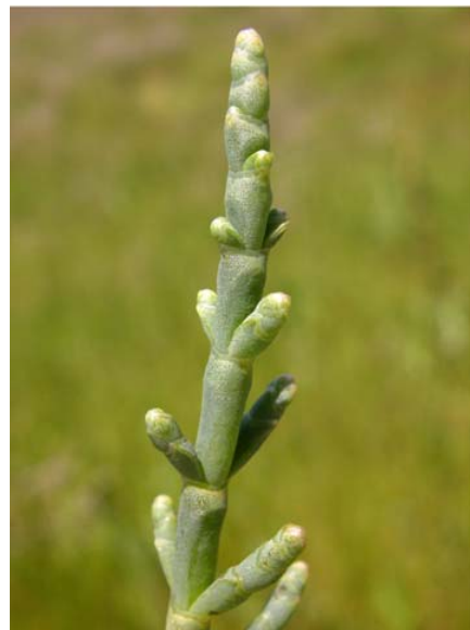
Salicornia virginica Virginia Pickleweed Native Perennial Chenopodiaceae