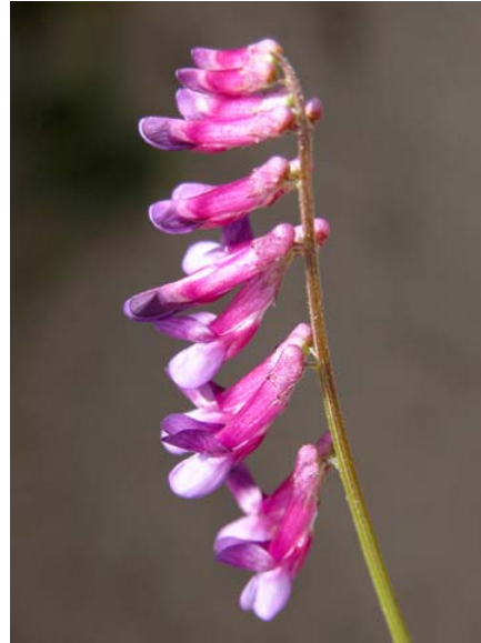
Vicia villosa ssp. varia Winter Vetch Introduced Annual-Biennial Fabaceae