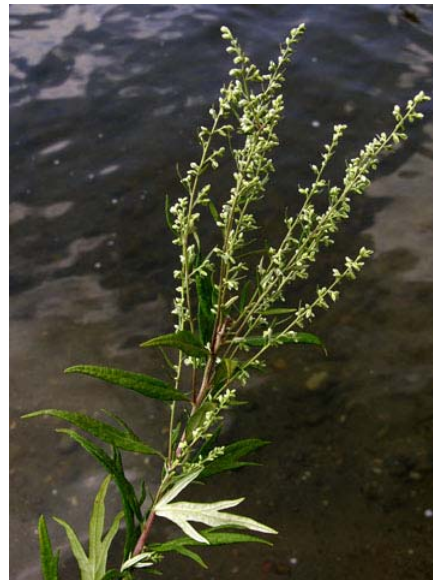
Artemisia douglasiana California Mugwort Native Perennial Asteraceae