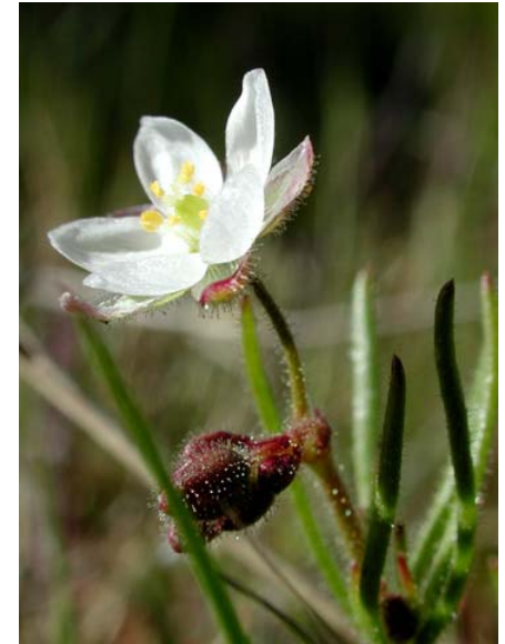
Spergularia arvensis ssp. arvensis Stickwort Introduced Annual Caryophyllaceae