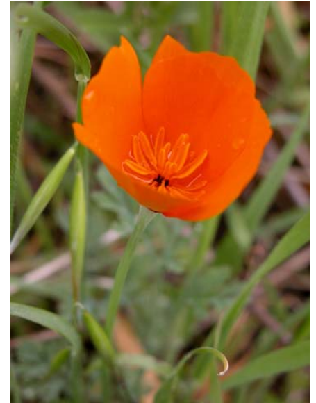
Eschscholzia californica California Poppy Native Perennial Papaveraceae