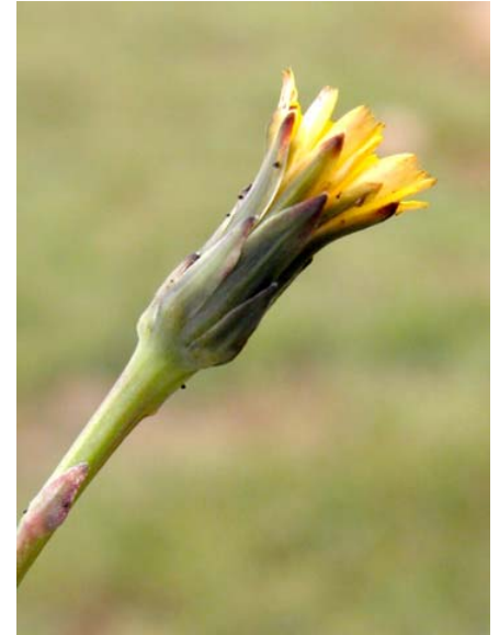
Hypochaeris glabra Smooth Cat's-ear Introduced Annual Asteraceae