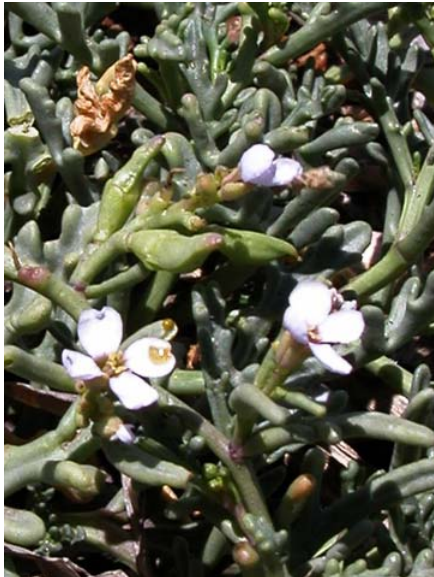
Cakile maritima Horned Sea Rocket Introduced Annual Brassicaceae