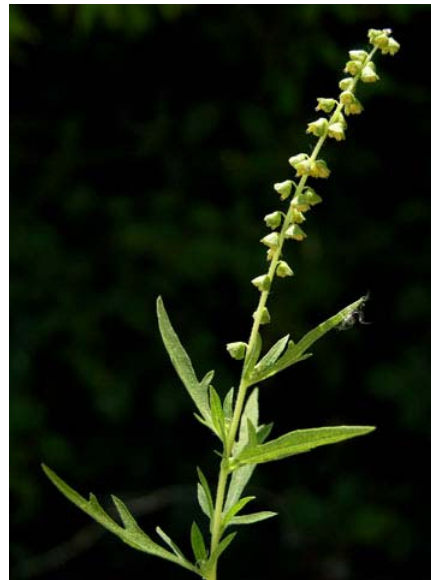
Ambrosia psilostachya Western Ragweed Native Perennial Asteraceae