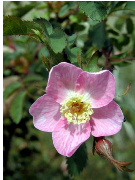
Rosa californica California Wild Rose Native Perennial Rosaceae