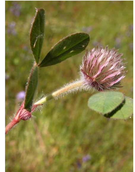
Trifolium hirtum Rose Clover Introduced Annual Fabaceae