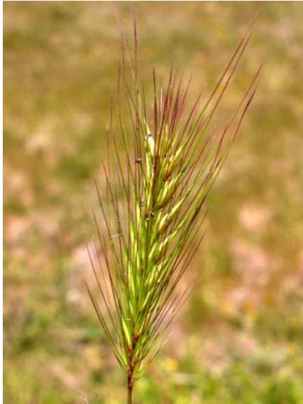
Hordeum marinum ssp. gussoneanum Mediterranean Barley Introduced Annual Poaceae