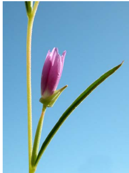
Clarkia affinis Small Clarkia Native Annual Onagraceae