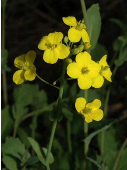
Brassica rapa Yellow Field Mustard Introduced Annual Brassicaceae