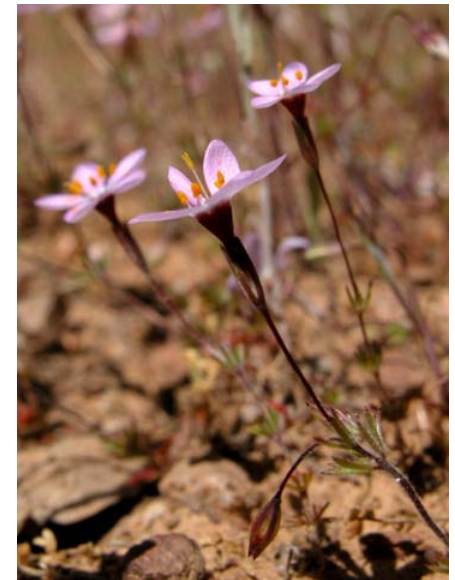
Linanthus ambiguus Serpentine Linanthus Native Annual Polemoniaceae