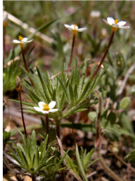
Linanthus bicolor Bicolor Linanthus Native Annual Polemoniaceae