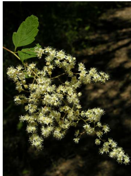
Holodiscus discolor Creambush / Ocean Spray Native Perennial Rosaceae