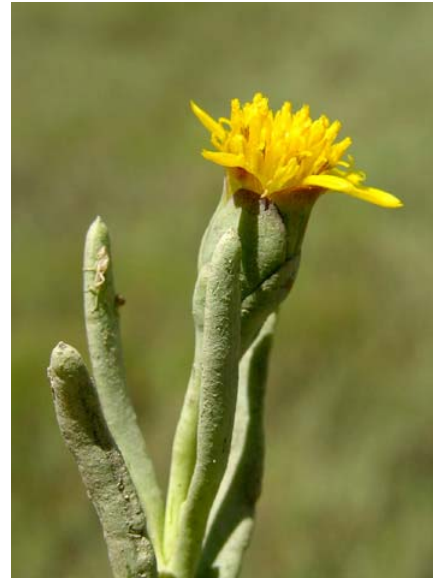
Jaumea carnosa Fleshy Jaumea Native Perennial Asteraceae