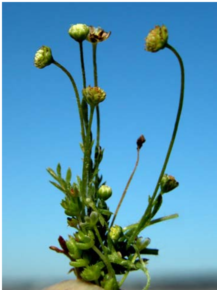
Cotula australis Australian Brass Buttons Introduced Perennial Asteraceae