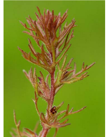
Triphysaria pusilla Dwarf Owl's Clover Native Annual Scrophulariaceae