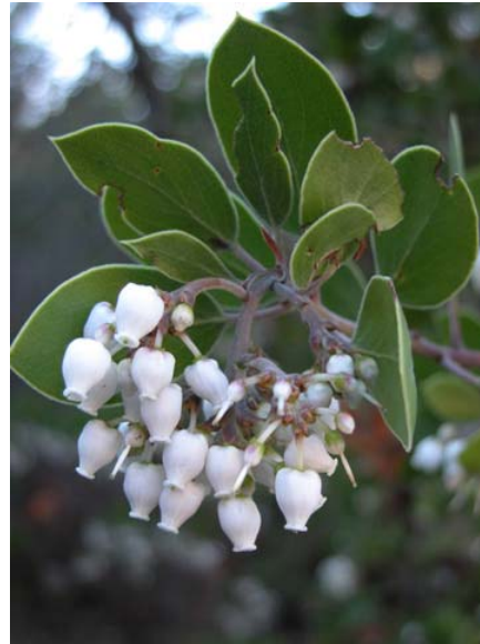
Arctostaphylos manzanita ssp. manzanita Common / Giant Manzanita Native Perennial Ericaceae