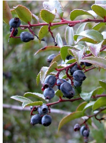
Vaccinium ovatum Evergreen Huckleberry Native Perennial Ericaceae