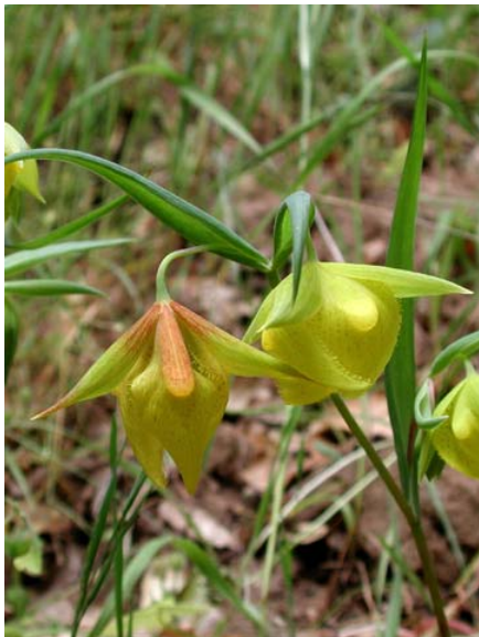
Calochortus pulchellus Mt. Diablo Fairy Lantern Native Perennial Liliaceae