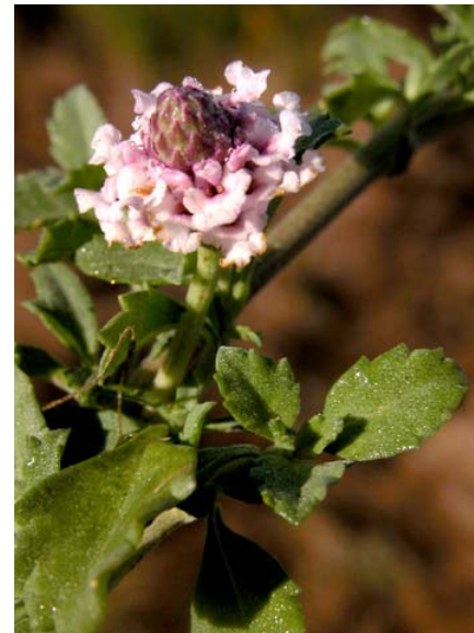
Phyla nodiflora var. nodiflora Lemon Verbena Native Perennial Verbenaceae