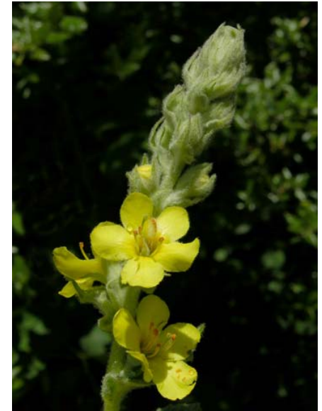
Verbascum thapsus Common Woolly Mullein Introduced Biennial Scrophulariaceae