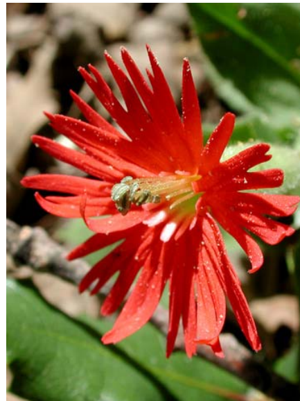
Silene californica Indian Pink Native Perennial Caryophyllaceae