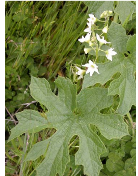
Marah oregonus Oregon / Coast Manroot Native Perennial Cucurbitaceae