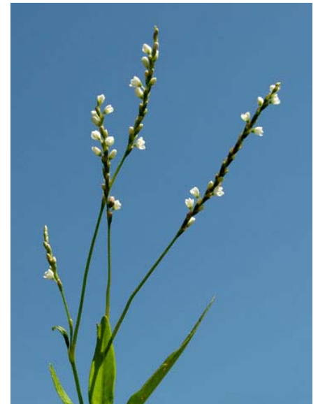
Polygonum hydropiperoides Mild Water Pepper Native Perennial Polygonaceae