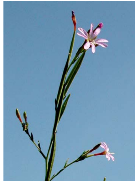
Epilobium brachycarpum Panicled / Weedy Willowherb Native Annual Onagraceae