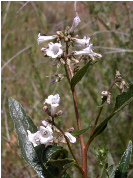
Eriodictyon californicum Yerba Santa Native Perennial Hydrophyllaceae