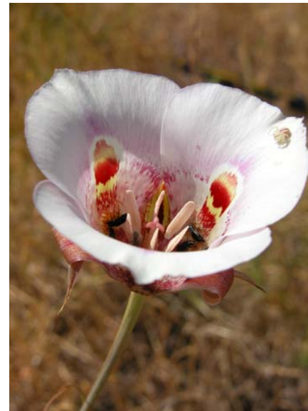
Calochortus venustus White Butterfly Mariposa Lily Native Perennial Liliaceae