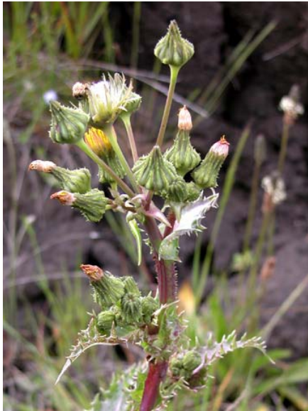
Sonchus asper ssp. asper Prickly Sow Thistle Introduced Annual Asteraceae