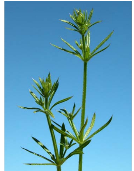
Galium aparine Goosegrass Bedstraw Native Annual Rubiaceae