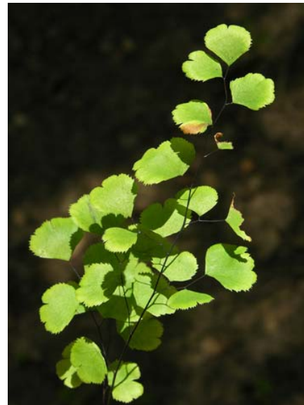
Adiantum jordanii Calif. Maidenhair Fern Native Perennial Pteridaceae