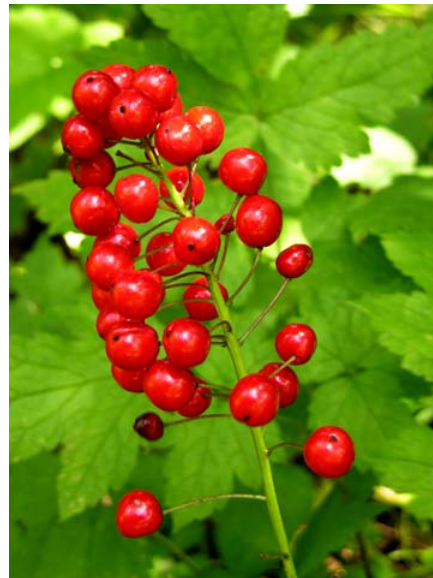
Actaea rubra Baneberry Native Perennial Ranunculaceae