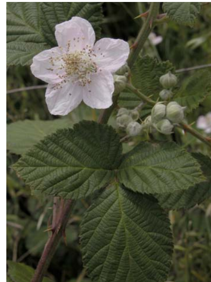
Rubus discolor Himalayan Blackberry Introduced Perennial Rosaceae