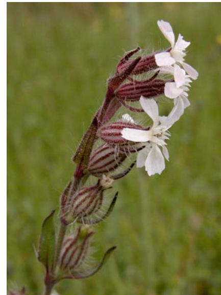
Silene gallica Windmill Pink Introduced Annual Caryophyllaceae