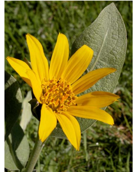
Wyethia helenioides Gray Mule's Ear Native Perennial Asteraceae