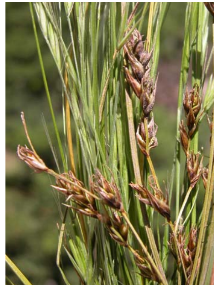
Carex tumulicola Foothill Sedge Native Perennial Cyperaceae