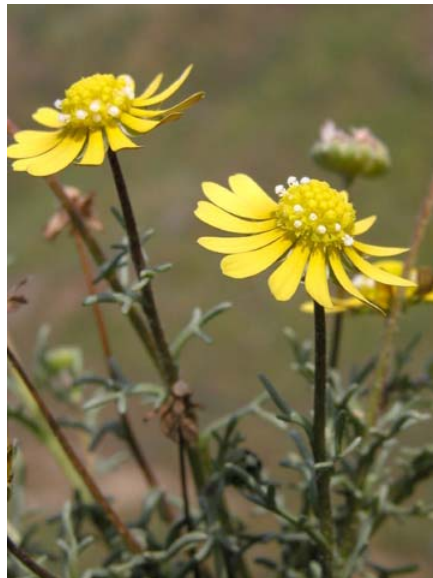
Blennosperma nanum var. nanum Glue-seed Native Annual Asteraceae