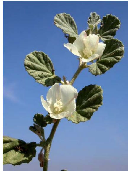
Malvella leprosa Alkali Mallow Native Perennial Malvaceae