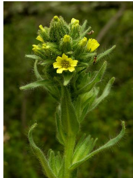
Madia sativa Common / Coast Tarweed Native Annual Asteraceae