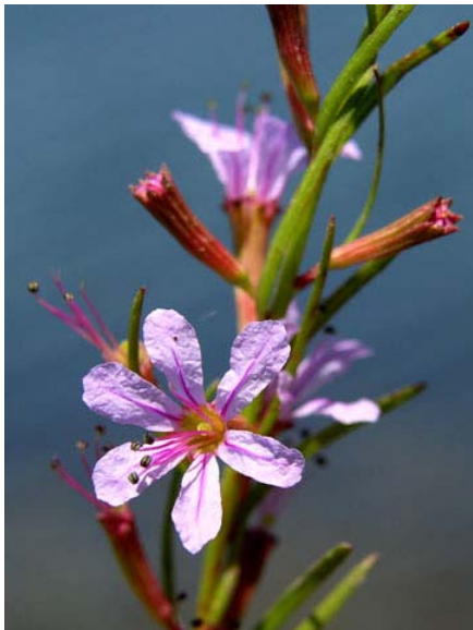
Lythrum californicum California Loosestrife Native Perennial Lythraceae