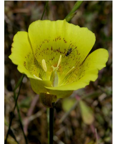
Calochortus luteus Yellow Mariposa Lily Native Perennial Liliaceae