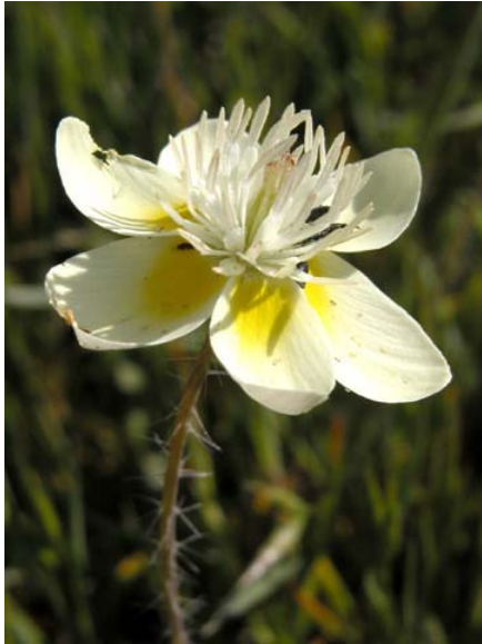
Platystemon californicus Cream Cups Native Annual Papaveraceae