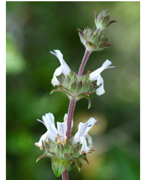
Salvia mellifera Black Sage Native Perennial Lamiaceae