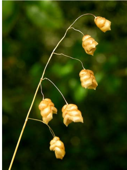
Briza maxima Big Quaking Grass Introduced Annual Poaceae