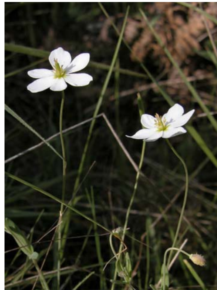
Meconella californica California Meconella Native Annual Papaveraceae