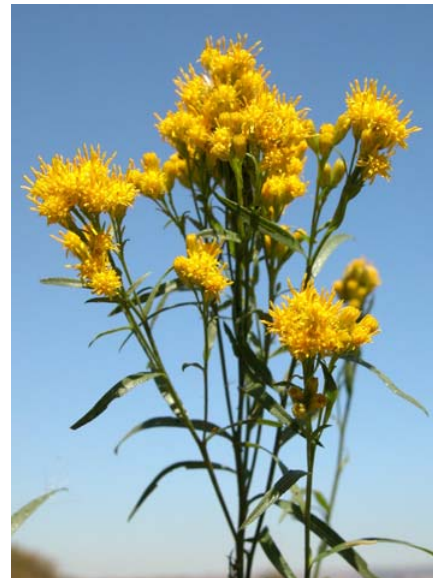
Euthamia occidentalis Western Goldenrod Native Perennial Asteraceae