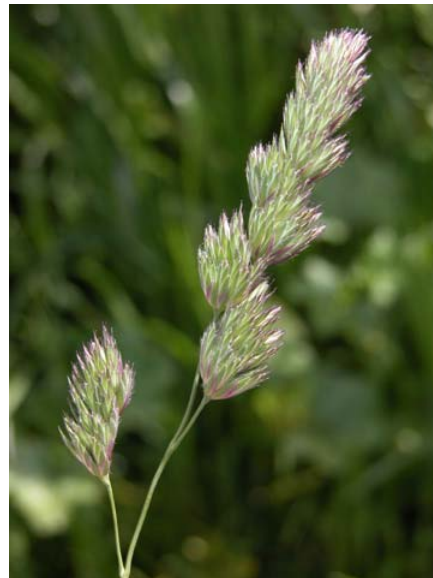
Dactylis glomerata Orchard Grass Introduced Perennial Poaceae