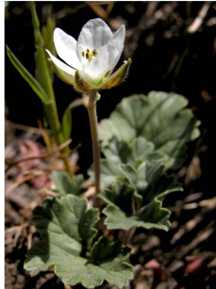
Erodium macrophyllum Large-leaf Filaree Native Annual Geraniaceae