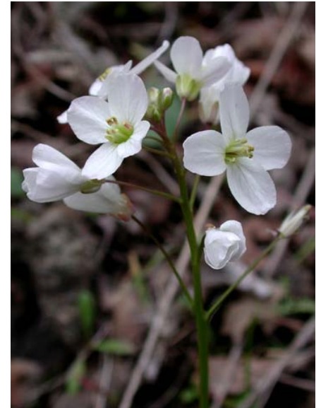
Cardamine californica Milkmaids Native Perennial Brassicaceae