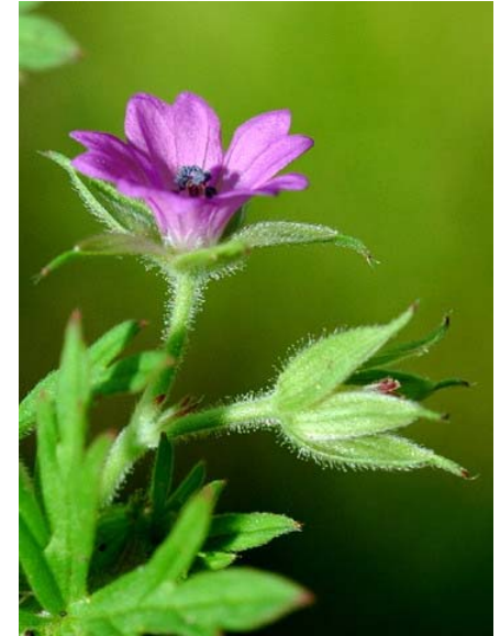
Geranium dissectum Purpletip Cut-leaf Geranium Introduced Annual Geraniaceae