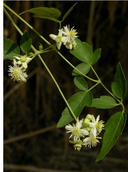
Clematis ligusticifolia Western Virgin's Bower Native Perennial Ranunculaceae