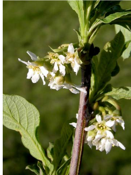
Oemleria cerasiformis Oso Berry Native Perennial Rosaceae