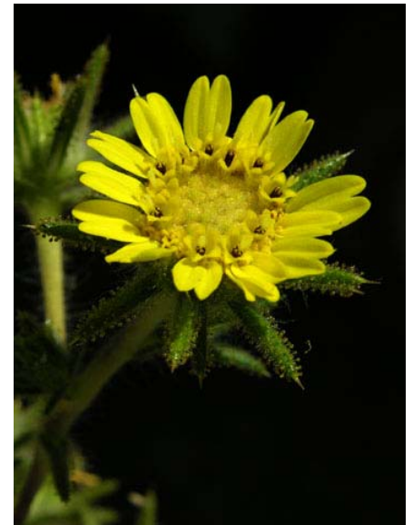
Hemizonia fitchii Fitch Spikeweed Native Perennial Asteraceae