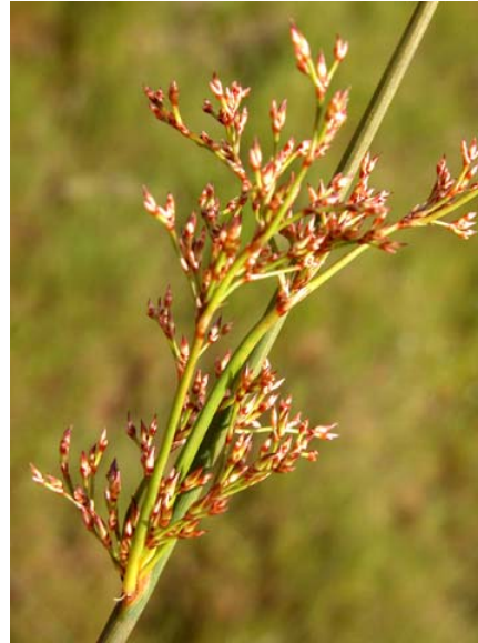
Juncus patens Spreading Rush Native Perennial Juncaceae