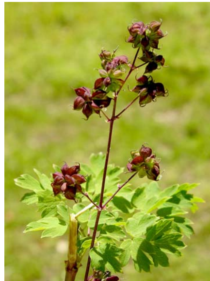
Thalictrum fendleri var. polycarpum Foothill Meadow Rue Native Perennial Ranunculaceae