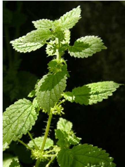
Urtica urens Dwarf Stinging Nettle Introduced Annual Urticaceae