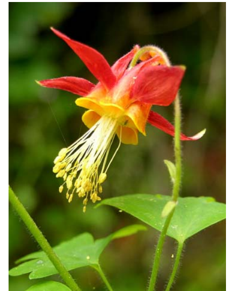
Aquilegia formosa Red / Crimson Columbine Native Perennial Ranunculaceae