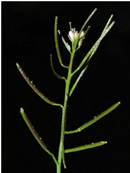
Cardamine oligosperma Western Bitter Cress Native Annual Brassicaceae