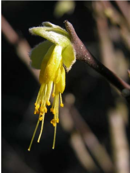
Dirca occidentalis Western Leatherwood Native Perennial Thymelaeaceae