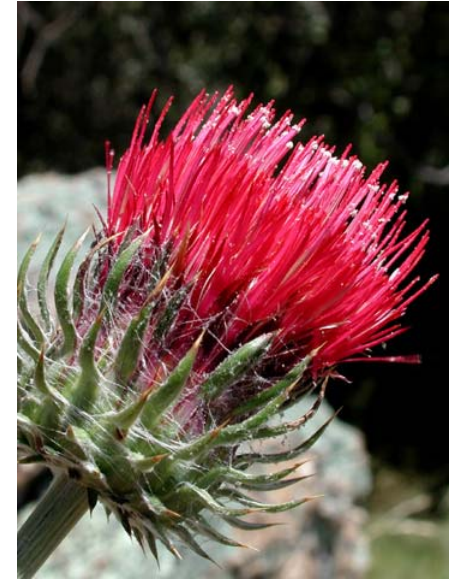
Cirsium occidentale var. venustum Venus / Cobweb Thistle Native Biennial Asteraceae