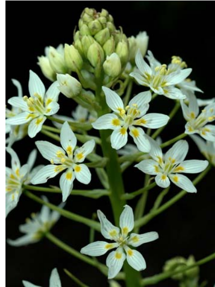
Zigadenus fremontii Common Star Lily Native Perennial Liliaceae