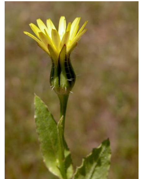
Urospermum picroides Urospermum Introduced Annual-Perennial Asteraceae