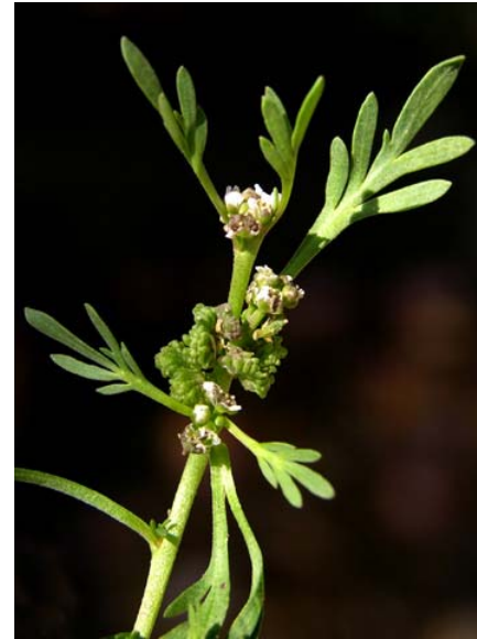
Coronopus squamatus Swine Cress Introduced Annual Brassicaceae