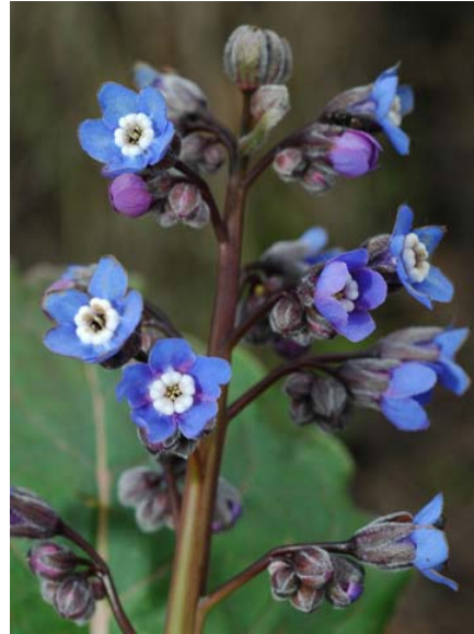
Cynoglossum grande Large Hound's Tongue Native Perennial Boraginaceae