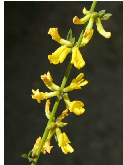
Lotus scoparius var. scoparius Deerweed Native Perennial Fabaceae