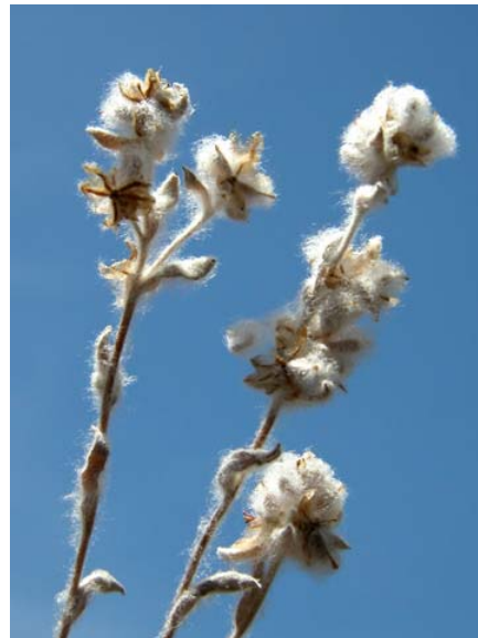
Micropus californicus var. californicus Slender Cottonweed Native Annual Asteraceae