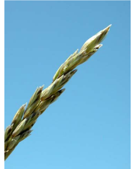
Poa secunda ssp. secunda One-side Blue Grass Native Perennial Poaceae