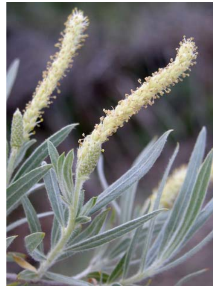
Salix exigua Narrowleaf Willow Native Perennial Salicaceae