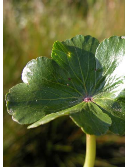
Hydrocotyle ranunculoides Water Pennywort Native Perennial Apiaceae