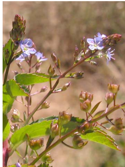
Veronica americana American Brooklime Speedwell Native Perennial Scrophulariaceae