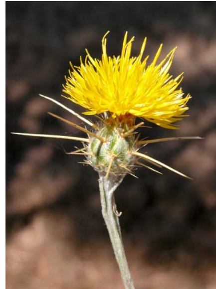
Centaurea solstitialis Yellow Star Thistle Introduced Annual Asteraceae