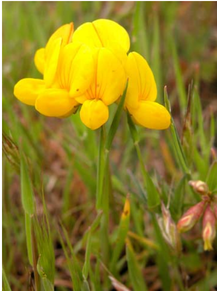
Lotus corniculatus Bird's-foot Deerweed Introduced Perennial Fabaceae