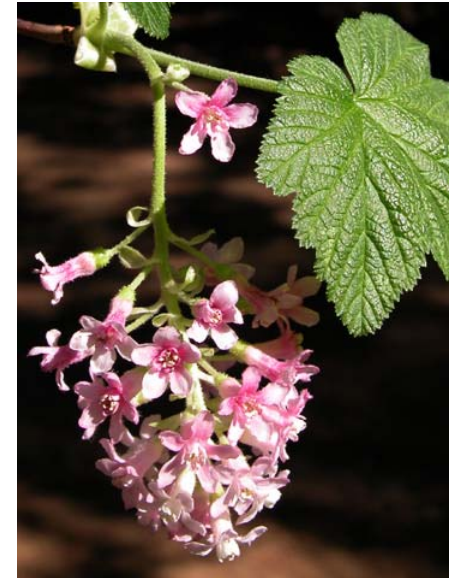
Ribes sanguineum var. glutinosum Flowering/Pinkflower Currant Native Perennial Grossulariaceae