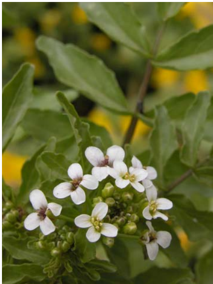
Rorippa nasturtium-aquaticum White Water Cress Native Perennial Brassicaceae