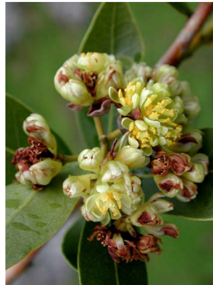
Umbellularia californica California Bay Laurel Native Perennial Lauraceae