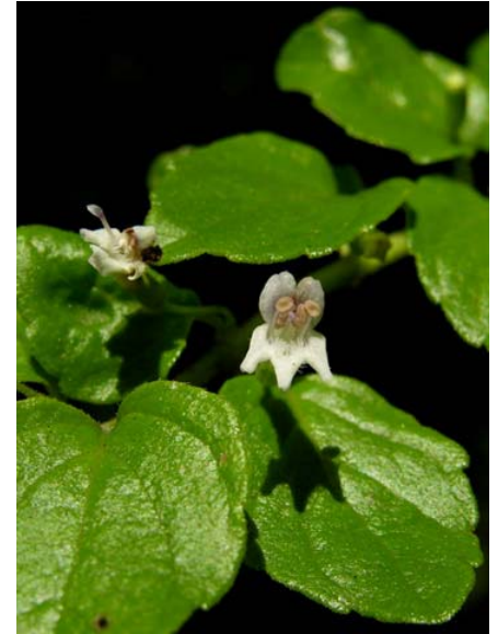
Satureja douglasii Yerba Buena Native Perennial Lamiaceae