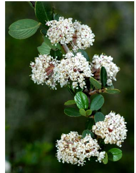
Ceanothus cuneatus var. cuneatus Buckbrush Native Perennial Rhamnaceae