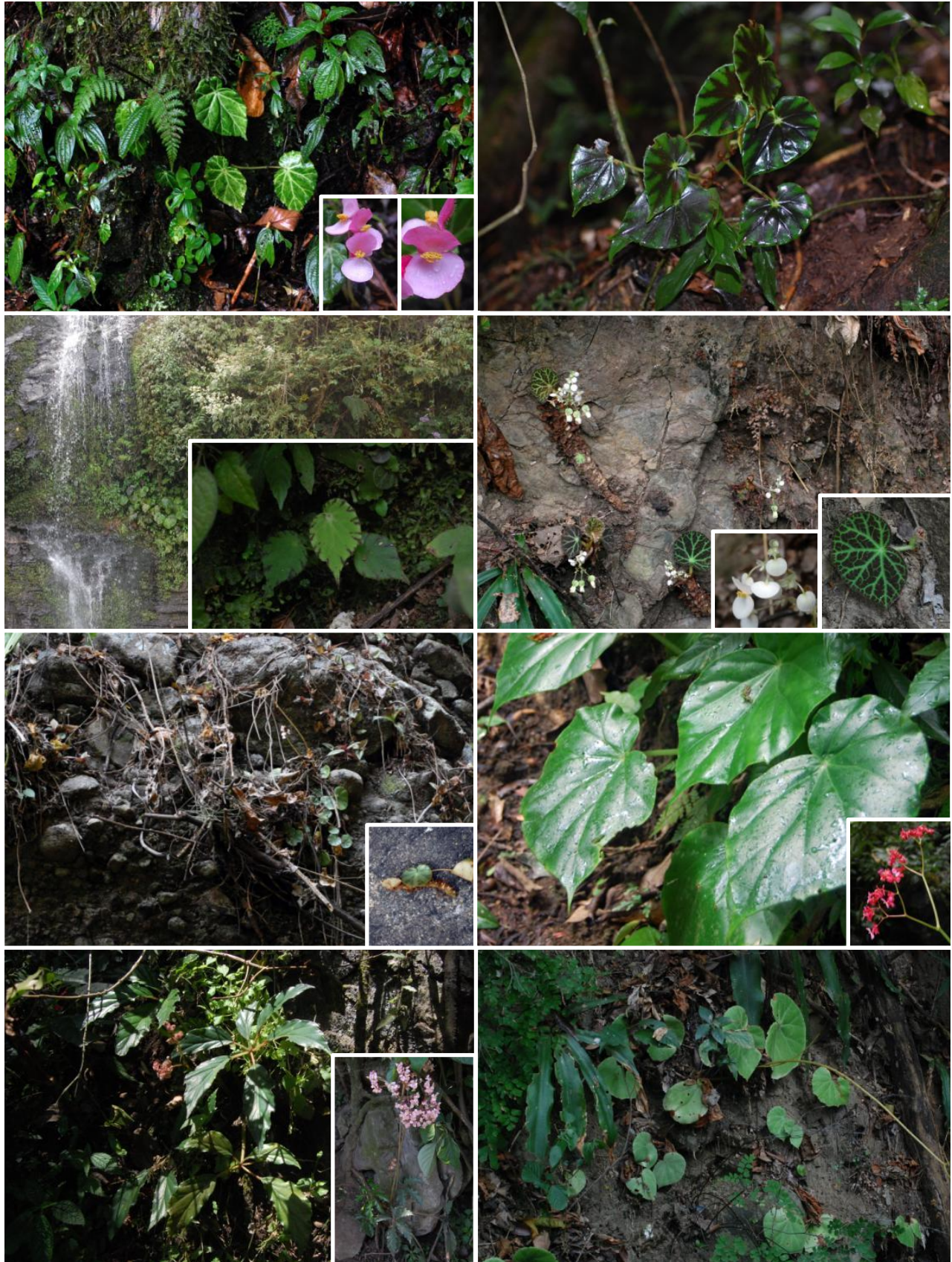
Plate 3: Narrow endemic Begonia species