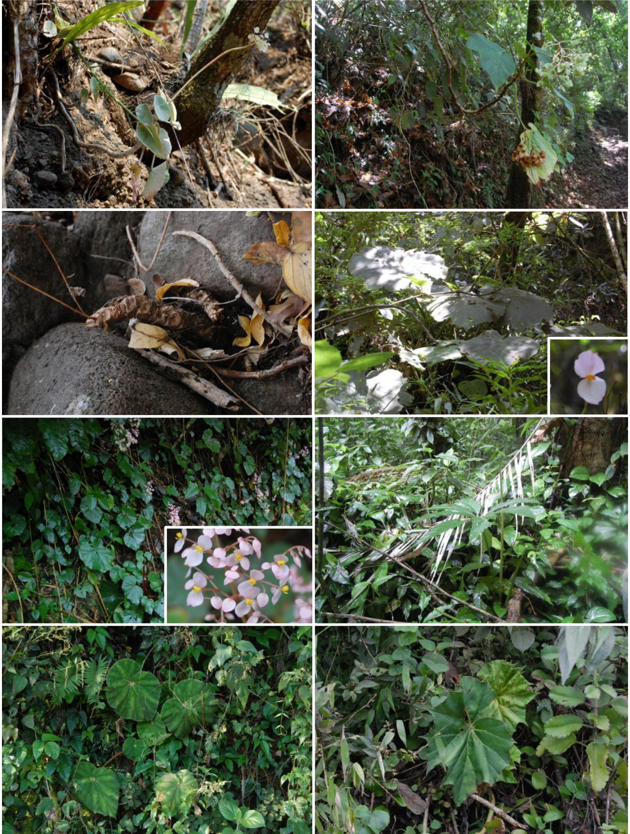
Plate 2: Widespread Begonia species