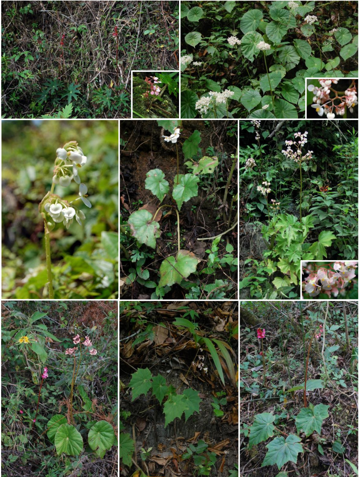
Plate 5: Begonia hybrids observed in the field