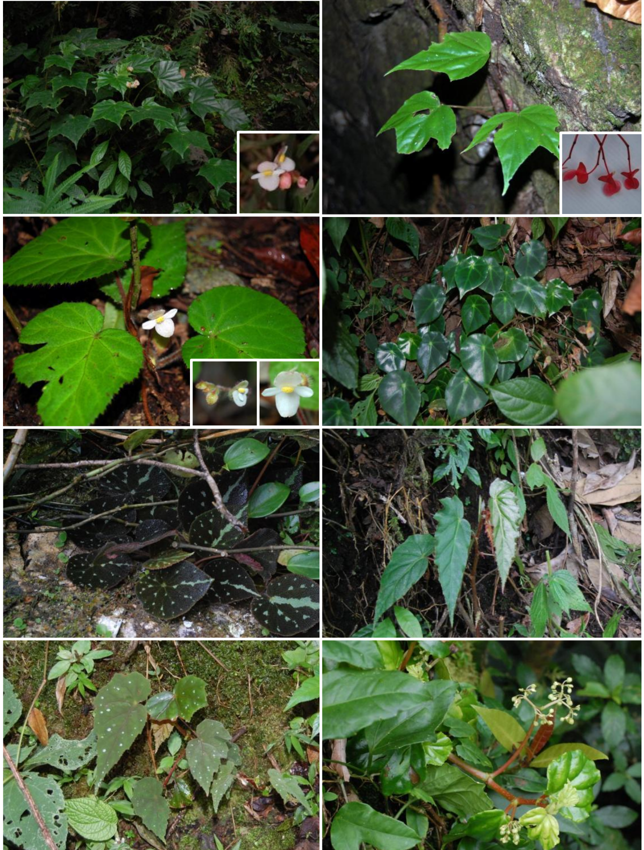
Plate 4: Begonias of section Weilbachia , Knesbeckia , Quadriperigonia and Wagneria