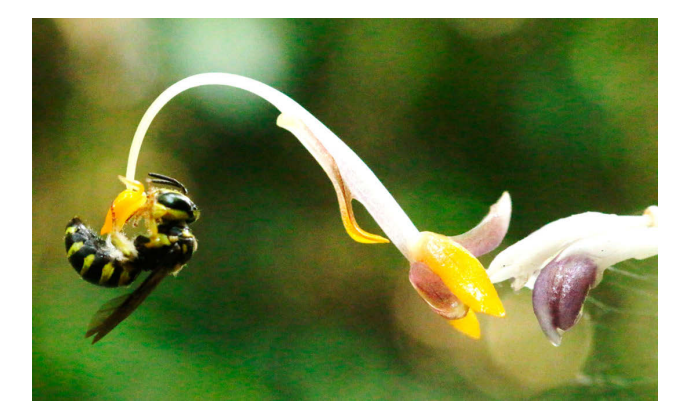
Fig. 3. Small carpenter bee, Ceratina ridleyi Cockerell, the pollinator of Globba leucantha Miq. (Zingiberaceae).

Birds and bees carry pollen of Zingiberaceae in similar ways. Birds collect pollen on their beaks while sucking nectar from flowers, with the pollen attaching to the base of the bill and/or just above on the feathers of the forehead. The pollinating birds in Asia are honeyeaters in the case of Hornstedtia scottiana (Ippolito & Armstrong, 1993), sunbird Anthreptes malacensis (Scopoli) for Etlingera elatior (Classen, 1987) and spiderhunters for Plagiostachys stro bilifera (Baker) Ridl.