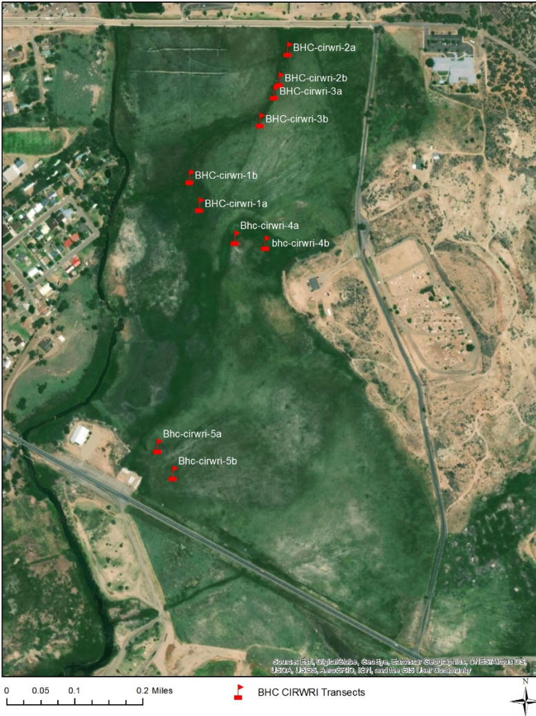
Figure 3. Location of Cirsium wrightii monitoring transects on Blue Hole Ciénega in Santa Rosa, NM.

October / November 2019: Retreatment (cut & herbicide Russian olive, tamarisk, and Siberian elm)