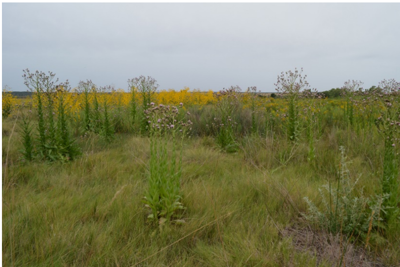
Figure 2. Habitat of Cirsium wrightii at Blue Hole Ciénega in Santa Rosa, NM ( Helianthus paradoxus in the background).

Cirsium wrightii is found in wet, alkaline springs, seeps, and marshy edges of streams and ponds between 3,450 and 8,500 ft (NMRPTC 1999). It is found in Eddy, Chavez, Guadalupe, Otero, Sierra, and Socorro countries in New Mexico. In the Santa Rosa wetland complex plants occur scattered within an assortment of marshes, spring seeps, streams, and along the margins of various sinkhole lakes (USFWS 2015; Figure 2).