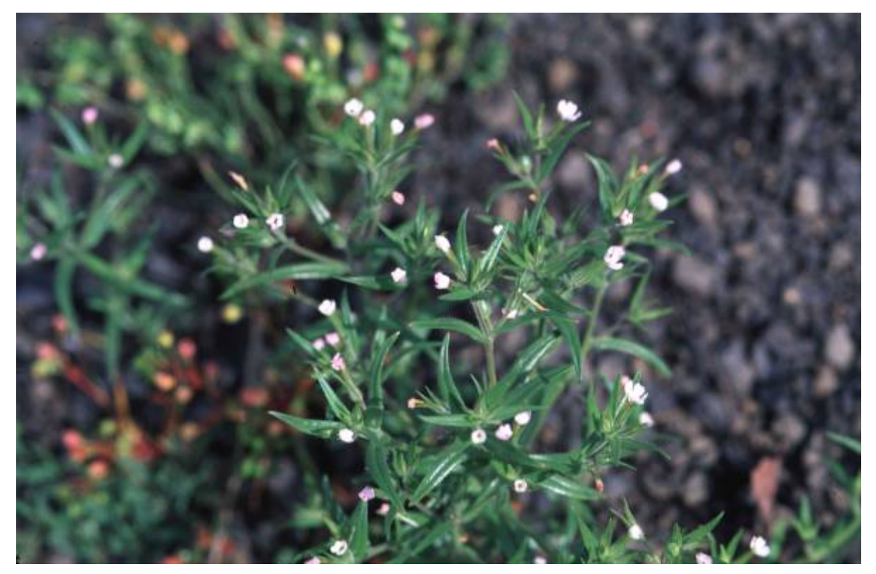
Figure 3. Slender collomia (Photo by James L. Reveal).