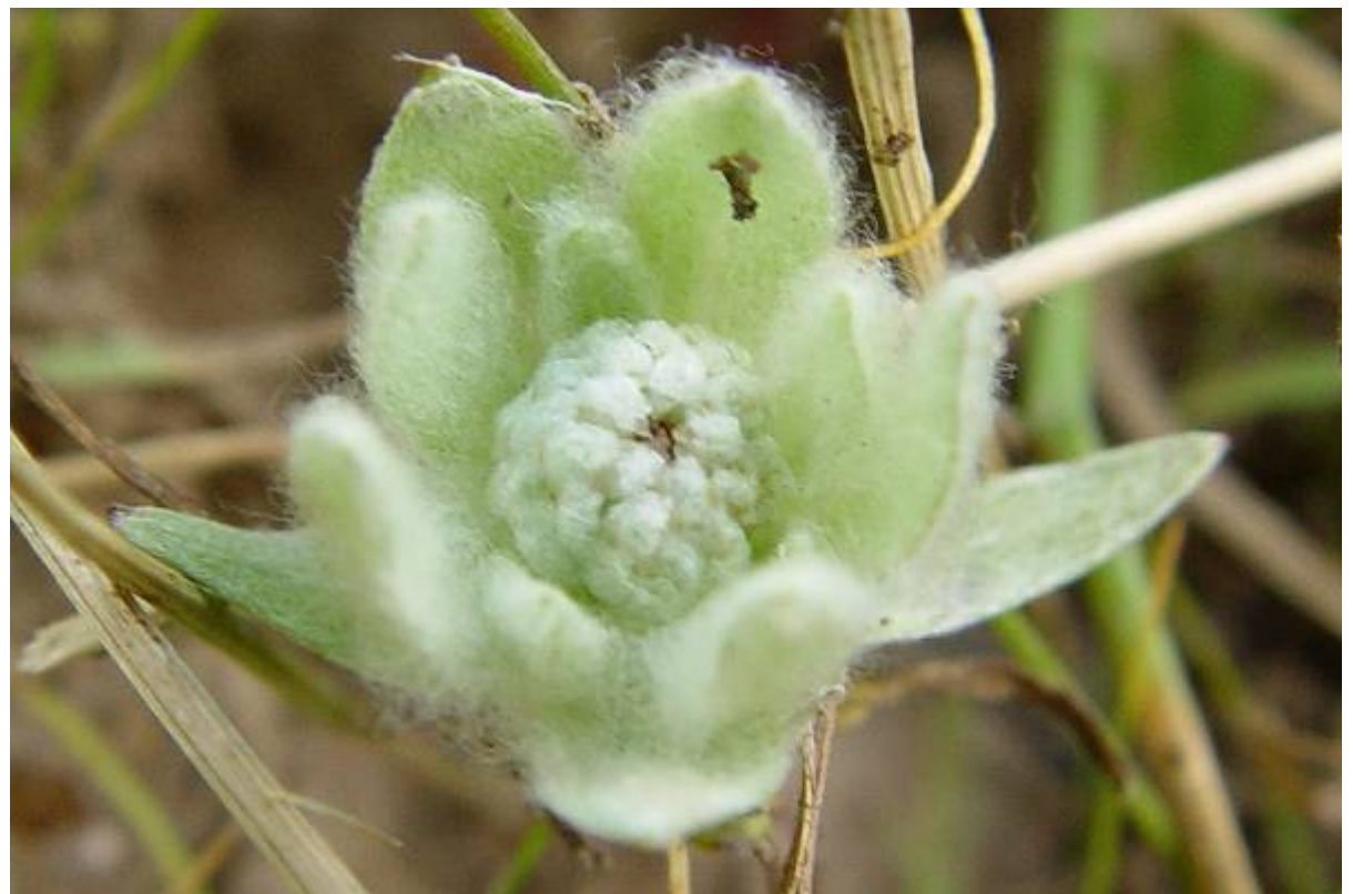
Figure 2. Dwarf woolly-heads.