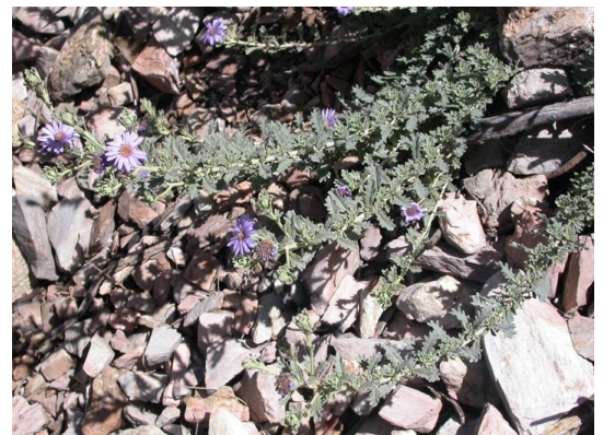
Marble Daisy-bush ( Olearia astroloba )

Persistence of the sole population at Marble Gully is critical to the survival of this species.