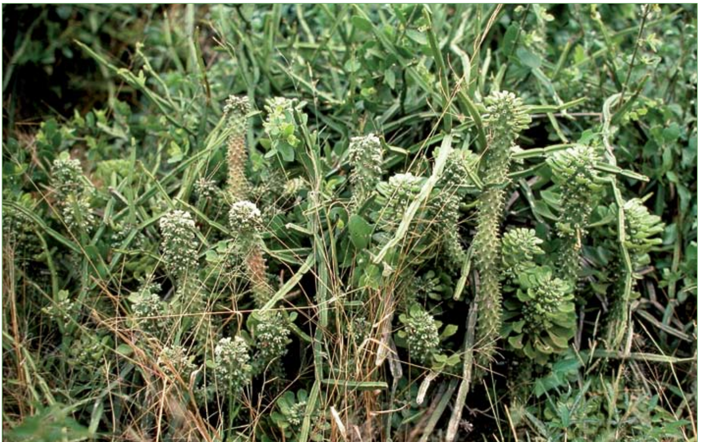
Fig. 8: Monadenium schubei in the undergrowth of open woodland.

Progressing northwards amongst the low hills along the eastern shore of Lake Tanganyika, Euphorbia grantii