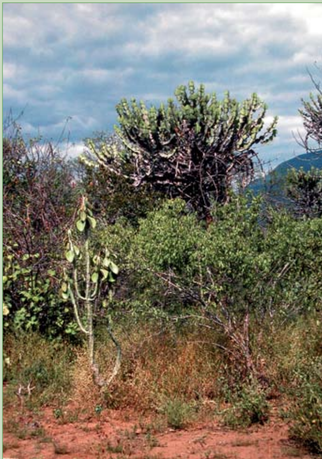
Fig. 6: Euphorbia cooperi var. ussanguensis and a young plant of Monadenium arborescens in a sheltered valley.