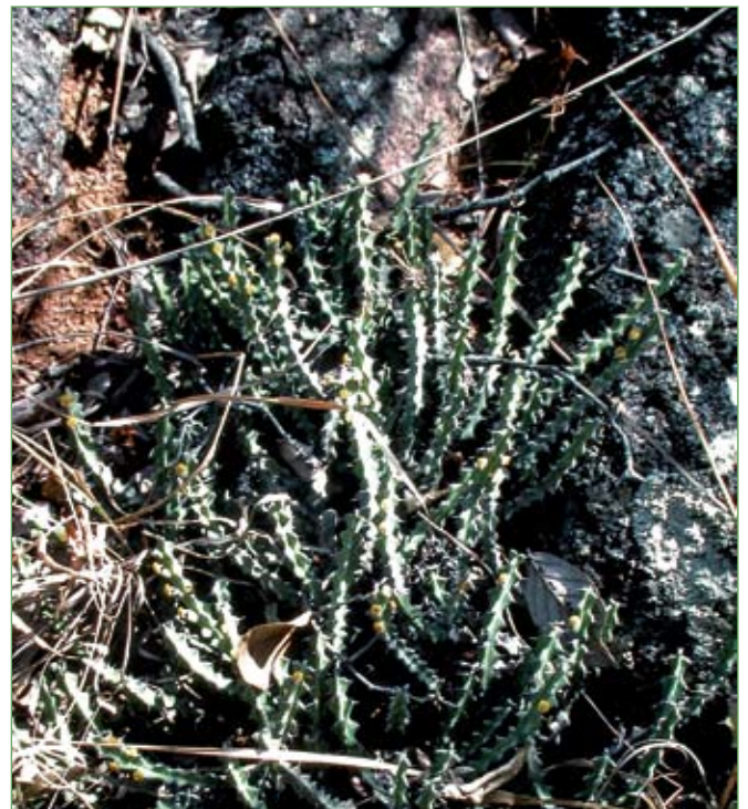
Fig. 10: Euphorbia tetraanthoides on rocky slopes.

are corners where the plants that interest us so much are waiting to be discovered! ♦