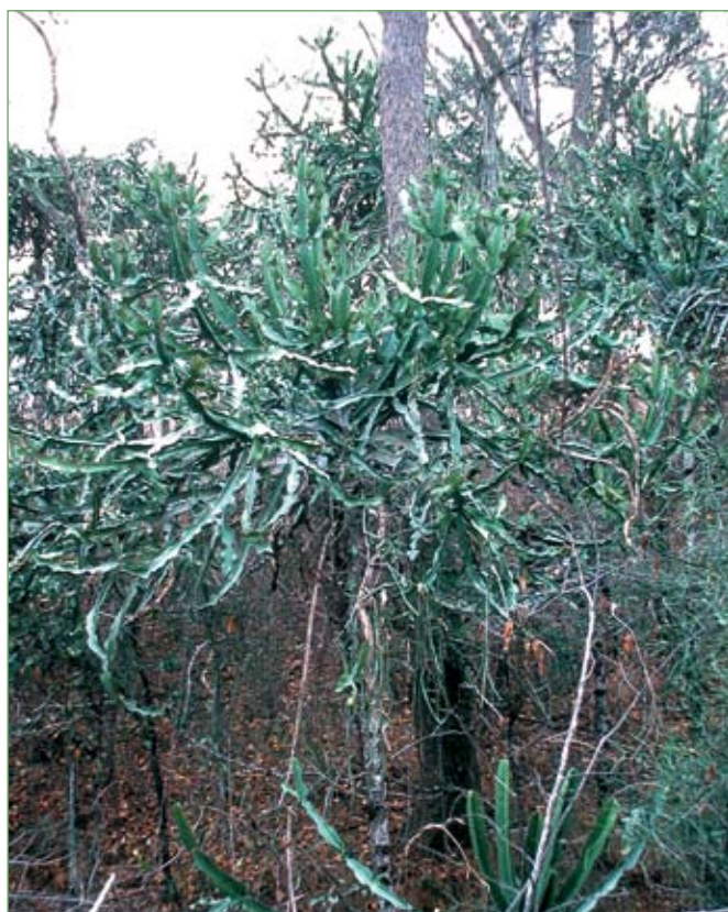
Fig. 3: Euphorbia nyikae in bushland near the coast.

But it is here that no less than 6 very distinct Monadenium species occur, 4 of them endemic to the region. One of these, growing on steeply sloping hillsides, is M. elegans S.Carter, a small woody tree to 3.5 m high, with a lovely, purplish brown flaking bark. Pretty bright green leaves, with undulating toothed margins