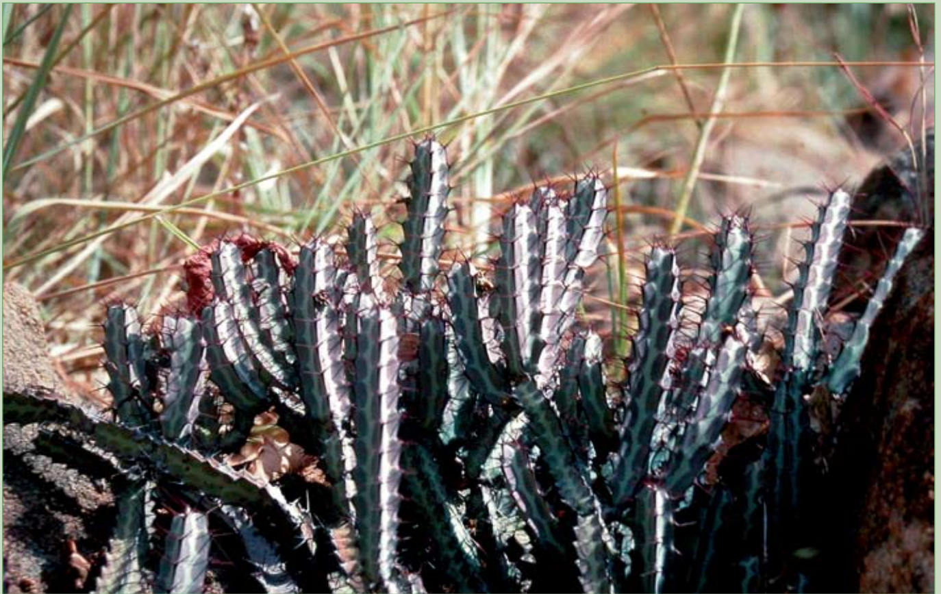
Fig. 5: Euphorbia greenwayi at the foot of rocky slopes.