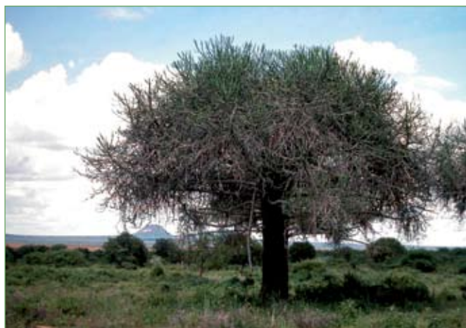
Fig. 1: Euphorbia robecchii in very open bushland.

Moving southeastwards along the border with Kenya, past snow-capped Kilimanjaro, we come to a short range of beautiful hills across the northeast corner of the country, the Pares and the Usambaras. Being so near the coast this region has been well explored, yielding a number of well-known species. At the northern end is a thriving (in 1990) population of Euphorbia robecchii Pax at its southernmost point of distribution, with spiny seedlings and young plants, but mature trees, with their characteristic widely spreading branches producing branchlets that are without spines. Along the foot of the hills we find E. heterochroma Pax, growing in open bushland on deep sandy soils. This 2 m high shrub is easily recognised, as its name suggests, by the regular darker green patches along its 2 cm wide square stems. It was one of the first species to be described when this