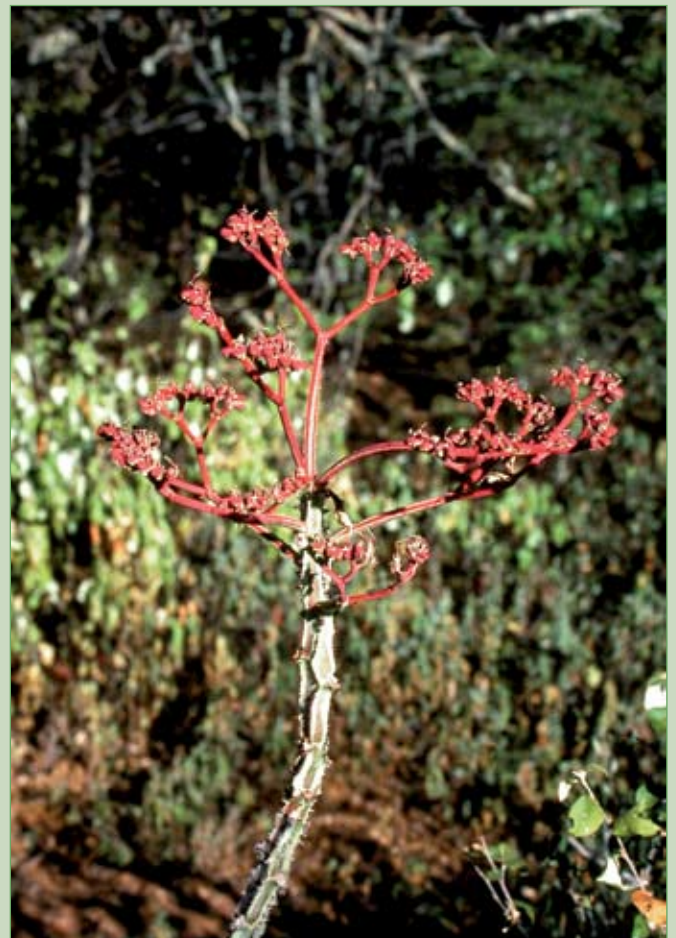
Fig. 7: Monadenium magnificum in open woodland.