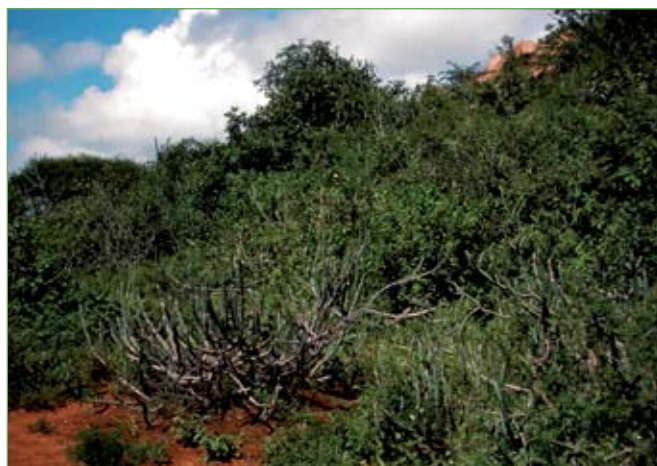
Fig. 2: Euphorbia heterochroma in deep sandy soil.