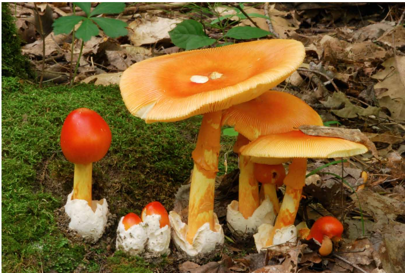
Fig. 1. Amanita jacksonii from a population in the province of Québec (Canada).

other Amanita genomes have been recently sequenced, A. brunnescens , A. polypyramis , and A. inopinata , with the aim of assessing the dynamics of transposable elements in EM and asymbiotic species within the genus (Hess et al. 2014). Amanita muscaria has also been used as a model for understanding the biosynthetic pathways of betalain pigments, which are commercially used to dye food and shown to have antioxidant properties (Hinz et al. 1997, Strack et al. 2003).