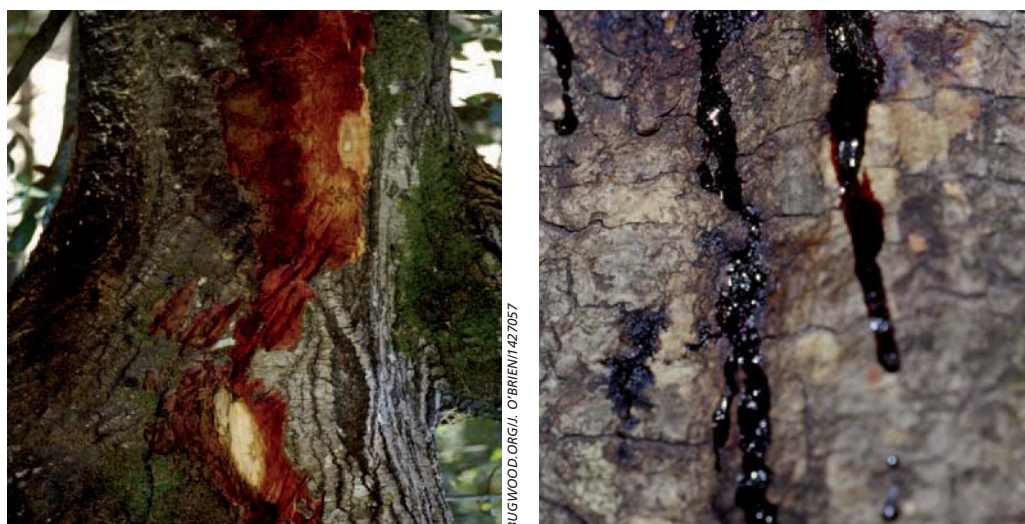
Cankers and bleeding on coast live oak ( Quercus agrifolia ) resulting from Phytophthora ramorum infection

Phytophthora ramorum S. Werres, A.W.A.M. de Cock & W.A. Man in't Veld causes a very serious disease called sudden oak death which causes extensive mortality of tanoak and oaks. It is also associated with disease on ornamental plants and other broadleaf and conifer trees. This pathogen has been a significant problem in North American and European forests and nurseries.