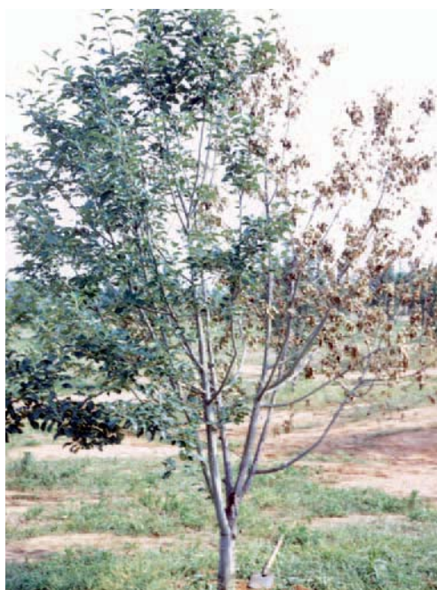
Crown thinning and dieback in American sycamore ( Platanus occidentalis ) and apple ( Malus sp. ) caused by Botryosphaeria dothidea infection