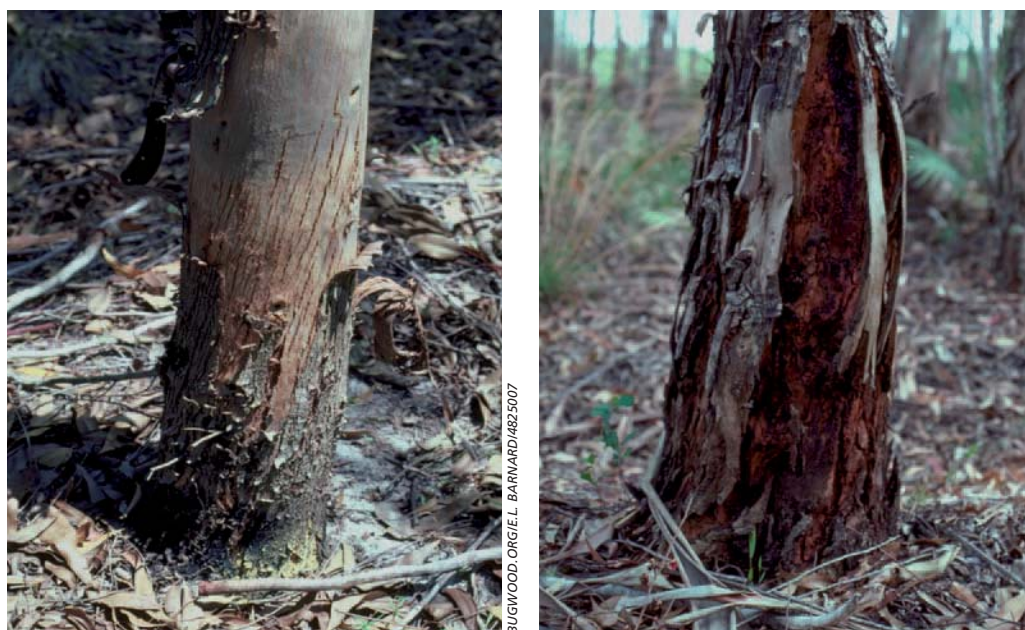
Symptoms and damage caused by Chrysoporthe cubensis on Eucalyptus grandis : bark fissures at the base of infected tree (L) and advanced canker development (R)

Chrysoporthe cubensis infects trees through wounds, particularly at the bases of young trees. The most common method of infection is believed to be through asexual spores that are dispersed by rain splash although wind disseminated sexual spores are also common (TPCP, 2002b). Infection is favoured by warm temperatures and rainfall (Myburg, Wingfield and Wingfield, 1999). Lesions expand more rapidly in plants that are well-watered than in those where the soil or climate is relatively dry (Sinclair and Lyon, 2005).