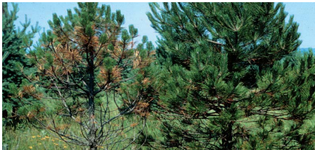
Symptoms of Mycosphaerella pini infection on Pinus nigra

Mycosphaerella pini is a fungus that infects and kills the needles of many Pinus spp. resulting in premature loss of needles and significant defoliation. Damage by Mycosphaerella pini has significant impacts on commercial forests, Christmas tree plantations and nurseries. This pathogen can spread rapidly when environmental conditions, mild climate with high rainfall or frequent fog or mist, favour infection.