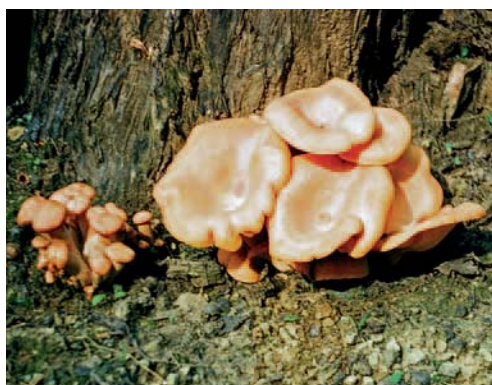
Armillaria mellea fruiting bodies