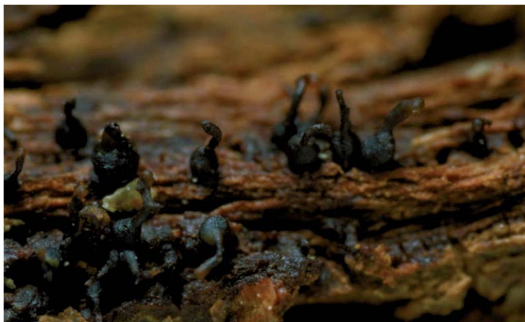
Fruiting bodies of Chrysoporthe cubensis: perithecia embedded in and protruding from bark removed from cankered tissues of Eucalyptus grandis

Chrysoporthe cubensis (Bruner) Gryzenhout & M.J. Wingfield, previously named Cryphonectria cubensis (Bruner) Hodges, is a widespread fungus well known for the canker disease it causes, particularly in Eucalyptus spp. The cankers result in limb and trunk breakages, stunted and distorted growth, and often mortality. This is a very important disease in eucalypt plantations as it is known to kill significant numbers of trees, particularly those in young plantations, and as a result it is a major constraint to the successful establishment of eucalypt plantations.