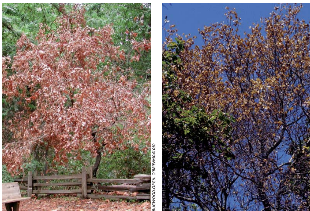
Symptoms of Phytophthora ramorum infection on tanoak (Lithocarpus densiflorus) and coast live oak (Quercus agrifolia)

Branch cankers also occur, especially on tanoak. On tanoak, infection of terminal twigs can lead to tip dieback, leaf flagging or the formation of shepherd's crooks (Kliejunas, 2001). Exudations do not always develop on tanoak, especially on smaller diameter branches. Infected host trees die relatively quickly once crown symptoms develop although the severity of damage varies considerably between sites. On other hosts, infection typically results in leaf lesions, small branch cankers, and stem and branch dieback (Kliejunas, 2001).