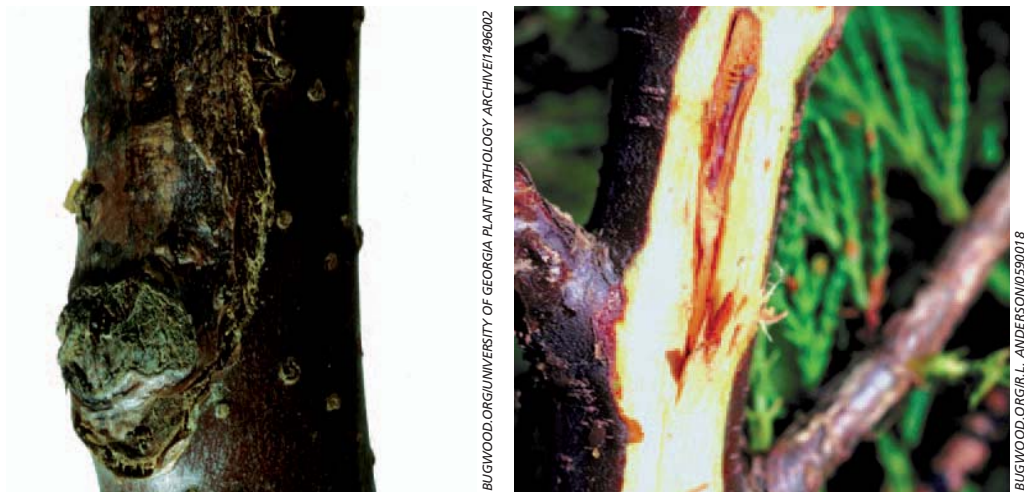
Cankers caused by Botryosphaeria dothidea on apple ( Malus sp. ) (L) and Leyland cypress ( X Cupressocyparis leylandii ) with bark removed (R)

Botryosphaeria dothidea (Moug.) Ces. & De Not. (1863) is known in many parts of the world and is commonly associated with cankers and dieback on hundreds of different woody plants, including eucalypts. Eucalypt species are planted around the world which makes this species a major concern to the forest sector. This pathogen is an opportunistic pathogen that attacks stressed trees. The entire taxonomy of the genus Botryosphaeria has undergone changes in the last few years (see Crous et al. , 2006 for more information). This species was previously considered synonymous with Botryosphaeria ribis , so literature on both species is inextricably intertwined, but these are now considered two distinct species.