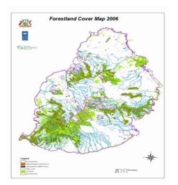
Fig.1 - Forest Cover in Mauritius

Due to its limited land resources and increasing population, Mauritius is and will always be a net importer of timber. Consequently, timber exploitation will be gradually phased out in line with the National Forest Policy (2006). Emphasis in forest management is now on increasing the size of the forest estate, resource conservation, watershed protection, forest ecosystem and biodiversity conservation and replacement of harmful invasive alien species by native species. Non-consumptive use of forest resources is favoured through leisure, recreational and ecotourism activities.