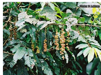
leafy branch with inflorescences