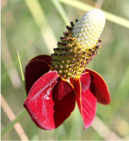
Prairie coneflower Ratibida columnifera (Sunflower family) native

These are more often yellow than red, but this is stunning. Native Americans used coneflowers as a snakebite remedy and used the leaves and flowers for tea.