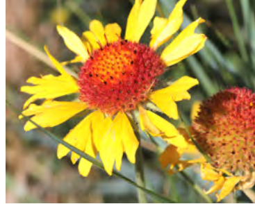
Blanket flower Gaillardia aristata (Sunflower family) native

These are more often yellow than red, but this is stunning. Native Americans used coneflowers as a snakebite remedy and used the leaves and flowers for tea.