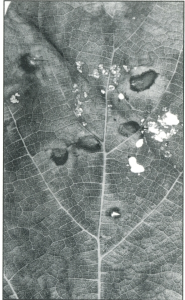
Figure 2. Leaf undersurface of black mulberry with dry circular leaf spots and white conidial masses. DPI File No. 88281, Jeffrey Lotz.