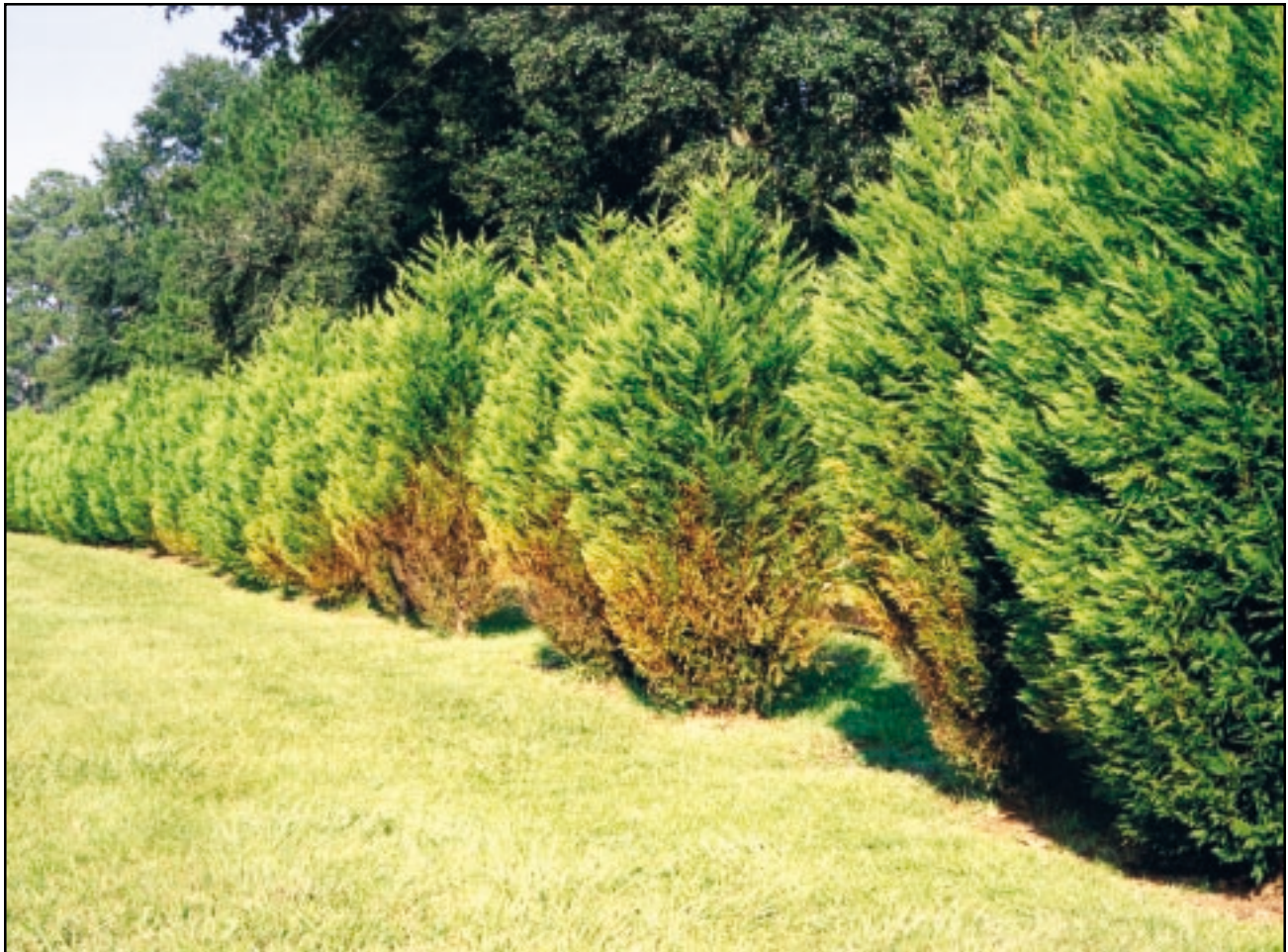
Fig. 4. Hedgerow of Leyland cypress exhibiting rusty brown necrosis of the lower canopy associated with Cercosporidium blight.

SURVEY AND DETECTION: Blighted needles on lower twigs and branches and a rusty brown necrosis throughout the lower canopy are suspect symptoms of Cercosporidium blight on older containerized plants or established landscape specimens. Young infected plants and cuttings may be completely blighted or killed. Using a hand lens will help determine if a fungus is present on blighted tissue. Observing greyish-brown tufts of fungal mycelium may indicate the presence of Cercosporidium sequoiae .