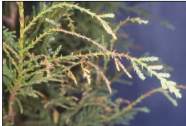
Fig. 3. Patchy necrosis of infected Leyland cypress twigs. Note the green tips of infect twigs - a common symptom of Cercosporidium blight.

SYMPTOMS: Symptoms of Cercosporidium blight can be observed initially on the infected needles of lower twigs and branches closest to the main stem (Fig. 3). Blighted needles and young twigs develop a rusty brown necrosis that may appear patchy throughout the lower canopy (Fig. 4). As infection continues, this disease generally spreads upward and outward on susceptible plant tissue. On severely infected plants, only the tips of branches may remain green. Infected seedlings and young plants may be killed (Sutton and Hodges 1990). Disease development is favored by warm, humid, wet weather or by overhead irrigation in nursery and greenhouse settings. In Florida, infections may remain active all year long. Conidia of Cercosporidium sequoiae may be spread naturally by wind and water splash. Movement of inoculum to susceptible plants within a nursery may also occur by way of contaminated clothing, equipment, resident pets, or birds.