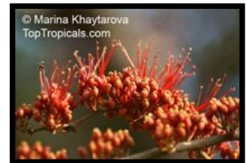
Barnebydendron riedelii

Guacamayo, guaribeiro, monkey fur tree. A striking ornamental with brilliant crimson flowers borne on leafless branches, this tree grows to 30 m, but is rarely found over 10 m tall in South Florida and the Caribbean. The distichous leaves are even-pinnate, with four to eight pairs of leaflets, conspicuous stipules and no petiolar glands. The caesalpinoid flowers grow in congested racemes, with sepals and petals 2-3 cm long and filaments extending beyond the corolla. Fruits are flat legumes, with wings along the upper suture, containing one to two seeds. Native to seasonally dry tropical forests from Central America to southwestern Brazil and the eastern Atlantic forests of Brazil, as a landscape tree in Florida, it flowers more profusely during droughts. It is sometimes planted as an ornamental or shade tree in Thailand. This genus is named for Rupert C. Barneby (1911–2000), an eminent legume expert, formerly