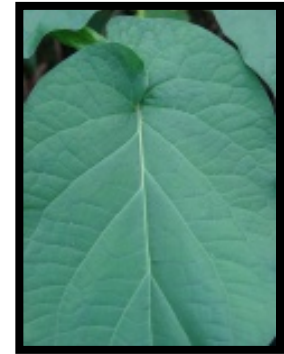
Piper auritum

Piper auritum Kunth (A genus of about 2,000 pantropical species.) Piperaceae. Ear-leafed pepper, Veracruz pepper, rootbeer plant, hoja santa. This perennial shrubby species, growing 3-6 m tall, is native from Mexico through Central America into northern South America. The simple leaves are cordate to 30 cm long with acuminate tips and unequal lobes ("ears") at the base and slightly winged petioles. The leaves contain ethereal oils that produce a strong aroma of anise when crushed. The inflorescence is a slender, arching spike of typical reduced, white Piperaceae flowers consisting of a bract surrounding the pistil and stamens. The fruit is a drupe, dispersed by bats. In Central America and Mexico, the leaves are used in cooking or as a condiment. This is one of the hardiest members of the Piperaceae and is found as an ornamental as far north as USDA Zone 8A, where it might freeze to the roots in winter. (St. Lucie County; B2008-182; Dagne A. Vasquez; 8 April 2008) (Kunkel 1984; Llamas 2003; http://www.fao.org ; http://www.hear.org/starr/hiplants/images/thumbnails/html/piper_auritum.htm )