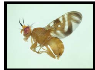
Pramyiolia rhino

Schizaphis minuta (van der Goot), a sedge aphid : A specimen was found in a suction trap sample in an orange grove in Arcadia (DeSoto County; E2008-1577; grove employee; 15 March 2008). NEW DPI COUNTY RECORD.