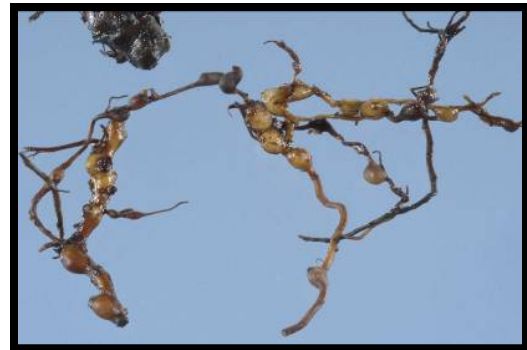
Meloidogyne enterolobii