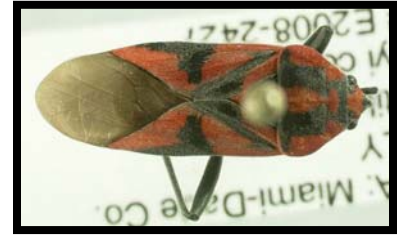
Spilostethus sp.