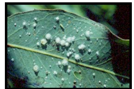
Red gum lerp psyllids on eucalyptus

Ficus aurea (Florida strangler fig) -- new species in the family Coccidae, croton scale : A moderate infestation was found at the University of Florida IFAS Tropical Research and Education Center in Homestead (Miami-Dade County; E2008-3032; Holly B. Glenn, University of Florida; 19 May 2008). NEW DPI HOST RECORD.