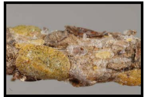
Croton scale on croton plant

Gramineae/Poaceae (bamboo) -- Kuwanaspis howardi (Cooley), bamboo white scale : A moderate infestation was found on three of four plants at a nursery in Gainesville (Alachua County; E2008-3442; Cheryl A. Jones; 2 June 2008). NEW DPI COUNTY RECORD.