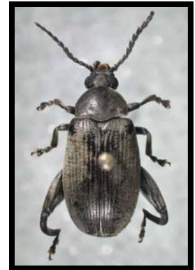
Pachymerus nucleorum