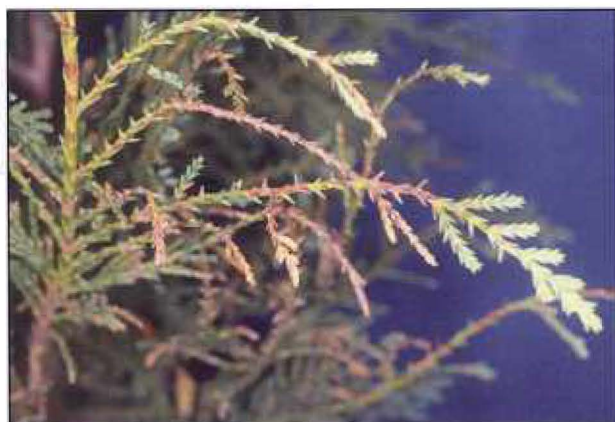
Fig. 3. Patchy necrosis of infected Leyland cypress twigs. Note the green tips of infect twigs - a common symptom of Cercosporidium blight.

SYMPTOMS: Symptoms of Cercosporidium blight can be observed initially on the infected needles of lower twigs and branches closest to the main stem (Fig. 3). Blighted needles and young twigs develop a rusty brown necrosis that may appear patchy throughout the lower canopy (Fig. 4). As infection continues, this disease generally spreads upward and outward on susceptible plant tissue. On severely infected plants, only the tips of branches may remain green. Infected seedlings and young plants may be killed (Sutton and Hodges 1990). Disease development is favored by warm, humid, wet weather or by overhead irrigation in nursery and greenhouse settings. In Florida, infections may remain active all year long. Conidia of Cercosporidium sequoiae may be spread naturally by wind and water splash. Movement of inoculum to susceptible plants within a nursery may also occur by way of contaminated clothing, equipment, resident pets, or birds.