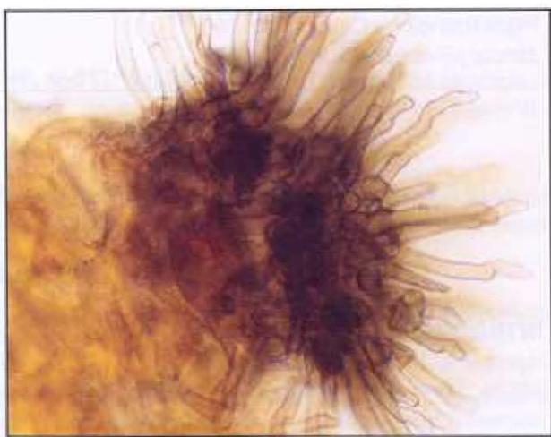
Fig. 2. Stroma and conidiophores of Cercosporidium sequoiae .

SYMPTOMS: Symptoms of Cercosporidium blight can be observed initially on the infected needles of lower twigs and branches closest to the main stem (Fig. 3). Blighted needles and young twigs develop a rusty brown necrosis that may appear patchy throughout the lower canopy (Fig. 4). As infection continues, this disease generally spreads upward and outward on susceptible plant tissue. On severely infected plants, only the tips of branches may remain green. Infected seedlings and young plants may be killed (Sutton and Hodges 1990). Disease development is favored by warm, humid, wet weather or by overhead irrigation in nursery and greenhouse settings. In Florida, infections may remain active all year long. Conidia of Cercosporidium sequoiae may be spread naturally by wind and water splash. Movement of inoculum to susceptible plants within a nursery may also occur by way of contaminated clothing, equipment, resident pets, or birds.