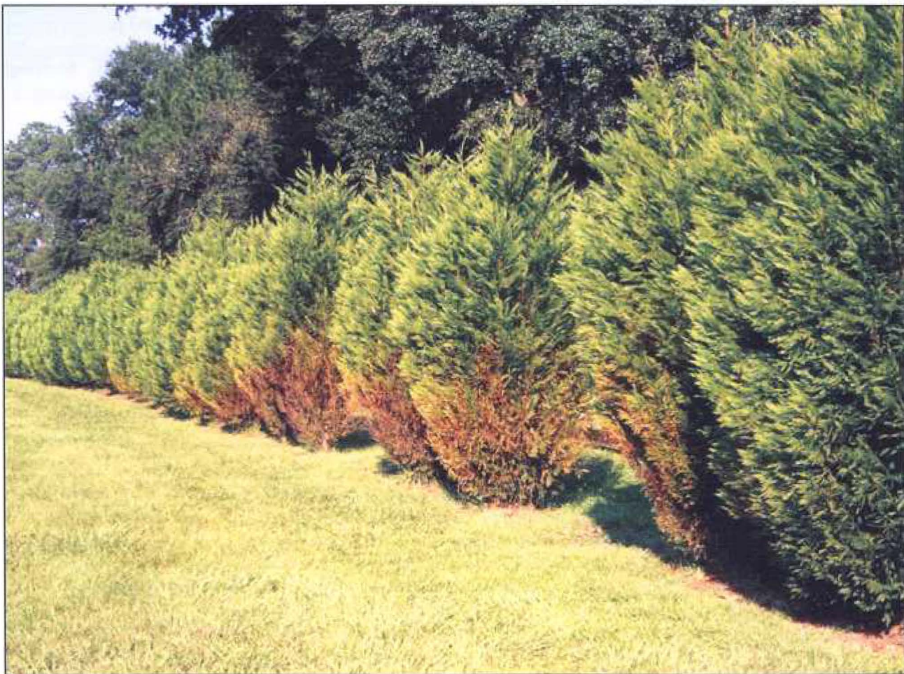
Fig. 4. Hedgerow of Leyland cypress exhibiting rusty brown necrosis of the lower canopy associated with Cercosporidium blight.

SURVEY AND DETECTION: Blighted needles on lower twigs and branches and a rusty brown necrosis throughout the lower canopy are suspect symptoms of Cercosporidium blight on older containerized plants or established landscape specimens. Young infected plants and cuttings may be completely blighted or killed. Using a hand lens will help determine if a fungus is present on blighted tissue. Observing greyish-brown tufts of fungal mycelium may indicate the presence of Cercosporidium sequoiae .