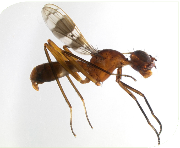
3 - Cardiacephala modesta, a stilt-legged fly. Photograph by Gary J. Steck, DPI