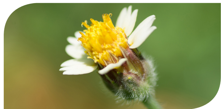
Tridax procumbens, coatbuttons.

Myzus fataunae Shinji, pilea aphid, a new Western Hemisphere record. Minute aphids were found on Pilea cadierei (aluminum plant) and other species of Pilea at a nursery that produces plants for dish gardens. Prior to their discovery in Florida, these aphids were known only from Japan and Korea.