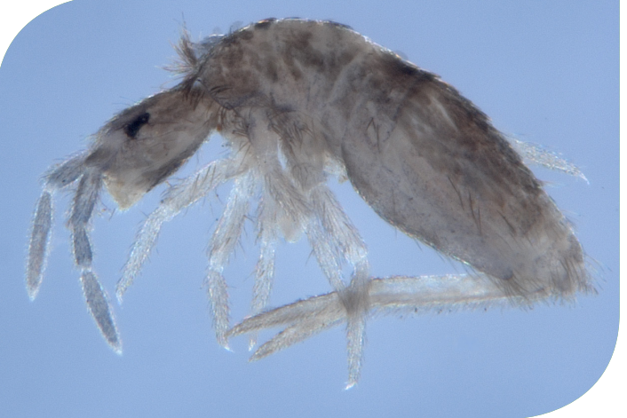
6 - Trogolaphysa riopedrensis, springtail . Habitus adult. Photograph by Felipe N. Soto-Adames, DPI

5 - Lepidocyrtus vireticulus, springtail. Habitus adult. Photograph by Felipe N. Soto-Adames, DPI