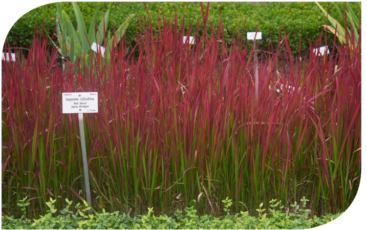
Imperata cylindrica 'Red Baron' (Japanese blood grass, a cultivar of cogongrass).

A: Take a look at a map of Florida. Our state is so long, it contains USDA plant hardiness zones from 8A to 11A (https:// planthardiness.ars.usda.gov/PHZMWeb/#). Many plants that cannot survive the winter freezes common in north Florida can grow aggressively all year in south Florida. Although a plant might not grow well in the soil, rainfall or temperature conditions in one part of the state, it could thrive in other areas within our borders. Although the state regulates plants statewide with a single standard, voluntary groups sometimes list plants as problems for one or more regions of the state and recommend against planting those species in problem areas. Plants prohibited by statute cannot be sold anywhere in the state of Florida. You might not find the plant a problem where you live, but neighbors farther north or south might think of it as a plaque.