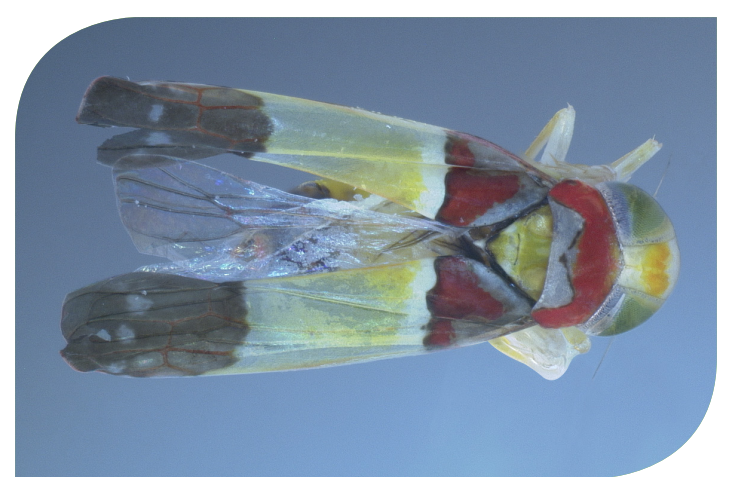
Brunerella magnifica, bourreria leafhopper.