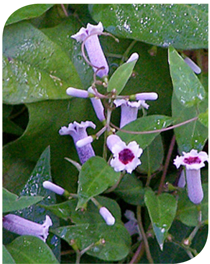
2 - Paederia foetida L. (skunkvine) flowers and leaves.