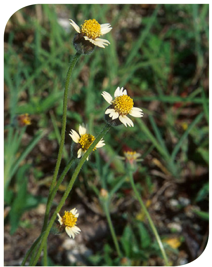
3 - Tridax procumbens L. (coatbuttons) flowers. Photograph by Roger Hammer, <u>Atlas of Florida Plants</u>