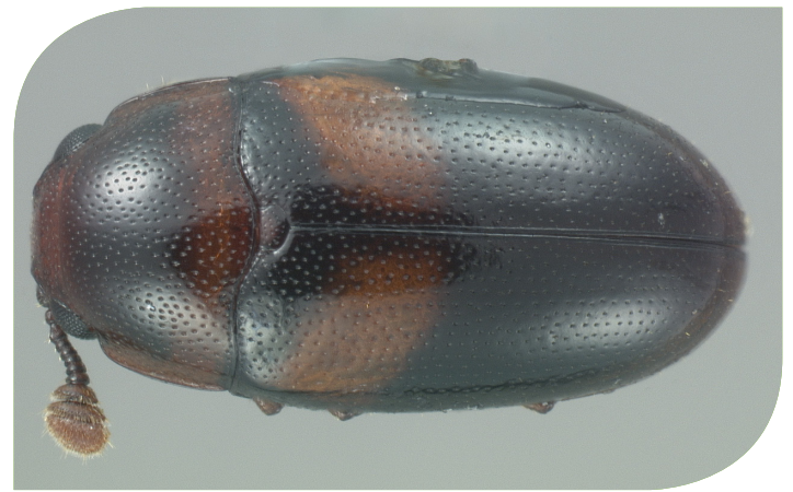
4 - Dacne picta, a pleasing fungus beetle. Whole body.