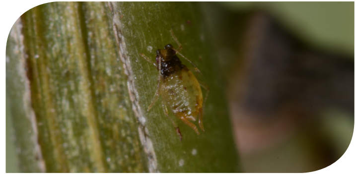
4 - Myzus fataunae, pilea aphid. Close view on plant stem.

3 - Botryospheria dothidea, stem dieback. Canker stem lesions produced by pycnidia on Olea europaea twig.