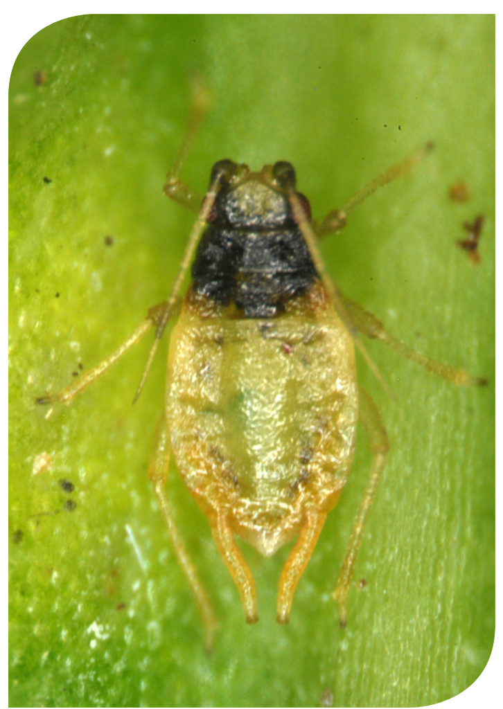
1 - Myzus fataunae, pilea aphid. Close view on plant stem.