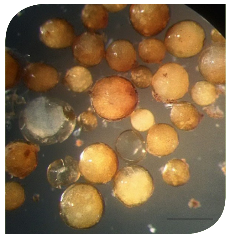
1b - Meloidoderita whittoni cysts. Scale bar = 445 μm.