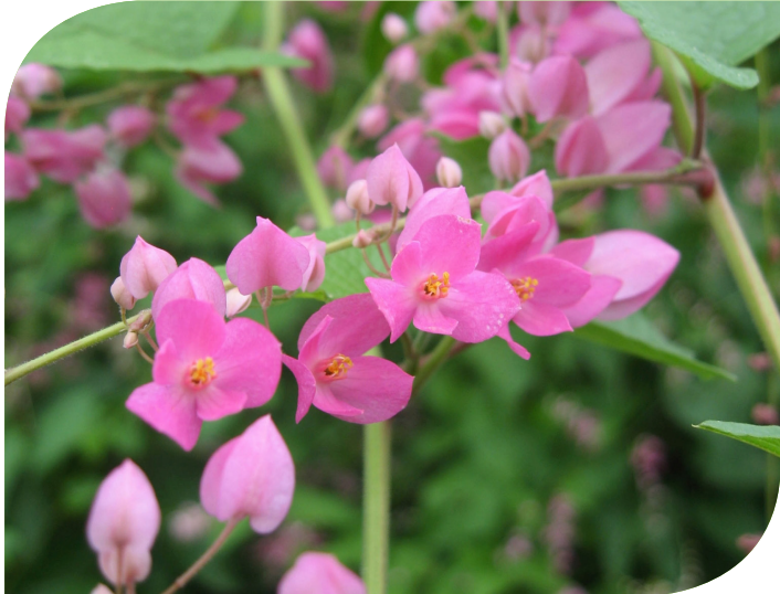
1b - Antigonon leptopus (coral vine) leaf and flowers.