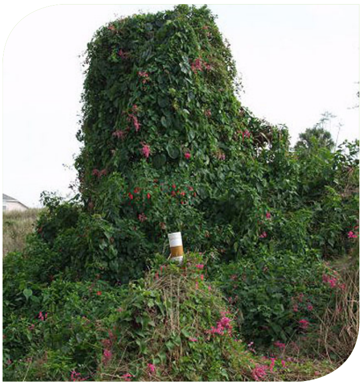
1a - Antigonon leptopus (coral vine) infestation.