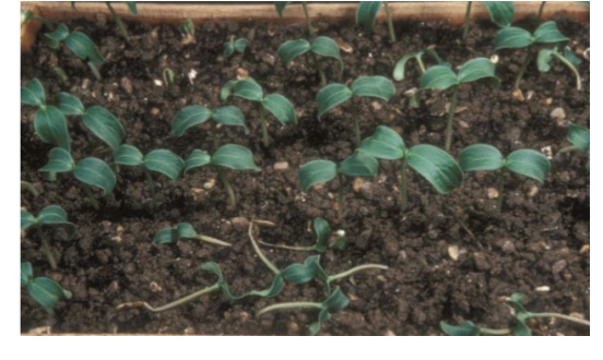
Seedling damping off