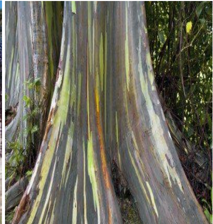
Fig 4: Rainbow ( E.G ) [13].