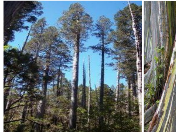
Fig 3: Whole tree of (E.G) <sup>[12]</sup>.