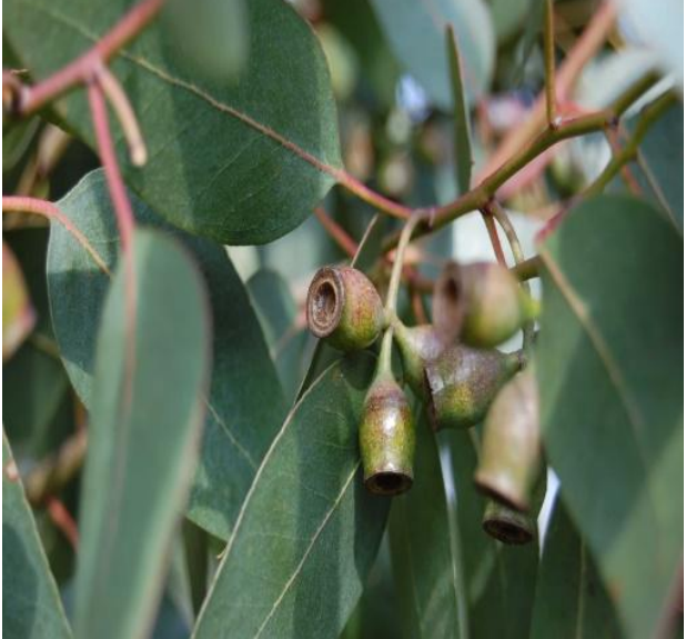
Fig 2: fruit of (E.G)^{[11]} .