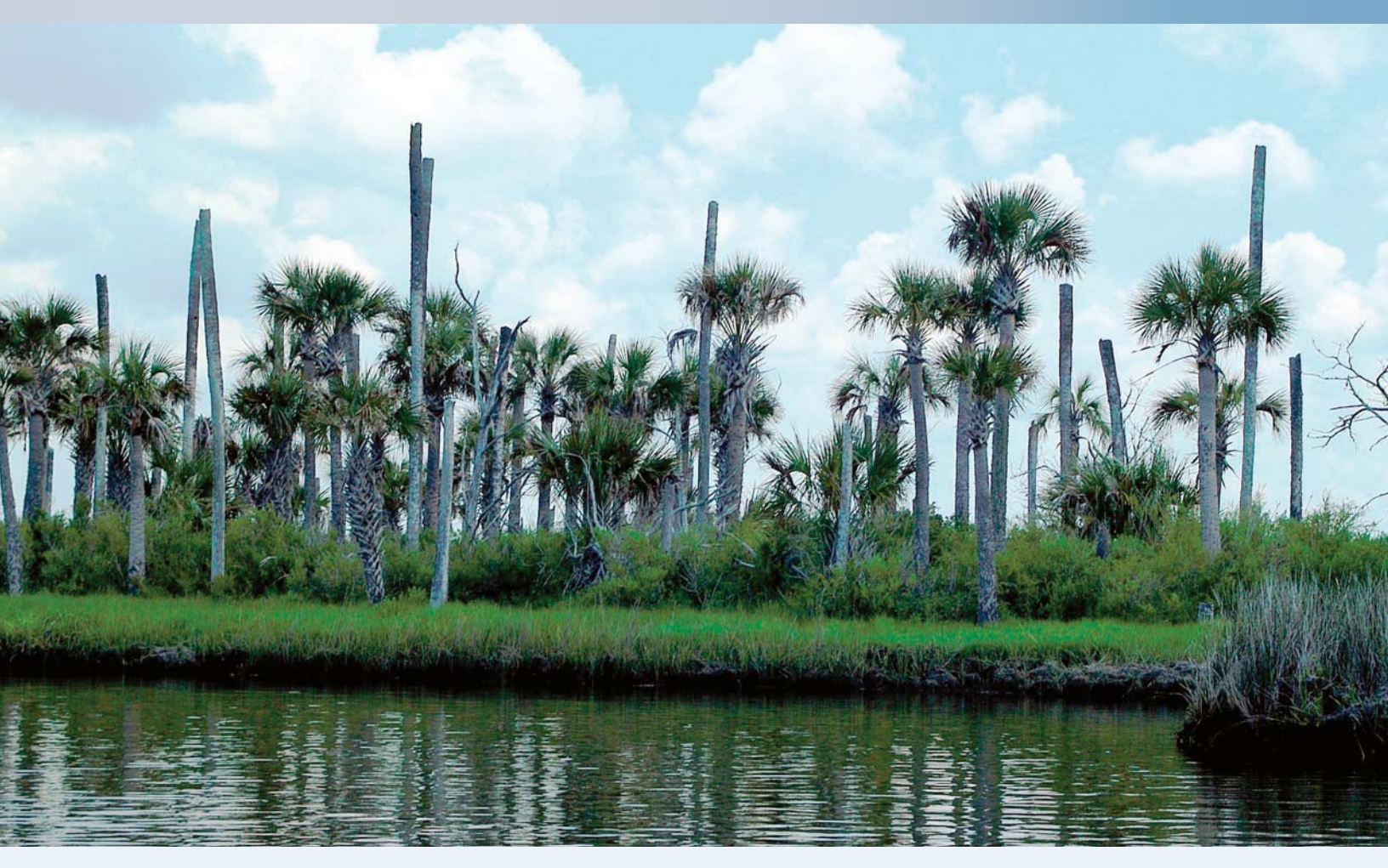
Above: Declining cabbage palm forest, Turtle Creek, Waccasassa Bay.

their relatively high tolerance of salinity. That increased flooding is not the main driver of forest replacement by saltmarsh is made obvious by a drive west out State Road 40 towards the Yankeetown Boat Ramp.