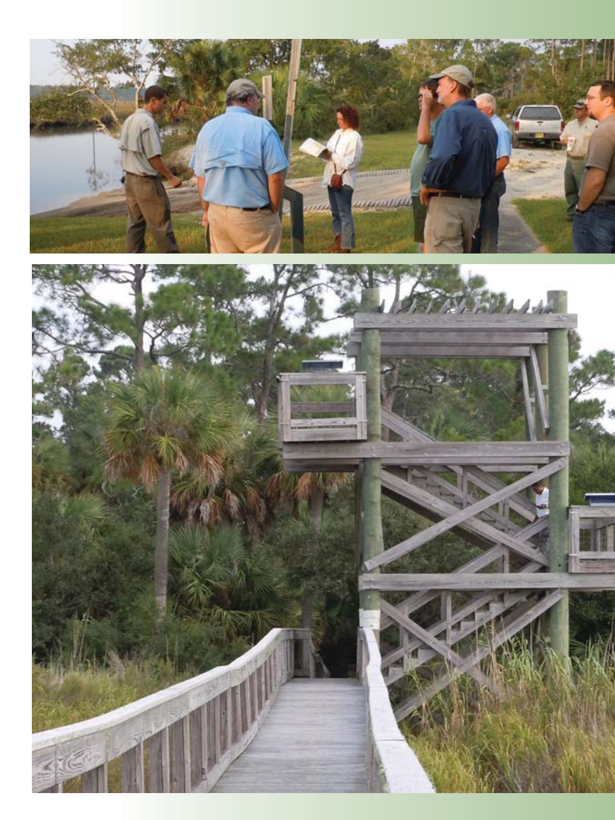
Above: Members of the review team gather at Whiskey George Creek Landing. Observation tower at Sand Beach pier on the north shore of East Bay, where maritime hammock can be seen bordering the salt marsh.

The ARWEA recreational facilities also include hiking trails, boat ramps, potential camping sites, handicapped access areas, boardwalks, and secure bike racks for those who would like to use off-road bike shuttling as part of multi-day paddling trips. This was an excellent area to combine some wilderness experience with learning about Apalachicola's interesting history. Appendix 5 of the FWC Nature-Based Recreation Master Plan for the ARWEA lists Bloody Bluff, Creels Town, Creels Side Camp, a turpentine plant, an African American cemetery, and numerous Native American camps and burial sites as some of the 27 cultural sites in the area. Great restaurants and charming lodgings provided welcome endings to our long days of gaining knowledge and sharing thoughts about some fascinating natural communities and meeting the dedicated people who manage them.