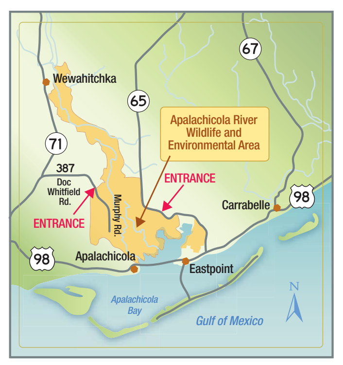
Above: Location map showing ARWEA and surrounding features. Based on map art prepared by Bill Hood, Lotspeich and Associates, Inc.

As longtime members of the Florida Native Plant Society's Tarflower Chapter, we have taken numerous trips through the Apalachicola National Forest to observe the insectivorous plants in the wet prairies along Highway 65 and explore the steep heads, ravines, and high