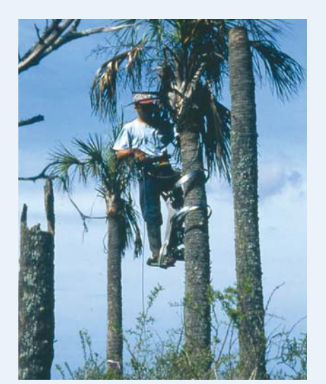
Above: A tree bicycle provides researchers access to taller trees.

On the forested islands in the saltmarsh, as salinity increased, growth and survival rates declined in all species, including palms and cedars. We also noticed that in response to high but still tolerable