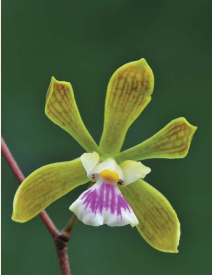
The green sepals and petals with a matrix of brown made these flowers stand out among the normal-colored flowers on the same tree.

The only thing to add is that Luer's observations hold true for the entire southern tip of the peninsula and the Florida Keys. Orchid growers who have selfed flowers of Encyclia tampensis and propagated them from seed have found that the resulting plants produce flowers of widely varying colors, indicative of a hybrid swarm. Selfing refers to pollinating a flower with its own pollen.