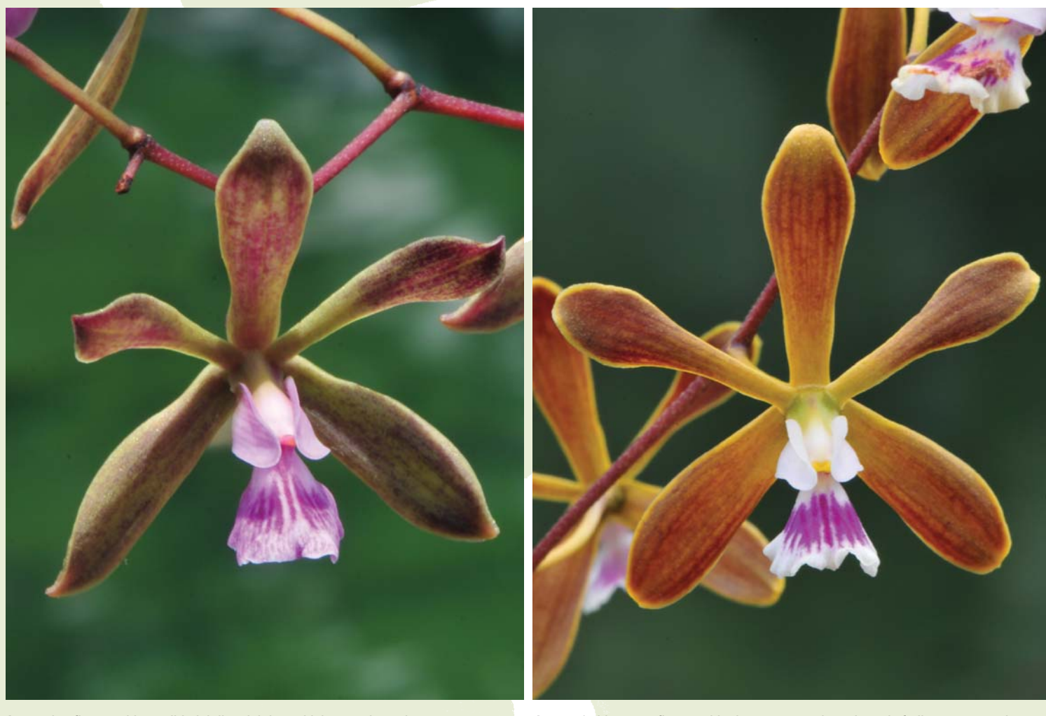
A stunning flower with a solid pink lip, pink lateral lobes, and sepals and petals accented with pinkish-purple.

May 13, 2011 found me in the same solo canoe with expensive camera gear on board, fully aware that I'd be paddling in manatee territory and would have to stand up in order to photograph the orchids. What worked best was pushing two stakeout poles into the mud on each side of the canoe and firmly attaching the poles to the center thwart with stout bungee cords. That setup held the canoe stable enough to stand and photograph from using a tripod, or to disembark and climb the dead trees, killed