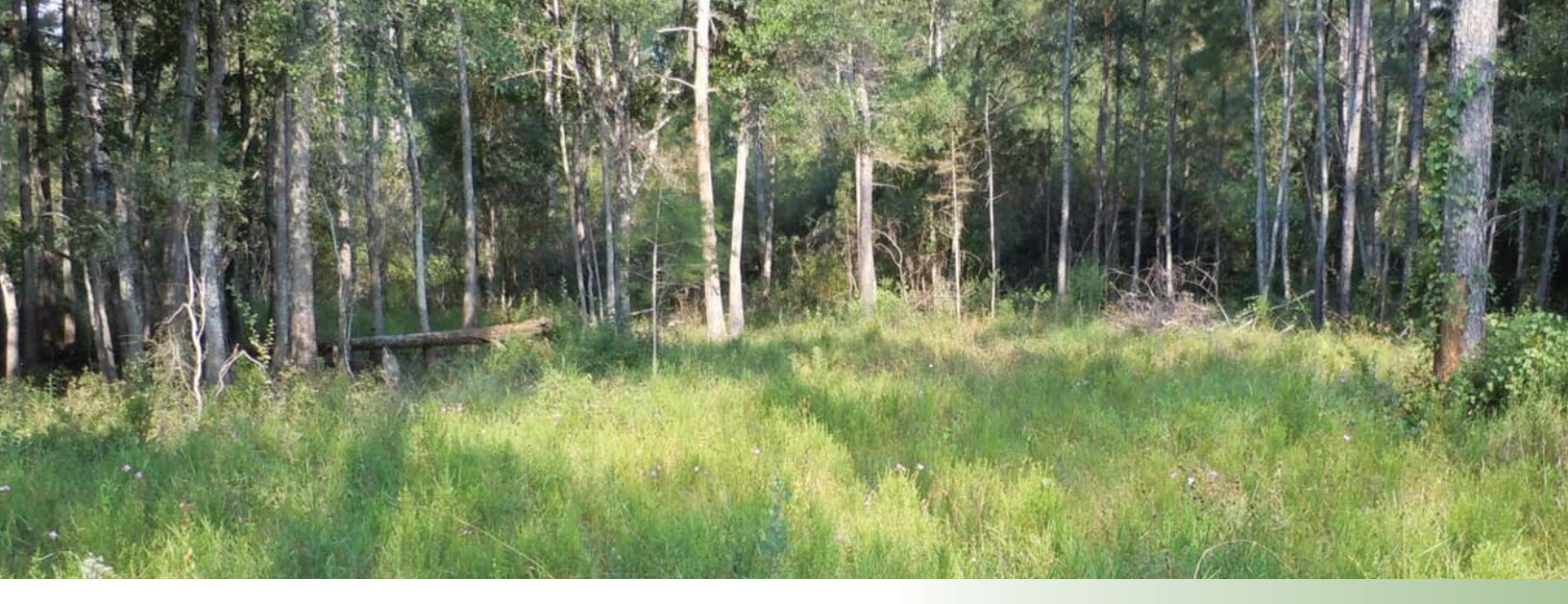
Above: Restored ephemeral wetland with diverse herbaceous fringe.

We became informed about one of the important water oriented recreational opportunities, which is offered at the ARWEA. Through the expansive swamp and salt marsh ecosystem winds some 130 miles of marked kayak/canoe trails, for which the Florida Fish and Wildlife Conservation Commission (FWC) has produced a very nice, field-hardy (waterproof) paddling guide. Spring, winter and late fall would be particularly comfortable times to enjoy some serious solitude and opportunities to view, feel and smell the seasonal changes in the salt marshes and the swamps that knit together all those creeks, bayous and rivers. We did not experience paddling during the review, as the swamps and salt marshes are not the focus of active land management practices; but we look forward to future trips. The FWC reports in their paddling guide that one might see, for example, brilliant yellow prothonotary warblers and the courting displays of swallow-tailed kites in the spring, beautiful foliage in the fall, and nesting bald eagles in the winter.