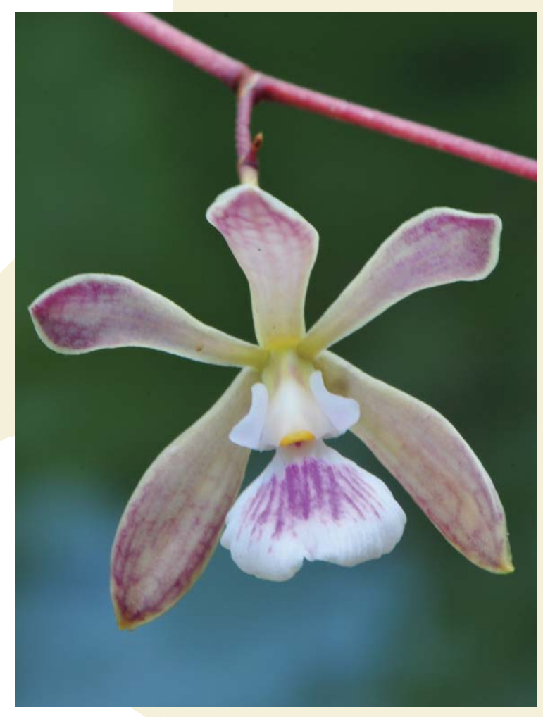
Looking white from afar, this plant had flowers with creamy-white sepals and petals accented with pink, and an unusually wide lip.

in 1960 by Hurricane Donna, where the orchids were growing along a three-mile stretch of mangrove shoreline. It proved to be well worth the effort and monetary risk, even though I had to perform some maneuvers that would make any Cirque du Soleil acrobat profoundly jealous.