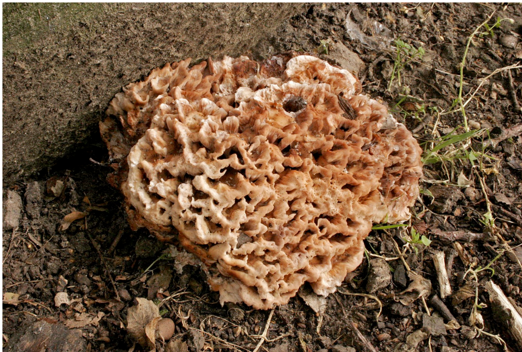
Fig. 7 Podoscypha multizonata

This species has its stronghold in the southern counties of England, North West London just happens to be one of those strongholds. There is a Biodiversity Action Plan (BAP) on this species because of its scarcity outside of southern England, the UK and the European Mainland, where it a red data species. It is a species that occurs on the roots of old oak trees, in open woodland or parkland. Old hunting grounds are particularly favoured, as generally there are large, old Oak trees present. It can occasionally be found with Beech and there has been one record with Hornbeam on nearby Hampstead Heath.