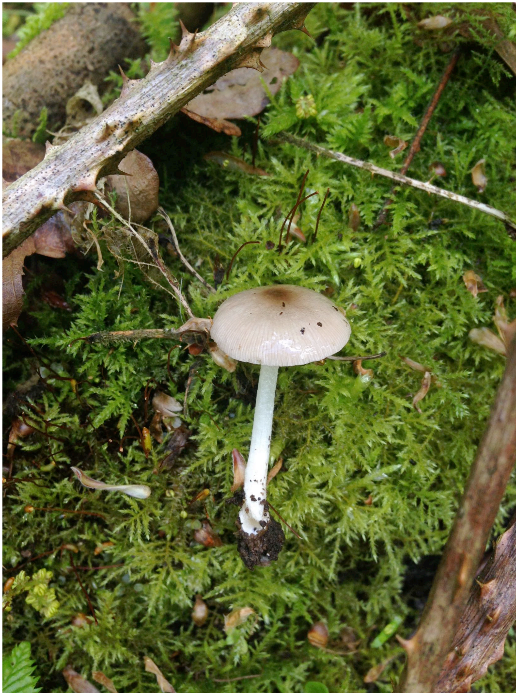
Fig. 5 Bolbitius reticulatus -Queens Wood

This is a rarely recorded species with just 273 records on the FRDBI since 1837. It is a species that occurs on dead wood, often where mosses have started grow. This was recorded during May so it can be an early fruiter, although it can also occur at anytime, given the conditions are moist enough and not too cold. It is a small species, measuring only 20mm or so across. This will be only the third record for Middlesex.