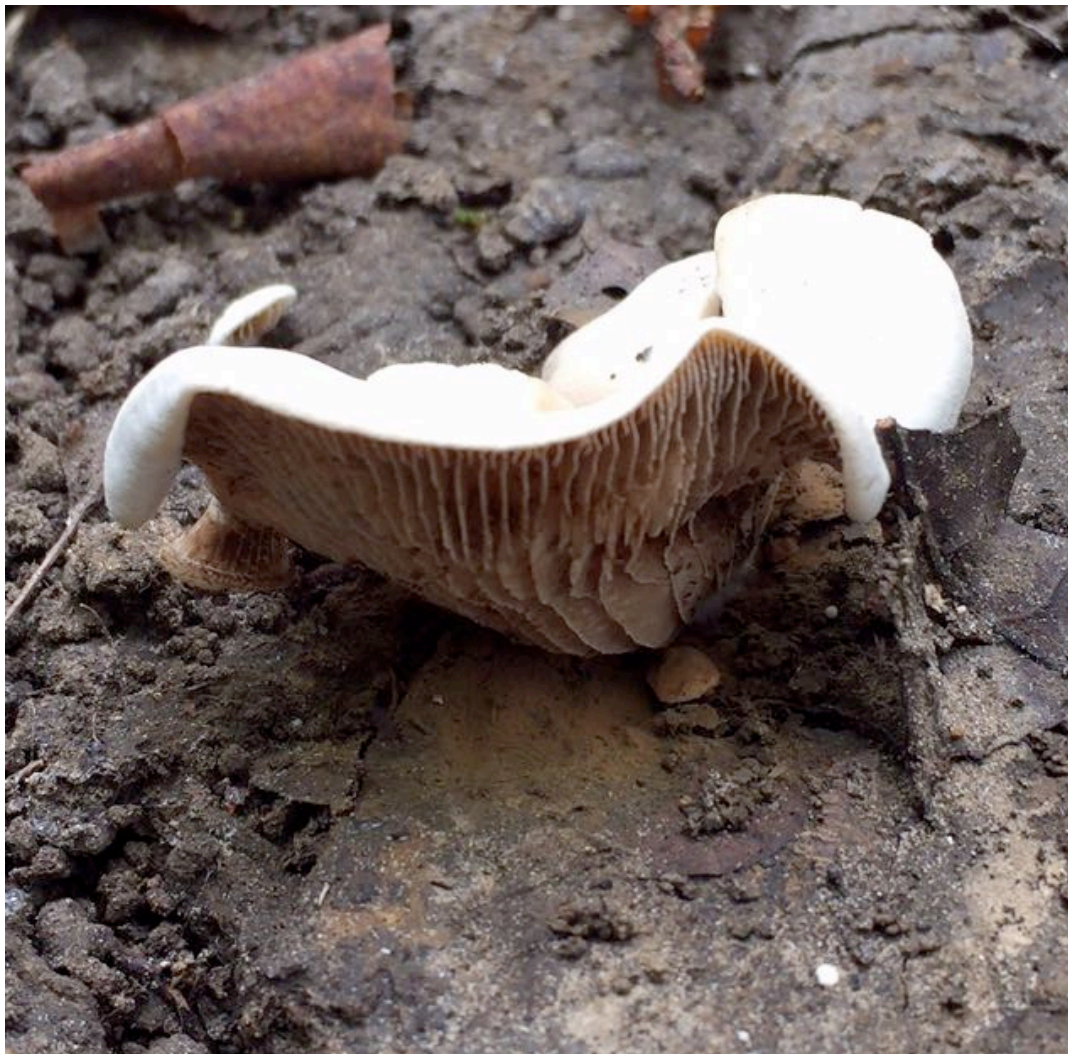
Fig. 7 Crepidotus autochothonus -Queens Wood

This is an unusual member of the genus Crepidotus as it fruits directly on bare soil; other species are mainly on dead wood or woody debris. It also has smooth spores, as opposed to the ornamented spores of other Crepidotus species. One other species, C. versutus can also be found, only occasionally fruiting from soil and it has smooth spores but it never yellows at all, as with C. autochothonus . Only 142 records on the FRDBI with just two from Middlesex, this will be the third.