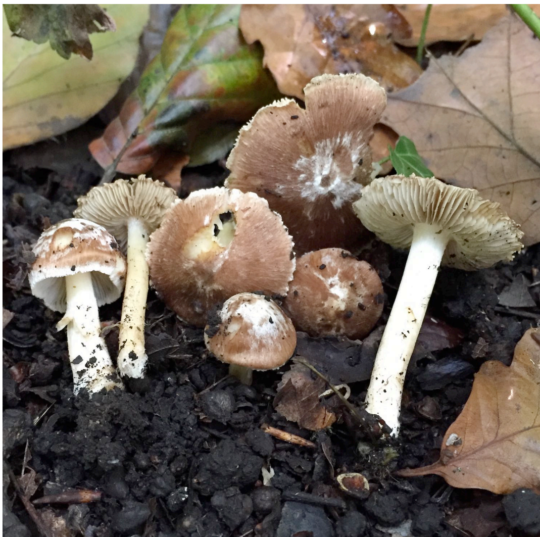
Fig.3 Inocybe maculata -Queens Wood

This is not a rare species but more an occasional to common and widespread species in England and Wales. An attractive species, with a fulvous coloured cap often adorned with white velar patches, giving it the common name of Frosted Fibre Cap. It is a mycorrhizal species that associates with various broadleaved deciduous trees. This collection was found in compartment H under oak, and was not the only compartment within which this was found, which leads me to believe that a healthy population of this species thrives in the wood, even though common with over 700 records on the FRDBI there is only six for Middlesex, this record is therefore the seventh for this county.