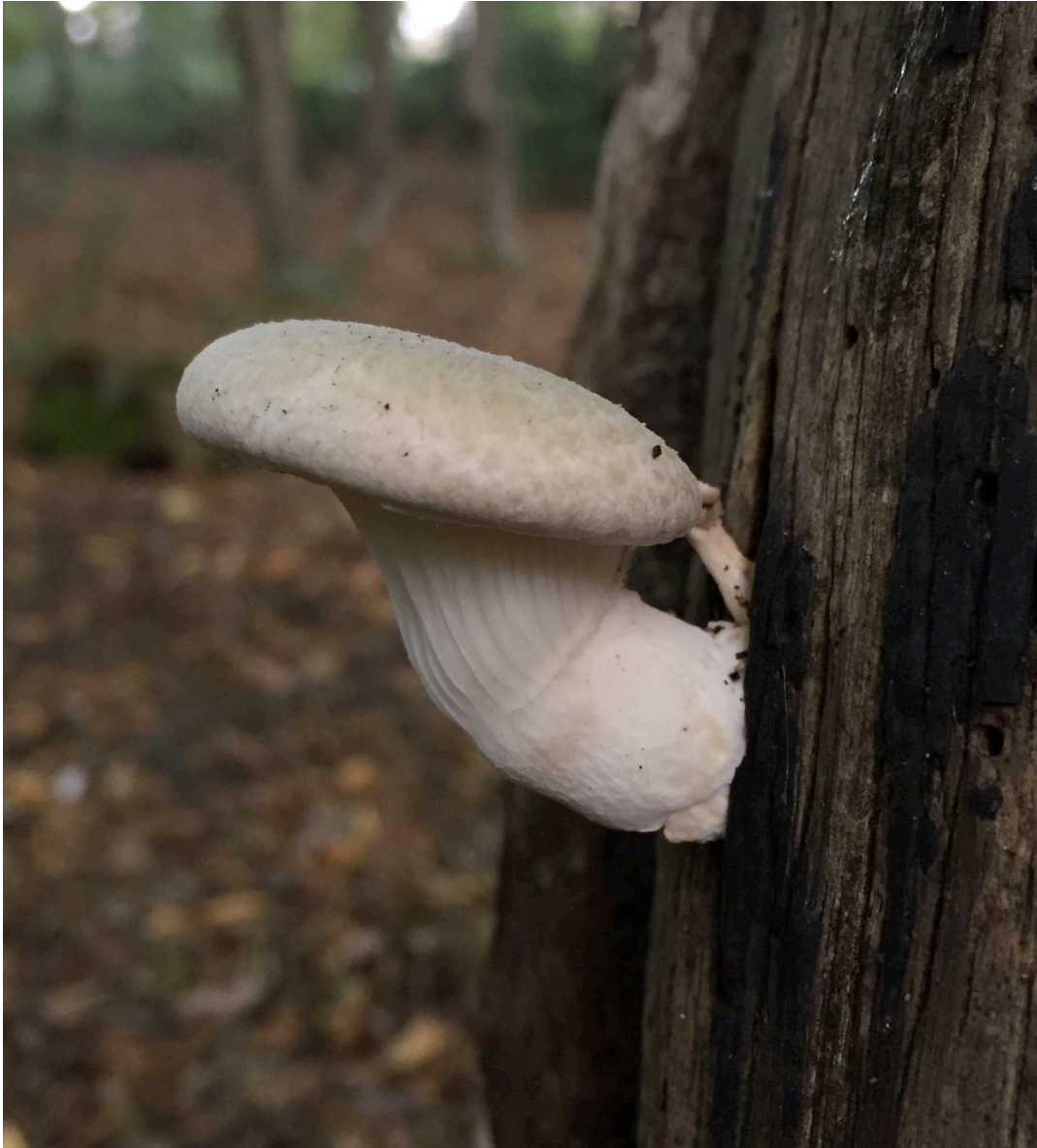
Fig. 8 Pleurotus dryinus –Queens Wood

Not the most common species of the genus Pleurotus (Oyster Mushrooms) but not uncommon and it is widespread. It is unusual species in that it emerges from a veil, hence the common name given to it of, Veiled Oyster. Easily recognised by the velar patches on the cap and the decurrent gills. It fruits from a number of different broadleaved deciduous trees; this was fruiting from an old hornbeam tree.