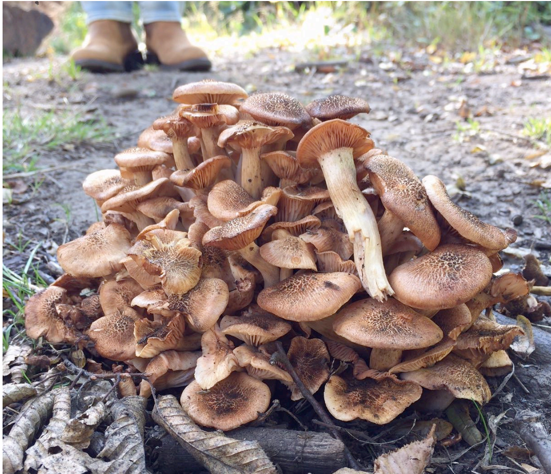
Fig. 7 Armillaria tabescens

Commonly known as the Ringless Honey Fungus, this is not such a common species. It fruits in very tight clusters consisting of many fruitbodies. It is not as virulent a parasite as Armillaria mellea , being weakly parasitic and then saprophytic on the dead roots of various deciduous broadleaved trees. This is the ninth record for this species in Middlesex; there are currently 251 records in the FRDBI.