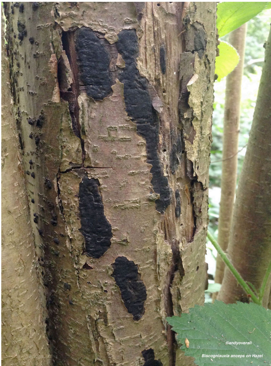
Fig. 6 Biscogniauxia anceps - ©Andy Overall

5.5 Biscogniauxia anceps –TQ 29014 88567-Compartment G Border. On Hazel This may well be an under recorded species, and given the appeal of its appearance, not unlike patches of tar upon wood, it is most probably, also overlooked. Currently there are only fifteen records of this species across the country dating from 2000, therefore a recent addition to the British Mycota. This record is only the second for Middlesex, the first being made only weeks before this, by myself from, another London wood. It is known for appearing on hazel, Corylus avellana but can also occur on hornbeam, Carpinus betulus and Oak, Quercus sp. It is a species belong to the family Xylariaceae and to the class called, Ascomycetes .