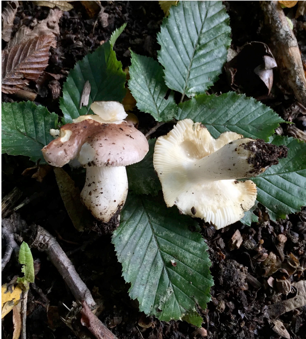
Fig. 4 Russula puellaris -Queens Wood

Nationwide this is not an uncommon species with close to a thousand records from across the country and Northern Ireland, noted on the FRDBI. However in Middlesex there are only seven records. It is a species that appears to be occurring more often in recent years and it was a welcome addition to the survey of Queens Wood.