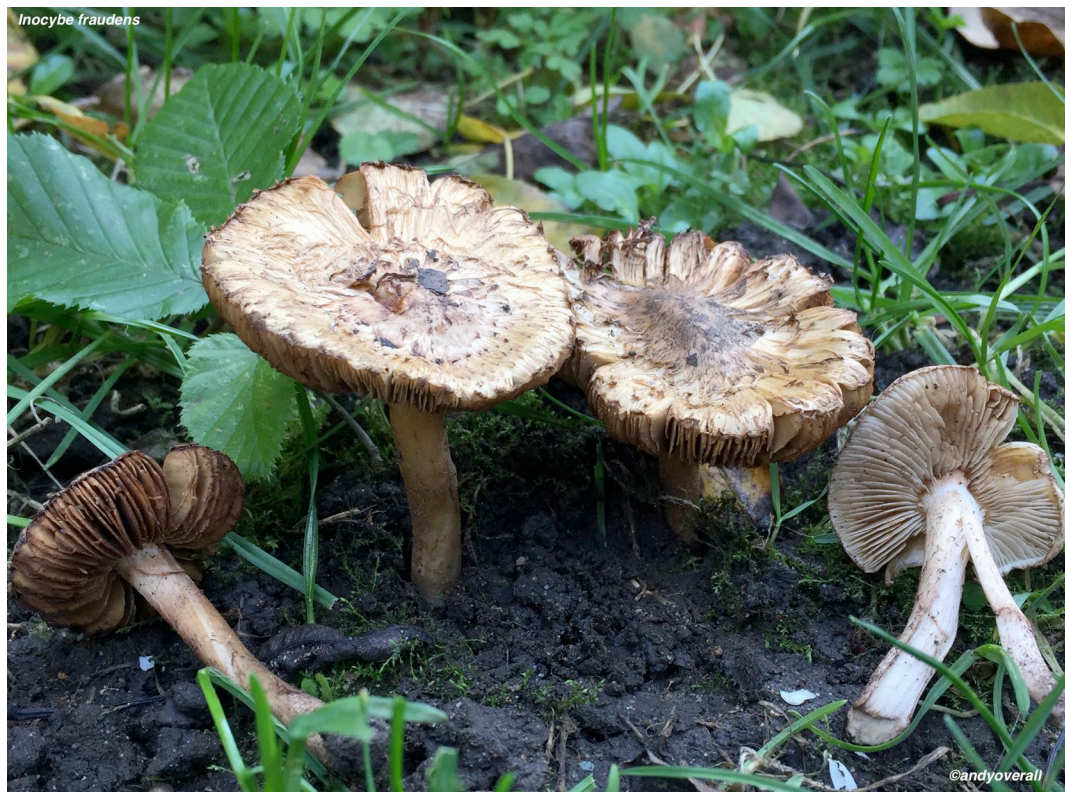
Fig 2. Inocybe fraudens -Queens Wood—© Andy Overall

The species is occasional although fairly widespread. Generally fruiting in woodland with beech, on calcareous soils but it is also known with birch, hazel and oak on rather improved soils. Distinguished by its fruity smell and cystidia with apical crystals. This is the first record for Middlesex. There are currently 541 records held in the FRDBI*