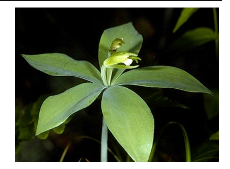
Figure 1—Small whorled pogonia. Image courtesy of Robert H. Mohlenbrock @ USDA-NRCS PLANTS Database / USDA NRCS. 1995. Northeast wetland flora: Field office guide to plant species. Northeast National Technical Center, Chester, Pennsylvania.