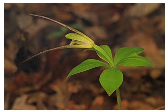
Figure 2—Large whorled pogonia. Creative Commons image by Judy Gallagher.

Figure 1—Small whorled pogonia. Image courtesy of Robert H. Mohlenbrock @ USDA-NRCS PLANTS Database / USDA NRCS. 1995. Northeast wetland flora: Field office guide to plant species. Northeast National Technical Center, Chester, Pennsylvania.