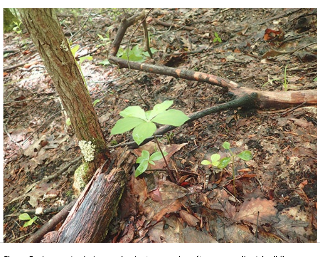
Figure 5—Large whorled pogonia plants emerging after a prescribed April fire near Pownal, Vermont.

Forest report that "large populations" of large whorled pogonia once occurred on south-facing, convex slopes that were burned in the early 1900s to promote berry production, although these populations were apparently declining in the 2010s [71]. Three months after the spring prescribed fire, density of large whorled pogonia averaged about 60 vegetative stems in a ~30 × 40-foot area [45]. Most of these were large plants (4-7 inches (11-18 cm) tall): no seedlings were present [45, 46]. Marcus (2019) reports that many of the plants "are growing right out of burnt soil, right against charred branches and logs", with the previous year's stems sometimes visible as charred stalks (fig. 5). Outside the burn, large whorled pogonia was "very rare and difficult to find above ground" [45].