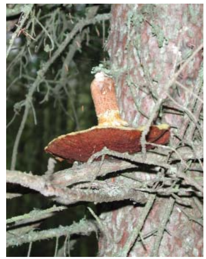
Figure 2.—Hollow Stem Larch Suillus (Suillus cavipes).