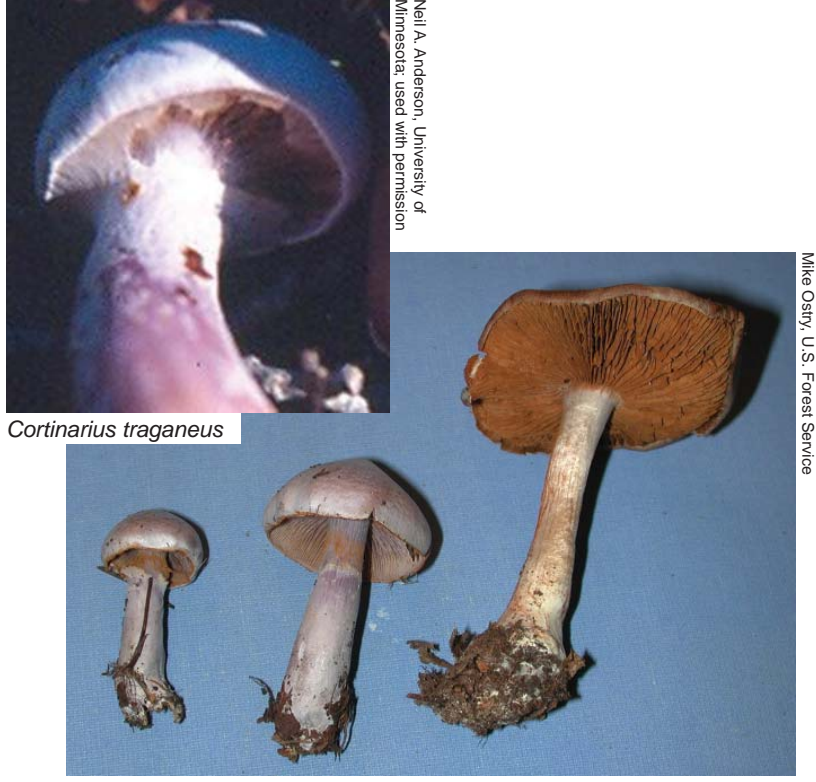
Curtain on young Cortinarius.

Fungal note: The curtain-like annulus covering the gill surface is a distinctive trait of this genus.