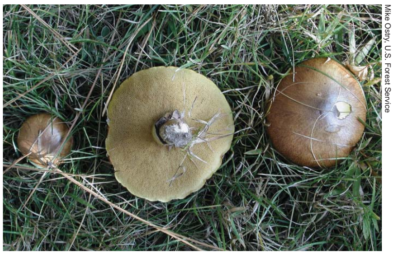
Suillus luteus, top and bottom views.

Fungal note: Boletes are important food for insect larvae, invertebrates, turtles, snails, slugs, and many mammals, especially squirrels who often store the mushrooms in trees. Another bolete, S. brevipes , often found with jack pine, has such a short stalk that it looks like the cap is resting directly on the ground.