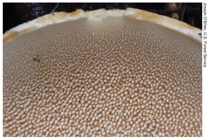
Hydnum repandum, lower surface.