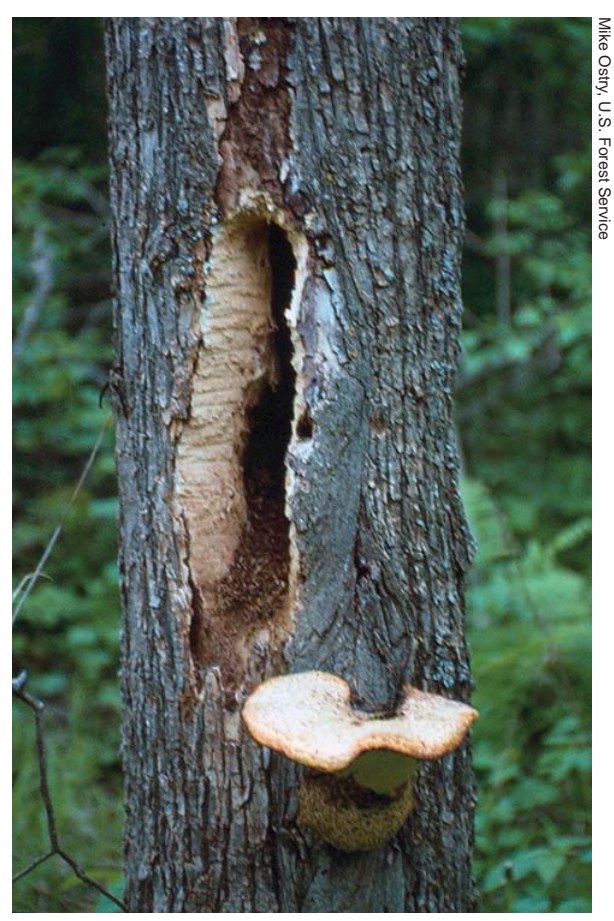
Wildlife cavity in elm with heart rot caused by Dryad's Saddle ( Polyporus squamosus ).

DO NOT eat any mushroom unless you are absolutely certain of its identity.