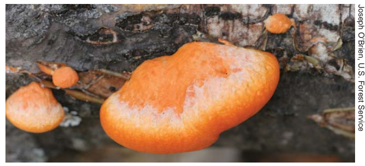
Polyporus cinnabarinus, top view.

Fungal note: Some fruit bodies can produce spores into the second and third years.