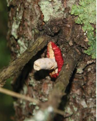
Figure 3.—Emetic Russula ( Russula emetica ) stored on branches of black spruce by squirrels.

Macrofungi are distinguished from other fungi by their fruiting structures (fruit bodies bearing spores) that we know as mushrooms. Mushrooms with gills, the most common, produce spores that range from white to pink and shades of yellow to brown to black. Most mushrooms produce spores on gills that increase the spore-bearing surface on the underside of the cap. Other mushrooms, such as the Boletes, produce their spores in elongated tubes, and the hedgehog mushrooms produce spores on elongated spines.