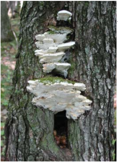
Figure 5.—Cavity in maple decayed by Mossy Maple Polypore ( Oxyporous populinus [ Fomes connatus ]) used by a squirrel to cache acorns.

Mushroom species form new clones when two compatible spores of the same species germinate and grow together. However, most mushroom spores are dispersed, germinate, and contribute genetic variation to established clones in soil and wood. In nature, many mushrooms and bracket fungi may look alike, but they do not interbreed and thus are distinct biological species. Their growth on different hosts or physical separation from each other over time has made them genetically incompatible.