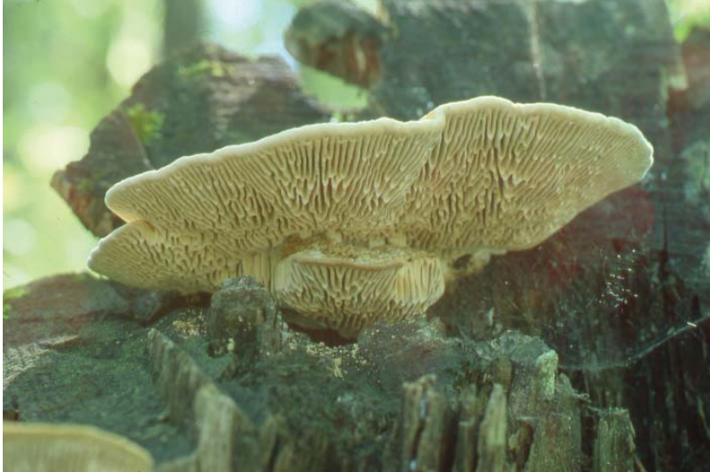
Daedalea quercina, bottom view.

Fungal note: This fungus is not found west of the Mississippi River.