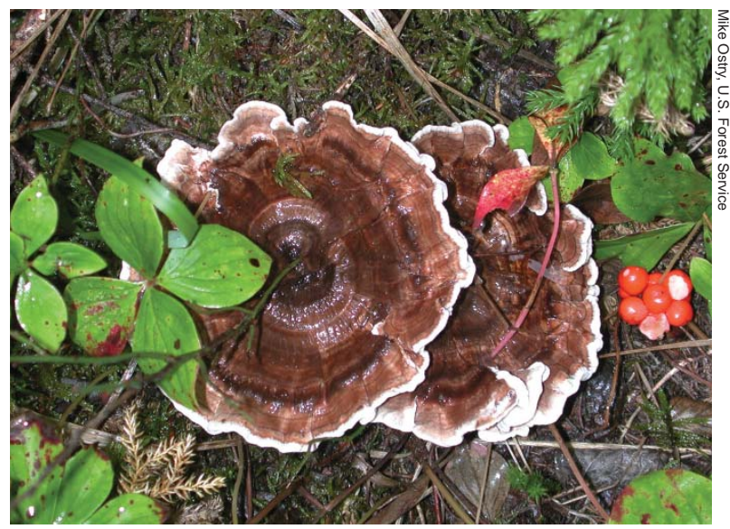
Hydnum repandum, top view.

Fungal note: Spores are produced on the outside surface of the downward pointing teeth.