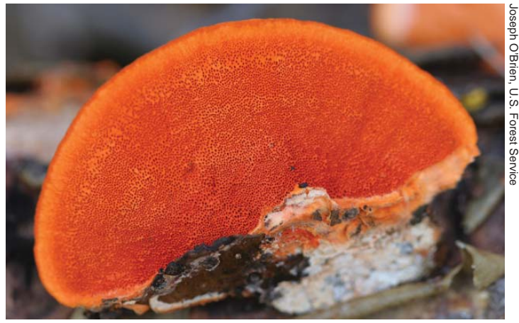
Polyporus cinnabarinus, bottom view.

DO NOT eat any mushroom unless you are absolutely certain of its identity.