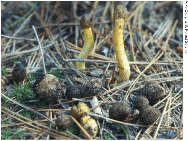
Cordyceps ophioglossoides the truffle eater. Several deer truffles (Elaphomyces granulatus) were dug nearby and placed in the foreground.

Fungal note: From a 1-m^2 sample area in a Minnesota jack pine stand, it was estimated that there were about 410,000 deer truffles per ha. These truffles are fed upon by many mammal species.