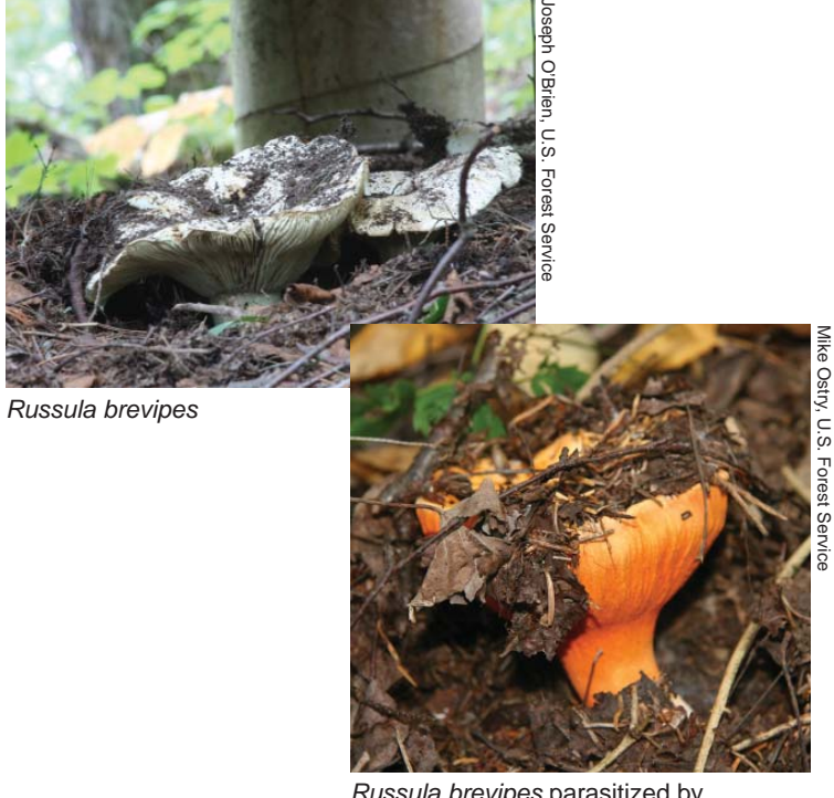
Russula brevipes parasitized by Hypomyces lactifluorum.

Fungal note: Large groups of this mushroom can be overlooked because they are often partially covered by soil and leaf litter.