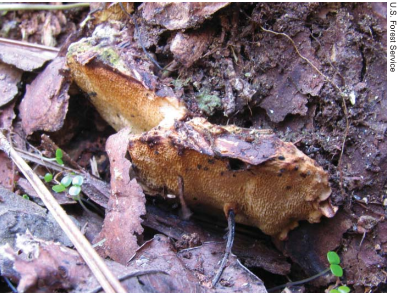
Heterobasidion irregulare, pore surface.