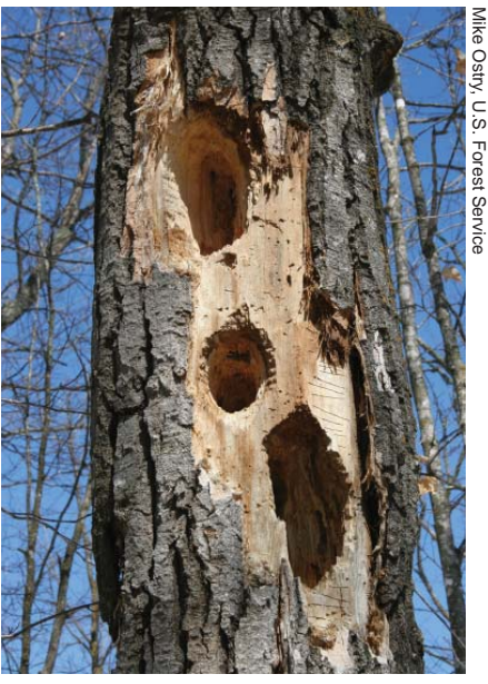
Cavities excavated by woodpeckers in aspen affected by P. tremulae .

Cross section of aspen stem near a conk of False Tinder Conk ( P. tremulae ) revealing a column of soft, decayed wood that benefits cavity-nesting birds and animals.