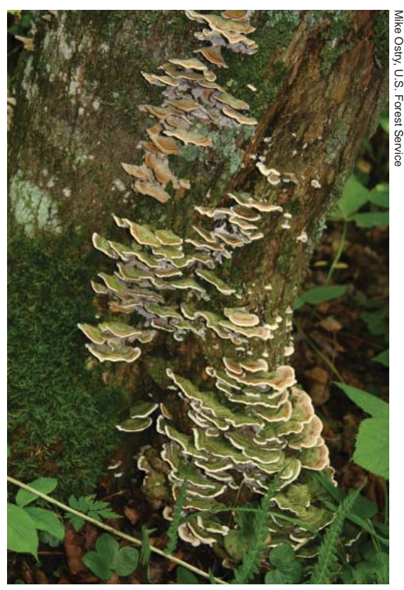
Figure 1.—Mossy Maze Polypore ( Cerrena unicolor [ Daedalea unicolor ]). Wood decay fungi are critical in nutrient cycling and increasing soil fertility.

Fungi are important organisms that serve many vital functions in forest ecosystems including decomposition (Fig. 1), nutrient cycling, symbiotic relationships with trees and other plants, biological control of other fungi, and as the causal agents of diseases in plants and animals. Mushrooms are sources of food for wildlife (Figs. 2, 3), and fungi that cause decay in living trees are beneficial to many species of birds and mammals (Figs. 4, 5). Less than 5 percent of the estimated 1.5 million species of fungi have been described, and their exact roles and interactions in ecosystems are largely unknown.