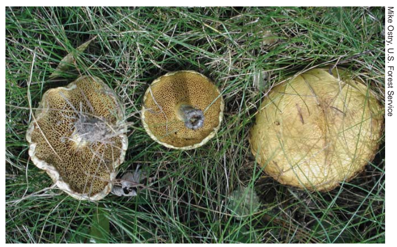
Suillus americanus, top and bottom views.

Fungal note: In mixed plantings of red and white pine, this mushroom will be found only in association with white pine. S. luteus will be found fruiting under red pine usually at the same time or within 1-2 weeks of S. americanus .