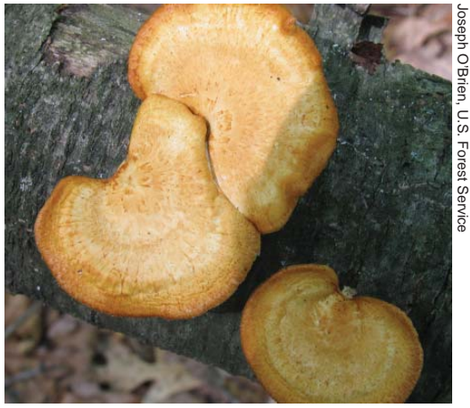
Polyporus alveolaris, top view.