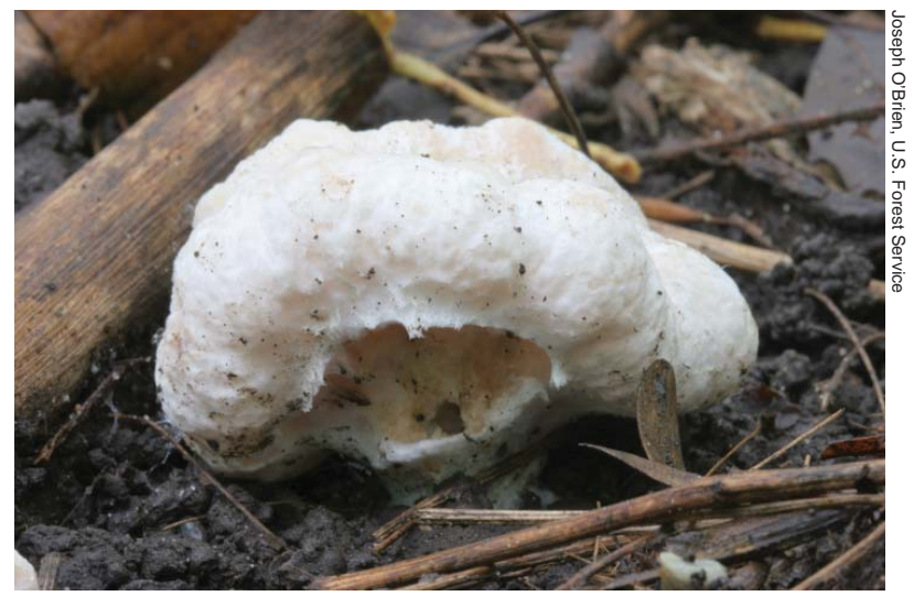
Abortive Entoloma fruit body resulting from Armillaria mushrooms parasitized by Entoloma abortivum .