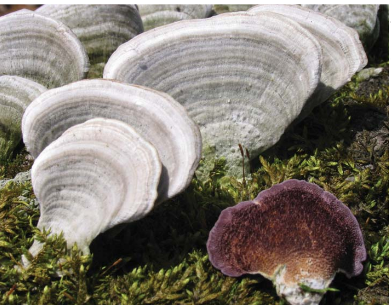
Trichaptum biforme, upper and lower surface