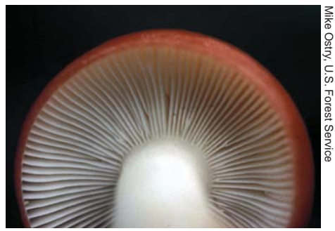
Russula emetica, bottom view.