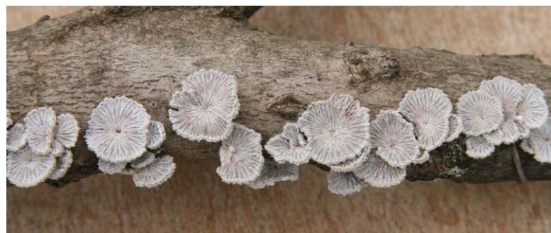
Schizophyllum commune, lower gill surface.