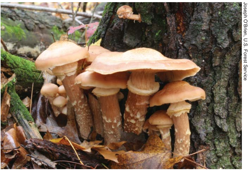
Armillaria sp. with characteristic ring (annulus) on the stems.