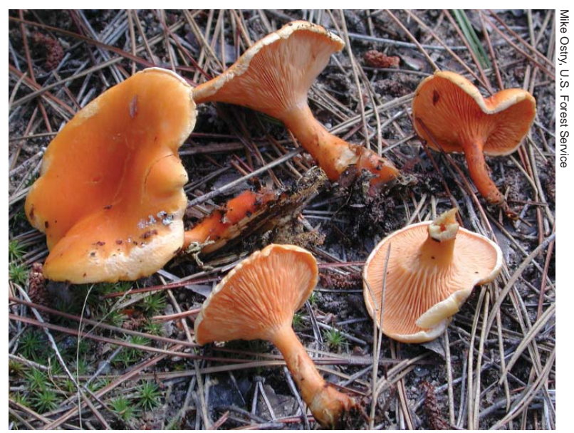
Hygrophoropsis aurantiaca, top and bottom views.

Fungal note: Often mistaken for the true chanterelle ( Cantharellus cibarius ), but the true chanterelle is a soil fungus and does not grow on woody debris.