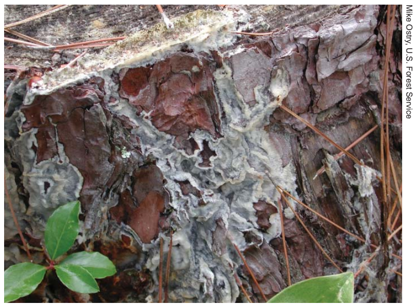
Phlebiopsis gigantea on pine stump.

Fungal note: This is the world's best known biological control fungus. Conidia naturally disseminated or purposely applied onto freshly cut pine stumps will prevent decay by Heterobasidon annosum . Widely used in Europe, its use is not yet approved in the U.S.