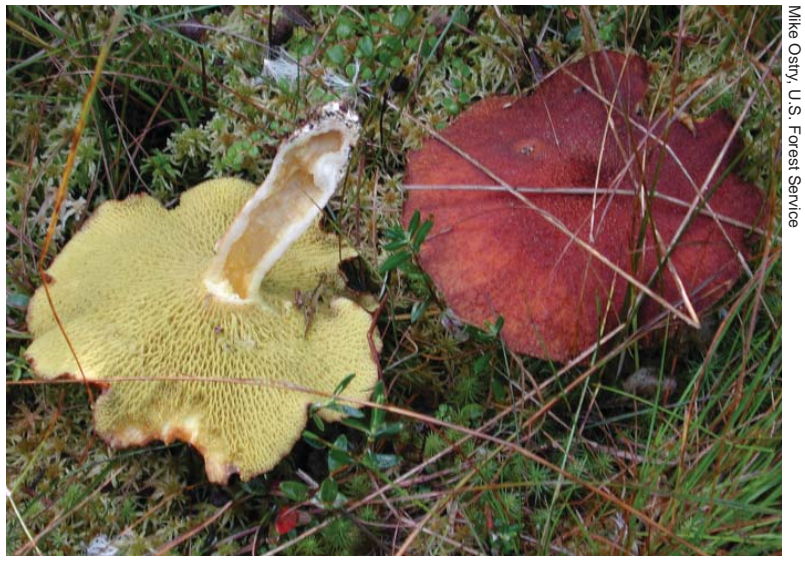
Suillus cavipes, top and bottom views. Note hollow stem.

Fungal note: Squirrels often cache this species in trees (Fig. 3).