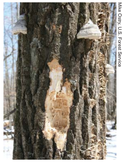
Figure 4.—Signs of woodpecker activity on aspen decayed by True Tinder Conk ( Fomes fomentarius ) and other decay fungi.