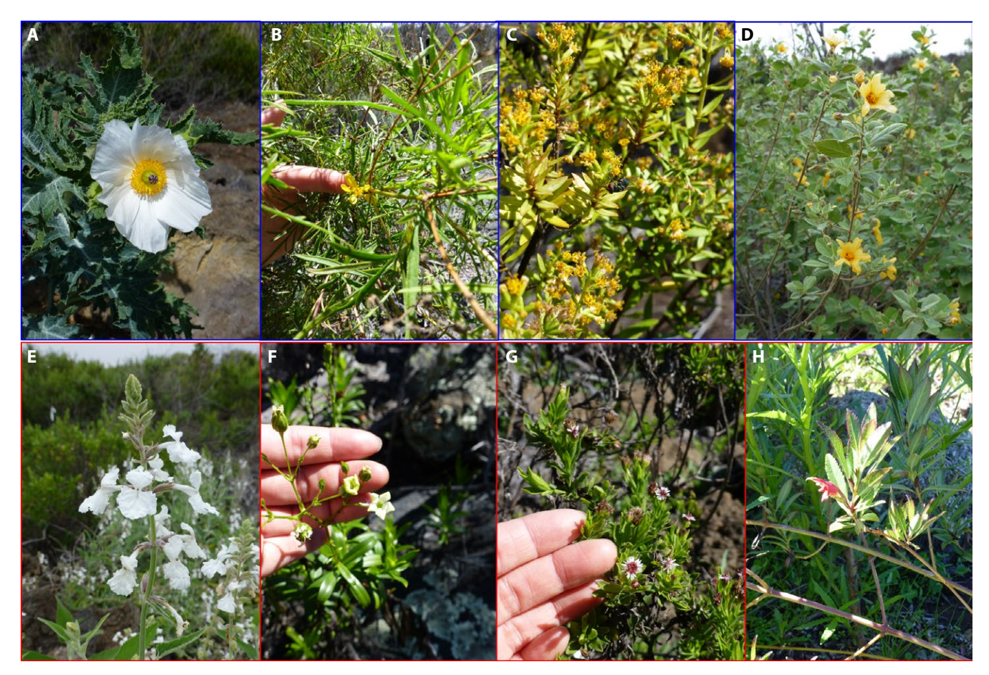
FIGURE 1. Flower characteristics of the focal plant species. Species A–D are common native plant species; species E–H are endangered plant species. (A) Argemone glauca (Papaveraceae): flower width 8.5 cm. (B) Bidens menziesii (Asteraceae): flower width 1.4 cm. (C) Dubautia linearis (Asteraceae): flower width 0.8 cm. (D) Sida fallax (Malvaceae): flower width 2.3 cm. (E) Haplostachys haplostachya (Lamiaceae): flower width 1.8 cm. (F) Silene lance olata (Caryophyllaceae): flower width 1.0 cm. (G) Tetramolopium arenarium (Asteraceae): flower width 1.0 cm. (H) Stenogyne angustifolia (Lamiaceae): flower width 0.7 cm.

capitula; flowers of S. fallax are pale yellow, ~2 cm across, produced singly or up to seven per node, and occur year-round (Wagner et al., 1999). Flowers of H. haplostachya are aromatic, bilaterally symmetrical, short, white tubes (~1.5 cm across) with enlarged lower corolla lobes, produced in a raceme with two flowers at each verticillaster, and plants produce flowers repeatedly throughout the year except in drought conditions; flowers of S. lanceolata are solitary short off-white tubes (~1 cm across), produced in spring, summer, and fall; flowers of S. angustifolia are ~2 cm long, bilaterally symmetrical tubes, with a reduced lip, ranging in color from red-orange to maroon and produced in pairs throughout the year except during drought conditions; flowers of T. arenarium are very small composites (<1 cm across) with white or pink corollas, borne on upright stems in clusters of 5–11 capitula, and senesce in drought conditions (Wagner et al., 1999; Fig. 1).