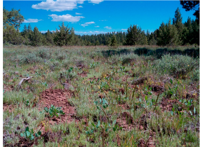
Figure 2. Barestem biscuitroot growing in an opening in a pinyon-juniper woodland in Oregon.

pinyon-juniper ( Pinus-Juniperus spp.) woodlands and pine forests (Fig. 2) (Hermann 1966; Munz and Keck 1973; Hickman 1993; Welsh et al. 2016; Hitchcock and Cronquist 2018). It is also common in Oregon white oak ( Quercus garryana ) woodlands and prairies in Oregon, Washington, and British Columbia (Pfeifer-Meister and Bridgham 2007; Marsico and Hellmann 2009). It was dominant in white oak remnant prairies at Mt. Pisgah southeast of Eugene, Oregon (Pfeifer-Meister and Bridgham 2007).