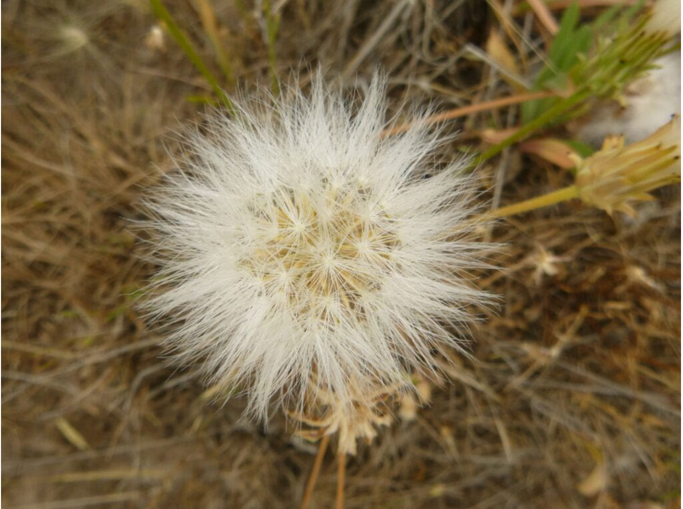
Figure 7. Pale agoseris seed head fully opened.

single mature pale agoseris plant of average size and growing with low competition in North Dakota was 34.25 seeds/seed head or capitulum (Stevens 1957). Seed fill can be limited by predation (Currah et al. 1983), which varies by location (Johnson 2008).