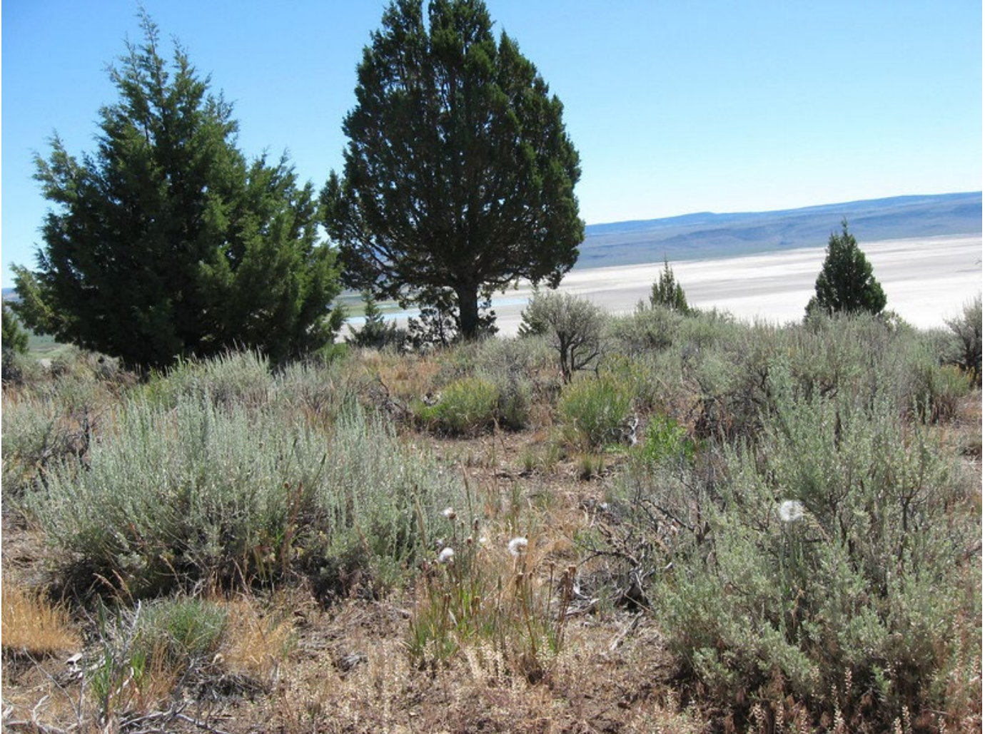
Figure 2. Pale agoseris setting seed in a sagebrush and juniper community in California.

1976). Throughout Red Butte Canyon near Salt Lake Valley, Utah, plants were common in fringe vegetation surrounding Gambel oak ( Quercus gambelii ) woodlands (Ehleringer et al. 1992). When understory communities in montane and subalpine forests were compared on the North Rim of the Grand Canyon in Arizona, pale agoseris was an indicator species in montane zone ponderosa pine ( P. ponderosa ) and ponderosa pine-Gambel oak forests (Laughlin et al. 2005). A variety of habitats were occupied in the Sangre de Cristo Mountains of Santa Fe County, New Mexico. Pale agoseris occurred at elevations of 7,050 to 12,450 ft (2,150Ð3,800 m) in montane meadows, Engelmann spruce-corkbark fir ( Picea engelmannii Ð Abies lasiocarpa var. arizonica ) forests, alpine meadows, and burned areas (Larson et al. 2014).