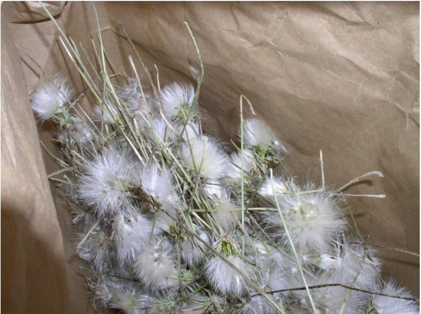
Figure 9. Collection of pale agoseris seed.

Plants often occur in low densities and must be hand collected (Fig. 9). Seed is stripped by gently grabbing the base of the seed head and pulling up with a loosely closed hand, focusing on collecting the seed rather than the stem or receptacle. This facilitates easier cleaning (Jensen 2007). Staff and researchers at the USDA Forest Service Provo Shrub Sciences Laboratory (PSSL) in Utah developed several tools and techniques for collecting small lots of pale agoseris (Jensen 2004). They built seed collection hoppers by sewing heavy-duty nylon cloth to a round frame such that the midpoint of the cloth dropped to form a basket to capture seeds. Hoppers also included adjustable straps to be worn around the collector's neck and back to distribute the weight and bulk of the hopper. For plants with open seed heads, badminton racquets were used to sweep ripe seeds into the hopper. If conditions were windy, however, seeds were hand-plucked from the heads (Jensen 2004).