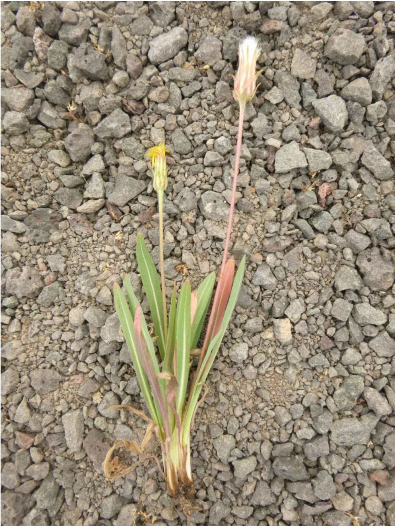
Figure 6. Pale agoseris plant with one fading flowerhead and one seed head. Variety glauca generally produces leaves with entire, straight margins. Leaf faces can be glaucous and glabrous to