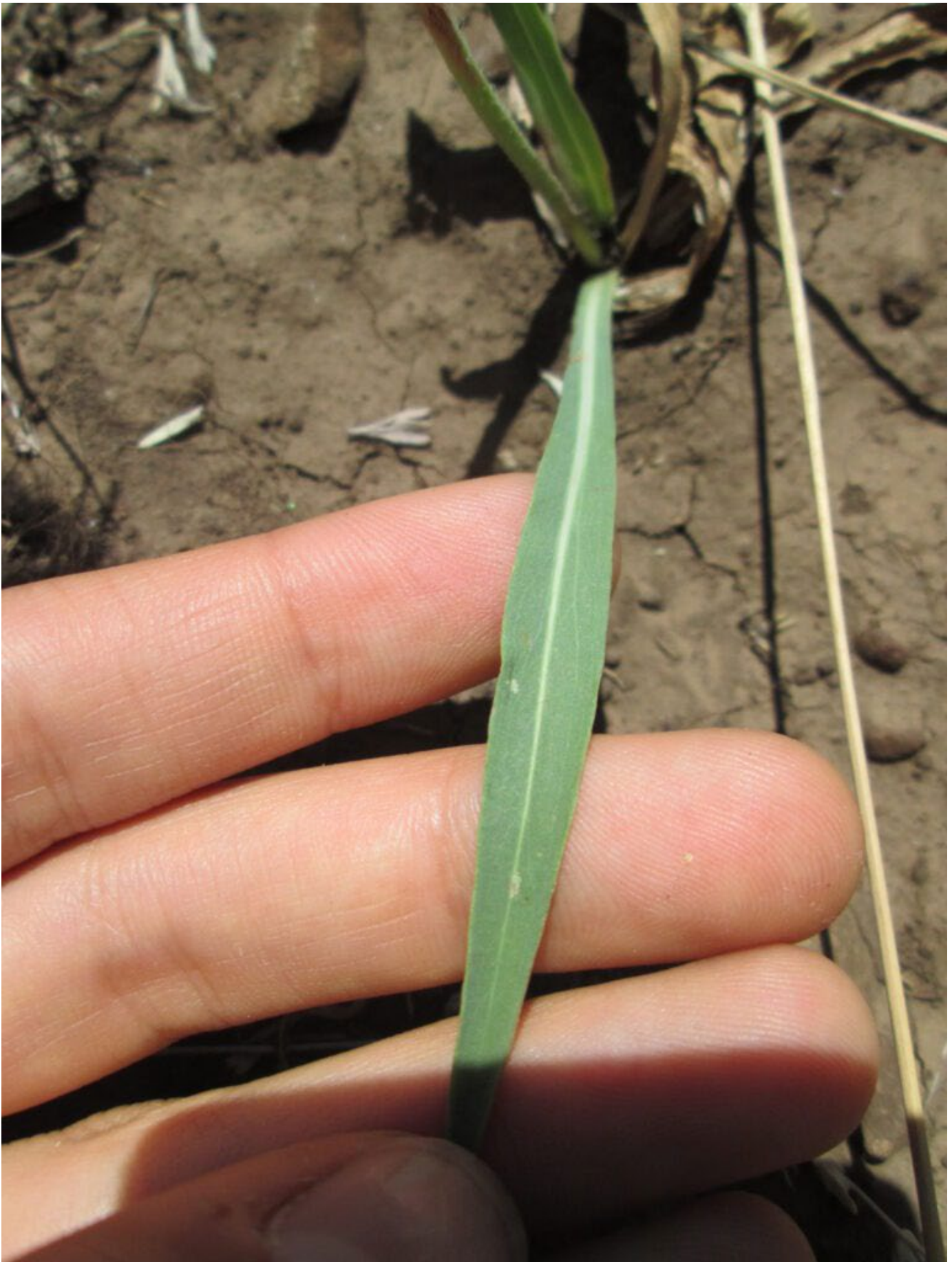
Figure 5. Entire, lanceolate basal pale agoseris leaf with a distinct midvein.

Flowerheads are perfect, flat-topped, and up to 2 in (5 cm) across when open (Stubbendieck et al. 1986; Luna et al.