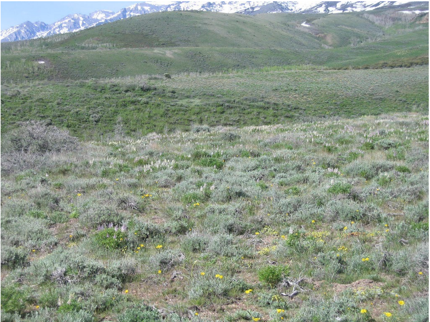
Figure 1. Pale agoseris in flower growing with sagebrush.