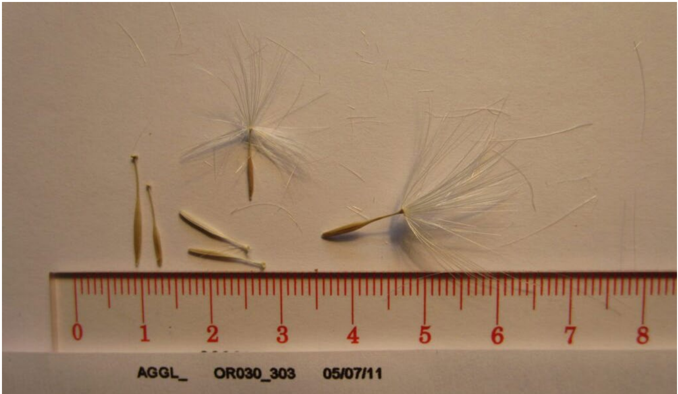
Figure 10. Individual pale agoseris seeds with and without their pappus. Scale in mm.

were rolled between two boards covered in soft leather until the pappus broke free from the seed. Final cleaning was done using air columns or an air screen machine (Jensen 2007).