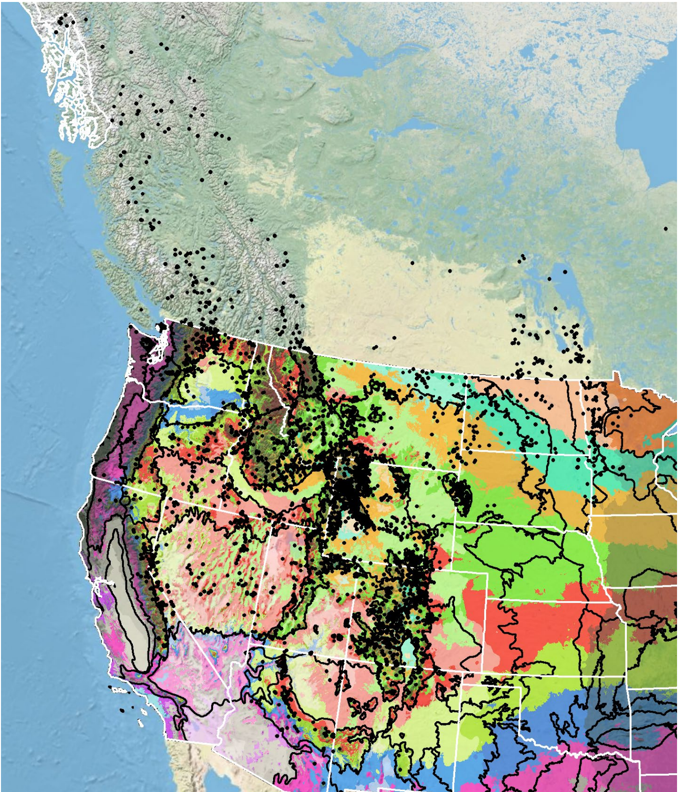
Figure 8. Distribution of pale agoseris (black circles) based on geo-referenced herbarium specimens and observational data from 1881–2016 (CPNWH 2023; SEINet 2023; USDI USGS 2020). Generalized provisional seed zones (colored regions) (Bower et al. 2014) are overlain by Omernik Level III Ecoregions (black outlines) (Omernik 1987; USDI EPA 2018). Interactive maps, legends, and a mobile app are available (USDA FS WWETAC 2017; www.fs.fed.us/wwetac/threat-map/TRMSeedZoneMapper2.php? ). Map prepared by M. Fisk, USDI USGS.