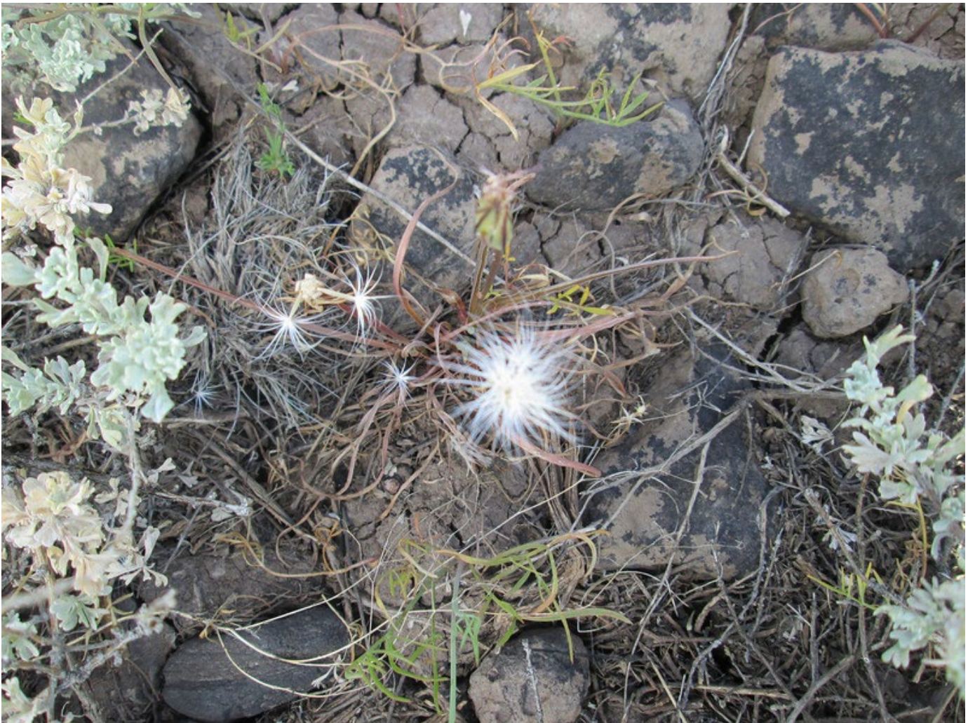
Figure 3. Pale agoseris setting seed at a rocky site in Oregon.

Pale agoseris is considered very adaptable, growing in many variations of soils and moisture conditions (USFS 1937). Density and size of plants can be greatest on open plateaus and well-drained glades with loose, gravelly, deep, clay loams (Sampson 1917). Well-drained, nutrient-poor, sandy to gravelly soils are described in pale agoseris habitats (USU Extension 2017; PFAF 2022). Variety glauca is common in wet meadows, on stream margins, swales, and other moist sites with slightly alkaline or saline silts, clays, and fine-textured soils. Variety dasycephala is common in dry to moist gravelly, rocky, and other coarse-textured soils (Fig. 3) (Baird 2006).