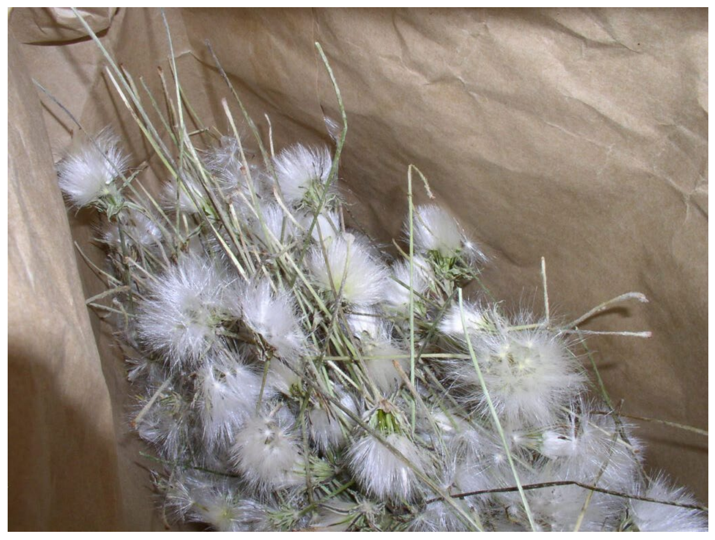
Figure 9. Collection of pale agoseris seed.

Plants often occur in low densities and must be hand collected (Fig. 9). Seed is stripped by gently grabbing the base of the seed head and pulling up with a loosely closed hand, focusing on collecting the seed rather than the stem or receptacle. This facilitates easier cleaning (Jensen 2007). Staff and researchers at the USDA Forest Service Provo Shrub Sciences Laboratory (PSSL) in Utah developed several tools and techniques for collecting small lots of pale agoseris (Jensen 2004). They built seed collection hoppers by sewing heavy-duty nylon cloth to a round frame such that the midpoint of the cloth dropped to form a basket to capture seeds. Hoppers also included adjustable straps to be worn around the collectorÕs neck and back to distribute the weight and bulk of the hopper. For plants with open seed heads, badminton racquets were used to sweep ripe seeds into the hopper. If conditions were windy, however, seeds were hand-plucked from the heads (Jensen 2004).