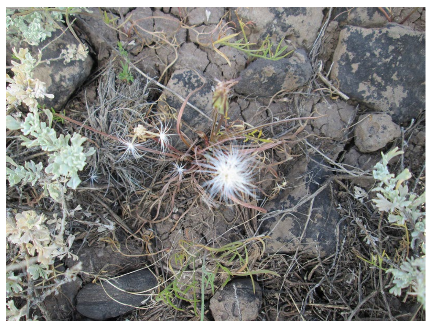
Figure 3. Pale agoseris setting seed at a rocky site in Oregon.

Pale agoseris is considered very adaptable, growing in many variations of soils and moisture conditions (USFS 1937). Density and size of plants can be greatest on open plateaus and well-drained glades with loose, gravelly, deep, clay loams (Sampson 1917). Well-drained, nutrient-poor, sandy to gravelly soils are described in pale agoseris habitats (USU Extension 2017; PFAF 2022). Variety glauca is common in wet meadows, on stream margins, swales, and other moist sites with slightly alkaline or saline silts, clays, and fine-textured soils. Variety dasycephala is common in dry to moist gravelly, rocky, and other coarse-textured soils (Fig. 3) (Baird 2006).