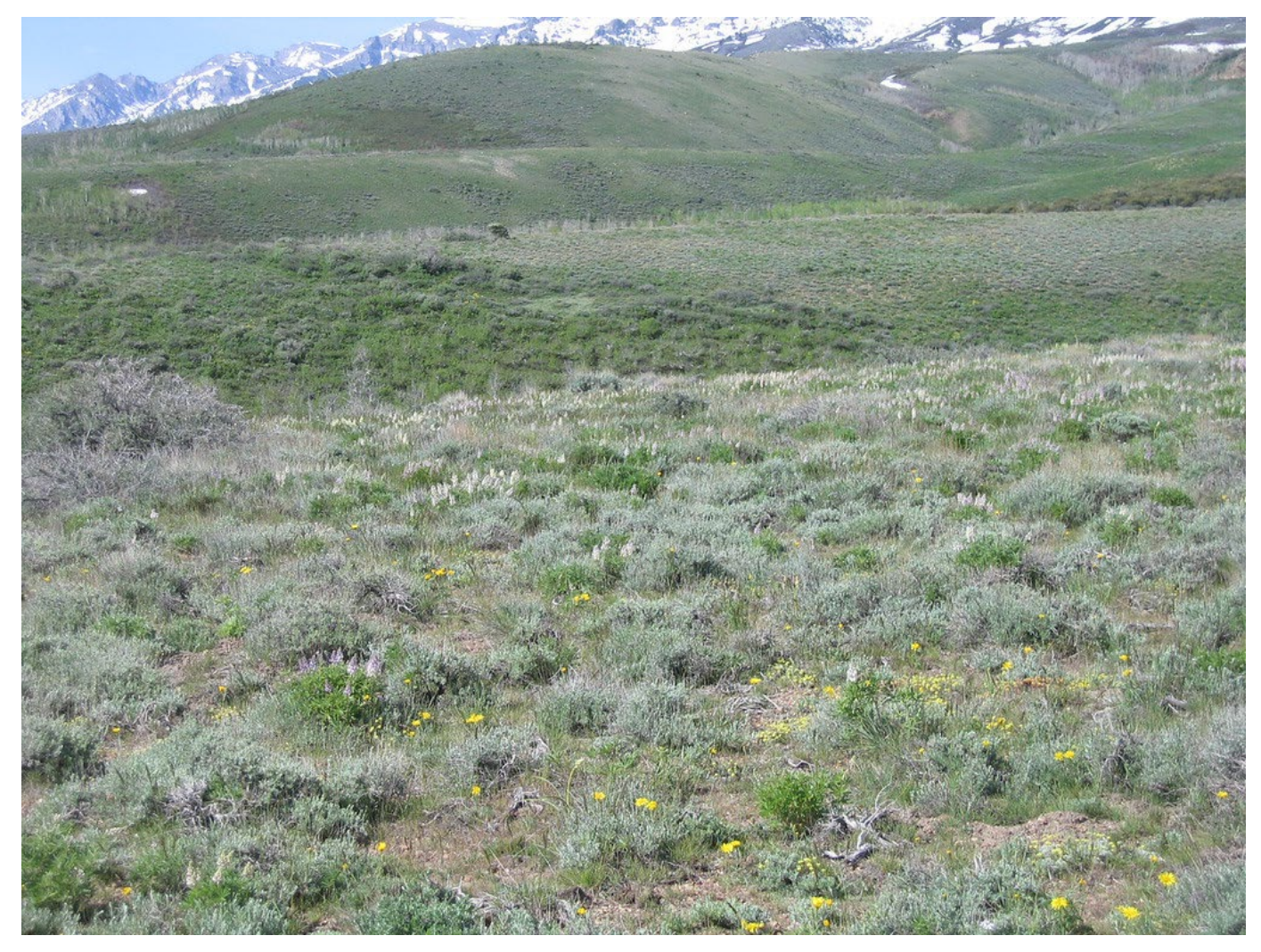
Figure 1. Pale agoseris in flower growing with sagebrush.