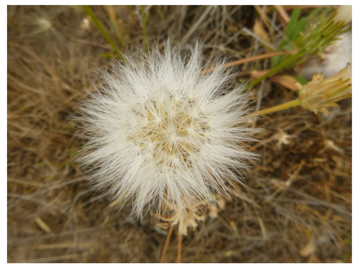
Figure 7. Pale agoseris seed head fully opened.

single mature pale agoseris plant of average size and growing with low competition in North Dakota was 34.25 seeds/seed head or capitulum (Stevens 1957). Seed fill can be limited by predation (Currah et al. 1983), which varies by location (Johnson 2008).