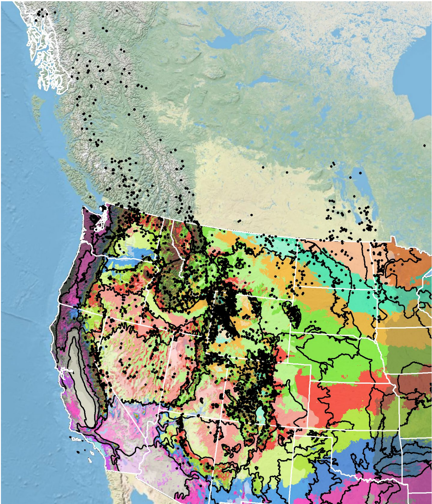
Figure 8. Distribution of pale agoseris (black circles) based on geo-referenced herbarium specimens and observational data from 1881D2016 (CPNWH 2023; SEINet 2023; USDI USGS 2020). Generalized provisional seed zones (colored regions) (Bower et al. 2014) are overlain by Omernik Level III Ecoregions (black outlines) (Omernik 1987; USDI EPA 2018). Interactive maps, legends, and a mobile app are available (USDA FS WWETAC 2017; www.fs.fed.us/wwetac/threat-map/TRMSeedZoneMapper2.php?). Map prepared by M. Fisk, USDI USGS.