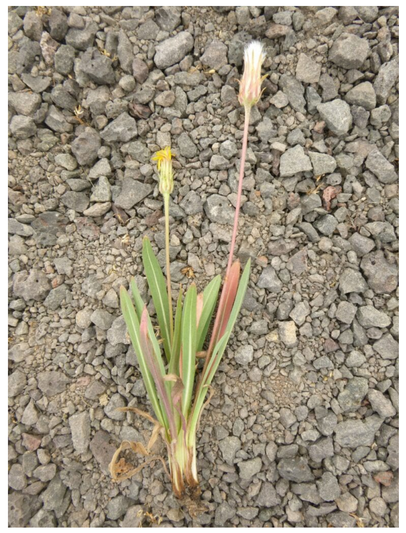
Figure 6. Pale agoseris plant with one fading flowerhead and one seed head. Variety glauca generally produces leaves with entire, straight margins. Leaf faces can be glaucous and glabrous to