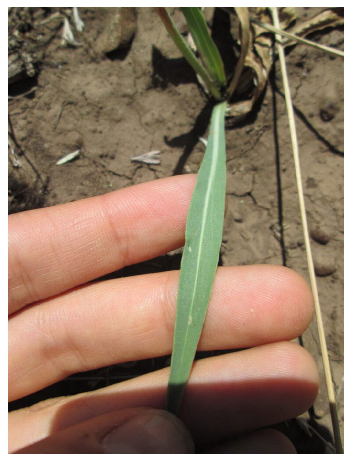
Figure 5. Entire, lanceolate basal pale agoseris leaf with a distinct midvein. Flowerheads are perfect, flat-topped, and up to 2 in (5 cm) across when open (Stubbendieck et al. 1986; Luna et al.