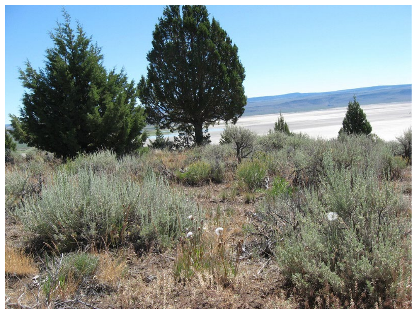
Figure 2. Pale agoseris setting seed in a sagebrush and juniper community in California.

1976). Throughout Red Butte Canyon near Salt Lake Valley, Utah, plants were common in fringe vegetation surrounding Gambel oak ( Quercus gambelii ) woodlands (Ehleringer et al. 1992). When understory communities in montane and subalpine forests were compared on the North Rim of the Grand Canyon in Arizona, pale agoseris was an indicator species in montane zone ponderosa pine ( P. ponderosa ) and ponderosa pine-Gambel oak forests (Laughlin et al. 2005). A variety of habitats were occuppied in the Sangre de Cristo Mountains of Santa Fe County, New Mexico. Pale agoseris occurred at elevations of 7,050 to 12,450 ft (2,150Đ3,800 m) in montane meadows, Engelmann spruce-corkbark fir ( Picea engelmaniiĐAbies lasiocarpa var. arizonica ) forests, alpine meadows, and burned areas (Larson et al. 2014).