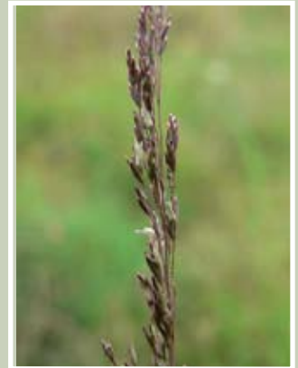
Native: river tussock

The weedy Parramatta grass ( Sporobolus africanus ) looks similar to the open, low-growing form. It has similar blue-green, hairless glossy leaves, a spreading growth habit, and the seed heads are black or grey in colour. However, they are a narrow spike, without spreading branches.