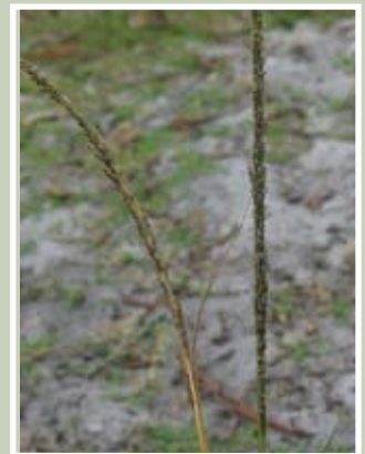
Weed: Parramatta grass

There are many native lovegrasses, some of which look a little similar. One such species is Eragrostis parviflora . It has long nodding seed heads that are more delicate but are also black or leaden grey in colour. It is usually a smaller plant. Paddock lovegrass ( Eragrostis leptostachya ) is a very common pasture plant that has a similar low-growing habit, with blue-green leaves, but the seed heads have short branches which stand out at right angles or even point backwards slightly from the main stem.