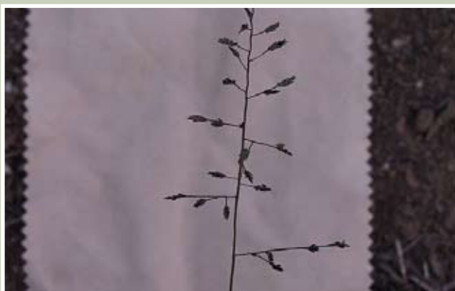
Native: paddock lovegrass