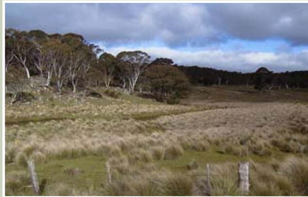
Native: 'river' or 'silver' tussock