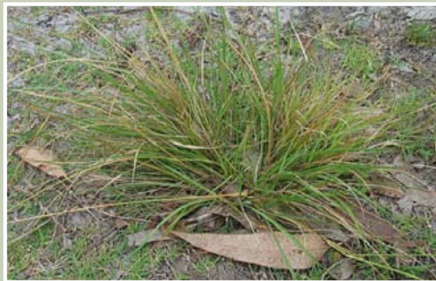
Weed: Parramatta grass