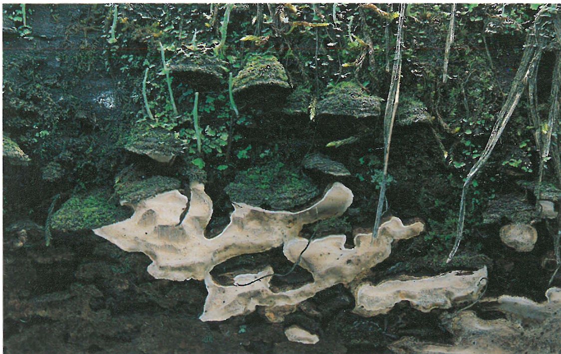
Fig. 4. Piloporia sajanensis (Parm.)Niemelä, photographed in situ. Fruit bodies (pale) growing below and on dead Trichaptum laricinum (P. Karsten) Ryv. Penttilä 2476, x 1.2 (H).

This species was first recorded from Finland by Niemelä (1982b), and Renvall et al. (1991) reported two new collections from northeastern Finland; they are not repeated here. P. sajanensis seems to be an extreme rarity throughout its range: it is known from two collections in Sweden (Strid 1981, Ryvarde 1986), one in European Russia and three collections in Siberia (Parmasto 1962, 1967). In Finland Picea abies is a slightly more favourable host (3 finds in all) than Pinus sylvestris (2 finds). Trichaptum laricinum (P. Karsten) Ryv. was the commonest associate species, in three cases; its distributional pattern is boreo-continental (see Renvall et al. 1991). P. sajanensis seems to be at least slightly boreo-continental, too, although the two new records from Finland, and one new find from Sweden (Ryvarde 1986) extend its range distinctly southwards. The above-listed Finnish records derive from the slightly continental easternmost frontier of the country. The specimen Penttilä 2476 bears beautiful pilei, dark sepia brown, up to 70 mm wide, and projecting 15 mm from the substrate.