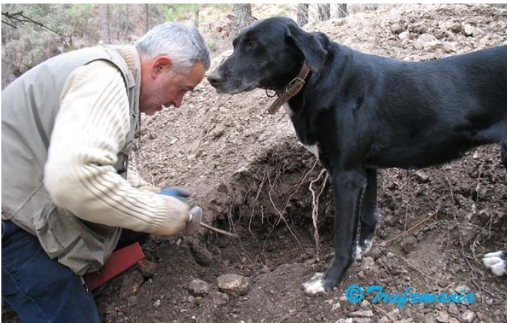
After the dog marks the truffle's position, the gatherer digs it up with a special knife

Not all species of truffles have commercial value, while those that do are divided into several categories. The places where some species of truffles grow can be found because they produce a clearing at the base of host trees called a burn or truffière.