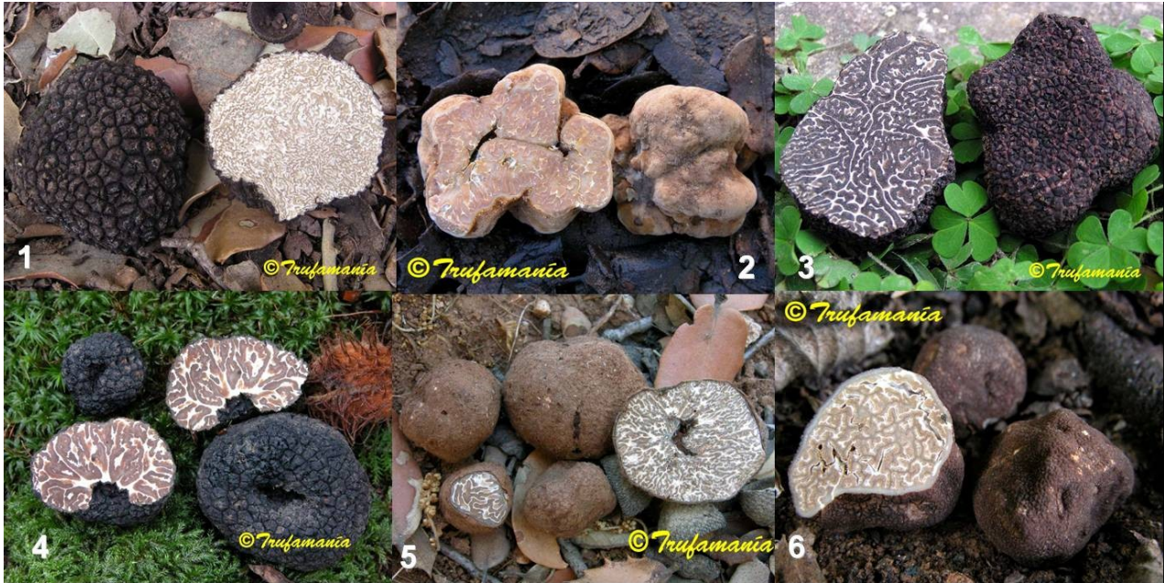
Different Iberian species of the genus Tuber : 1.- T. aestivum . 2.- T. excavatum . 3.- T. melanosporum . 4.- T. mesentericum . 5.- T. panniferum . 6.- T. rufum .