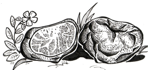
From left to right: Picoa lefebvrei and Terfezia claveryi