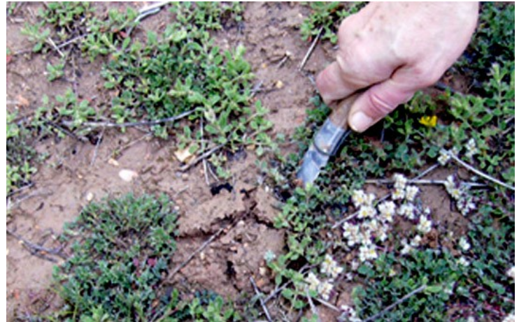
Desert truffle crack

Many species of truffles (genus Picoa , Terfezia , etc.), can be detected by a crack which opens on the surface of the ground. In this case, the help of a trained dog is unnecessary, since lots of practice and detailed observation of the terrain will enable us to find the truffles hidden beneath the cracks. The period for harvesting truffles depends on each species, although spring is the most normal time of year.