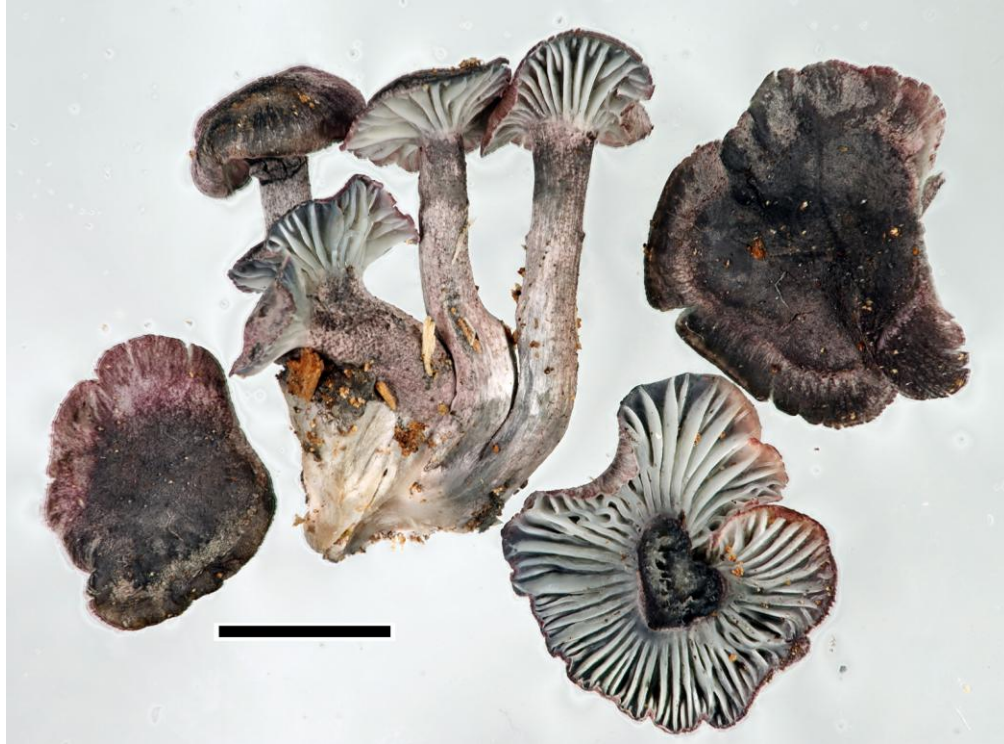
Panus sp. 'Ohakune (PDD80757)' J.A. Cooper ined. Collection PDD87665