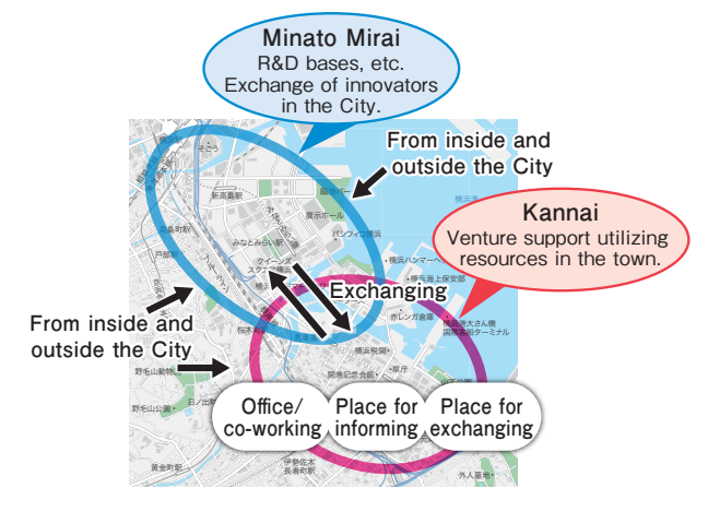
Figure 7 A part of the plan "Innovation City Yokohama".

As shown in Figure 7<sup>7)</sup>, presently, companies such as Murata Manufacturing Co., Ltd. and KYOCERA Corporation have established or are planning to establish R&D bases in Minato Mirai district.