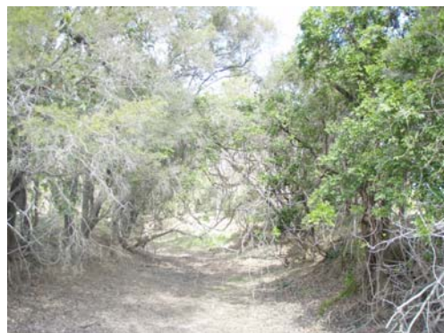
Site 14 understory