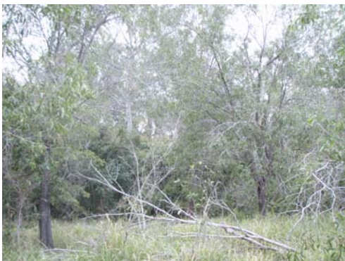
Site 40 (does not accurately depict riverine rainforest)