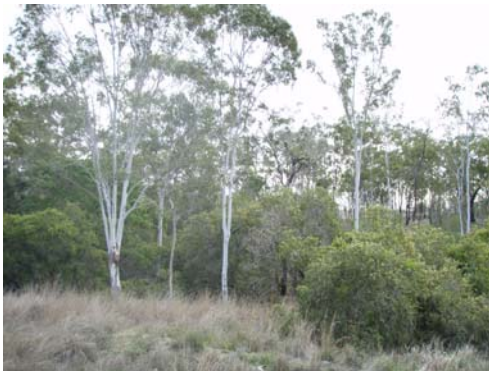
Site 30b upstream substitute