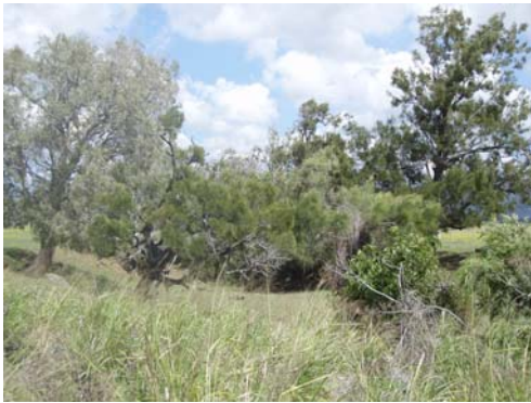
Site 8b upstream substitute