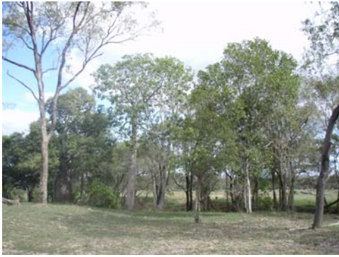
Site 14 overstorey