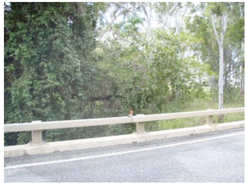
Site 8a upstream substitute