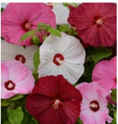
Hibiscus Luna Mixture