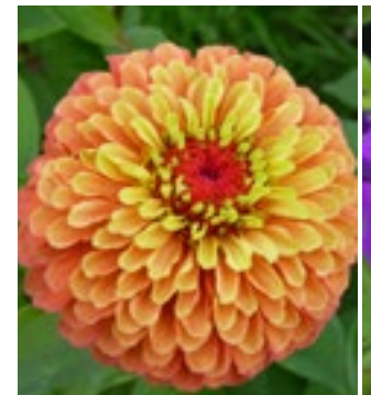
Zinnia Tall Queeny Lime Orange NEW