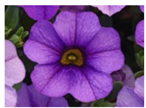
Calibrachoa Kabloom Denim NEW!

8 in. - Crop failure. As a substitute, we suggest Bells Marine.