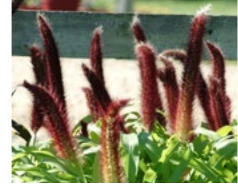
Millet Jade Princess