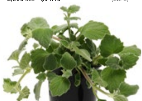
Plectranthus Silver Crest

100 sds - $8.60 200 sds - $16.30 500 sds - $30.30 1,000 sds - $50.70 2,000 sds - $94.40 (28F8)