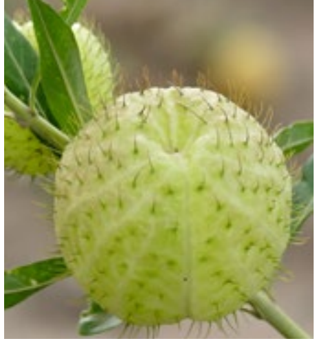
Asclepias Hairy Balls