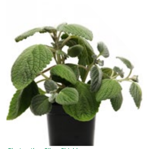
Plectranthus Silver Shield

250 sds - $6.90 1,000 sds - $15.70 500 sds - $10.70 2,000 sds - $35.90 5,000 sds - $52.50 (29A8)