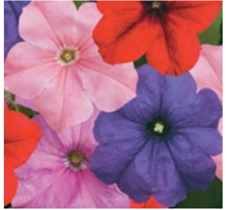
Petunia Duvet Mixture