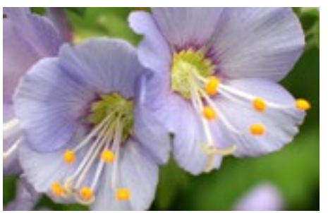
Polemonium Heavenly Habit

100 sds - $6.90 200 sds - $12.20 500 sds - $21.75 1,000 sds - $35.70 2,000 sds - $65.60 (28C8)