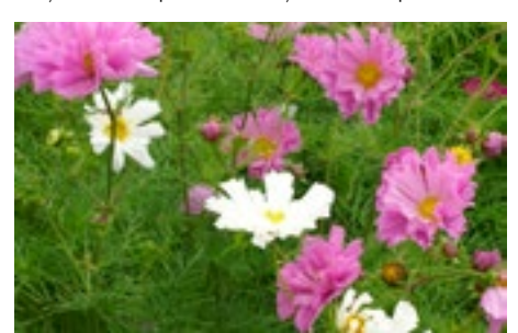
Cosmos Psyche Mixture

Each of the above: (30A8) 500 sds - $6.90 1,000 sds - $8.65 2,000 sds - $12.80 5,000 sds - $23.70 10,000 sds - $39.50