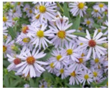
Aster Zig Zag NEW!