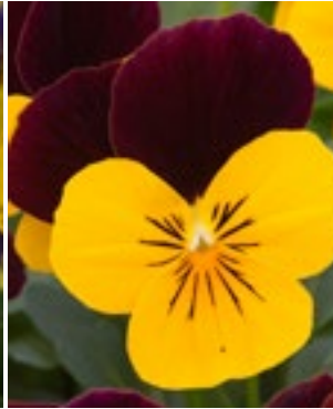
Viola Sorbet Yellow Burgundy Jump Up NEW