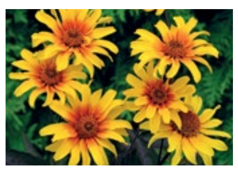
Heliopsis Burning Hearts NEW!

Discontinued. As a substitute, we suggest Rose.