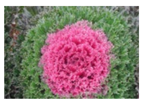
Kale Glamour Red

Each of the above: (28E8) 100 sds - $8.05 200 sds - $14.95 500 sds - $27.45 1,000 sds - $45.70 2,000 sds - $84.80