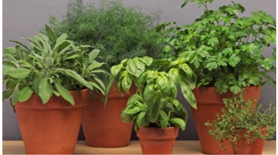
Simply Herbs - Sage, Dill, Basil, Parsley and Thyme