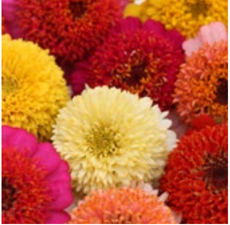
Zinnia Cupcake Mixture