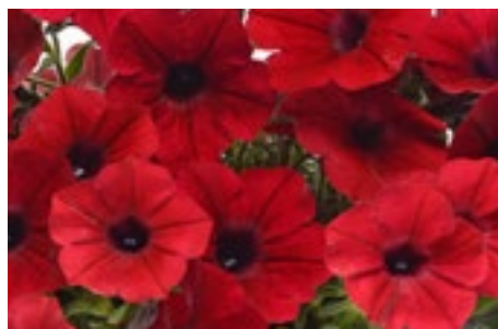
Petunia Tidal Wave Red Velour

Crop failure. As a substitute, we suggest Easy Wave Neon Rose (pelleted).