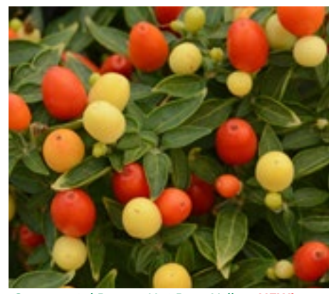
Ornamental Pepper Hot Pops Yellow NEW!

Each of the above: (25C8) 25 sds - $7.80 50 sds - $14.40 100 sds - $21.75 250 sds - $43.85 500 sds - $74.70