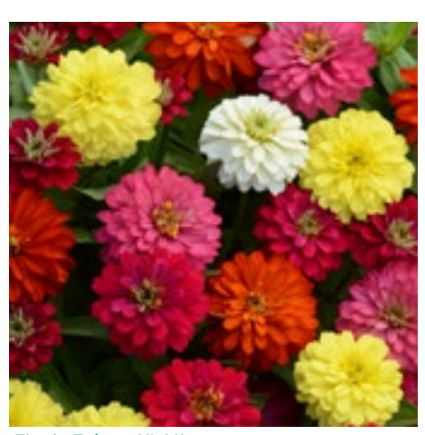
Zinnia Zahara XL Mixture

100 sds - $8.60 200 sds - $16.30 500 sds - $30.30 1,000 sds - $50.70 2,000 sds - $94.40 (28F8)