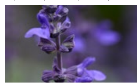
Salvia Big Blue NEW!

Each of the above: (28D8) 100 sds - $7.50 200 sds - $13.55 500 sds - $24.60 2,000 sds - $75.20 1,000 sds - $40.70