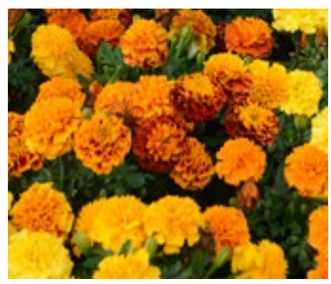
Marigold Hot Pak Mixture

Crop failure. As a substitute, we suggest Hot Pak Gold.