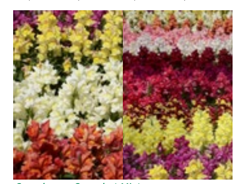
Snapdragon Snapshot Mixture

Each of the above: (29A8) 250 sds - $6.90 500 sds - $10.70 1,000 sds - $15.70 5,000 sds - $52.50 2,000 sds - $35.90