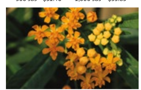
Asclepias Silky Gold