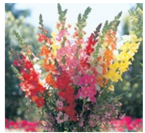
Snapdragon Chantilly Mixture