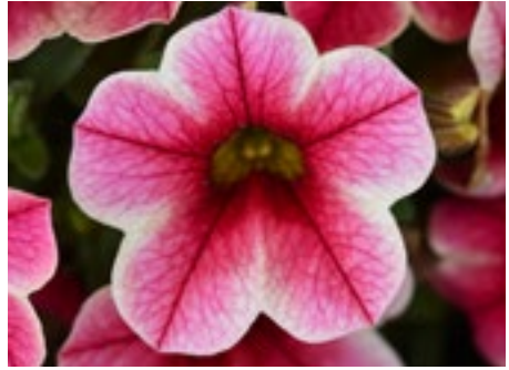
Calibrachoa Strawberry Star