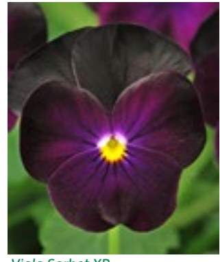
Viola Sorbet XP Blackberry NEW