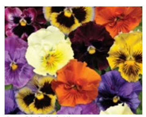
Pansy Frizzle Sizzle Mixture

Discontinued. As a substitute, we suggest Matrix Solar Flare.