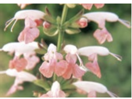
Salvia Summer Jewel Pink

30 in. - 18,500 S. S. coccinea. (Texas Sage). Large, bright scarlet spikes. Zones: 7-9