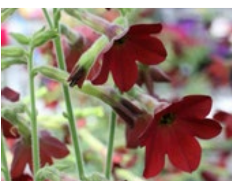
Nicotiana Baby Bella