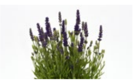
Lavandula Blue Spear