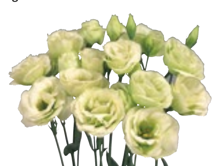
Lisianthus Rosita Green

Discontinued. As a substitute, we suggest Regatta Marine Blue.