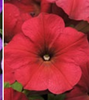
Petunia Easy Wave Berry Velour