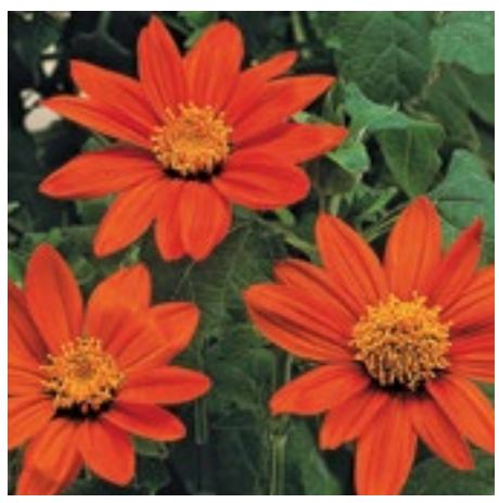
Tithonia Fiesta Del Sol NEW!