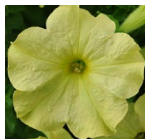
Petunia Sophistica Lime Bicolor

Each of the above: (29B8) 250 sds - $7.60 1,000 sds - $20.30 500 sds - $13.40 2,000 sds - $34.30 5,000 sds - $70.85