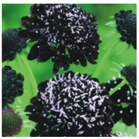
Scabiosa Black Knight NEW!