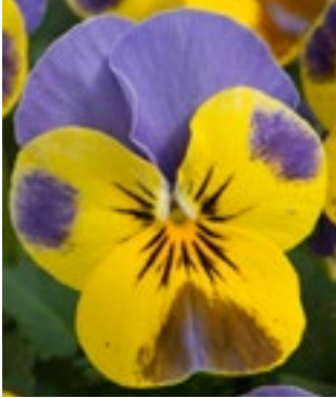
Viola Sorbet Yellow Blue Jump Up NEW