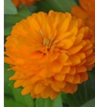
Zinnia Zahara Double Bright Orange NEW