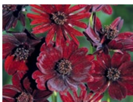
Cosmos Black Magic NEW!