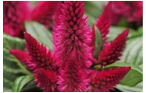
Celosia Cosmo Cherry