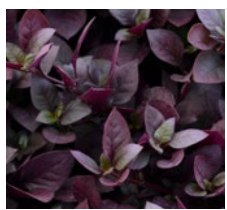
Alternanthera Purple Prince

Each of the above: (30B8) 500 sds - $6.90 2,000 sds - $15.90 1,000 sds - $10.45 5,000 sds - $31.20 10,000 sds - $52.85