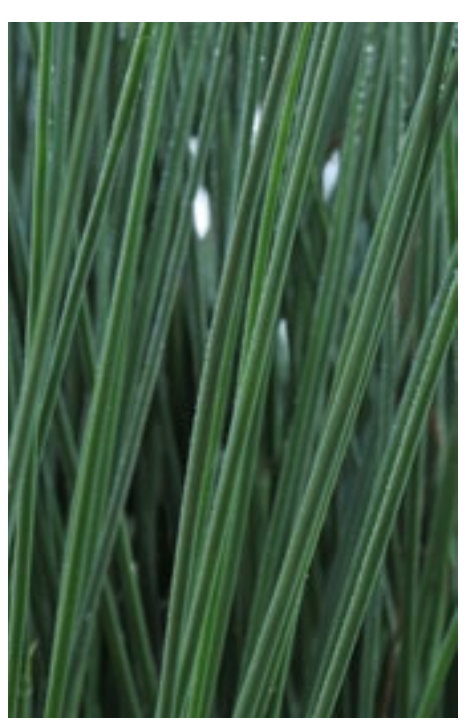
Juncus Blue Arrows

Each of the above: (30A8) 500 sds - $6.90 1,000 sds - $8.65 2,000 sds - $12.80 5,000 sds - $23.70 10,000 sds - $39.50