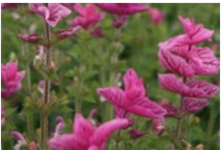
Salvia Pink Sunday