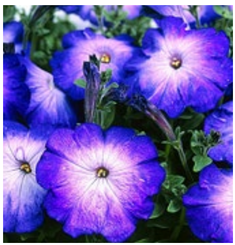
Petunia Merlin Blue Morn

Each of the above: (29A8) 250 sds - $6.90 500 sds - $10.70 1,000 sds - $15.70 2,000 sds - $35.90 5,000 sds - $52.50