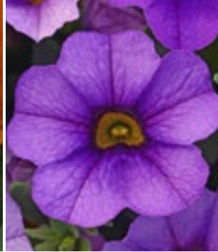
Calibrachoa Kabloom Denim NEW