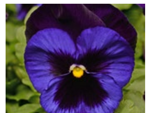
Pansy Matrix Denim NEW!

Each of the above: (25C8) 25 sds - $7.80 50 sds - $14.40 100 sds - $21.75 250 sds - $43.85 500 sds - $74.70