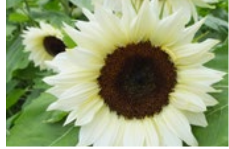
Sunflower Pro Cut White Nite NEW!