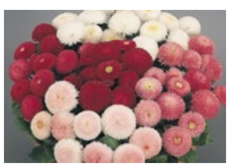
Bellis Tasso Mix

24 in. - 4,000 S. Plants are composed of several base-branching stems, each closely set with spikes of large bell-like sheaths of translucent green surrounding a small white flower. Wonderful as a fresh cut flower, or when dried for use in winter bouquets.