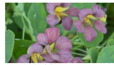
Nasturtium Purple Emperor