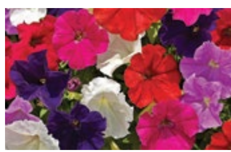
Petunia Picobella Mixture

Crop failure. As a substitute, we suggest Picobella Mixture (pelleted).