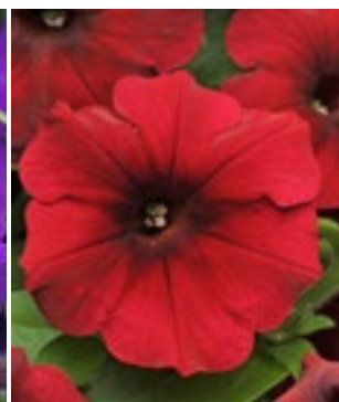
Petunia Easy Wave Red Velour