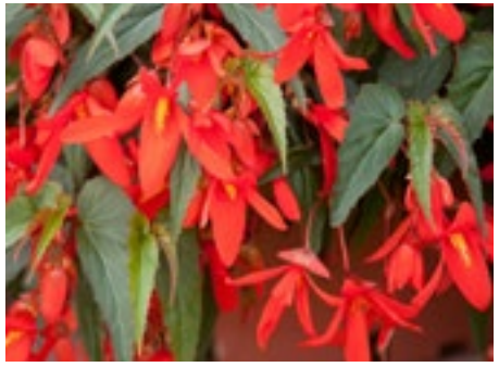
Begonia Santa Cruz