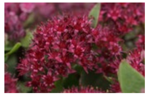
Sedum Surrender Red