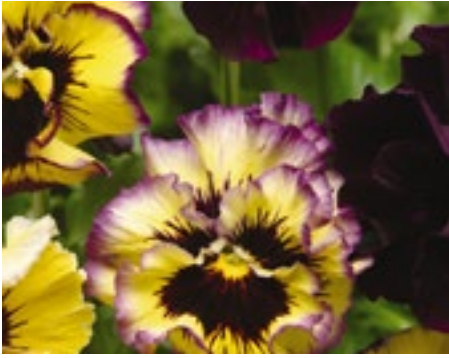
Pansy Fizzy Lemonberry

Crop failure. As a substitute, we suggest Matrix Series.