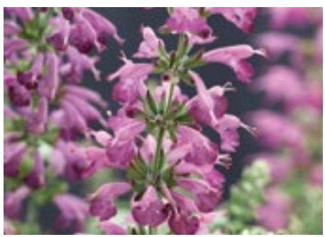
Salvia Summer Jewel Lavender

Perennial. 12 in. - Discontinued. As a substitute, we suggest Dwarf Blue Queen.