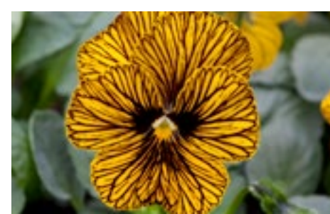
Viola Tiger Eye Yellow

Each of the above: (30E8) 500 sds - $8.85 1,000 sds - $15.85 2,000 sds - $25.90 5,000 sds - $53.20 10,000 sds - $92.55