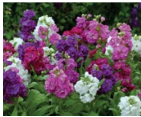
Stocks Hot Cakes Mixture

Perennial. 4 in. - Discontinued. As a substitute, we suggest Strawberry Baron Solemacher.