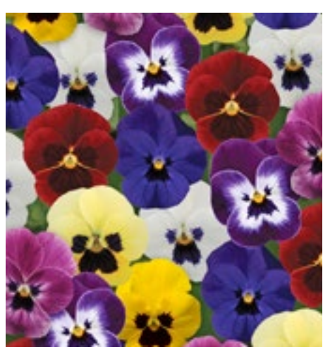
Viola Sorbet Blotch Mixture

Each of the above: (2888) 100 sds - $6.90 200 sds - $10.80 500 sds - $18.90 1,000 sds - $30.70 2,000 sds - $56.00