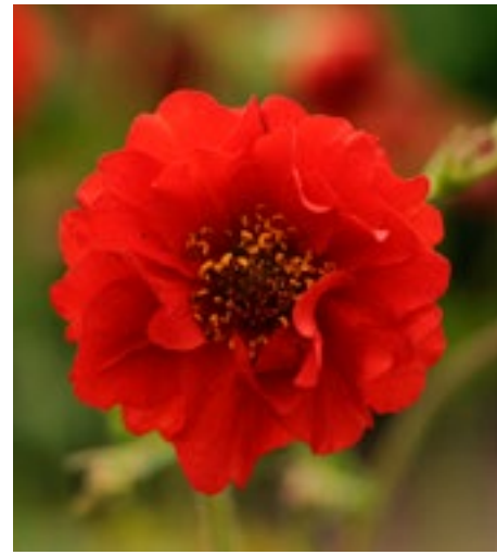
Geum Blazing Sunset