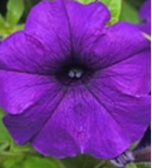
Petunia Combo Blue