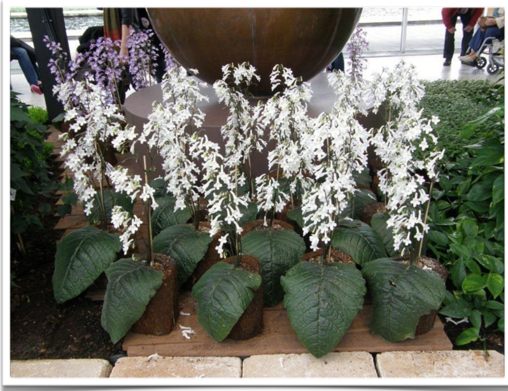
"I shot these photos in April at the 2012 Floriade in Venlo, the Netherlands. Photo below is the more usual lavender color." Elvin (See next page to learn more about Elvin McDonald)