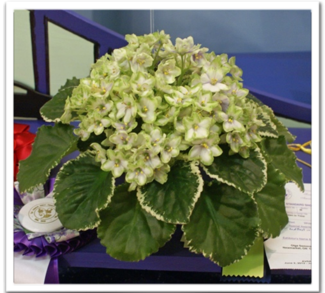
Best Standard — Saintpaulia 'Frozen in Time' Olga Semova