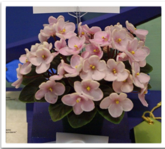
Best Semiminiature — Saintpaulia 'Pink Playmate' Tracy Lorence