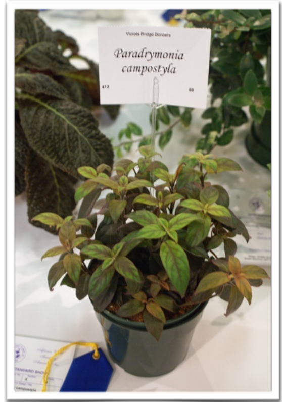
Paradrymonia campostyla - Gary Dunlap