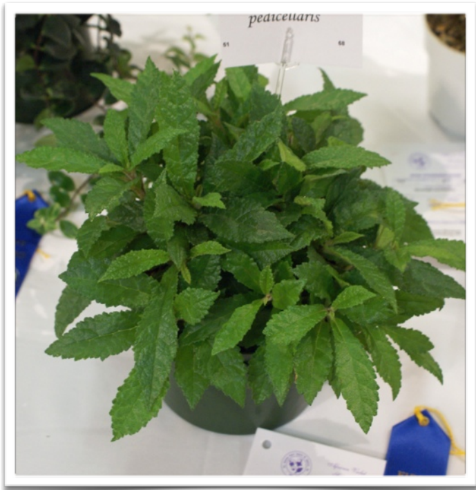
Gesneria pedicellaris