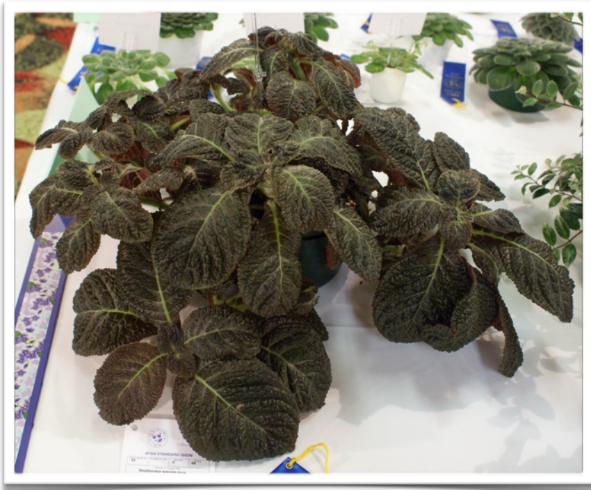
Nautilocalyx species nova - Paul Kroll