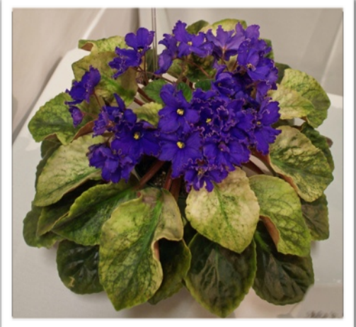
Saintpaulia 'Heinz's Desert Song' Donna Brining