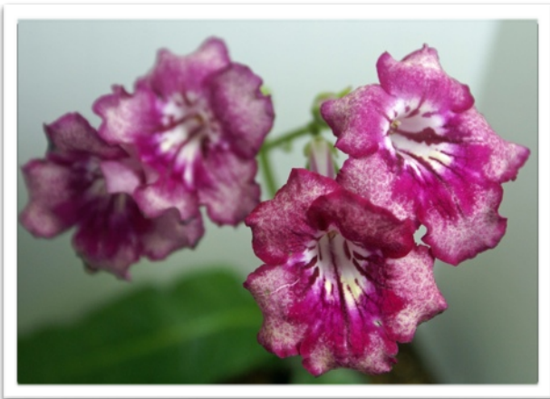
Streptocarpus 'Strawberry Cheesecake'

http://stores.ebay.com/David-Thompsons-Plants/Streptocarpus-Information.html