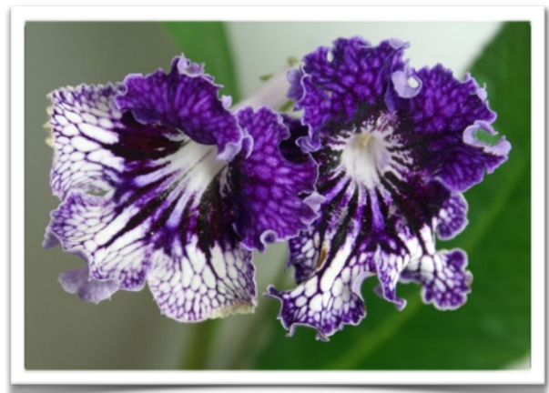
Streptocarpus 'TsF-Zhizel' introduced in Russia