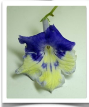
Streptocarpus 'Sulphur Mine'