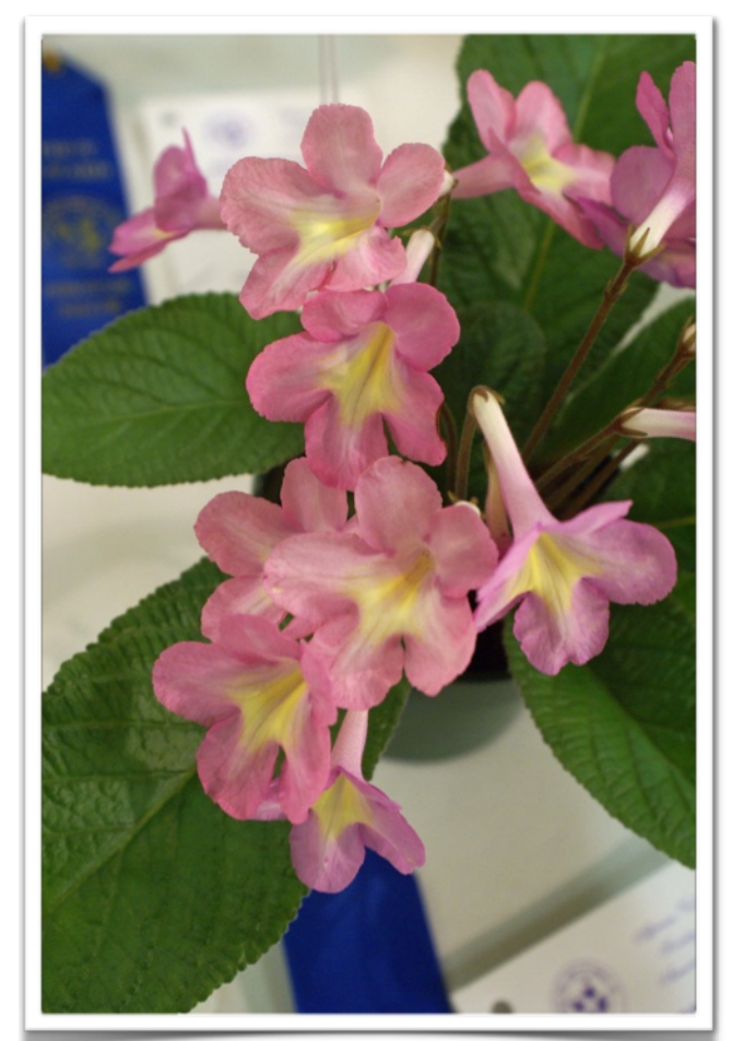
Streptocarpus 'Bristol's Potpourri' - Tracy Lorence