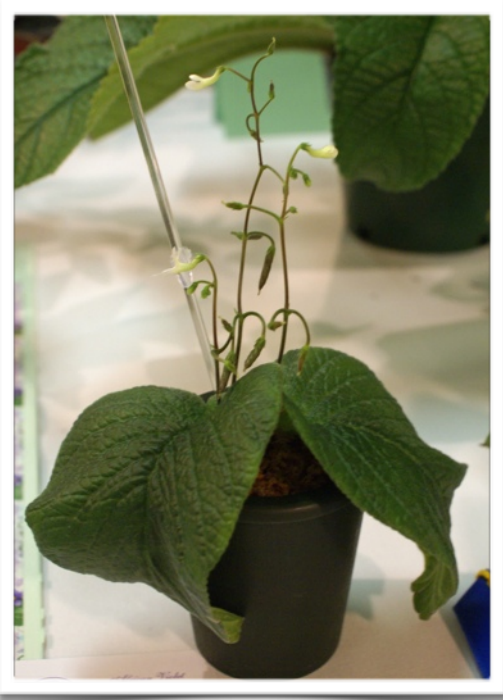
Streptocarpus pusillus JT 04-02 - Dale Martens