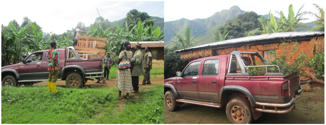
CAMGEW-MIVA Vehicle bring hope to communities and protecting the Kilum-Ijim forest