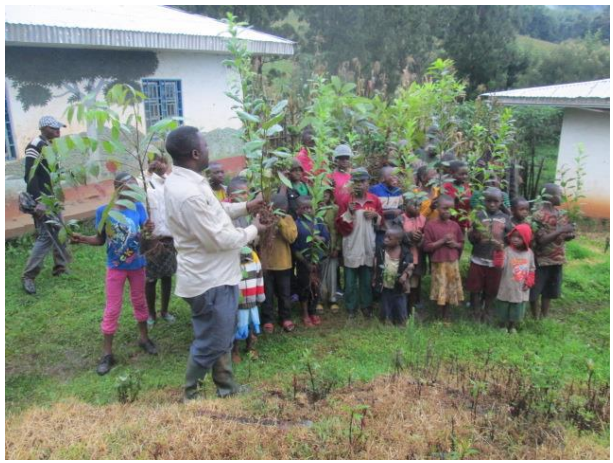
Community youths take part in tree planting in the Kilum Forest.