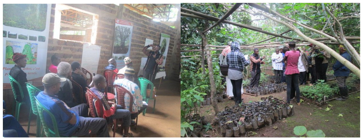
Tree planting lesson sharing and tree nursery development field work