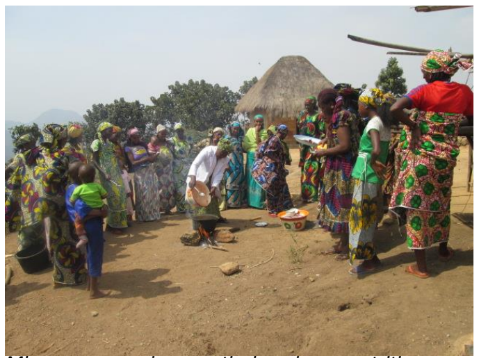
Mbororo women in a practical session on nutrition

The second workshop took place in February 2016 with the Mbororo community at Akeh. During sensitisation, the women and girls proposed that rice should be the meal for demonstration during workshop. Boiled rice and enriched groundnut soup was chosen as the meal for demonstration. This meal has as main ingredients white rice, groundnut, fresh fish (optional), crayfish, vegetable oil, fresh tomatoes, onion, salt and magi to taste, ginger and garlic. This meal is rich in calories, protein, vitamin, calcium and potassium.