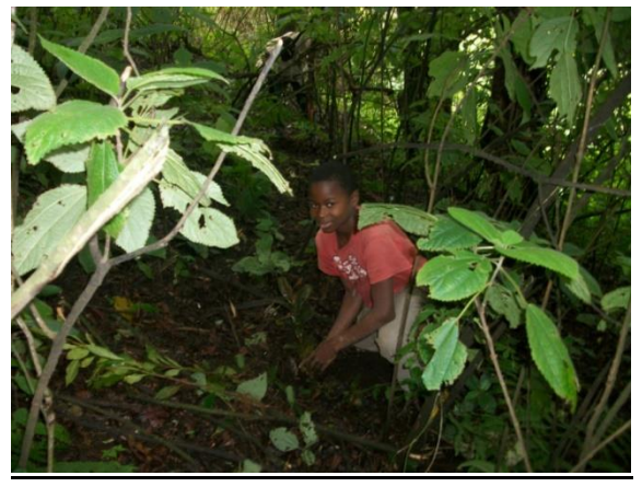
Kejem-Mawes and Mluoin community children plants trees and says they will like to see the tree in 20 years.