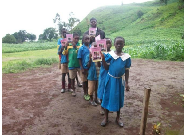
School children receive booklets on environmental education. The booklet was produced with articles written by the children