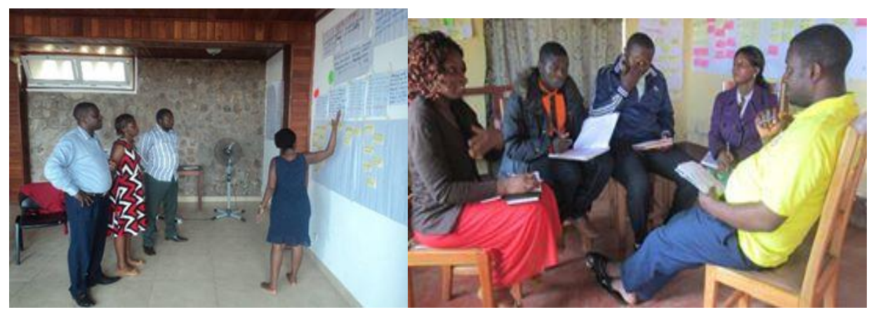
CAMGEW and Well Grounded in Organisational Development Process

CAMGEW continued working with Well Grounded on organizational development in 2016. This included work on CAMGEW's organisational strategy; development of its internal structure and governance; and reflection on CAMGEW's organisational culture. CAMGEW's values were defined and we looked at ways to keep these values.