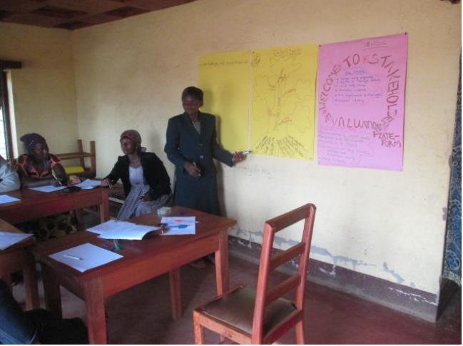
Oku Female leaders discuss issues raised in project and make recommendations for the way forward