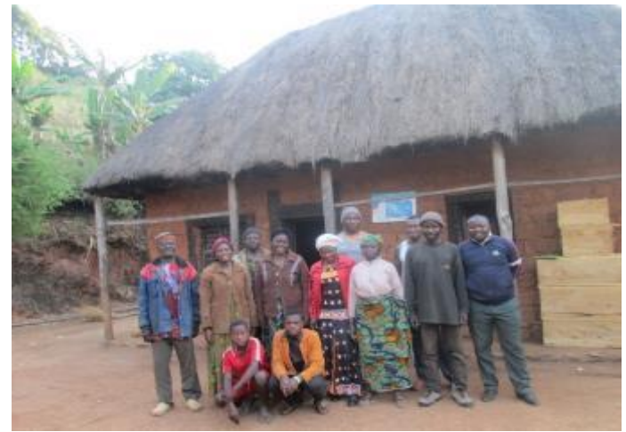
Delegates at Liakom