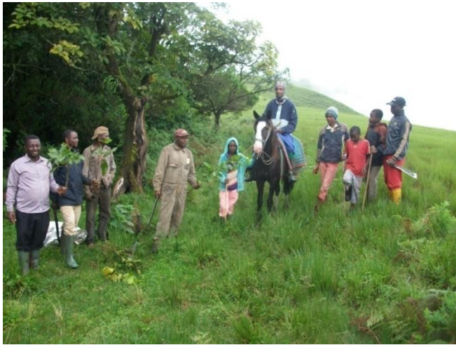
CAMGEW engages talks with indigenous Mbororo on the conservation of the Kilum-Ijim Forest for posterity