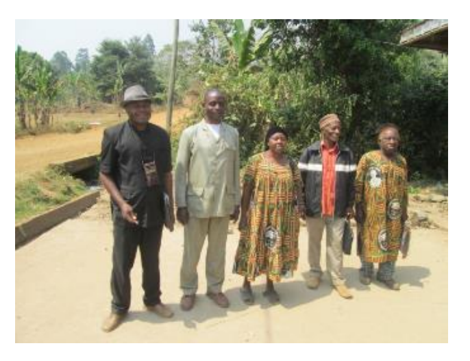
Delegates elected at MULION-NJINIKOM