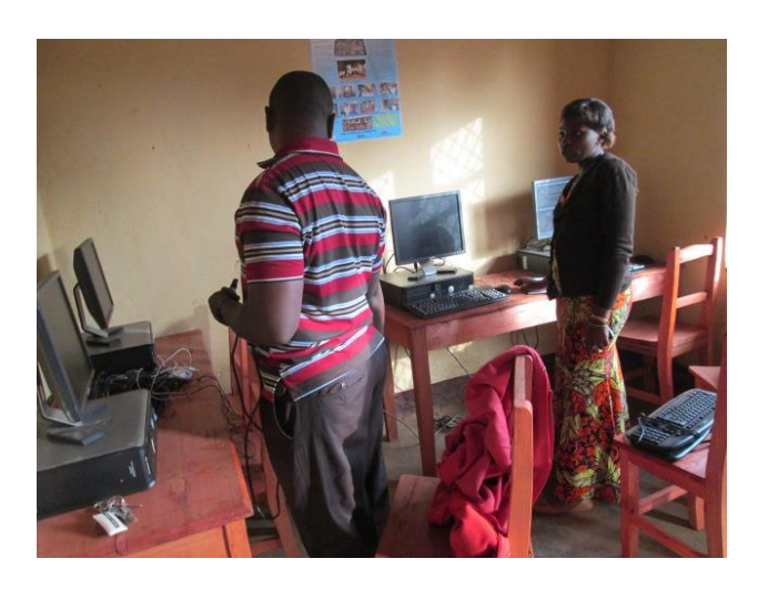
Setting up of the computer literacy centre