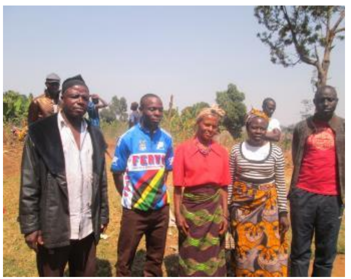
Delegates at Mboh