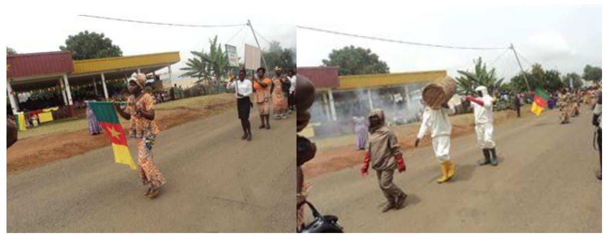
CAMGEW celebrates International Women's Day 2016

Remarkable was the workshop of 8<sup>th</sup> March 2016, a day Cameroon women join the international community to celebrate international women's day. This day was celebrated in Cameroon under the theme 'EQUALITY AND WOMEN EMPOWERMENT: MEETING THE CHALLENGES AND OVERCOMING THE OBSTACLES'. CAMGEW took part in the march-pass and had an interactive workshop with women on child trafficking and legalization of marriages.