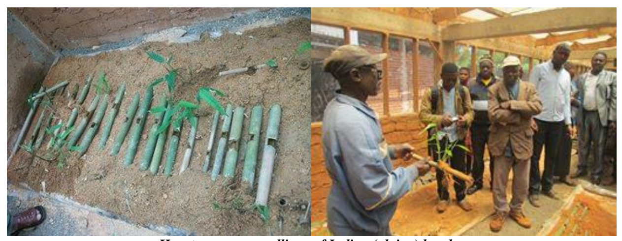
How to prepare seedlings of Indian (alpine) bamboo

CAMGEW visited African Centre for Renewable Energies and Sustainable Technologies (ACREST) at Bangang in West Region of Cameroon to share experience on the regeneration of Kilum-Ijim forest and learn from ACREST Mount Bamboutos regeneration programme. This visit brought together project stakeholders of Bamboutos area to learn and share experiences. There was experience sharing in the hall with participants and field-base sharing in the ACREST tree nursery. CAMGEW learned from ACREST how to nurse Alpine bamboo. CAMGEW and other participants visited the renewable energy systems and sustainable technologies in ACREST like improved stoves, improved charcoal, hydro turbines, biogas system, etc. CAMGEW also shared with ACREST forest regeneration skills on Kilum Mountain. ACREST is planting useful trees in Mount Bamboutos. The exchange visit was from 26th to 28th July 2016.