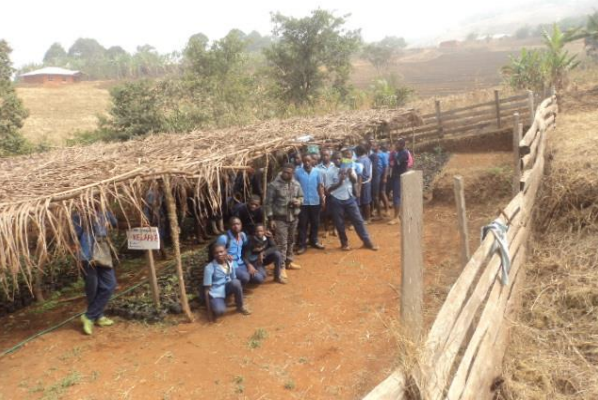
Forest and Nursery Education for the Mbororo close to Ijim Forest and students respectively.