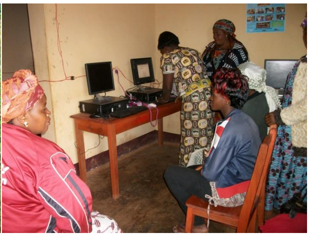
Women in group work on how to make business work