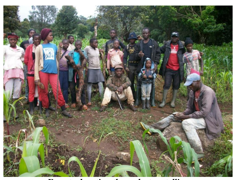
Forest education through story telling

CAMGEW has recently searched for ways to do forest education in a way that can be interesting, full of humor and entertaining. She has used some community elders with knowledge on the Kilum-Ijim forest to tell stories about the forest especially on how the forest used to be in the past, how they used the forest, how defaulters were punished, how bushfire was handled when it occurred, the role of the fon and tradition in the forest and the work of Birdlife International in Kilum-Ijim forest conservation. CAMGEW found this interesting and it was also appreciated by children and youths. CAMGEW will start using story telling about Kilum-Ijim forest for forest sensitization and education.