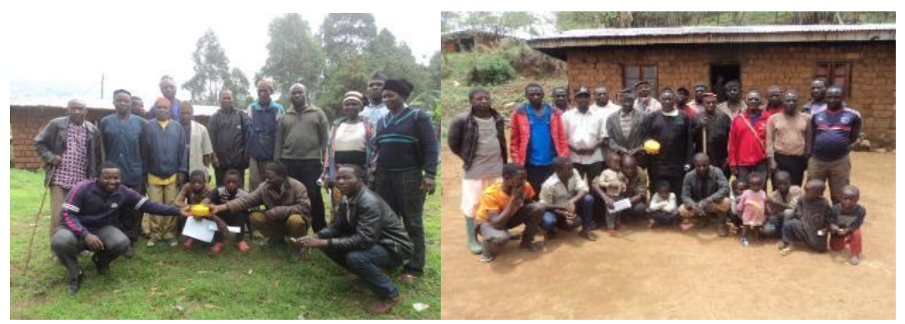
Group pictures of participants in Tumuku and Lang

CAMGEW used a participatory approach in trainings. 116 community members were trained in 8 workshops. 21 women and 95 men received the trainings on wax production around the Kilum-Ijim forest.