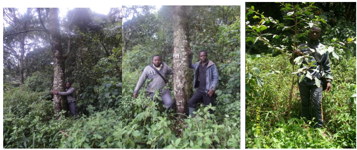
CAMGEW staffs on routine check monitor planted trees and check forest boundary lines marked with Prunus africana trees. The circumferences are measured by staff.

Monitoring of planted trees and the forest has been on regular basis. On daily basis by community members who report to CAMGEW team. On weekly bases, CAMGEW team go to the forest to follow-up forest regeneration activities (both natural and by man). Forest users enter the forest on daily basis either for firewood fetching, animal trapping, harvesting of bamboo, harvesting herbs, harvesting vegetables and bee farming. These people work in collaboration with CAMGEW team and report every irregularity in the forest. It is for this reason that CAMGEW prefer to use forest users to maintain the trees planted so that they continue to see CAMGEW as their partner and know that the forest belongs to them. CAMGEW report irregular activities to the local authorities and thus allows justice to take its course.