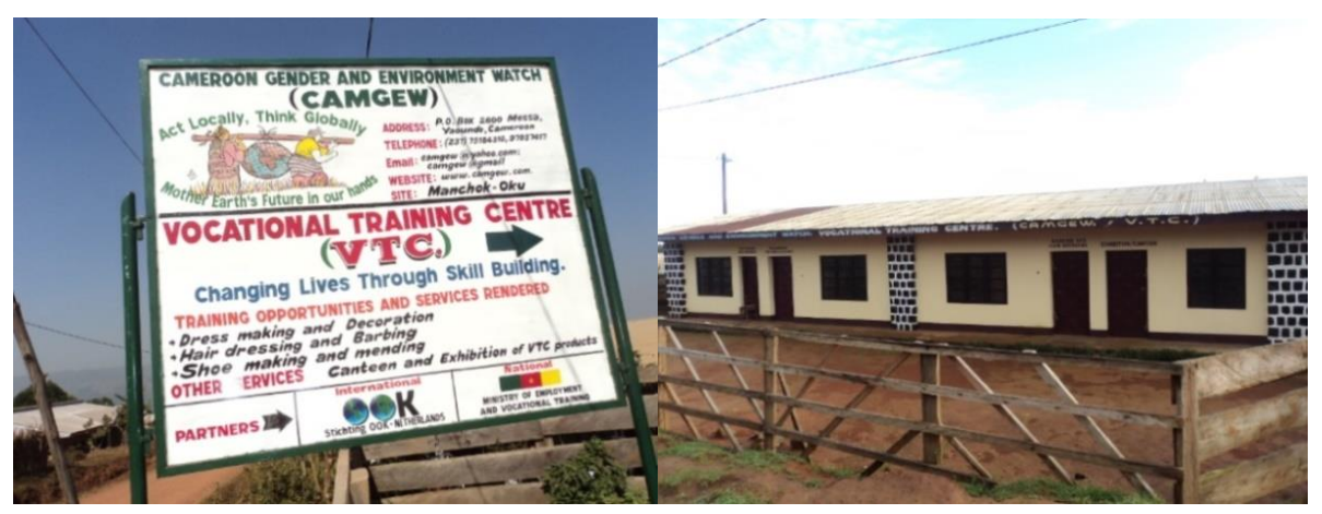
CAMGEW-Vocational Training Centre (VTC)