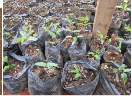
Newtonia camerunensis is native tree species of Kilum-Ijim forest that is listed in the IUCN Red list as Endangered.