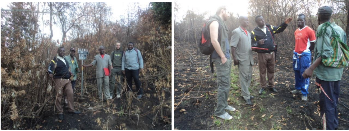
CAMGEW team in the Bikov Community Forest to evaluate and access the destruction caused by the bush fires in 2016

CAMGEW lost over 10000 trees she had planted to 2 bush fires that occurred in March 2016. These fires were caused by farmers involved in slash-and-burn activities in their farms. The farmer involved in the bushfire was known in Bikov and the community has been engaged in handling the crisis. In Akeh and Ajung community forest the person who set the fire was not known. The 4500 and 2000 out of the 6000 trees planted in Bikov and Ajung Community Forests' respectively were burnt by fires caused by farmers.