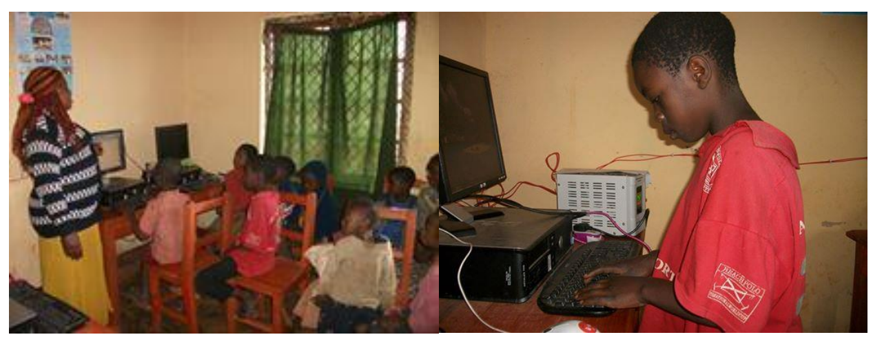
Children receiving lessons on computer in CAMGEW office

CAMGEW in the course of 2016 gave children living around her office in Manchok-Oku the opportunity to get practical lessons on computer and other ICTs. This was done after school during week days and on weekends like Saturdays when some staff were less busy or free. Many children come to play around our office premises. About 30 children benefited from this opportunity.