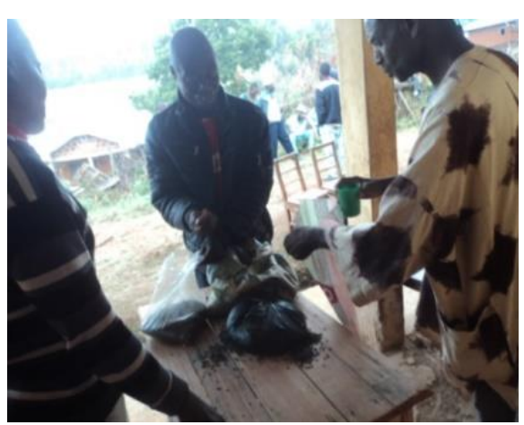
Distribution of seeds in Muloin-Njinikom and Vekovi-Bihkov community