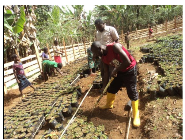
Community youths learning-by-doing in CAMGEW nurseries