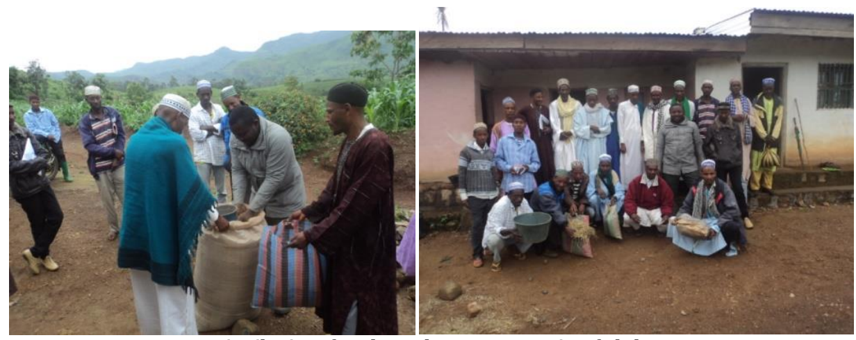
Distribution of seeds to Mbororo community of Akeh