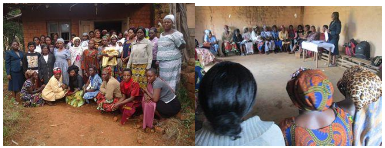
Kumbo Peasant Women Micro-Credit Scheme Training