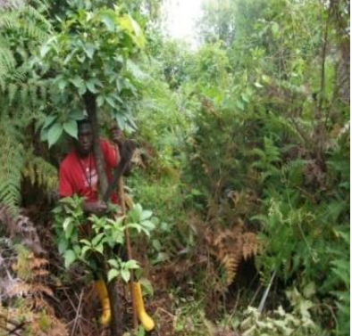
Community youths cutting, transporting and propagating Schefflera abyssinica in Nchiiy forest