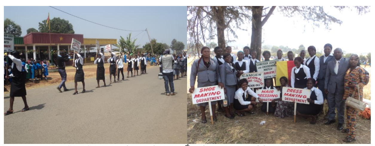
CAMGEW Match pass during 11th February 2016 celebration in Oku

CAMGEW joined the youths to celebrate the Cameroon National Youth Day on 11<sup>th</sup> February 2016 and to celebrate the national day on 20<sup>th</sup> May 2016. CAMGEW through CAMGEW- Vocational Training Centre, Peasant women of the CAMGEW - Micro-credit Scheme, her staff and other CAMGEW beneficiaries join other institutions in a match pass in front of the authorities and population in Oku to celebrate these days. The match pass was done along with demonstrations of produced items in the following departments: dress making and decoration, hair dressing, shoe making, beehives from apiculture department and nursed trees from Forest departments.