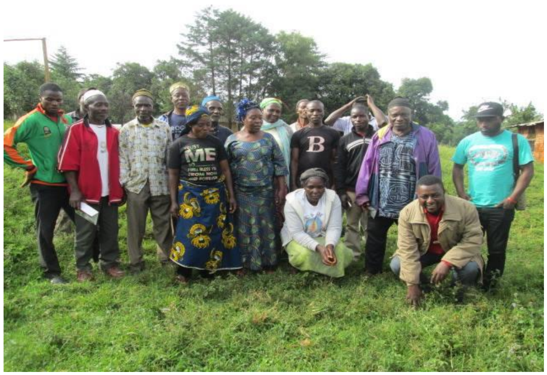
Participants in the Revision of Akeh Community Forest Simple Management Plan