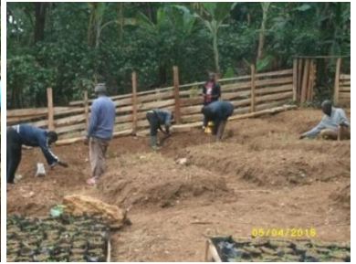
Community youths participate in the development of bareroot nursery in the Mbockenghas tree nursery and the Ikal tree nursery.