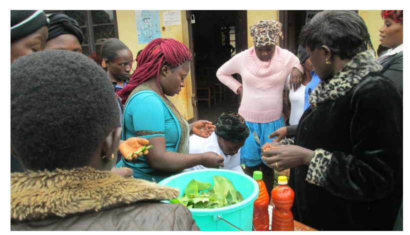
Participants learned how to prepare EKWANG during the third workshop on nutrition

The workshops on nutrition was one of the most exciting and educative activity with participants mostly teenagers and their children ending the day with a common meal. Teenagers went home with copies of various recipes on common food stuff. Women and girls in our community wished these workshops will become a regular activity in the community. CAMGEW is searching for funds to continue with this activity.