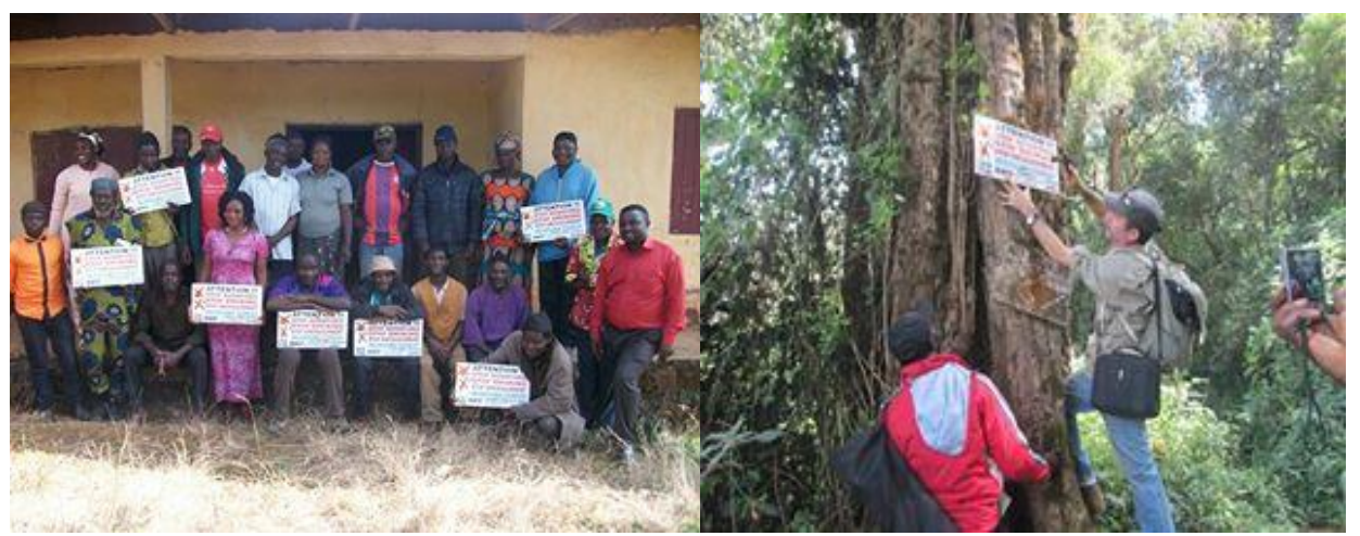
Handing of forest signpost to forest communities and nailing them on forest peripheries to tackle bushfire

CAMGEW produced 25 signposts with messages to fight bushfires and posted them around the forest as dry season arrives. The sign post were put at the Kilum-Ijim forest peripheries around Oku, Jakiri, Belo, Njinikom and Fundong SubDivisions. Some of our present/future partners working on landscape project feasibility visited us when we were about visiting the forest to post some and we jointly did it. We handed those of Bikov Community Forest during their monthly plateform meeting in Tashem at Jakiri SubDivision for posting.