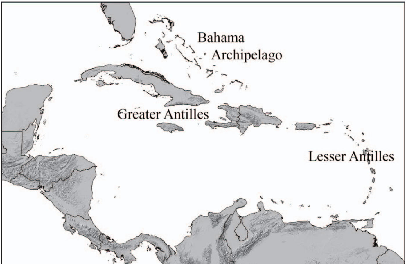
MAP 1. West Indies and Surrounding Continents.

The Catalogue of Seed Plants of the West Indies constitutes the first modern effort to account for all the names (scientific and vernacular) of seed plants known to occur in the Bahama Archipelago, the Greater Antilles, and the Lesser Antilles. We have compiled binomials treated in major floristic works and taxonomic revisions pertinent to the West Indies. Additional names were compiled from specimen records at the Smithsonian Institution (U.S. National Herbarium)