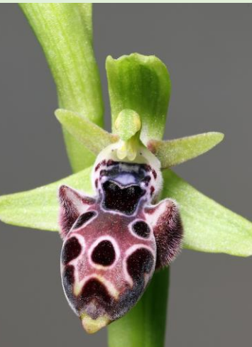
Exh 2 Class 3 Ophrys kotschyi B