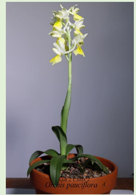
Judge's comments: All very nicely grown plants. Neotinia maculata especially nice. Lip of Ophrys tenthredinifera rather pinched