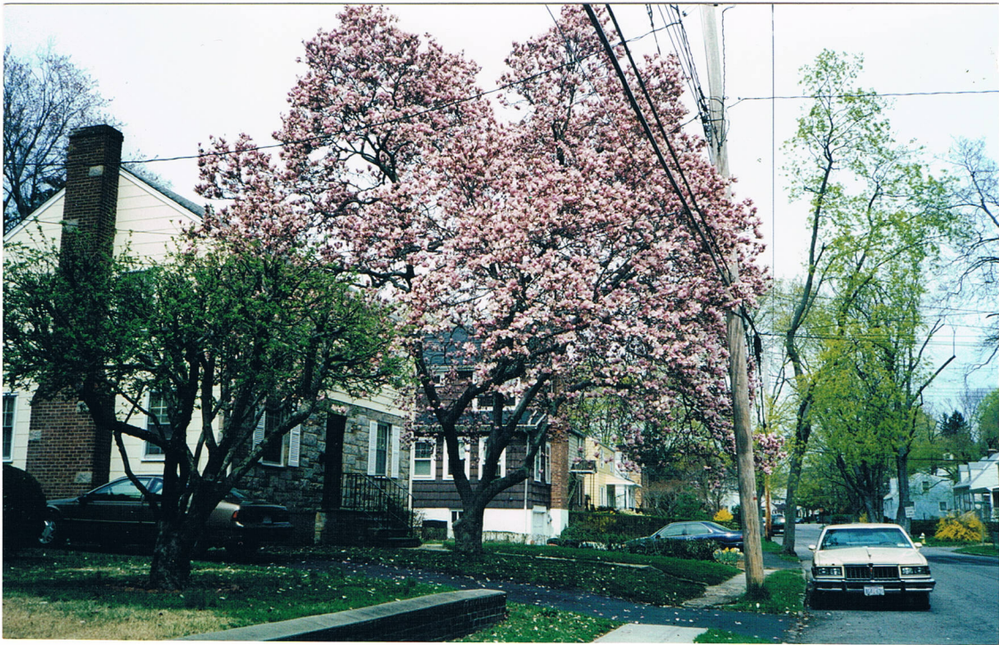
TREE Sargents Magnolia, Whitman Street