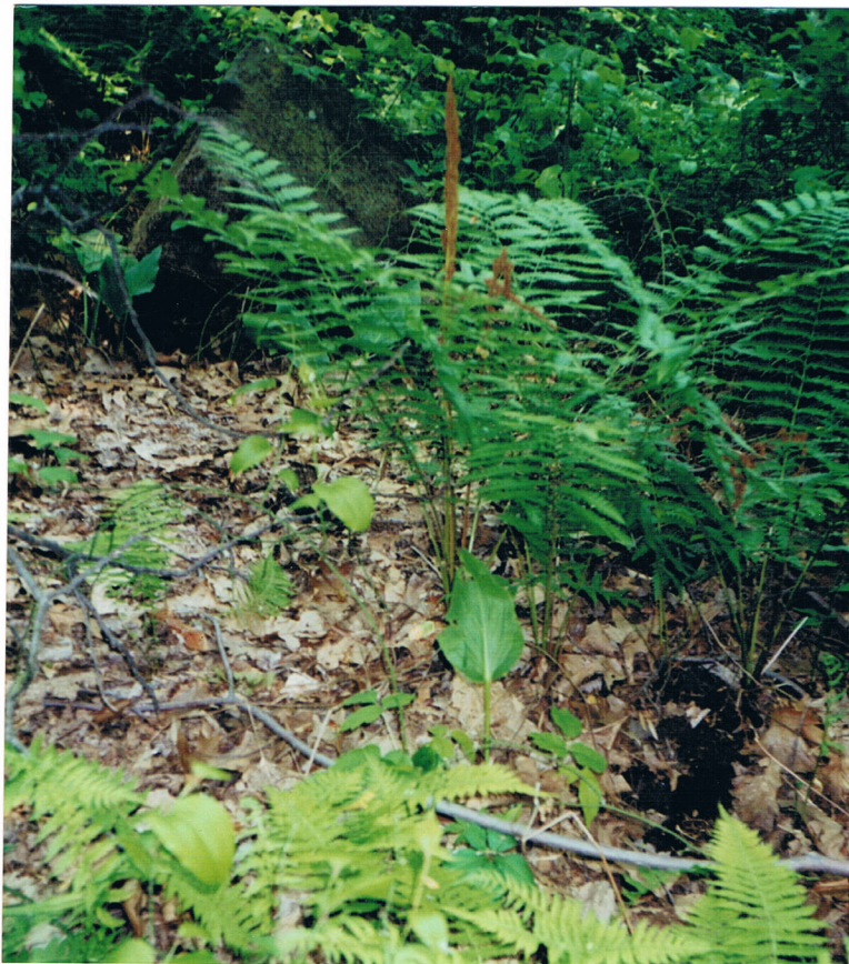
FERN Cinnamon Fern, North of Sugar Pond, Hillside Park