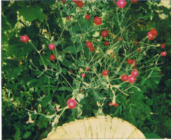
HERBACEOUS Rose Campion, Rowley's Bridge Trail