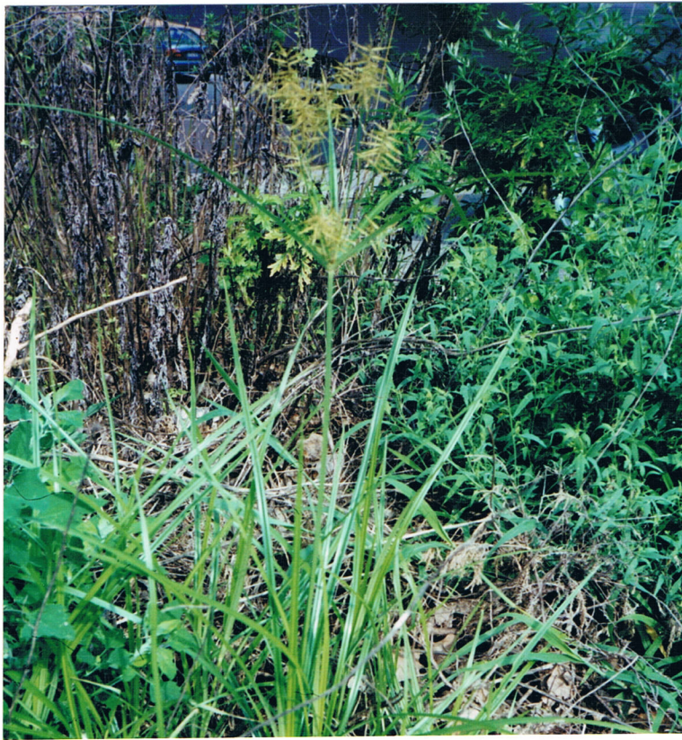
SEDGE Yellow Nutsedge, Zinsser Community Gardens