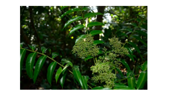
Figure 1: Zanthoxylum heitzii (By: Ehoarn Bidault, CC BY-NC-ND 4.0).

In Central Africa, a well known species is Z. heitzii (Aubrev. & Pellegr.) P.G. Waterman; syn. Fagara heitzii Aubrev. & Pellegr. [7] (Figure 1) and so is Zanthoxylum gilletii (De Wild) P.G. Waterman (syn. Fagara macrophylla (Oliv). Engl.), also found elsewhere. The bark of Z. heitzii (Figure 2) is toxic to the American cockroach ( Periplaneta americana ), stored product pests [8] and mosquitoes [9]. A review of Zanthoxylum species used for medicinal purposes in East Africa can be found in Lye et al. [10]. Other species of this genus such as Z. amratum and Z. alatum can be found in Asia and the Americas.