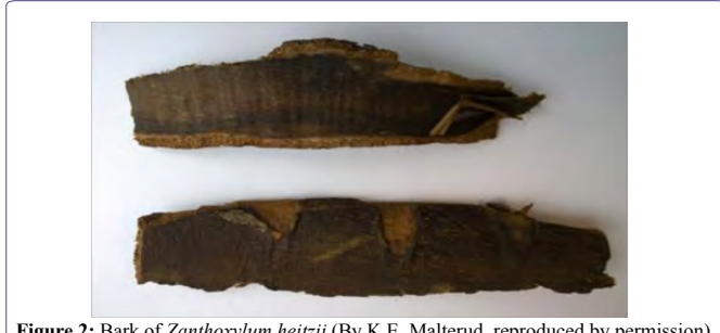
Figure 2: Bark of Zanthoxylum heitzii (By K.E. Malterud, reproduced by permission).

bark and fruit powder), crude extracts and their fractions, isolated compounds, and their synthetic analogues have been tested on insects. These plant materials have been investigated either alone or in mixtures to study potential synergism or antagonism. Extracts of different Zanthoxylum species are used in mixture with other plant materials in pesticide preparations. Most of them have been performed in China. Those prepared with extracts from Z. piperitum [14], Z. bungeanum [15-18] and Z. usambarense [19] have expressed biological activities on some insect pests and microorganisms.