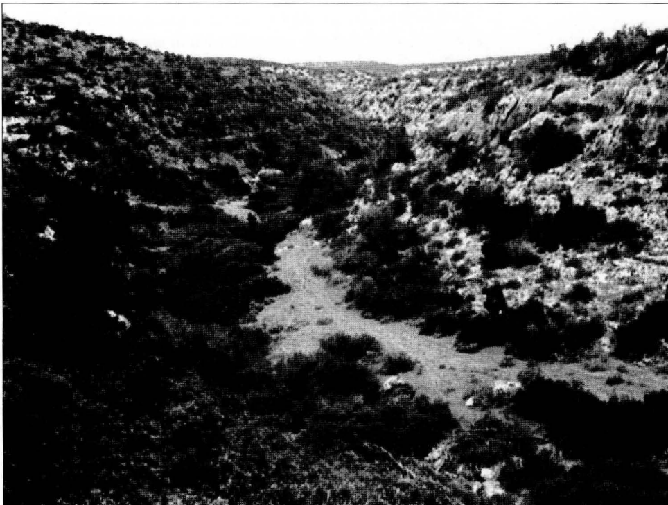
Fig. 1. The study area on the eastern coast of the gulf of Sirte.

Due to karst erosion suffered, a series of inland drainage basin were created, these with their thick deposits of Terra Rossa, from the fertile plains of Al Marj and Al Abyar.