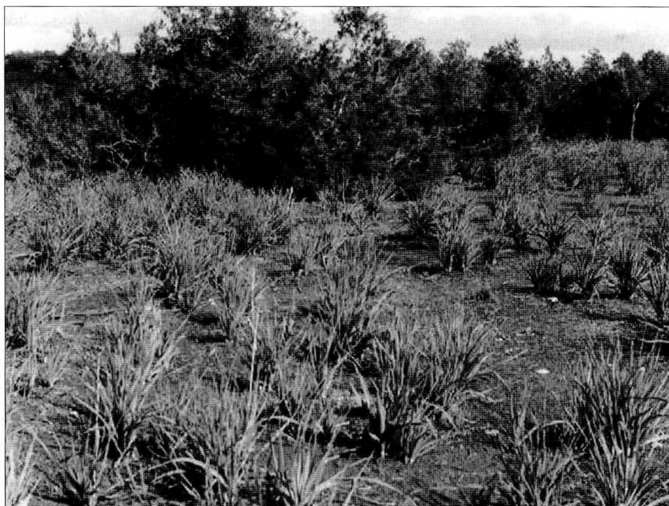
Fig. 2. Gentle slopes in Wadi (Valley) Zaza.

tion on the upper plateau. Rainfall increases with increase in elevation from the upper Al-Jabal Al-Akhdar area, decreases to wards the interior, and is rare in the desert.