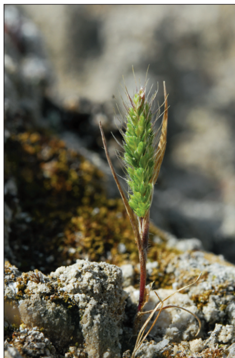
Fig. 3. Rostraria hadjikyriakou , habit, Cyprus, Ypsarouvounos, 14 April 2018.