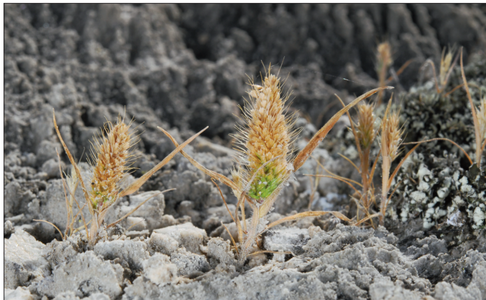
Fig. 2. Rostraria hadjikyriakou , fruiting plants in typical micro-habitat, Cyprus, Ypsarouvounos, 14 April 2018.