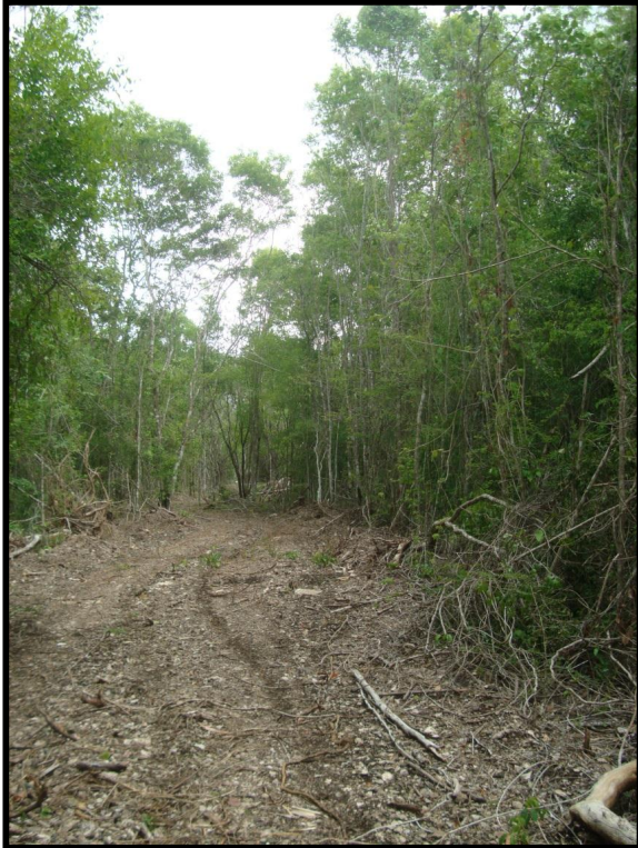
FIGURE 4. Evidence of habitat destruction in the Ctenosaura alfredschmidti study site, Campeche, México.

Nevertheless, these forests still cover a large area, and although the iguanas appear to be represented in low numbers, they have been captured within the Biosphere