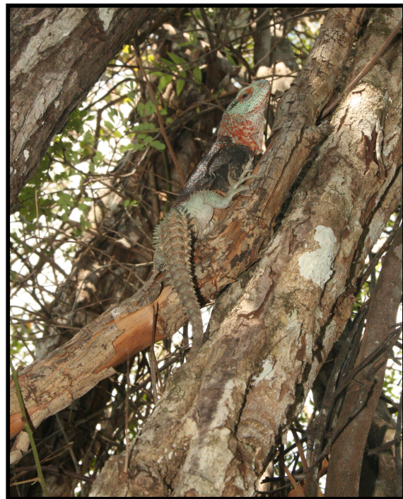
FIGURE 3. Male Ctenosaura alfredschmidti basking in Haematoxylum campechianum tree within sub-deciduous low forest in Campeche, México.

The lowland deciduous forests of Campeche, México that is preferred by C. alfredschmidti , are currently undergoing modification to support an increasing human population. Campeche has the second highest level of deforestation in México, with 10.5% of deciduous and