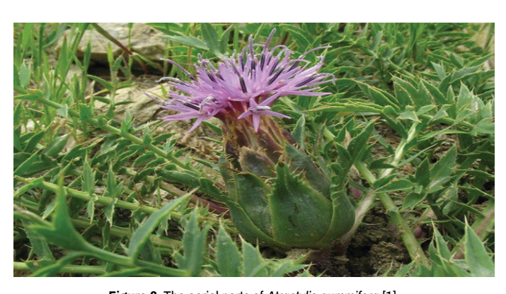
Figure 2. The aerial parts of Atractylis gummifera [1].

decreasing concentrations from the root to the leaves, with the aerial parts being the least toxic.