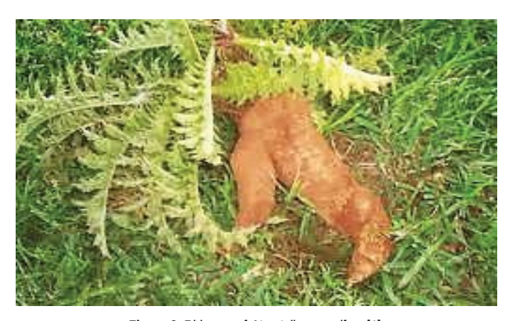
Figure 3. Rhizome of Atractylis gummifera [1].

In Morocco, Glue Thistle is widely used in traditional medicine and is easily found in herbalists in the form of dried fragments of rhizome and root.