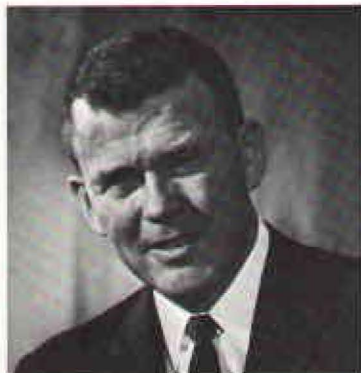
HP President Bill Hewlett

President Johnson last month announced the appointment of Bill Hewlett to the nation's Science Advisory Committee. The HP president was one of five men added to the prestigious group.