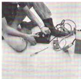
Phones had to be hooked up, numbered, and in good working order by Monday morning, and telephone men worked swiftly to complete the job.