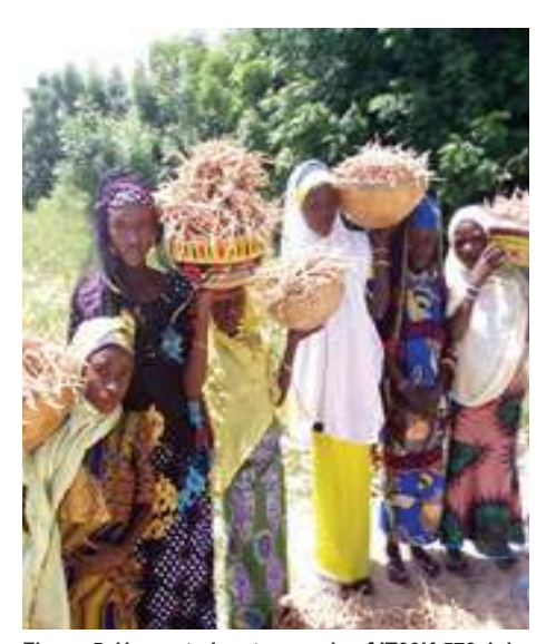
Figure 5. Harvested mature pods of IT99K 573-1-1.

Cowpea must be harvested as soon as the pods are fully mature and dry to avoid an infestation in the field because most of the storage pests are from-field-to-store pests. Harvesting is done by handpicking the pods (Fig. 5). For early maturing and erect varieties, one picking may be sufficient. For indeterminate and prostrate varieties, the dried pods can be picked two or three times as they do not mature at the same time because of the staggered flowering period. After harvest, sun-dry the pods on a platform or tarpaulin for proper drying before threshing (Fig. 6). Thereafter, thresh the pods and winnow to separate the seeds from the chaff or haulms. The seeds are further cleaned to remove debris and those that are broken and packed in plastic bags for storage.