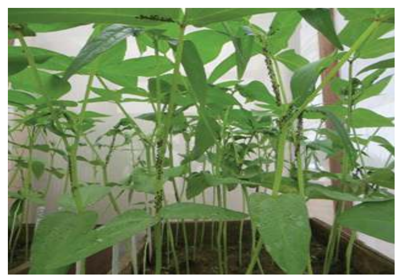
Cowpea plant infested by aphids.

The most damaging pre-flowering insect pests of cowpea are aphids ( Aphis craccivora ), and whiteflies ( Bemisia tabaci ).