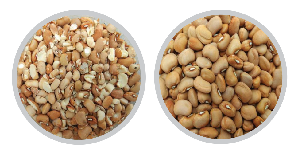
Figure 7. Cowpea seeds (a) not properly cleaned and (b) properly cleaned.

Clean out the store thoroughly before a new crop is loaded. Old residues should be burned. Only well-dried and properly cleaned seeds should be stored (Figs 7a and 7b). The safe moisture content for storage is 7–8%; such seeds make a cracking sound when crushed between the teeth. High moisture content and high humidity during storage decrease seed viability. There are various hermetic products for storage; the main one is PICS bags (multi-layer, made of 2 polyethylene bags), but plastic bottles and clay pots are also used.