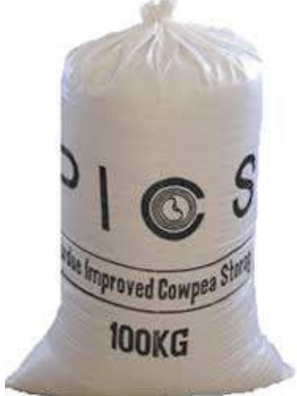
Figure 9. Cowpea storage in triple PICS bag.