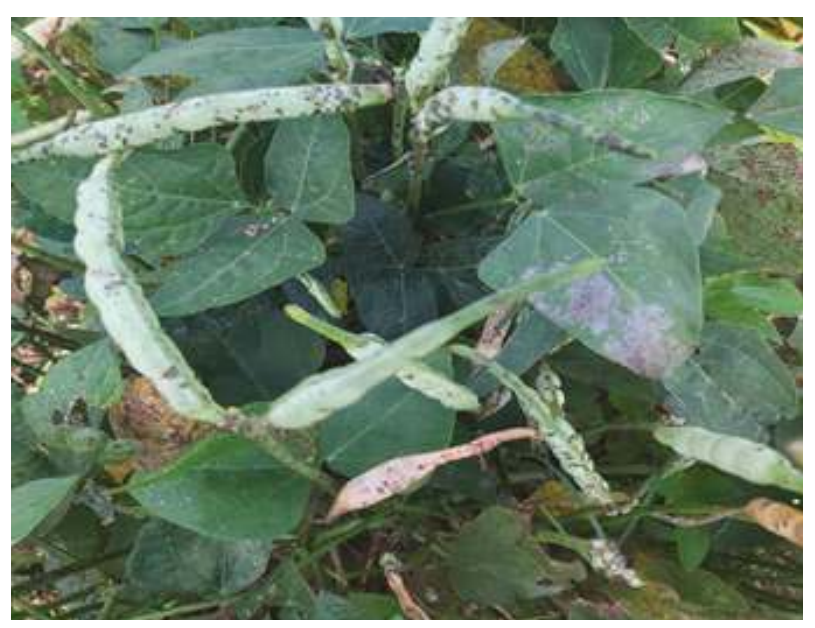
Cowpea pod infected with Scab.

Cowpea scab disease is caused by the fungi pathogen known as Sphaceloma sp. The disease is widespread in tropical Africa and is seed-borne and a major disease in savanna areas. The disease affects all plant parts above the soil, causing up to 100% yield loss. Symptoms of leaf infection include the appearance of spots on both leaf surfaces and cupped, small greyish lesions along the vein. Infected stems show oval to elongated silver-grey lesions, egg-shaped white spots surrounded by red or brown rings on the stem, and pit-like spots with grey powder surrounded by brown borders on pods. When the infection is high, leaves, stems, and pods alike are heavily spotted, plants remain small, and leaves, flowers, and pods drop before maturing. Chemical control may be effective by treating seeds with Mancozeb at the rate of 80 g/kg of seeds. However, the most effective means to control economic losses from scab is using cowpea varieties with genetic resistance/tolerance to the disease.