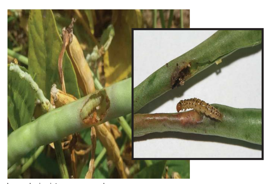
Larvae boring into a cowpea pod.

Among the cowpea pod borers, Maruca vitrata is the most widespread. It is a pre- and post-flowering pest and feeds on every part of the plant. The adult is a nocturnal moth, light brown with whitish markings on its forewings, and lays eggs on the plant. The larvae that emerge damage plants in the field, particularly during the reproductive stage, through feeding on the tender parts of the stems, peduncles, flower buds, flowers, pods, and seeds. The holes bored on the buds, flowers, or pods by feeding are the damage symptom. Infested pods and flowers are webbed together. This pest can cause a significant grain yield reduction of between 20 and 80% if not controlled with insecticides. Complete crop failure may occur, especially in situations where management strategies are not applied. No good sources of resistance have been found within the cowpea genotypes. See Table 7 for a list of chemical insecticides to control this pest.