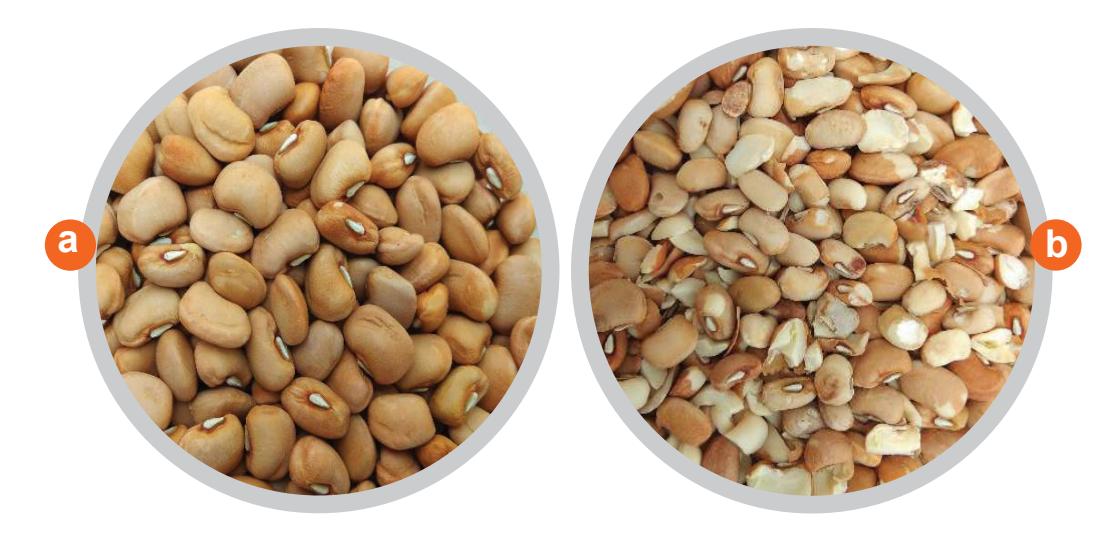
Figure 2. (a) Good seeds for planting and (b) Bad seeds for planting.