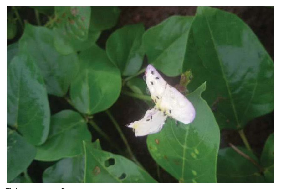
Thrips on cowpea flower.

The most damaging flowering insect pests of cowpea are thrips, (Megalurothrips sjostedti Trybom.) and Maruca. They are frequently responsible for total crop loss. The adults are tiny black slender insects with two pairs of feathery wings. Both adults and the wingless larvae (nymphs) are attracted to white, yellow, and other light-colored flowers. The pest feeds on flower buds and flowers. Attack during the pre-flowering period may damage the terminal leaf bud and bracts, causing the latter to become deformed with a brownish-yellow appearance. Severely infested plants do not produce any flowers. When the population of thrips is very high, open flowers are distorted and discolored. Flower buds and flowers fall prematurely without forming any pods. Yield losses from this insect pest have been estimated at between 20 and 100%. The current management of thrips relies on chemical control with insecticides or the use of a tolerant variety. See Table 7 for a list of chemical insecticides to control this pest.