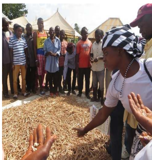
Figure 6. Sun-drying of harvested cowpea pods to reduce moisture before threshing.