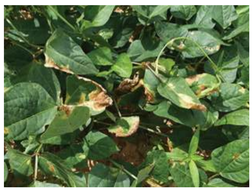
Cowpea leaves infected with Bacterial blight.

Bacterial blight of cowpea (CoBB), caused by the bacterium Xanthomonas axonopodis pv. vignicola, is an important disease of cowpea, causing severe losses in grain yield of more than 64-100% in some areas of Nigeria. The symptoms of CoBB appear as tiny, water-soaked, translucent spots, which are more clearly visible from the abaxial surface of the leaves. The spots enlarge, coalesce, and develop into big necrotic spots, usually with a yellow halo, and lead to premature leaf drop. The pathogen also invades the stem causing cracking with brown stripes. Pod infection appears as dark green water-soaked areas, from where the pathogen enters the seeds and causes discoloration and shriveling. CoBB is seed-borne, and the pathogen can be spread by wind-driven rain and insects. Different strategies are used to control the disease, including cultural practices, intercropping, and the application of chemicals. Cultivation of resistant cowpea varieties is the most promising strategy to control the disease.