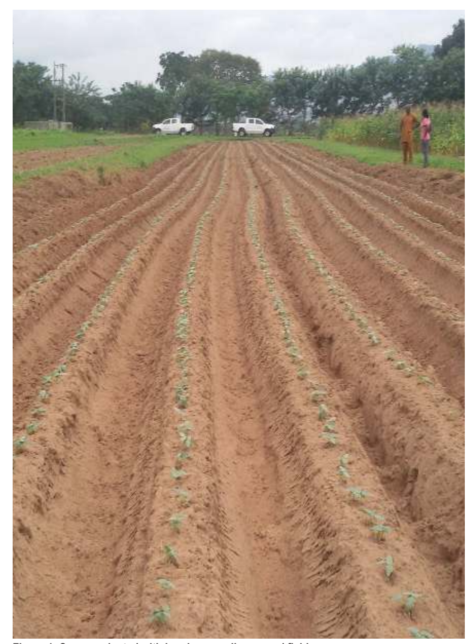
Figure 1. Cowpea planted with hand on a well-prepared field.