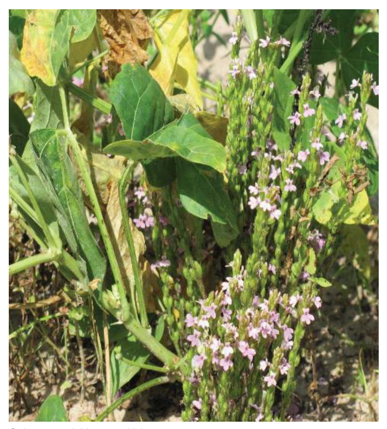
Striga gesnerioides parasitizing cowpea.

seedling. It causes stunting, wilting and yellowing between the veins of cowpea leaves, resulting in the death of infested plants. The problem becomes worse when soil moisture is limiting.