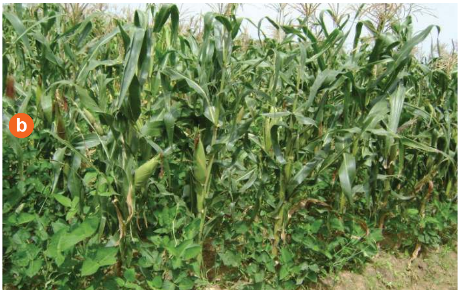
Figure 3. (a) Maize + cowpea strip intercropping. (b) Cowpea relayed into maize.