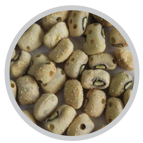
Figure 8. Poorly stored cowpea seeds (damaged by weevils).

One of the biggest challenges that confront grain farmers and merchants is how to effectively store their products. The most important storage pest of cowpea is the weevil (bruchid) called Callosobruchus maculatus. Severe infestation can lead to total grain loss in storage. It is a pest from-field-to-store; adult beetles lay eggs on pods (in the field) or on seeds (in storage). After hatching, the larvae develop within seeds and eat up the cotyledon, thereby causing extensive damage. Adults emerge from the seeds through holes made by the larvae that make it easy to recognize infested seeds (Fig. 8). Adopt store hygiene and fumigation and use airtight containers to control bruchids.