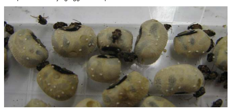
Cowpea seed damaged by weevil.