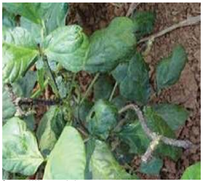
Cowpea aphid-borne mosaic virus.

Aphis craccivora feeds by piercing the plant tissue and sucking sap from the under-surface of young leaves and stem tissues, and on the pods of mature plants. The cowpea aphid causes economic losses both directly by sucking sap and indirectly through the transmission of viral diseases. It not only causes direct damage to the plant but also acts as a vector in transmitting Cowpea aphid-borne mosaic virus and Cucumber mosaic virus. Aphids excrete large quantities of a sugary substance called honeydew, which supports the growth of sooty mold. This mold, a fungus, is dark-colored and reduces the amount of sunlight that reaches the leaf. The honeydew produced on the plant is evidence of aphids feeding on the crop. Mild damp weather favors the development of aphid populations. Chemical control can be effective when appropriate chemical insecticides are used. See Table 6 for a list of chemical insecticides to control this pest.