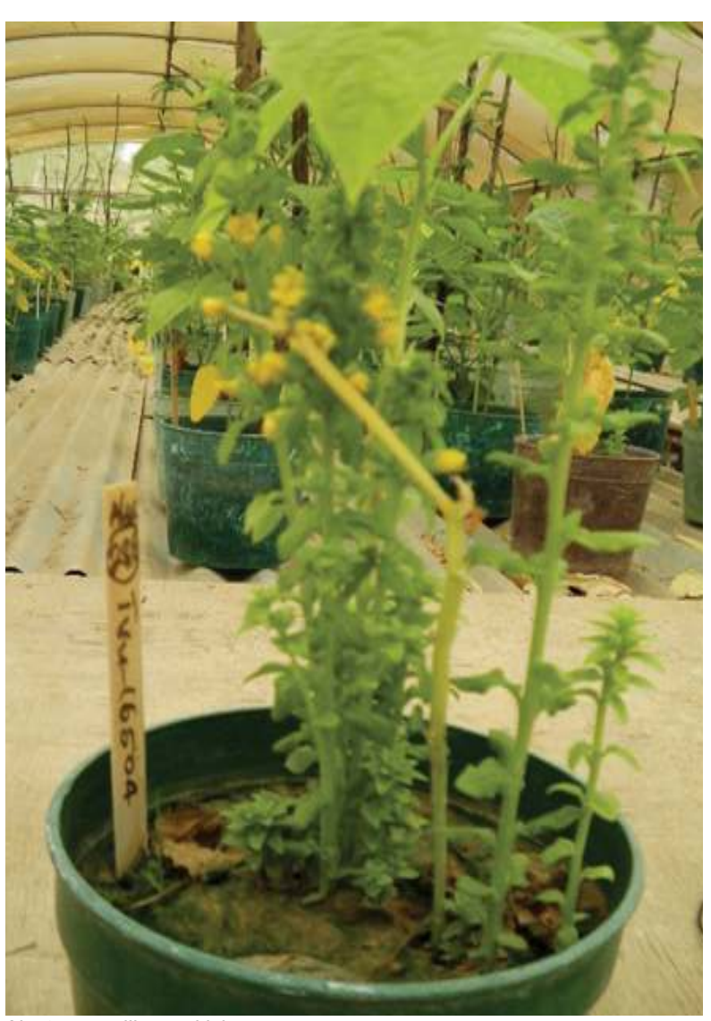
Alectra vogelii parasitizing cowpea.

variety is an effective and affordable option for the control of Striga and Alectra . Many varieties that are completely resistant to Striga and Alectra have been developed and are available in Nigeria.