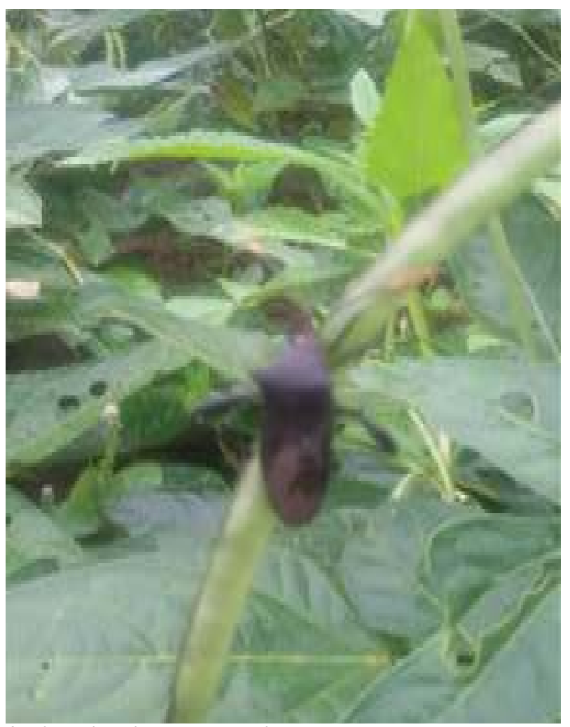
Anoplocnemis curvipes on cowpea pod.

This is a major pest of cowpea in tropical Africa. Yield losses caused by A. curvipes vary from 30 to 70%. It sucks the sap from green pods, causing them to shrivel and dry prematurely, resulting in seed loss. Plant tolerant cultivars and spray with recommended insecticides. See Table 7 for a list of chemical insecticides to control this pest.