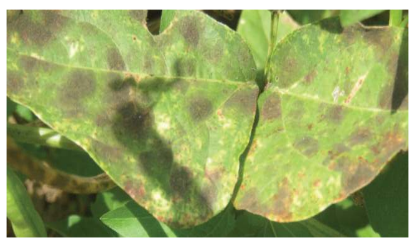
Cercospora leaf spot infected leaves.

The disease symptom on infected plants presents necrotic spots on the upper leaf surface and profuse masses of conidiophores and conidia, appearing as downy grey to black mats, on the lower leaf surface. CLS disease is seed-borne and seed transmitted. The most effective means to control economic losses from CLS is using cowpea varieties with genetic resistance to the disease.