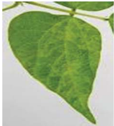
Cowpea mottle virus.