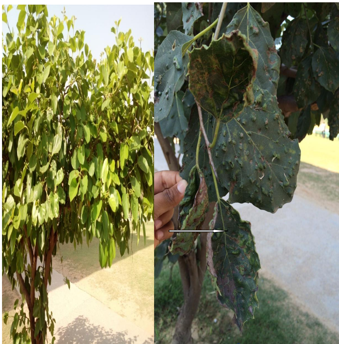
Fig.1A Healthy and Aecidium sp infected plant of Cordia dichotoma

were hyaline to whitish, rhomboidal, 16 to 24 (avg. 19.5) \times 14 to 19 (avg. 16) \mu\text{m} , smooth to finely verrucose, but not observed in aecial stage on floral axes and petioles. Aeciospores were globose to ellipsoid, 13 to 15 (avg. 14.4) \times 14 to 15.0 (avg. 14) \mu\text{m} , hyaline to yellowish, with many verrucose surface and hyaline walls (Fig 1,b,c). Aecidium sp.infection was also found to be present on old leaves (Fig 1d).