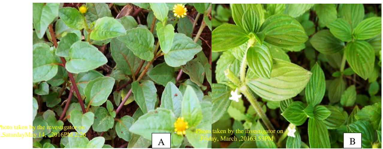
Fig. 1: The two medicinal plant materials collected

Acmella caulirhiza andSpermacoce princeae medicinal plant specimen were collected from West Mugirango and North mugirango constituencies in Nyamira County with acceptable bio-conservation methods (WHO, 2003a). Harvesting was done in a dry weather morning after the dew had evaporated (Prajapati et al. , 2010). The two specimens were carried separately in gunny bags and transported to Pharmacognosy Laboratory of Mount Kenya University within 72 hours of collection (WHO, 2003a).