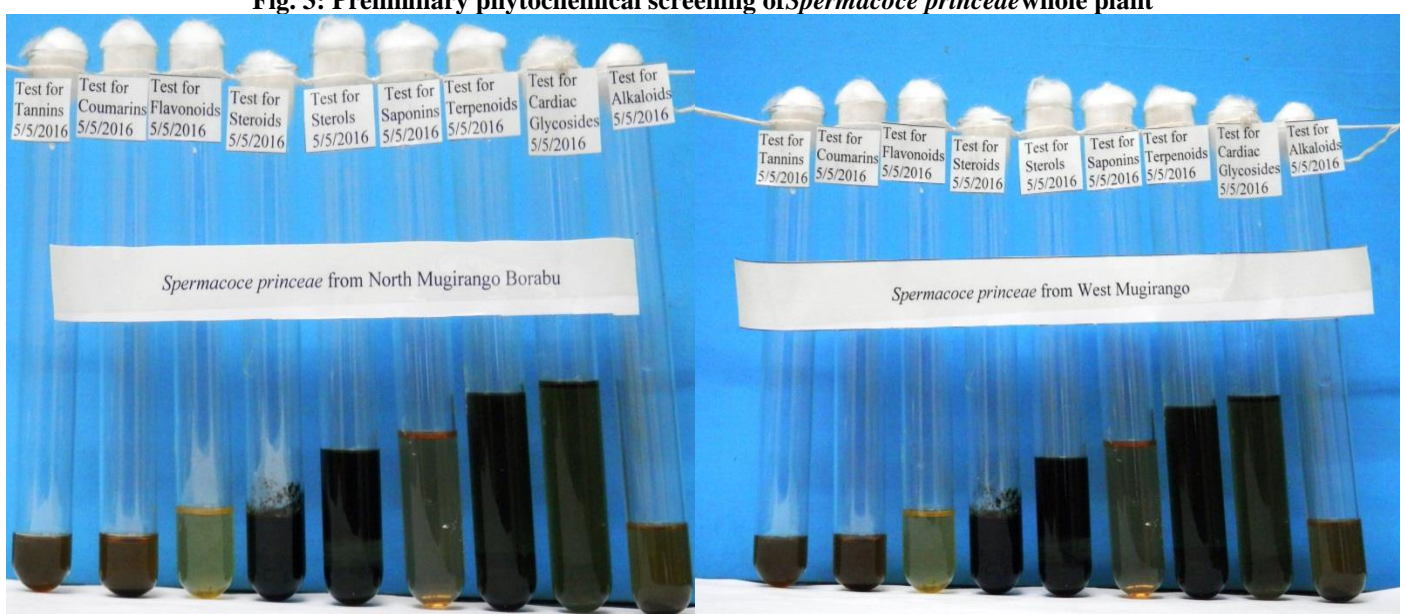
Fig. 3: Preliminary phytochemical screening of Spermacoce princeae whole plant