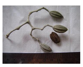
Photo N° 18.- Pseudolmedia laevis Photo N° 19.- Sparattanthelium tarapotana