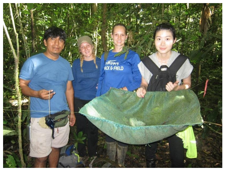
Photo N° 3.- Volunteers helping collect the fruits and seed in the traps