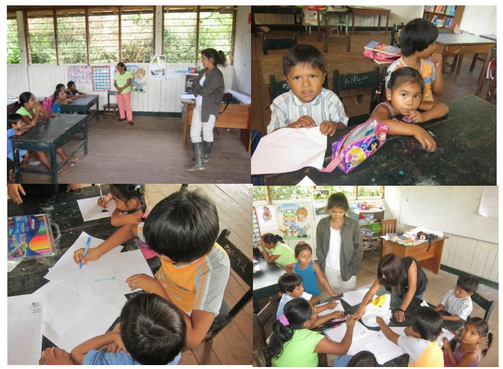
Photo N°3.- The workshop of tales and myths in lake Valencia on the 10<sup>th</sup> of June 2014

On June 10 a workshop of tales and myths, which is very important for the communities of Lake Valencia and Real palm where children of educational facilities (see photo N°3) were involved, was performed. This issue is very important because you can see the relationship of children with their parents and grandparents. It is known that the tradition of tales and myths is passed down from generation to generation. This can be seen by doing this types of workshops where children can draw and create their own stories or myths or tell those who have been told by their grandparents. It is also the way to keep the cultural traditions and beliefs of a community.